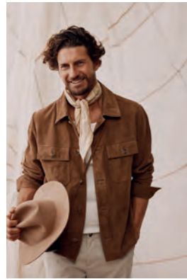
Page 7 Velours Overshirt Style: 1602 2205 Colour: 213 affogato Summer Stretch Bermuda Style: 1603 2110 Colour: 834 stone