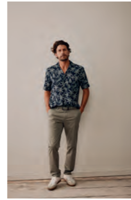
Page 46 Linen Resort Shirt, 1/2 Style: 1604 6079 Colour: 685 navy Basic Stretch Chino Style: 1613 2802 Colour: 743 khaki