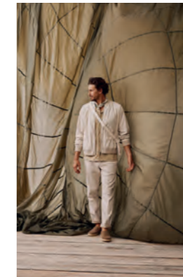
Page 26 Garmentdye Blouson Style: 1603 2740 Colour: 828 cement Polo Shirt terry jacquard Style: 1603 1212 Colour: 745 pistachio COLI Twotone Structure Chino Style: 1603 2818 Colour: 834 stone