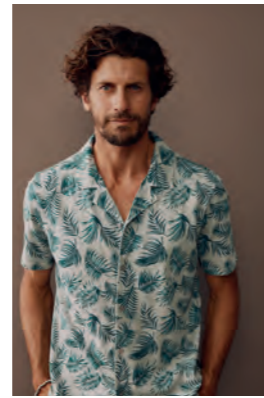
Page 41 Resortshirt, overdyed palmprint Style: 1604 1215 Colour: 719 dark khaki COLI Twotone Structure Chino Style: 1603 2818 Colour: 727 pine green