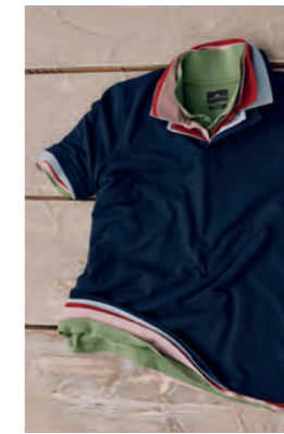
Page 23 Polo, 2ply, New Solid Pique Style: 1613 1800 Colours: 685 navy, 653 new breeze, 341 cranberry red, 464 magnolia, 740 avocado