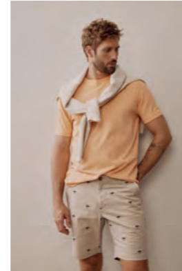
Page 42 Air Cotton Jersey Style: 1604 1205 Colour: 212 tangerine Embroidery Summer Stretch Bermuda Style: 1603 2112 Colour: 834 stone