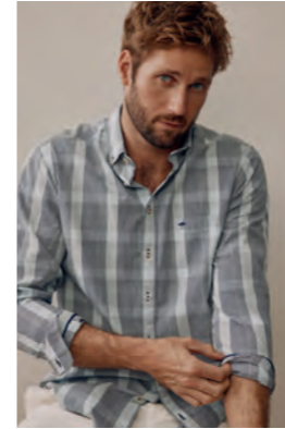
Page 18 Blue Poplin Check, B.D., 1/1 Style: 1602 9500 Colour: 685 navy