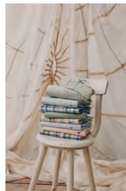
Page 15 Washed Oxford Stripe, B.D., 1/1 Style: 1613 8440 Colour: 740 avocado Washed Oxford Check, B.D., 1/1 Style: 1613 8450 Colour: 653 new breeze Washed Oxford Check, B.D., 1/1 Style: 1613 8410 Colour: 113 pale yellow, 744 mint Washed Oxford Solid, B.D., 1/1 Style: 1613 8400 Colour: 212 tangerine, 740 avocado