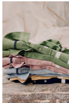
Page 36 Polo, Striped, Premium Cotton Style: 1603 1705 Colour: 740 avocado, 464 magnolia, 653 new breeze, 113 pale yellow, 685 navy Polo, 2ply, New Solid Pique Style: 1613 1800 Colours: 740 avocado, 464 magnolia, 653 new breeze