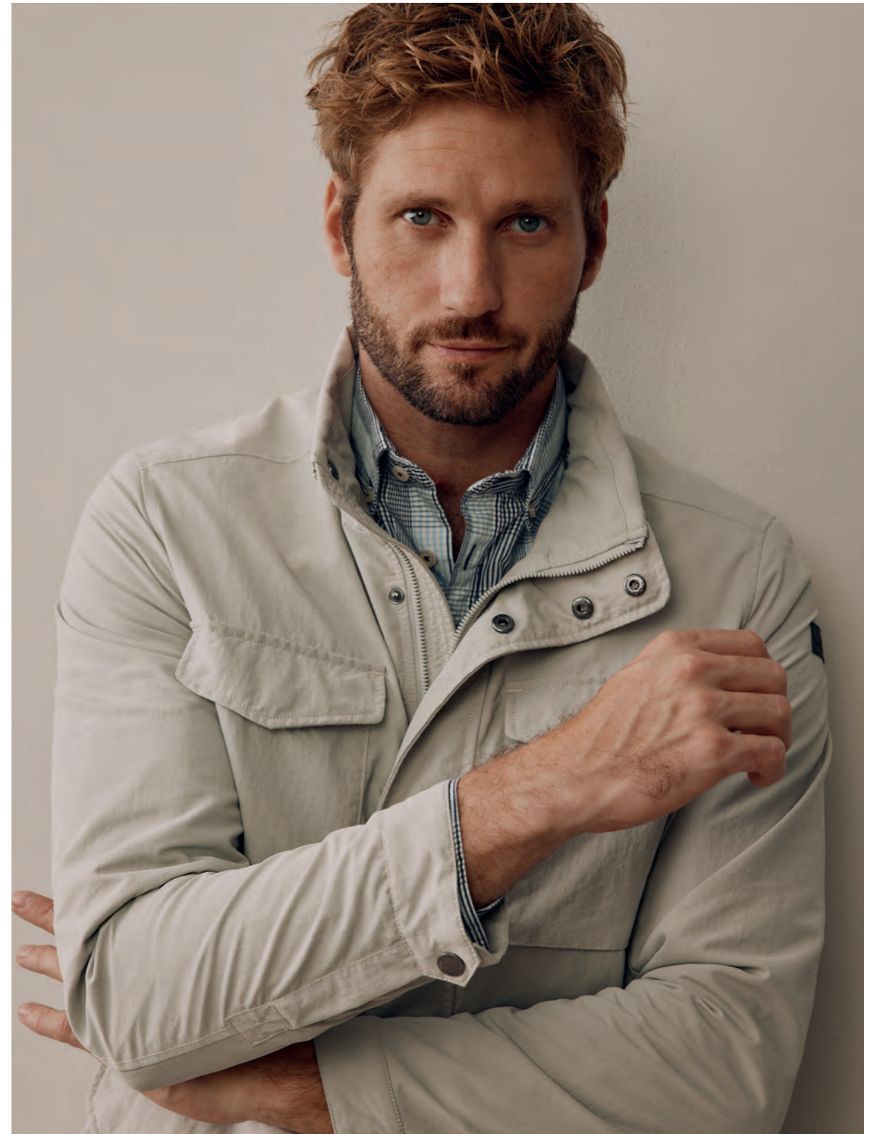
Muted Colours SUBTLE SPEAKS LOUDER