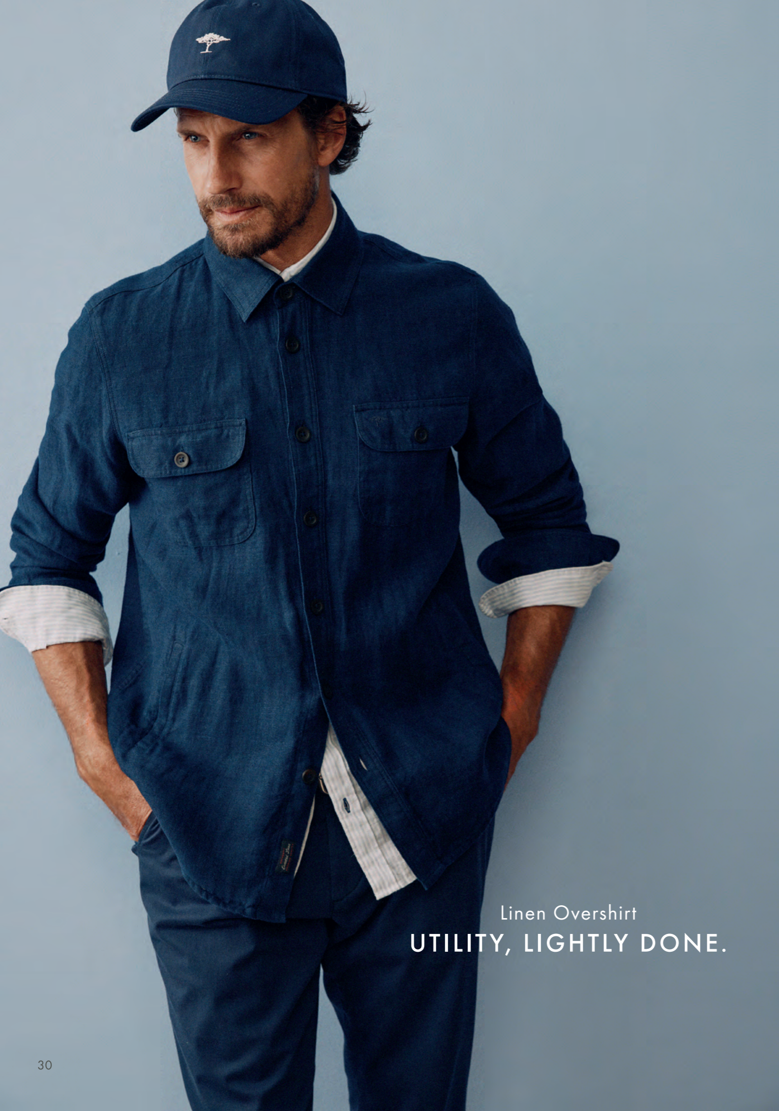
Linen Overshirt UTILITY, LIGHTLY DONE.