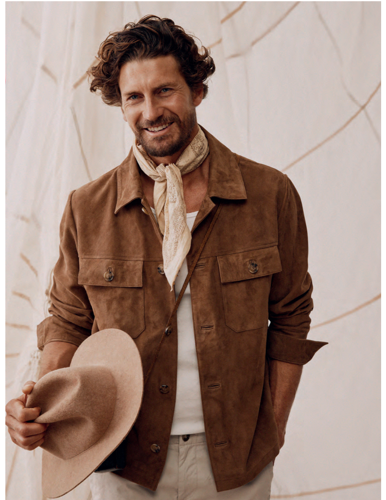
Key Piece VELOURS OVERSHIRT