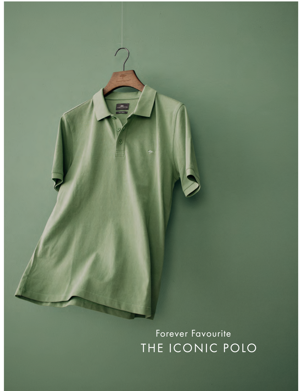
Forever Favourite THE ICONIC POLO