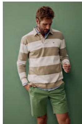
Page 8 Rugby Polo Stripe Style: 1602 1363 Colour: 824 new offwhite Summer Stretch Bermuda Style: 1603 2110 Colour: 740 avocado