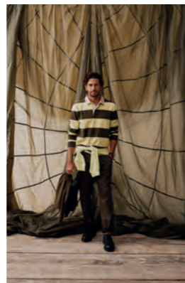
Page 10 Rugby Polo Stripe Style: 1602 1363 Colour: 719 dark khaki COLI Twotone Structure Chino Style: 1603 2818 Colour: 719 dark khaki