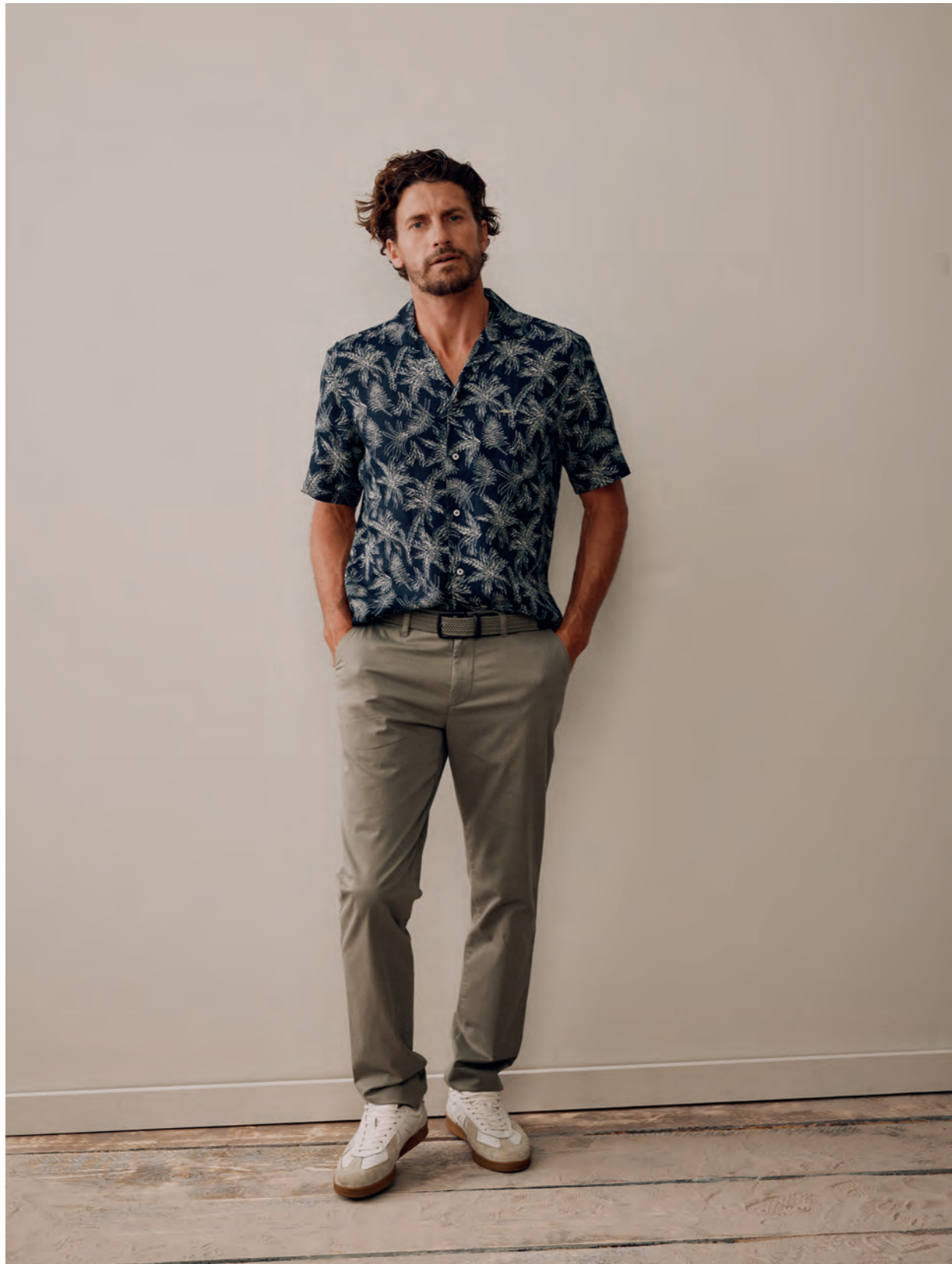
Resort Shirts OFF-DUTY VIBES