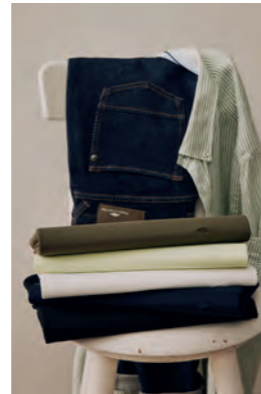
Page 13 Classic Linen Stripe, B.D., 1/2 Style: 1604 6021 Colour: 740 avocado Stay Blue Denim Style: 1602 2920 Colour: 688 dark navy Sanforized T-shirt Style: 1613 1900 Colours: 719 dark khaki, 739, pear, 824 new offwhite, 685 navy, 999 black