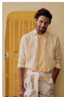
Page 38 Premium Linen, B.D., 1/1 Style: 1613 6000 Colour: 113 pale yellow O-Neck, T-Shirt, Cotton Linen Style: 1603 701 Colour: 113 pale yellow Basic Stretch Chino Style: 1613 2802 Colour: 837 sand