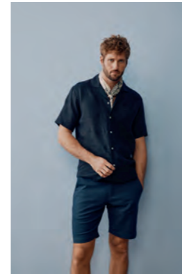
Page 49 Premium Linen Resort Shirt Style: 1604 6009 Colour: 685 navy COLI Twotone Structure Bermuda Style: 1603 2819 Colour: 688 dark navy