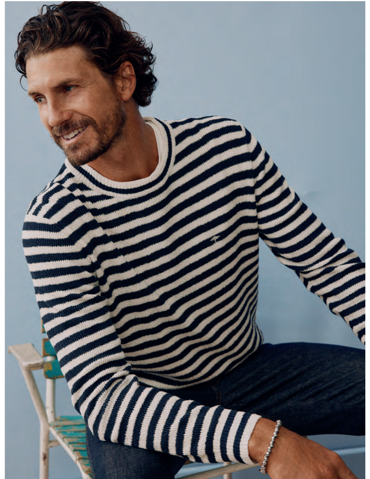
Key Piece BOUCLÉ O-NECK