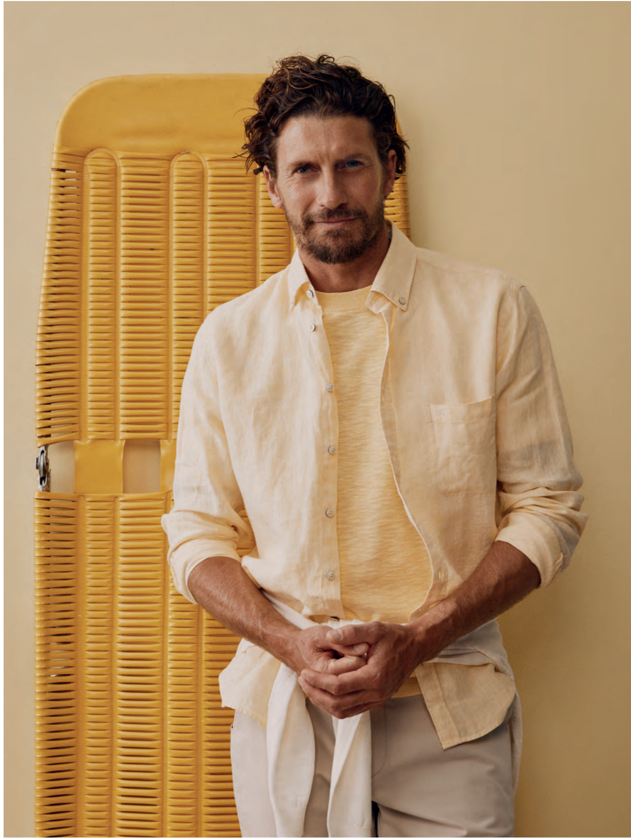
Light Linen COVERED IN SUNSHINE