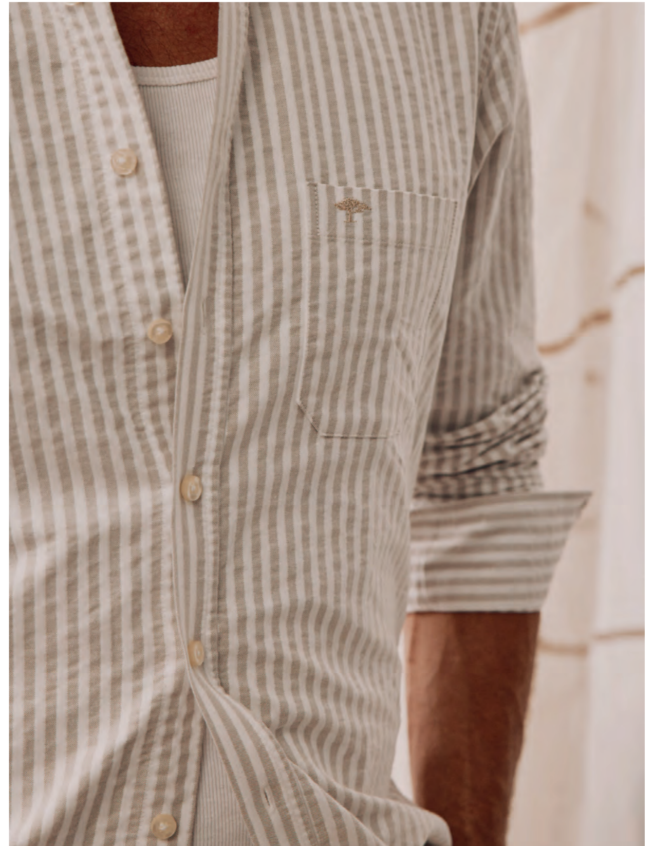
Everyday Essentials THE WASHED OXFORD