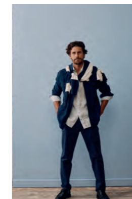
Page 31 Polo longleeve, striped, Cotton Linen Style: 1603 706 Colour: 690 navy Herringbone Linen Overshirt Style: 1603 8504 Colour: 685 navy Washed Oxford Fine Stripe, B.D., 1/1 Style: 1613 8320 Colour: 653 new breeze Basic Stretch Chino Style: 1613 2802 Colour: 688 dark navy