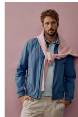
Page 21 Polo, Superflex, Shortsleeve Style: 1602 229 Colour: 653 new breeze Harrington Blouson Style: 1602 2602 Colour: 655 horizon O-Neck Structure Style: 1603 608 Colour: 464 magnolia