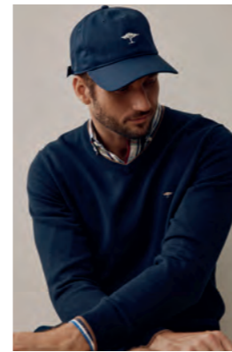
Page 17 V-Neck Tipping, Superfine Style: 1602 225 Colour: 690 navy Colorful Poplin Check, B.D., 1/1 Style: 1602 9510 Colour: 341 cranberry red