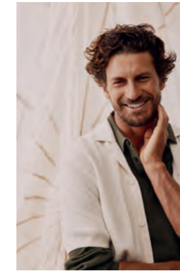
Page 25 Polo Shirt, Bouclé Style: 1603 610 Colour: 824 new offwhite Polo, Longleeve, Structure Style: 1602 333 Colour: 719 dark khaki