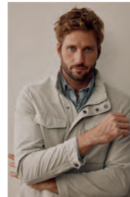
Page 19 Fieldjacket Style: 1602 2610 Colour: 828 cement