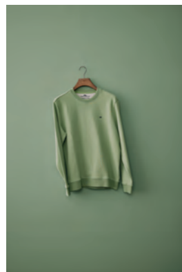
Page 8 Sweat O-Neck Style: 1602 1350 Colour: 740 avocado