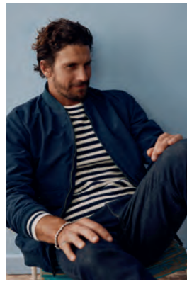
Page 33 Garmentdye Blouson Style: 1603 2740 Colour: 688 dark navy O-Neck, striped, bouclé Style: 1603 611 Colour: 824 new offwhite Stay Blue Denim Style: 1602 2920 Colour: 688 dark navy