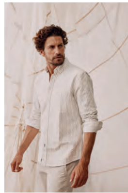
Page 4 Oxford Stripe, B.D., 1/1 Style: 1613 8440 Colour: 719 dark khaki Summer Stretch Bermuda Style: 1603 2110 Colour: 834 stone