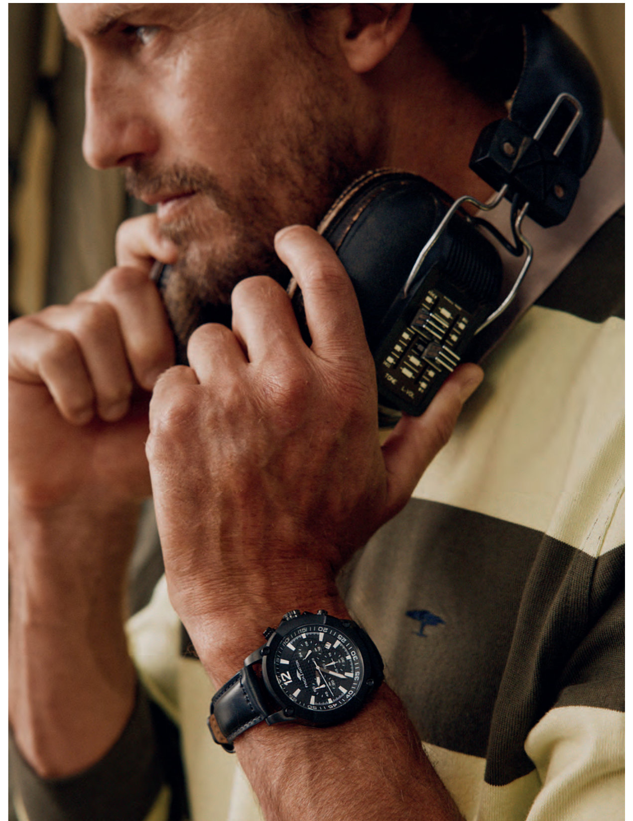
Core Colours GREEN HARMONY