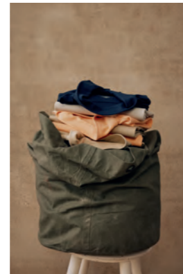
Page 43 Air Cotton Jersey, polo Style: 1604 1206 Colour: 685 navy, 212 tangerine, 745 pistachio Air Cotton Jersey Style: 1604 1205 Colour: 828 cement, 745 pistachio, 212 tangerine