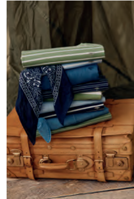
Page 34 T-Shirt Basic Striped Style: 1603 1512 Colours: 740 avocado, 653 new breeze, 685 navy Denim Shirt, B.D., 1/1 Style: 1602 8030 Colour: 604 crystal blue, 638 misty blue T-Shirt, irregular stripe Style: 1603 1513 Colour: 685 navy, 653 new breeze, 740 avocado Polo, Striped, Premium Cotton Style: 1603 1705 Colour: 740 avocado