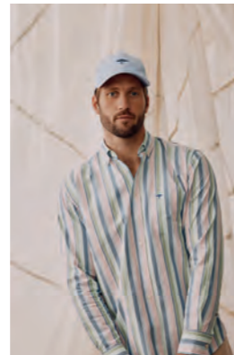
Page 14 Washed Oxford Stripes, B.D., 1/1 Style: 1613 8420 Colour: 744 mint