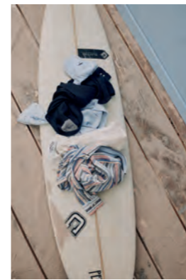
Page 49 Premium Linen, B.D., 1/1 Style: 1613 6000 Colour: 685 navy, 653 new breeze, 802 white Colorful Linen Stripes, B.D., 1/2 Style: 1604 6041 Colour: 212 tangerine