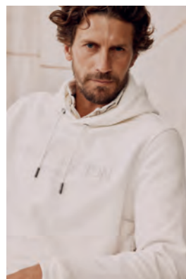
Page 8 Sweat, Logo Hoodie Style: 1613 1355 Colour: 824 new offwhite