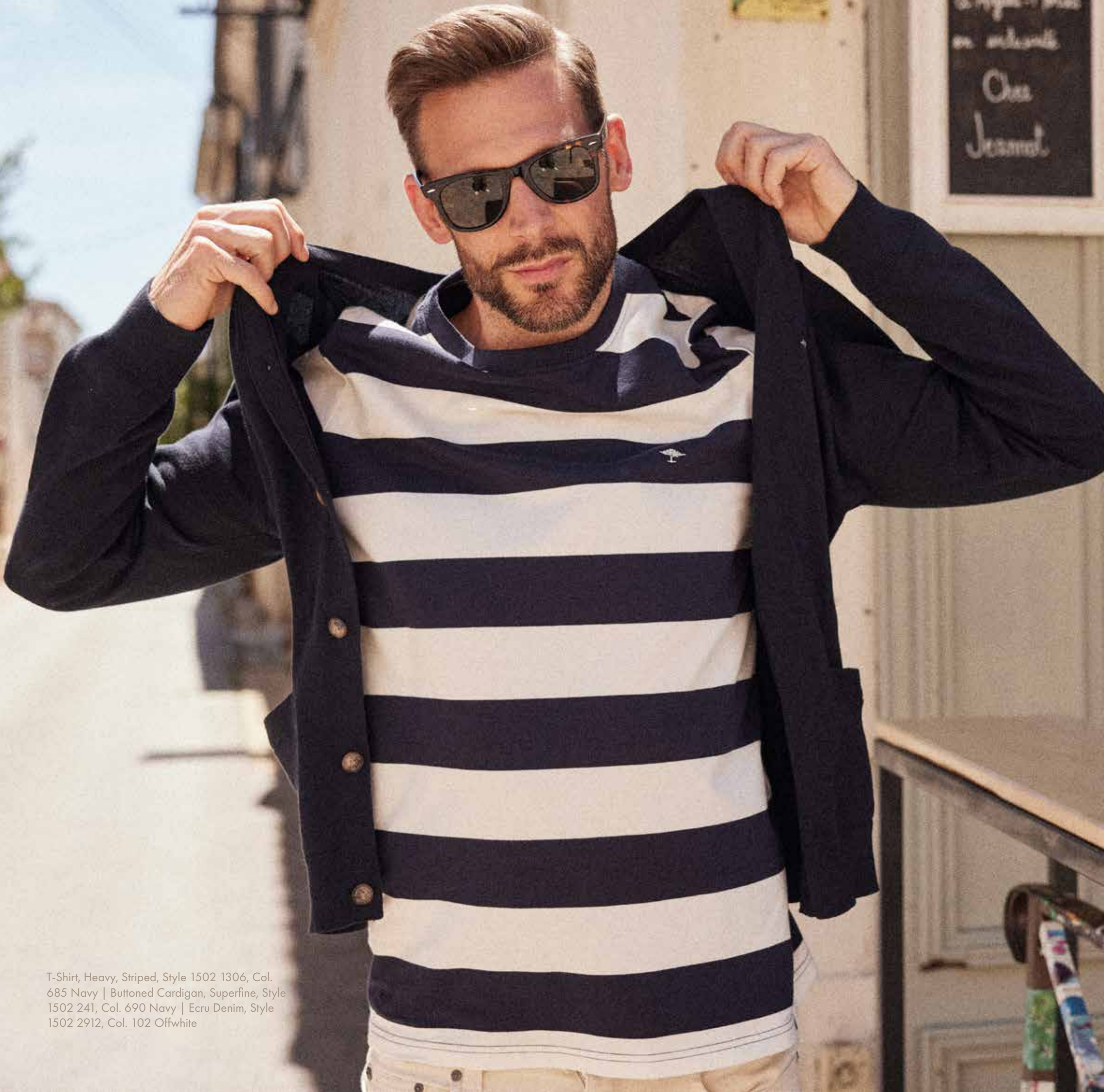
T-Shirt, Heavy, Striped, Style 1502 1306, Col. 685 Navy | Buttoned Cardigan, Superfine, Style 1502 241, Col. 690 Navy | Ecrú Denim, Style 1502 2912, Col. 102 Offwhite