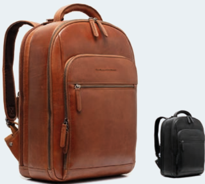
Maggiore Backpack C580341-xxx | 30 x 13 x 40 cm | 15.6 l ● ● Black, Cognac