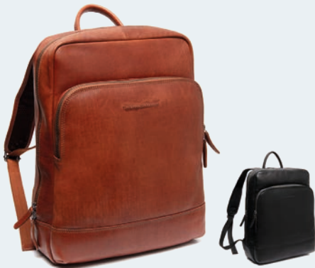
Nicola Backpack C580705-xxx | 30 x 10 x 40 cm | 12 l ● ● Black, Cognac