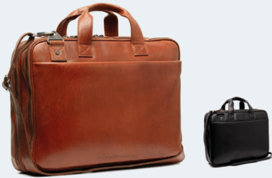
Iseo Laptop Bag 15” C401100-xxx | 40 x 11 x 30 cm | 13.2 l ● ● Black, Cognac