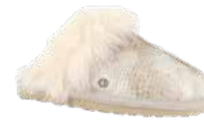
Croco Sand/Off White