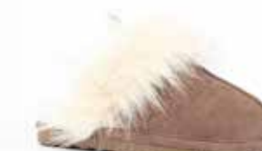
Light Brown/Off White