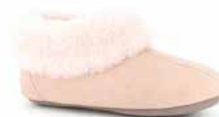
Nude Pink/Nude Pink