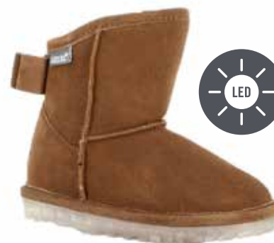
3324 LW: Chestnut