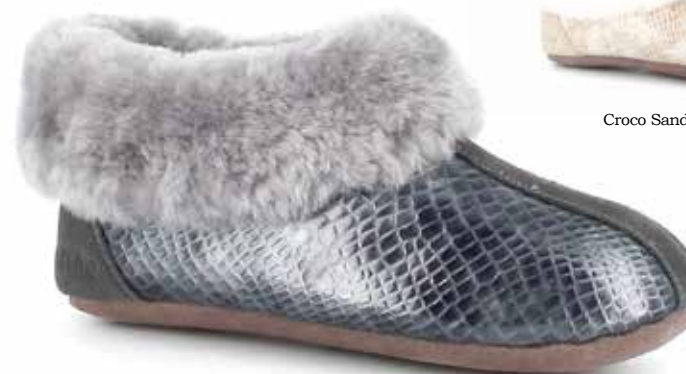
Croco Asphalt/Light Grey