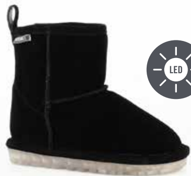
3300 LW: Black