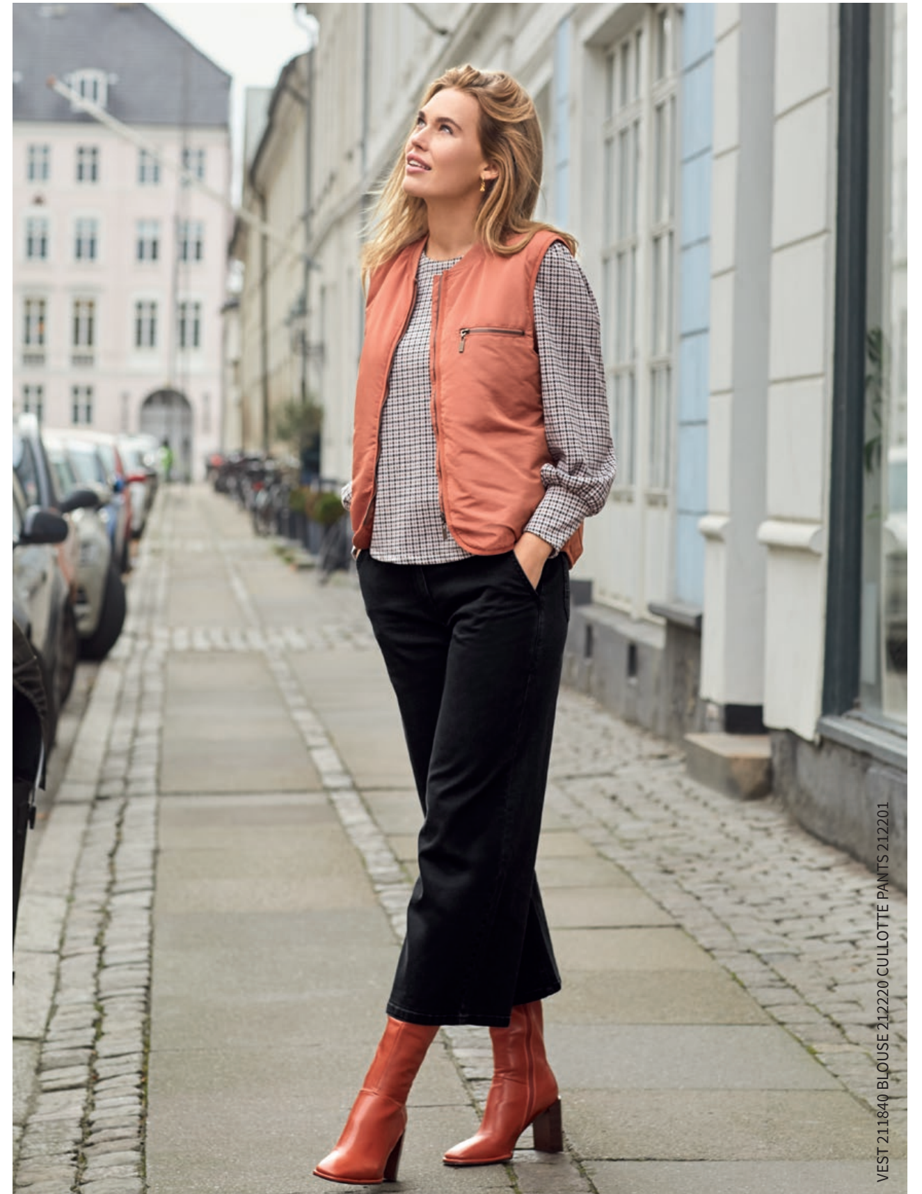
VEST 211840 BLOUSE 212220 CULLOTTE PANTS 212201