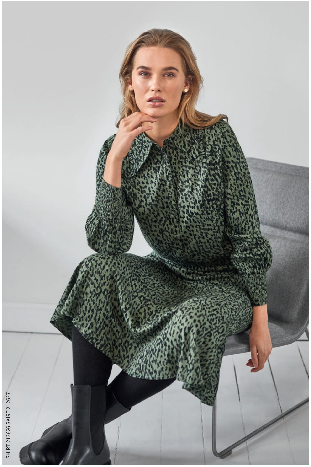
SHIRT 212626 SKIRT 212627