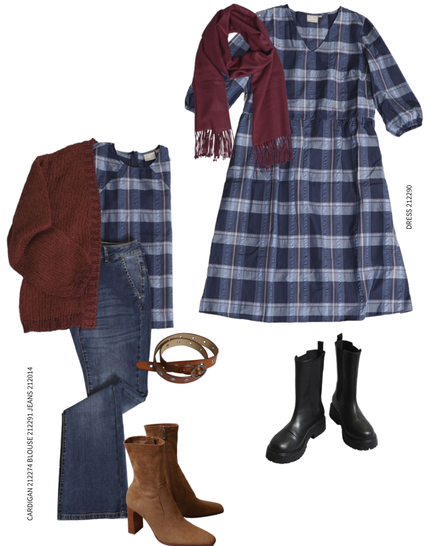
CARDIGAN 212274 BLOUSE 212291 JEANS 212014