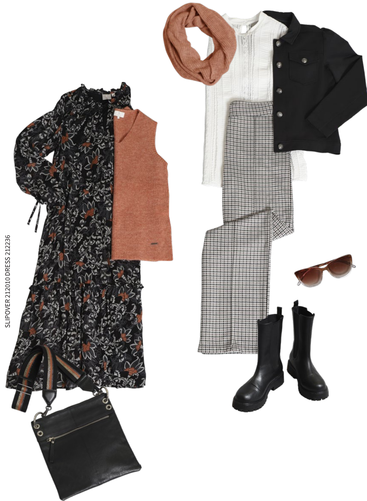
JACKET 212213 BLOUSE 212085 TROUSERS 212218