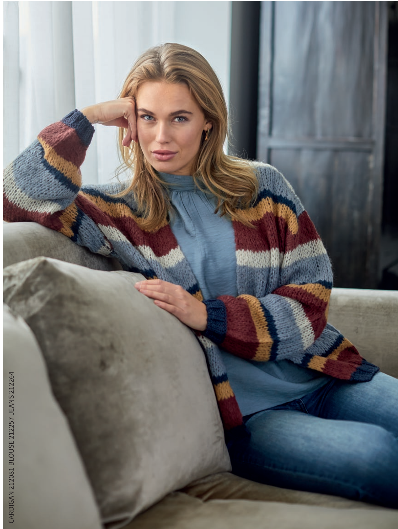
CARDIGAN 212081 BLOUSE 212257 JEANS 212264

B.Copenhagen is built around stylish contrasts, combining ultra-feminine items with denim elements and chunky knitwear.