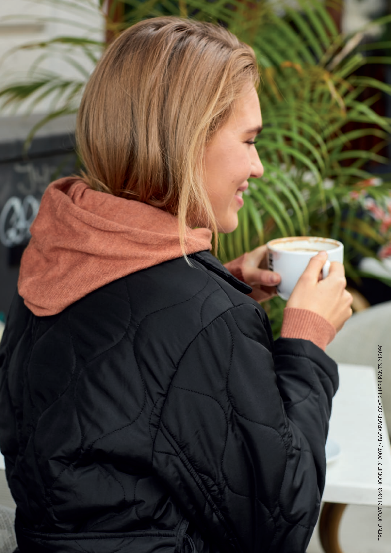
TRENCHCOAT 211848 HOODIE 212007 // BACKPAGE: COAT 211834 PANTS 212096