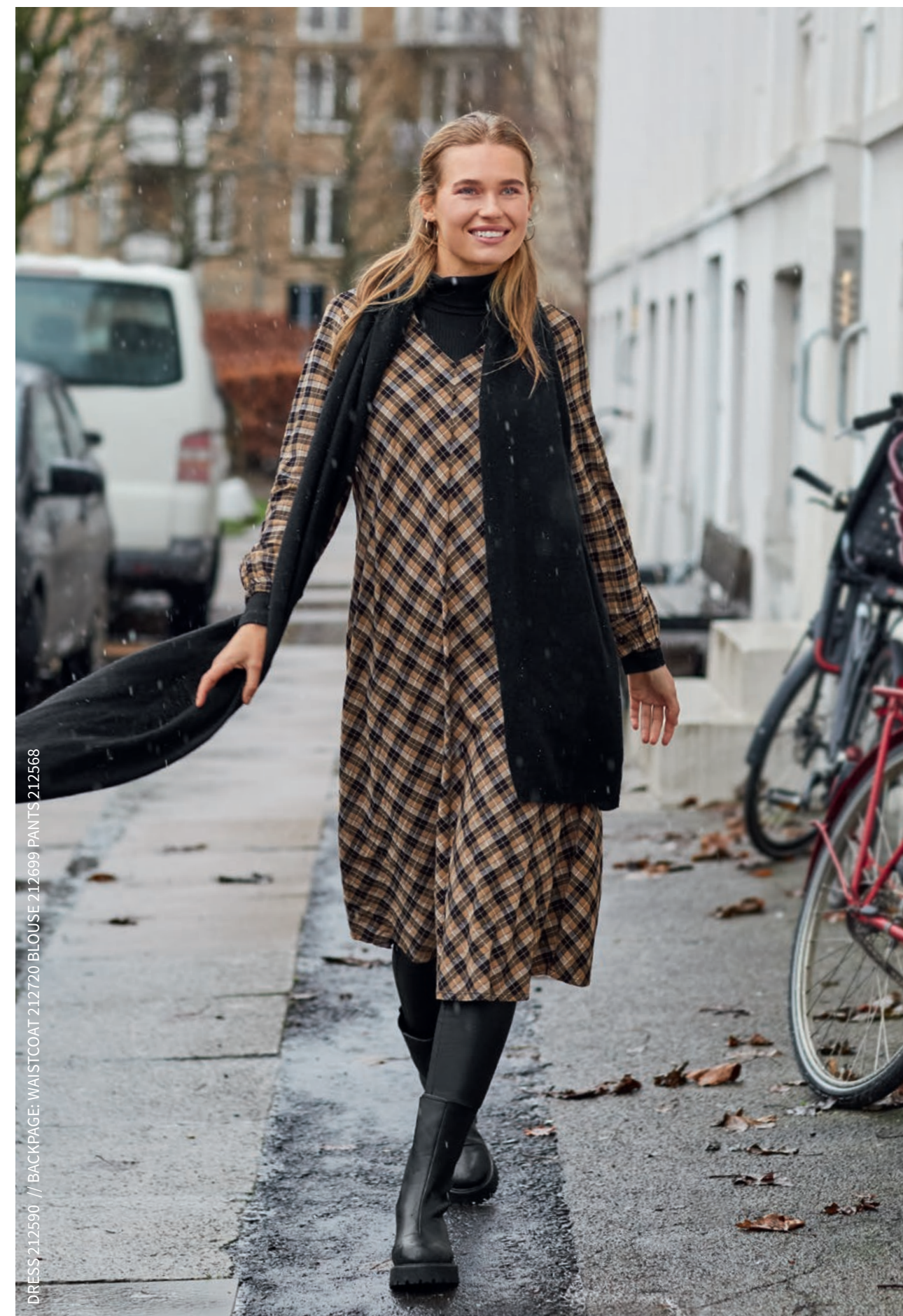
DRESS 212590 // BACKPAGE: WAISTCOAT 212720 BLOUSE 212699 PANTS 212568