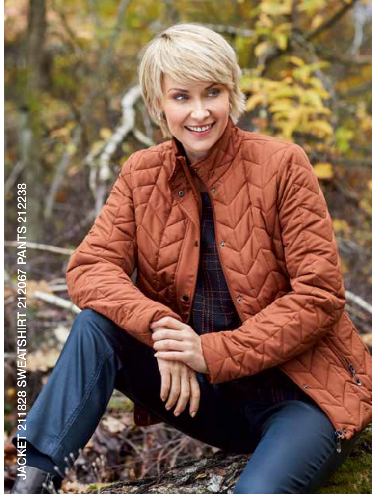
JACKET 211828 SWEATSHIRT 212067 PANTS 212238