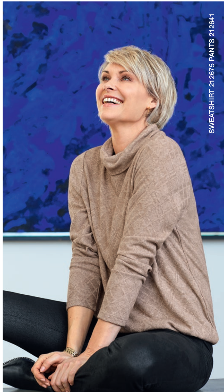
SWEATSHIRT 212675 PANTS 212641