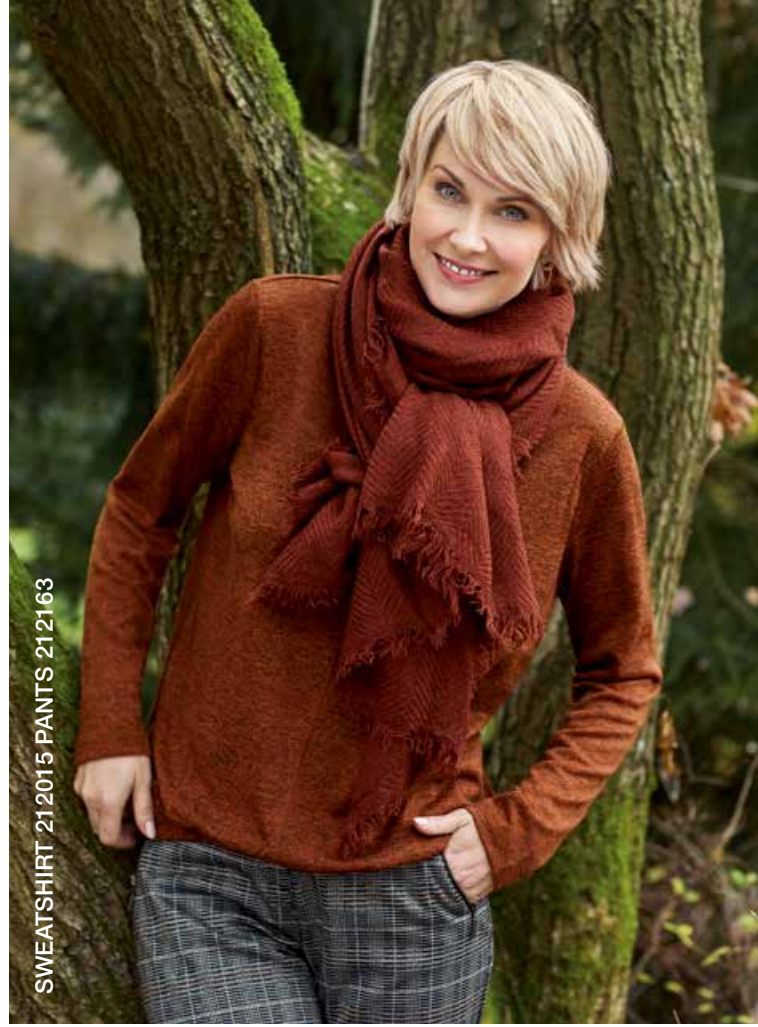
SWEATSHIRT 212015 PANTS 212163