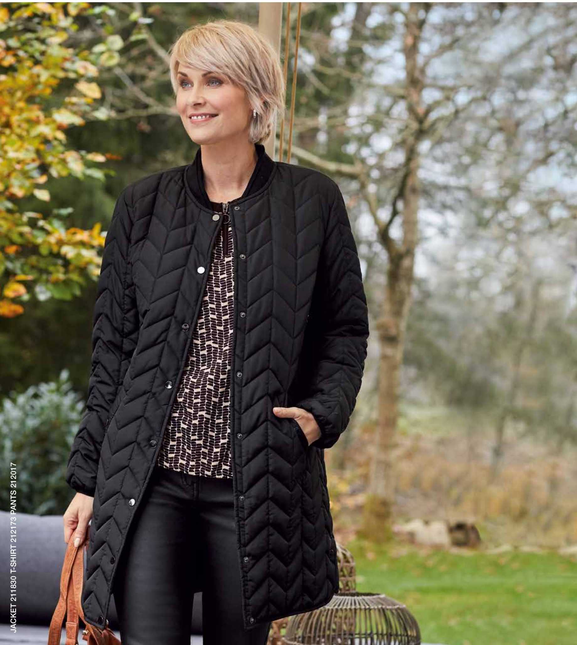
JACKET 211830 T-SHIRT 212173 PANTS 212017