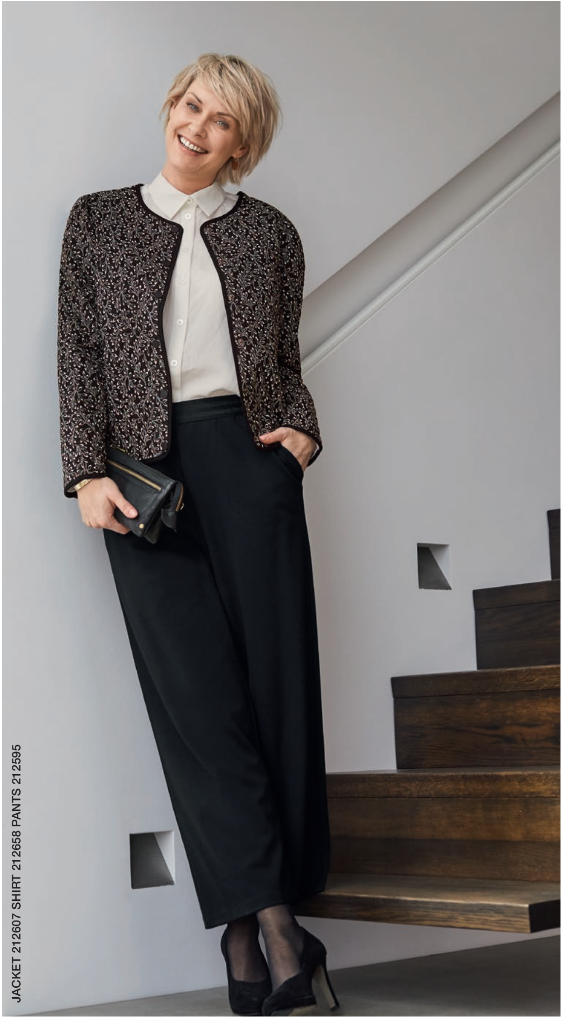
JACKET 212607 SHIRT 212658 PANTS 212595