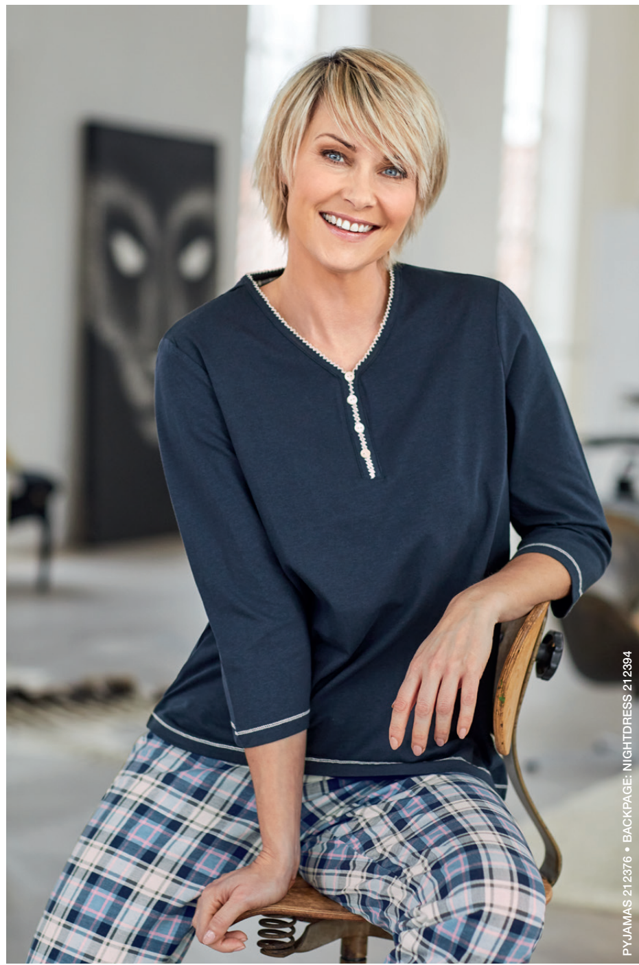
PYJAMAS 212376 • BACKPAGE: NIGHTDRESS 212394