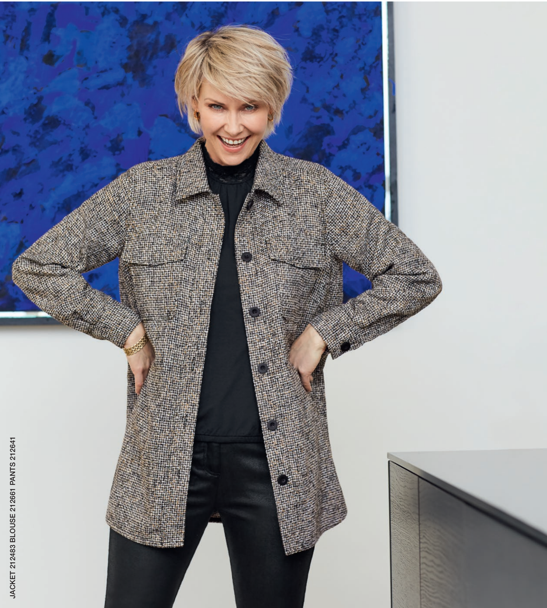
JACKET 212483 BLOUSE 212661 PANTS 212641