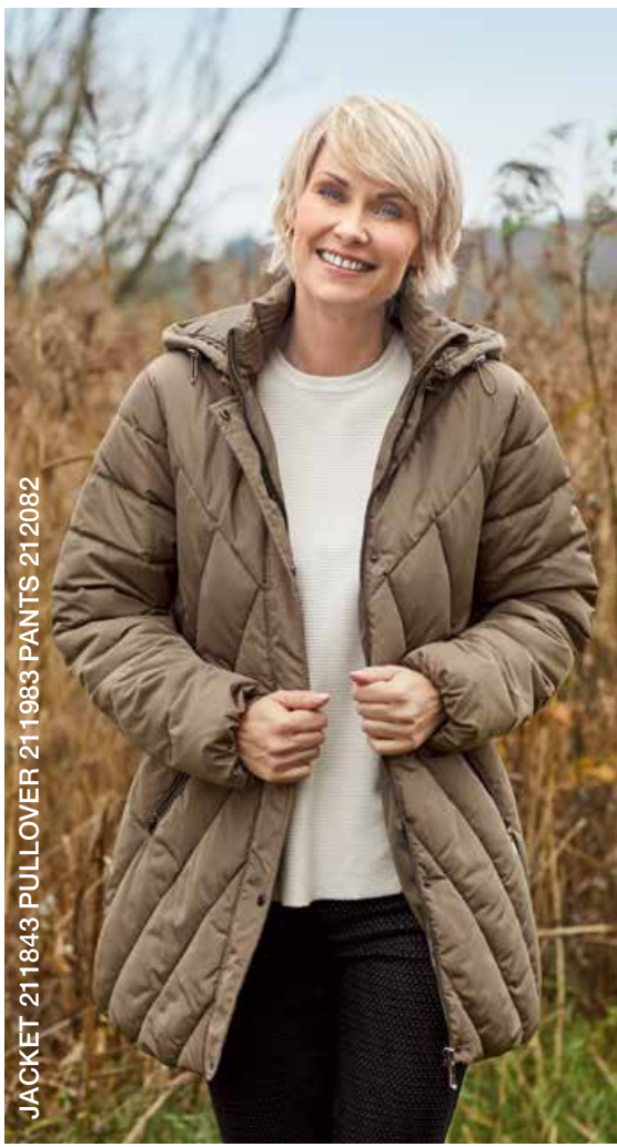
JACKET 211843 PULLOVER 211983 PANTS 212082