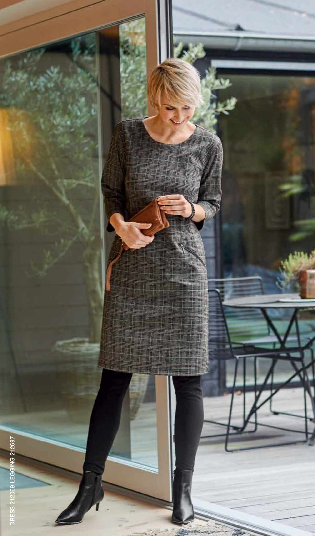
DRESS 212069 LEGGING 212697