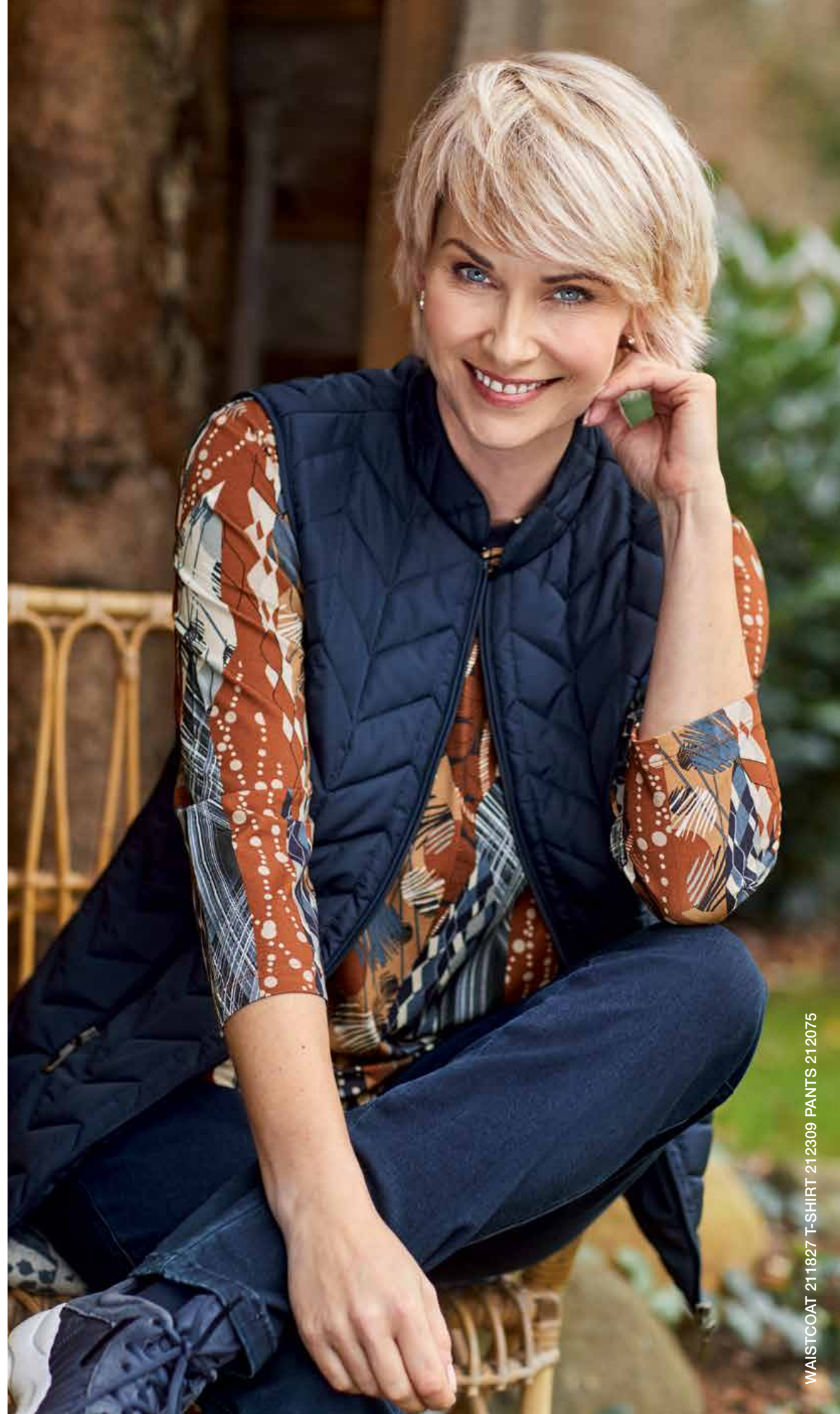
WAISTCOAT 211827 T-SHIRT 212309 PANTS 212075