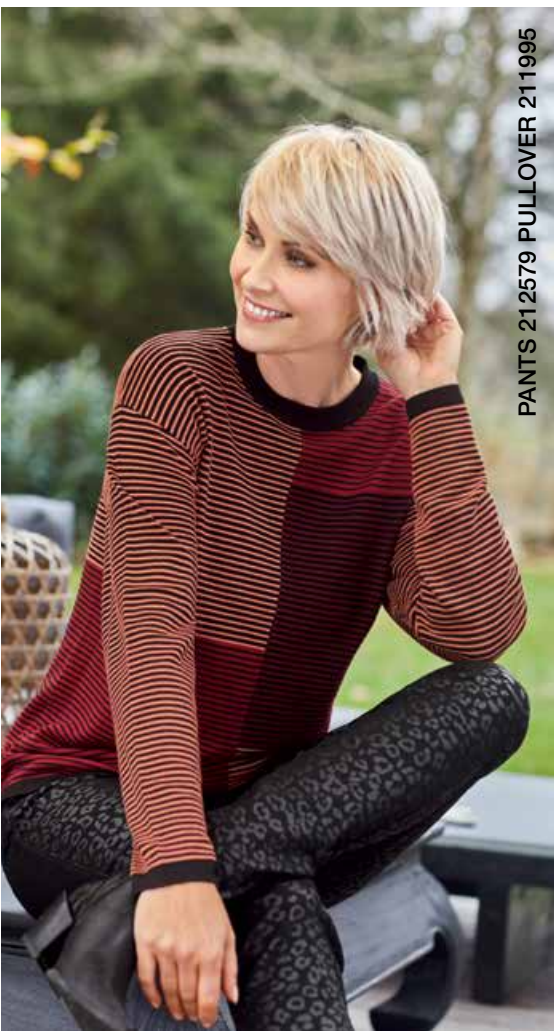
PANTS 212579 PULLOVER 211995