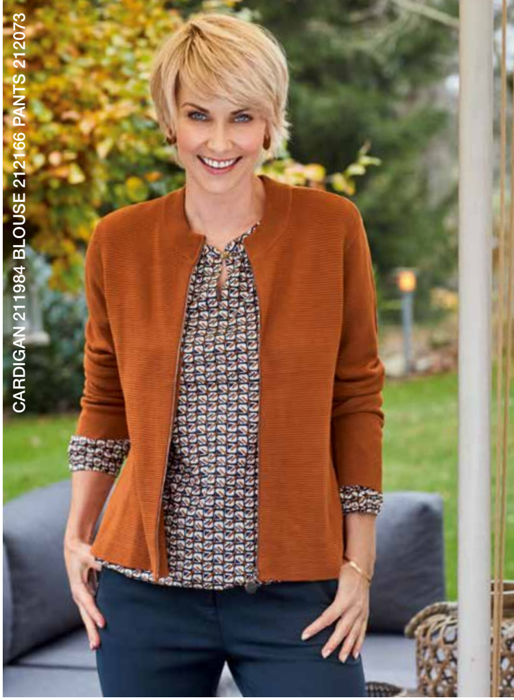
CARDIGAN 211984 BLOUSE 212166 PANTS 212073