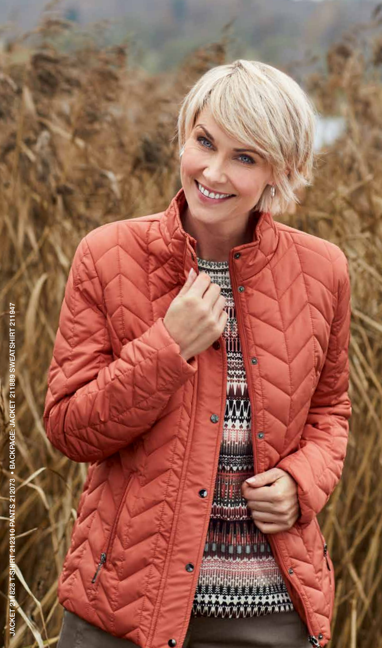
JACKET 211828 T-SHIRT 212310 PANTS 212073 • BACKPAGE: JACKET 211889 SWEATSHIRT 211947