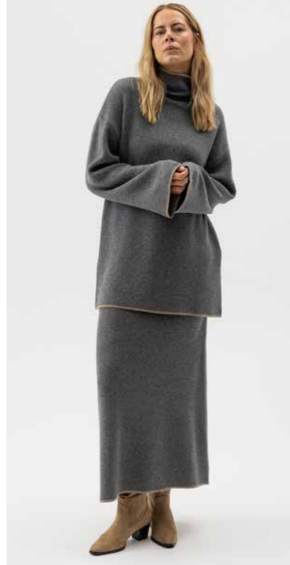
SALLY SKIRT A52608 Colours: Light Grey Mel., Dark Grey Mel. Sizes: XS-XL Material: 30% Wool (16% GRS), 35% Recycled Polyamide, 30% Viscose, 5% Cashmere.