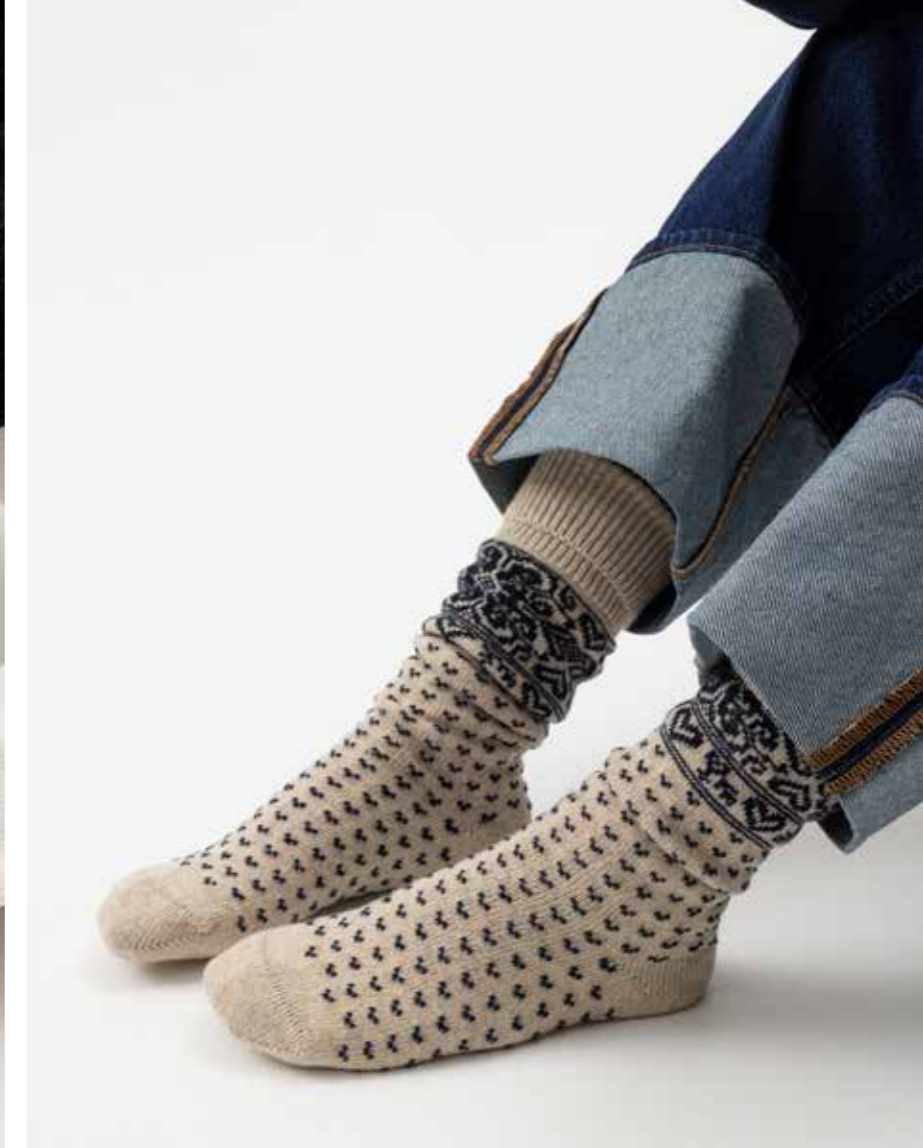
SUNDBORN RAGGSOCKA UNISEX 44702 Colours: Off White Mel., Oyster, Navy, Dark Grey Mel. Sizes: 36-40 Material: 50% Wool, 25% Acrylic, 23% Polyamide, 2% Lycra