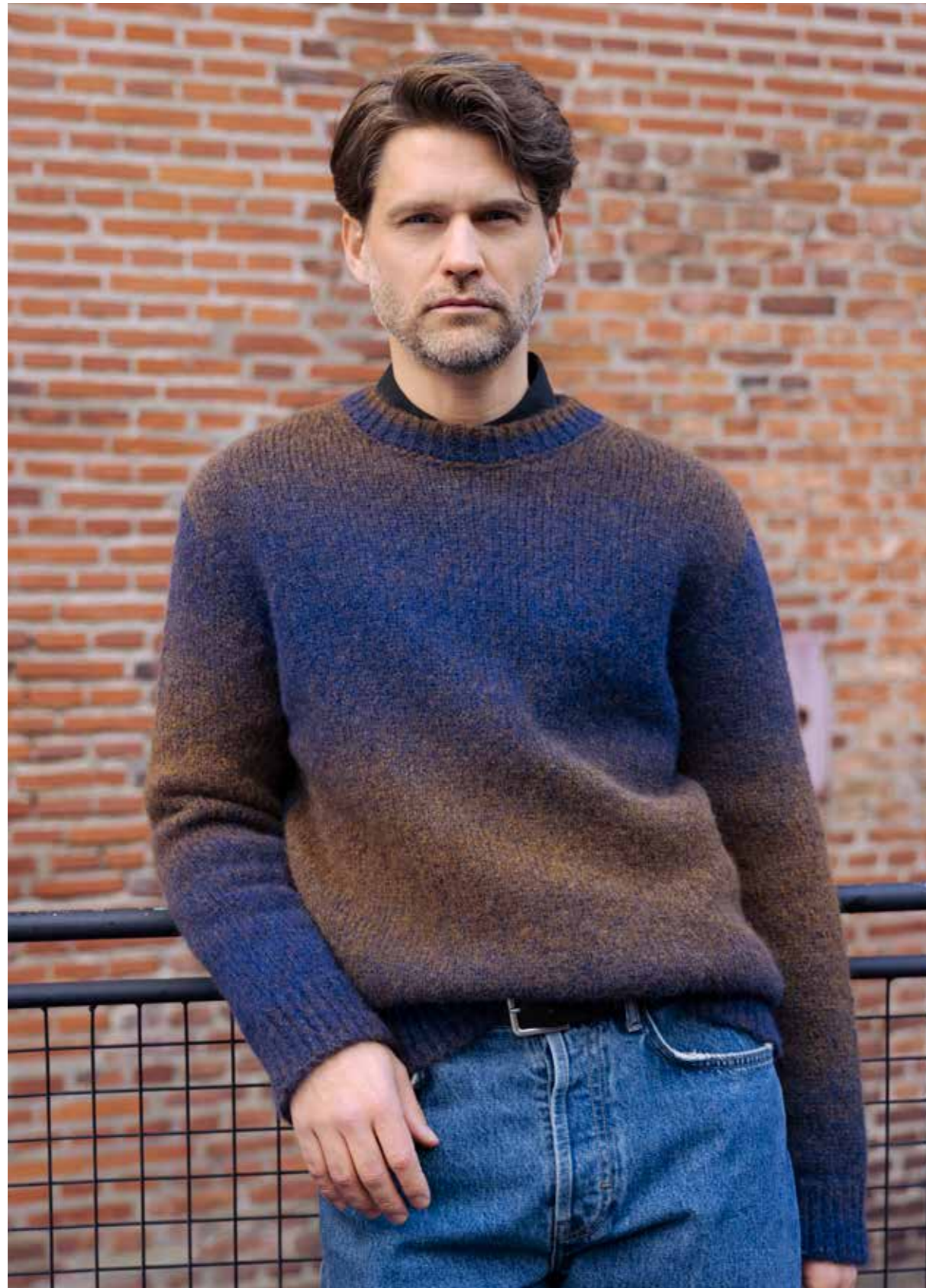
BYRON CREW A51402 Colours: Brown Mel. / Navy. Sizes: S-XXL Material: 74% Alpaca Superfine, 26% Polyamide