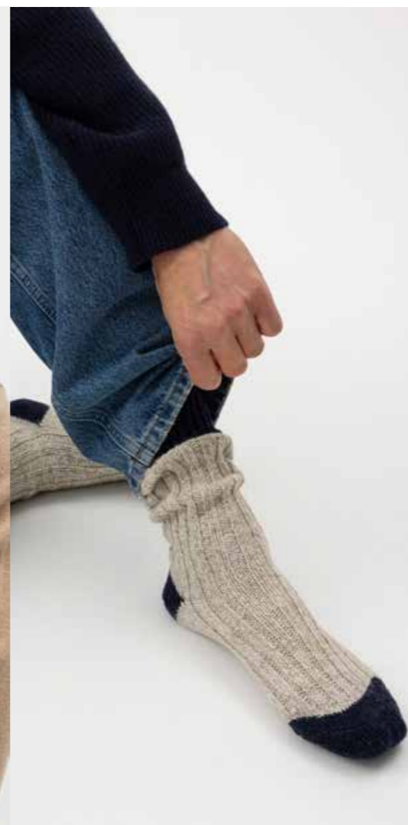
BROMMÖ RAGGSOCKA UNISEX 424720 Colours: Off White / Grey Mel., Denim Mel. / Navy, Khaki / Navy, Grey Mel. / Off White. Sizes: 36-40 & 41-45. Material: 50% Wool, 25% Acrylic, 23% Polyamide, 2% Lycra