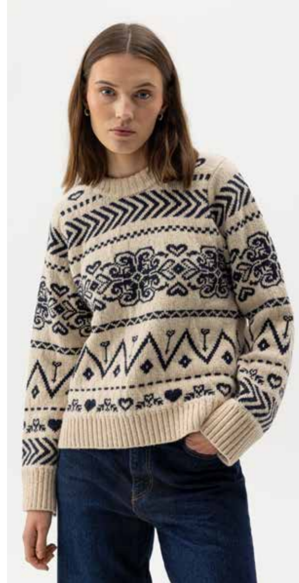
MAGDA CREW A52413 Colours: Sand / Navy. Sizes: XS-XL Material: 80% Merino Fine, 20% Polyamide