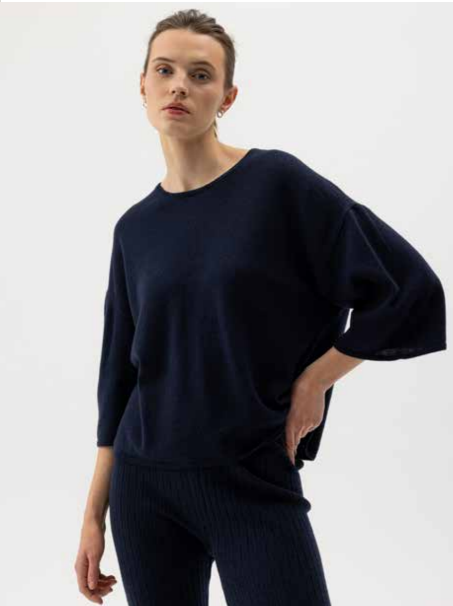
KRISTINA TOP A42403 Colours: Dark Navy, Oak Mel., Black Mel. Sizes: XS-XXL Material: 100% Extra Fine Merino Wool