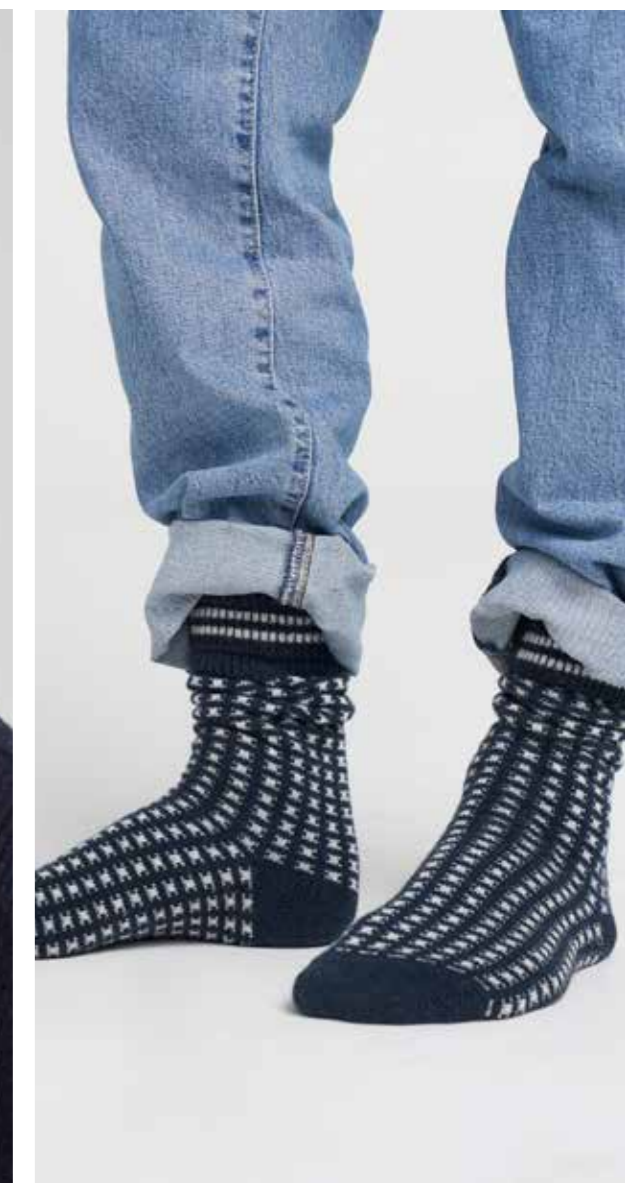
MALUNG RAGGSOCKA UNISEX A34711 Colours: Off White, Navy Mel., Light Grey Mel. Sizes: 36-40 & 41-45. Material: 50% Wool, 25% Acrylic, 23% Polyamide, 2% Lycra