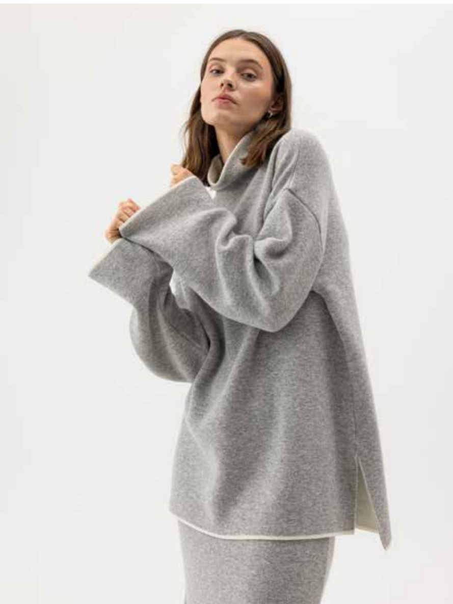
SALLY TURTLE A52407 Colours: Light Grey Mel., Dark Grey Mel. / Khaki, Dark Grey Mel. Sizes: XS-XL Material: 30% Wool (16% GRS), 35% Recycled Polyamide, 30% Viscose, 5% Cashmere