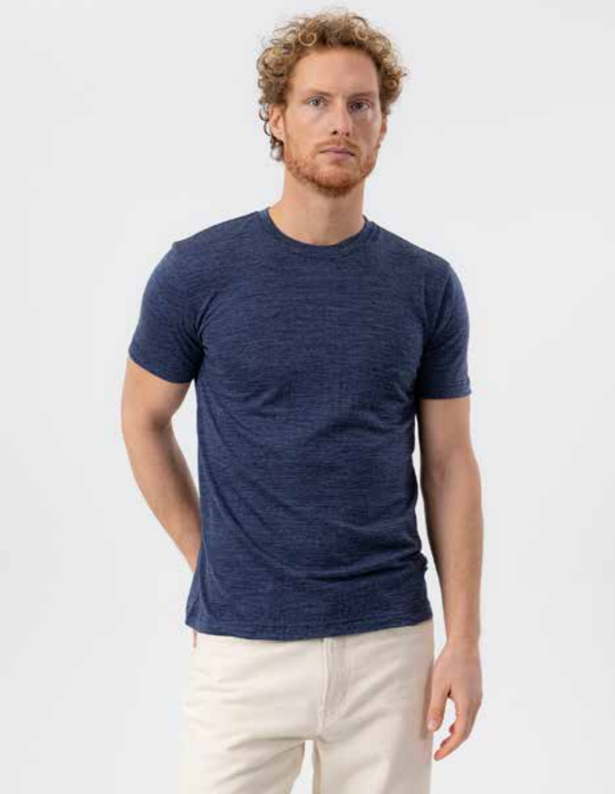
ULRIK TEE A41501 Colours: Navy Mel., Black. Sizes: S-XXL Material: 60% Wool, 40% Tencel