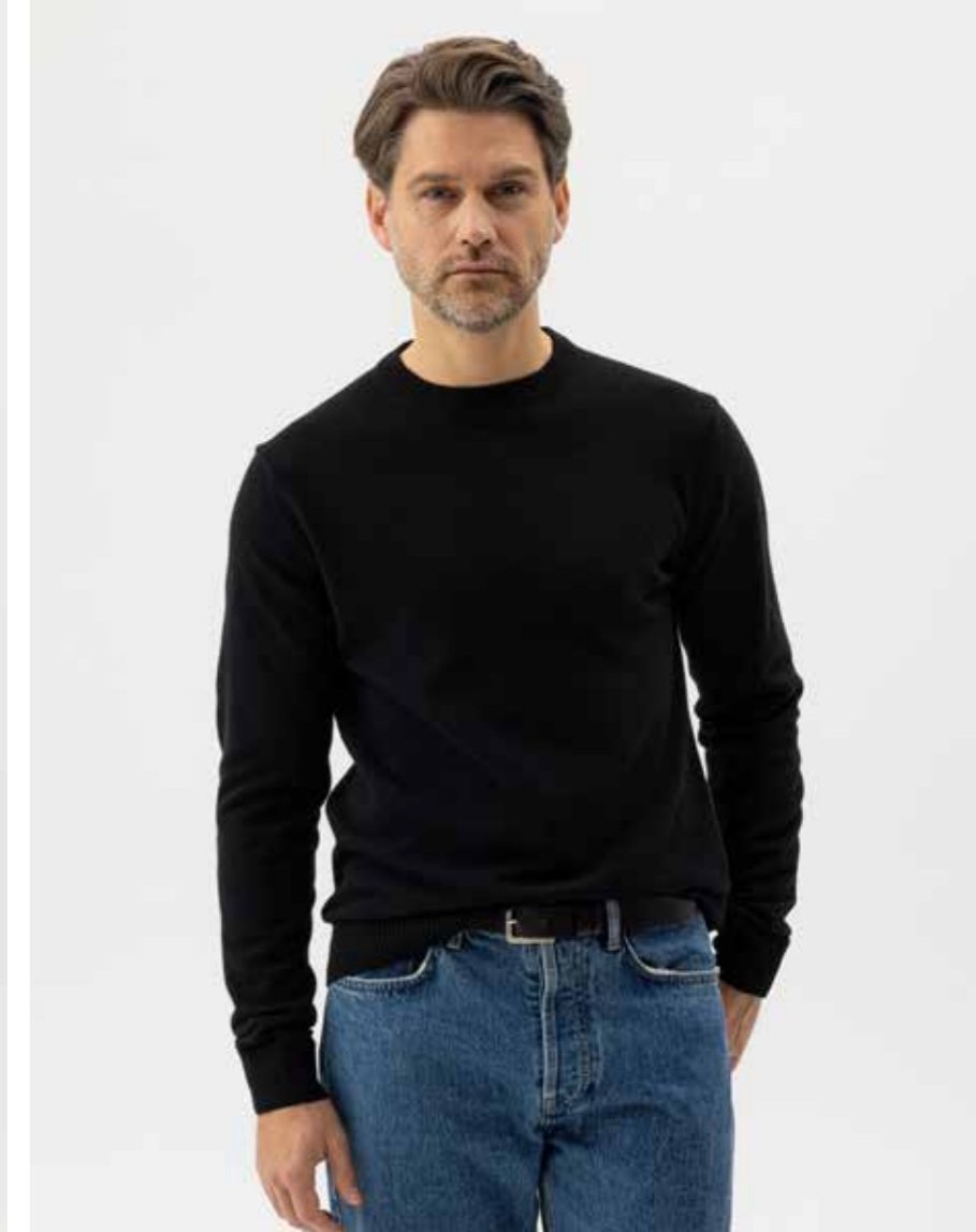
DENNIS CREW A41405 Colours: Khaki, Black. Sizes: S - XXXL Material: 70% Wool (20% GRS), 30% Cashmere GRS Recycled