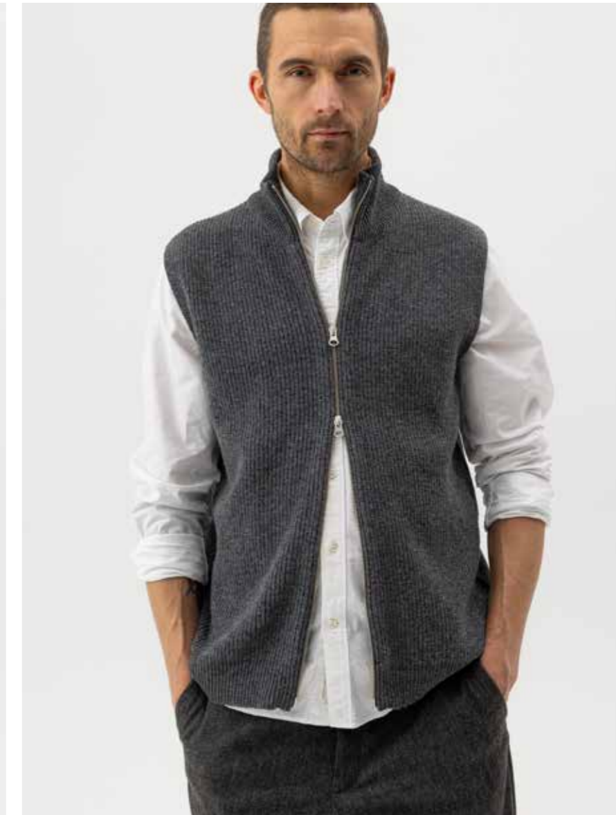
FRANK VEST A51407 Colours: Navy, Dark Grey Mel. Sizes: S - XXL Material: 80% Wool, 20% Polyamide