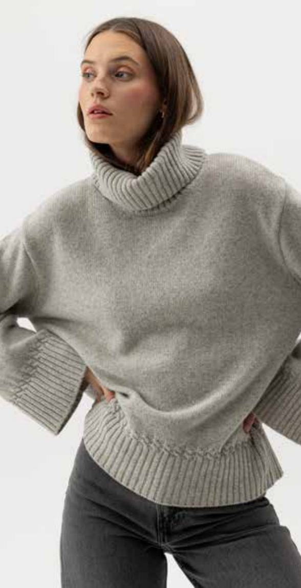
CHRISTINE ROLLNECK A52404 Colours: Walnut, Light Grey Mel. Sizes: XS-XL Material: 90% Merino Fine, 10% Cashmere