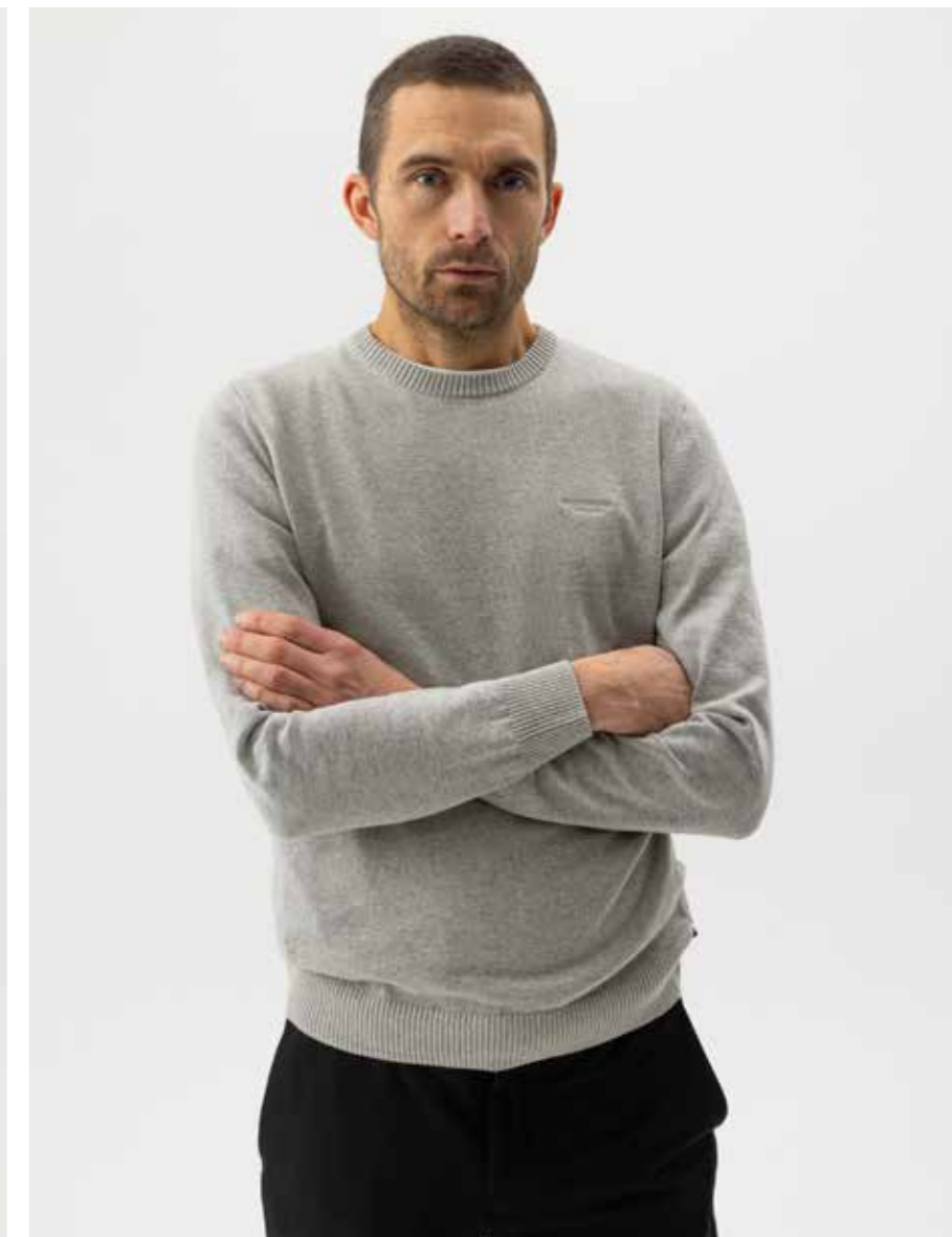
HOLGER CREW A11413 Colours: Navy, Lt. Grey Mel., Black. Sizes: S-XXXL Material: 100% Cotton