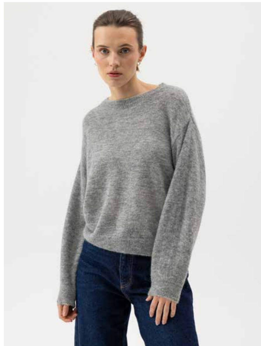
ELIZABETH CREW A42412 Colours: Pale Peach, Walnut, Grey Mel., Black. Sizes: XS-XL Material: 70% Alpaca Superfine, 30% Polyamide