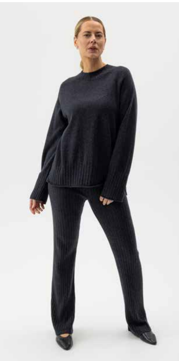
CHARLOTTE PANTS A52202 Colours: Dark Navy, Oak Mel., Black Mel. Sizes: XS-XL Material: 100% Extra Fine Merino Wool