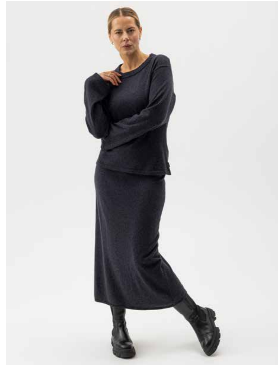
WENDELA CREW A52402 Colours: Dark Navy, Oak Mel., Black Mel. Material: 100% Extra Fine Merino Wool Sizes: XS-XXL