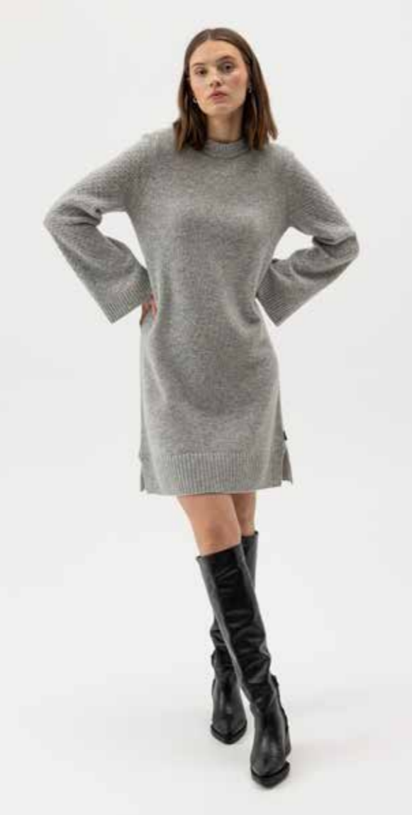
SVEA DRESS A52602 Colours: Sand, Grey Mel., Black. Sizes: XS-XXL Material: 80% Wool, 20% Polyamide