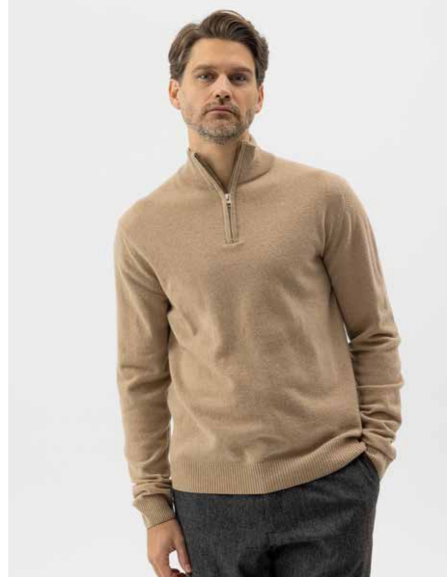
DENNIS T-NECK A41406 Colours: Khaki, Black. Sizes: S-XXXL Material: 70% Wool (20% GRS), 30% Cashmere GRS Recycled