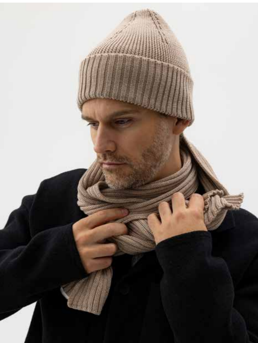
ÅLAND HAT A54708 Colours: Khaki, Black. Sizes: One Size Material: 100% Extra Fine Merino Wool