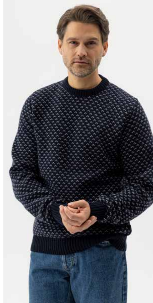
TORSTEN CREW A41410 Colours: Navy / Marble Grey, Marble Grey / Dark Grey Mel. Sizes: S-XXXL. Material: 80% Viscose, 20% Polyamide