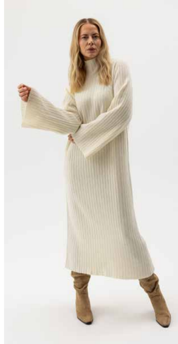
AMI DRESS A52605 Colours: Whisper White, Navy. Sizes: XS-XL Material: 80% Wool, 20% Polyamide