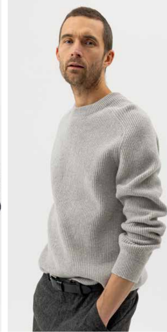
FRANK CREW A51405 Colours: Navy, Marble Grey. Sizes: S-XXL Material: 80% Wool, 20% Polyamide