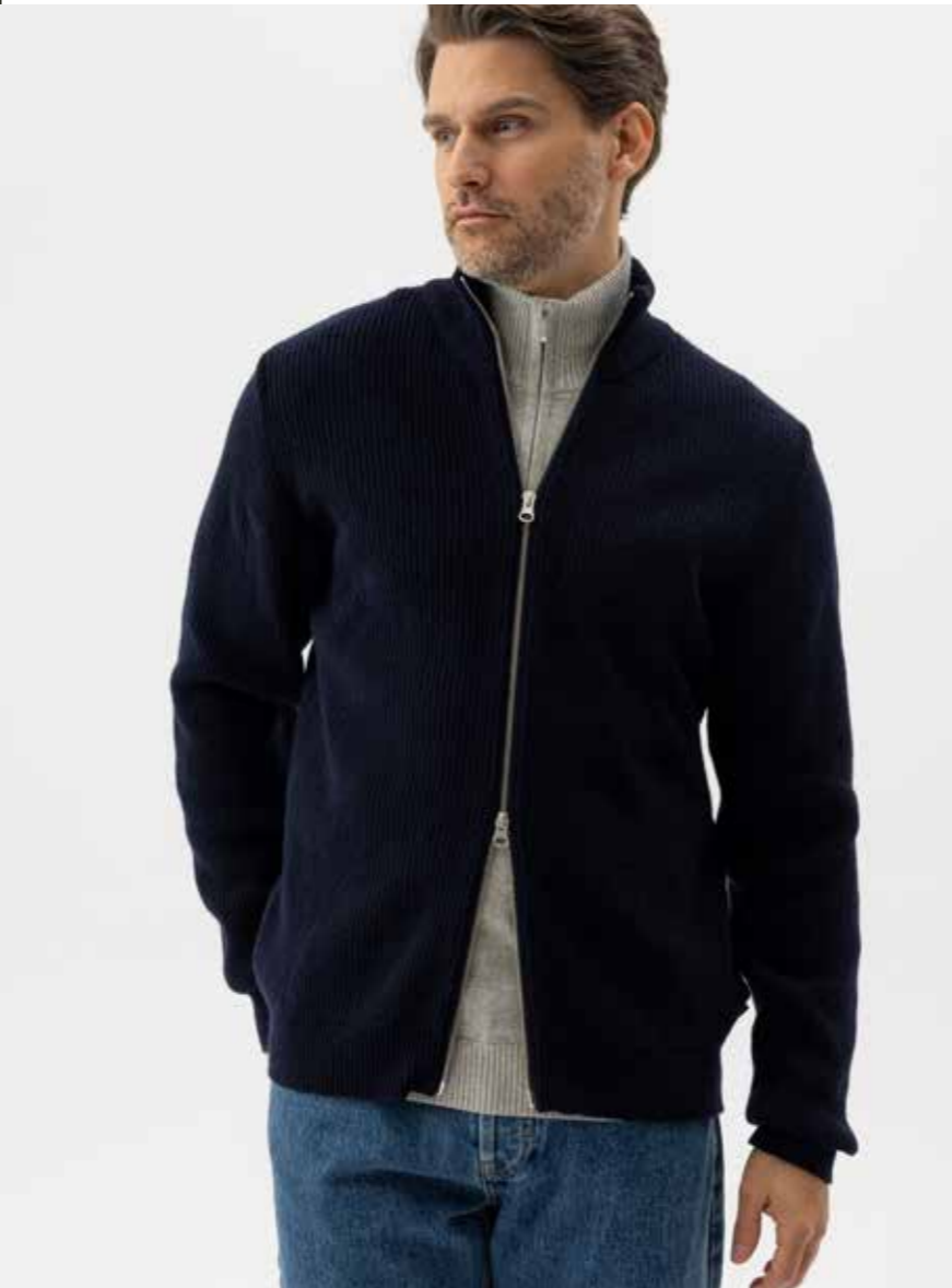
FRANK FULLZIP A51406 Colours: Navy, Dark Grey Mel. Sizes: S-XXL Material: 80% Wool, 20% Polyamide