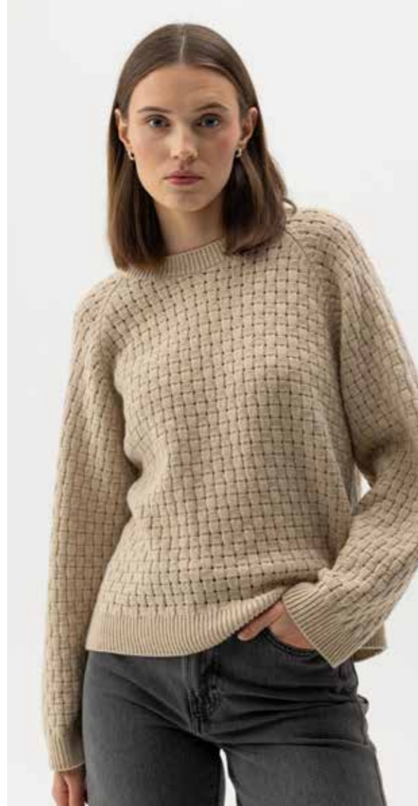
INDIE CREW A52405 Colours: Sand, Black. Sizes: XS-XL Material: 90% Merino Fine, 10% Cashmere