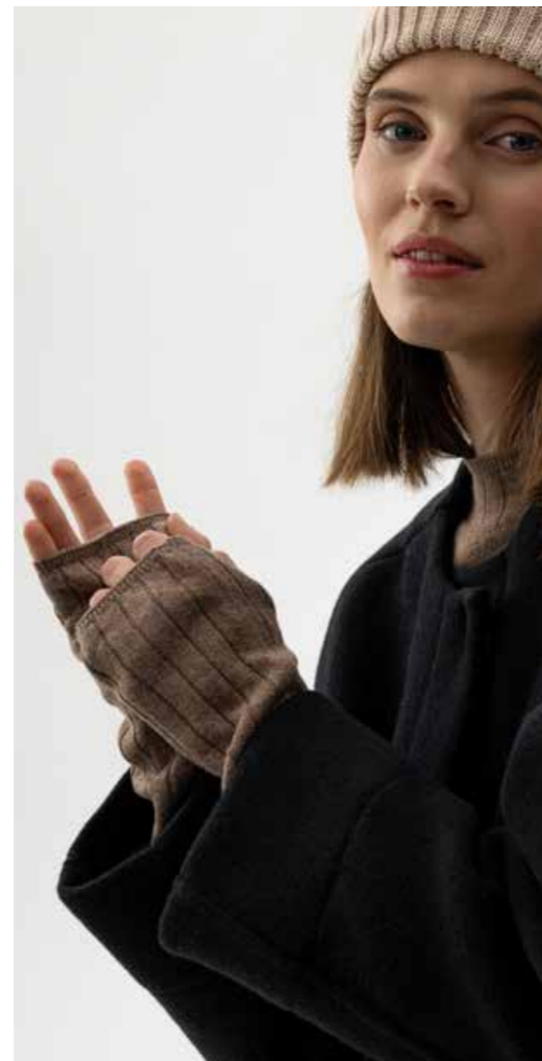
ÅSTOL WRISTWARMERS A54711 Colours: Dark Navy, Oak Mel., Black Mel. Sizes: One Size Material: 100% Extra Fine Merino Wool