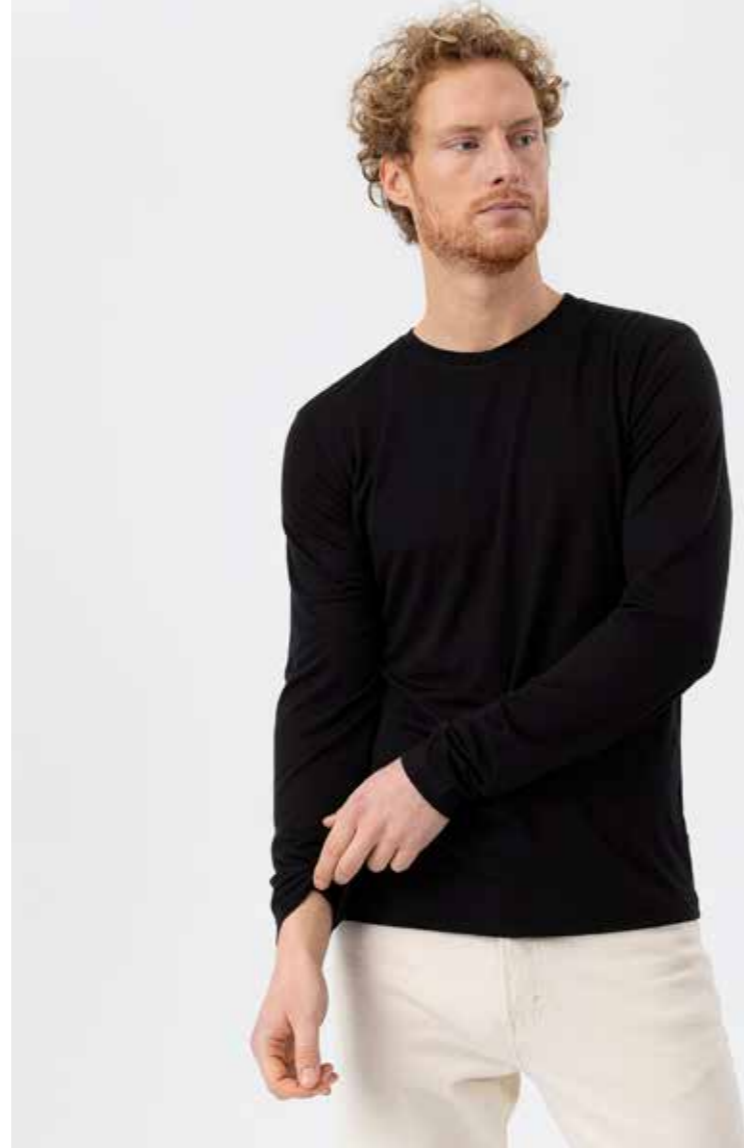
ULRIK LONG SLEEVE A41502 Colours: Navy Mel., Black. Sizes: S-XXL Material: 60% Wool, 40% Tencel