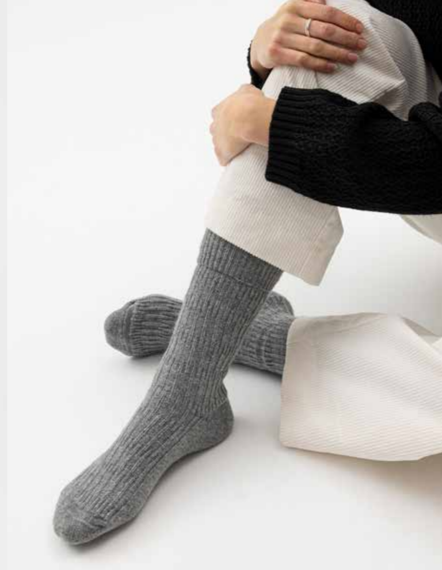
SJÖVIK RAGGSOCKA UNISEX A54712 Colours: Off White, Navy, Grey Mel. Sizes: 36-40 & 41-45 Material: 50% Wool, 25% Acrylic, 23% Polyamide, 2% Lycra