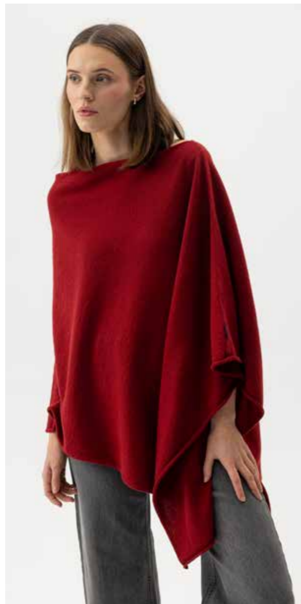
SOFIE PONCHO 422437 Colours: Cream Pink, Berry, Dark Navy, Sand Mel., Oak Mel., Black Mel., Black. Sizes: One Size Material: 100% Extra Fine Merino Wool