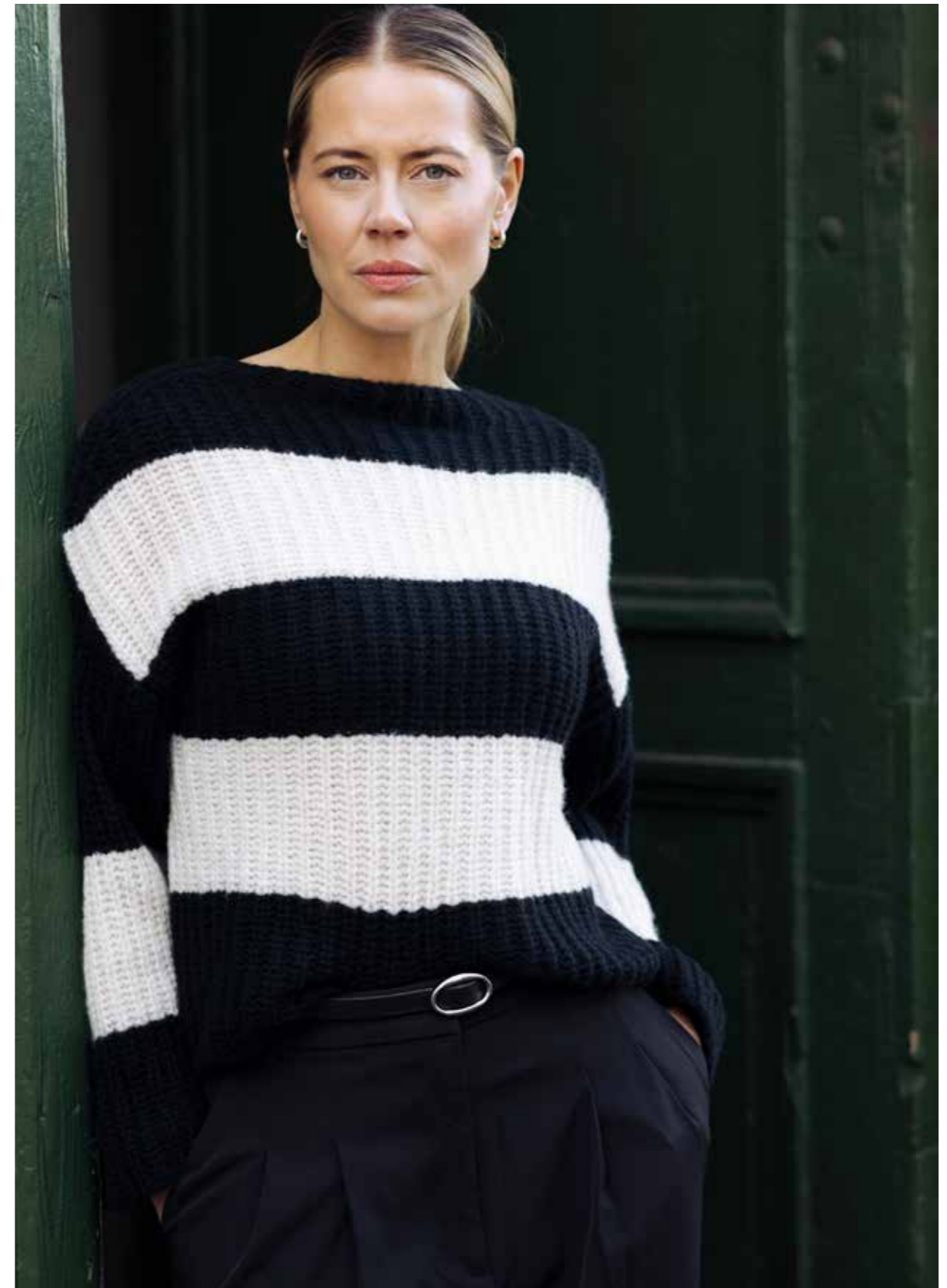
CAJSA SWEATER S32418 Colours: Ruby, Khaki, Black / Sandshell, Anthracite Mel. Sizes: XS-XL Material: 75% Extra Fine Merino Wool, 25% Polyamide