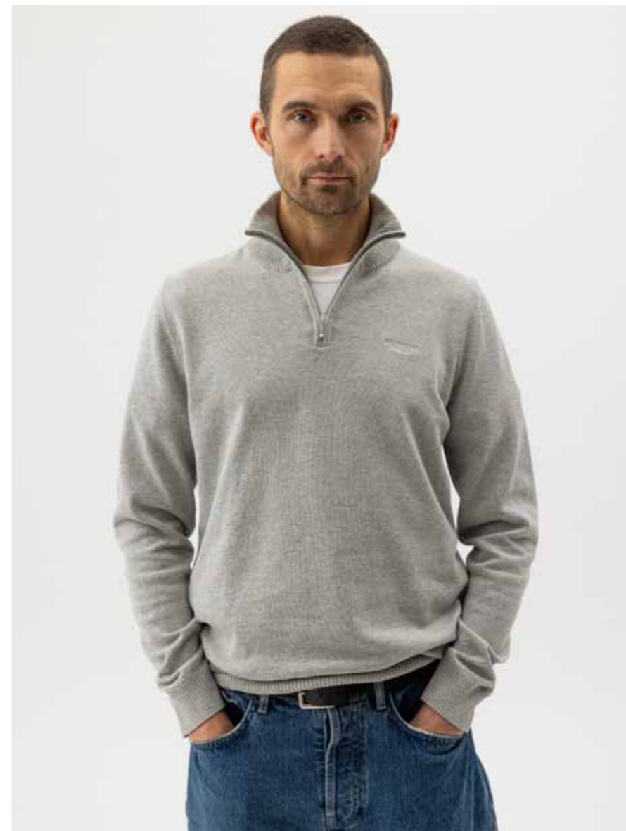
HOLGER T-NECK A11414 Colours: Navy, Lt. Grey Mel., Black. Sizes: S-XXXL Material: 100% Cotton