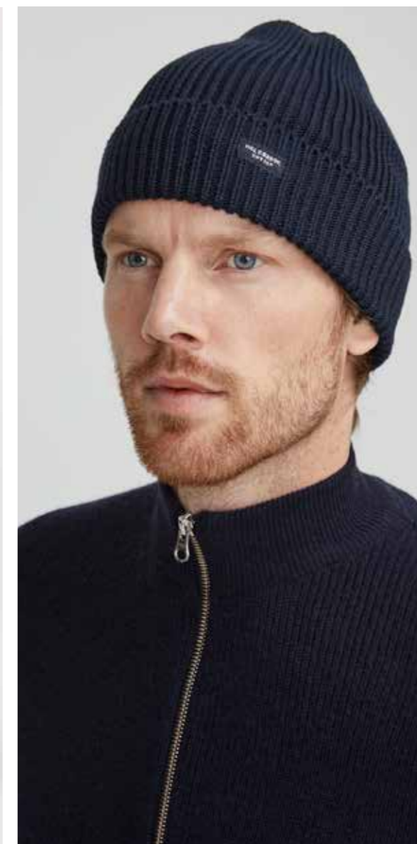
BOHUS HAT UNISEX 714703 Colours: Off White, Navy, Dusty Olive, Red, Teak Mel., Lt. Grey Mel. Sizes: One Size. Material: 100% Cotton