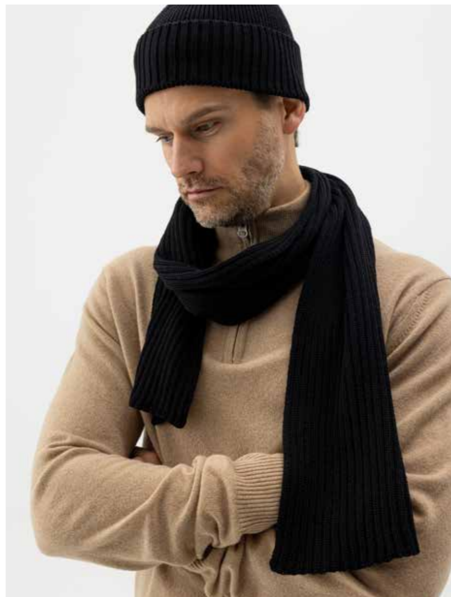
ÅLAND SCARF A54709 Colours: Khaki, Black. Sizes: One Size Material: 100% Extra Fine Merino Wool