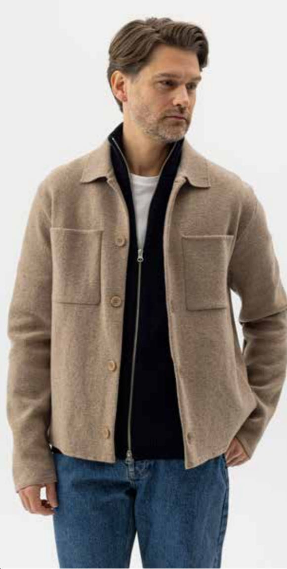
TORVALD OVERSHIRT A51408 Colours: Khaki, Black. Sizes: S-XXL Material: 80% Wool, 20% Polyamide