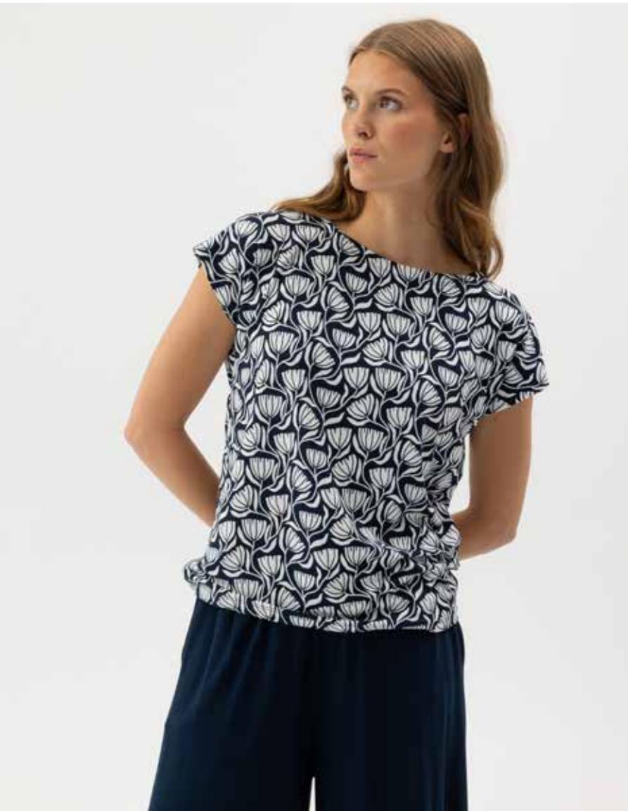
ELLEN CAPSLEEVE S62503 Colours: White, White/Navy, Off White/Bright Red, Navy, Navy/Off White, Bright Red, Navy Pattern, Black. Sizes: XS-XXL Material: 93% Viscose, 7% Elastane