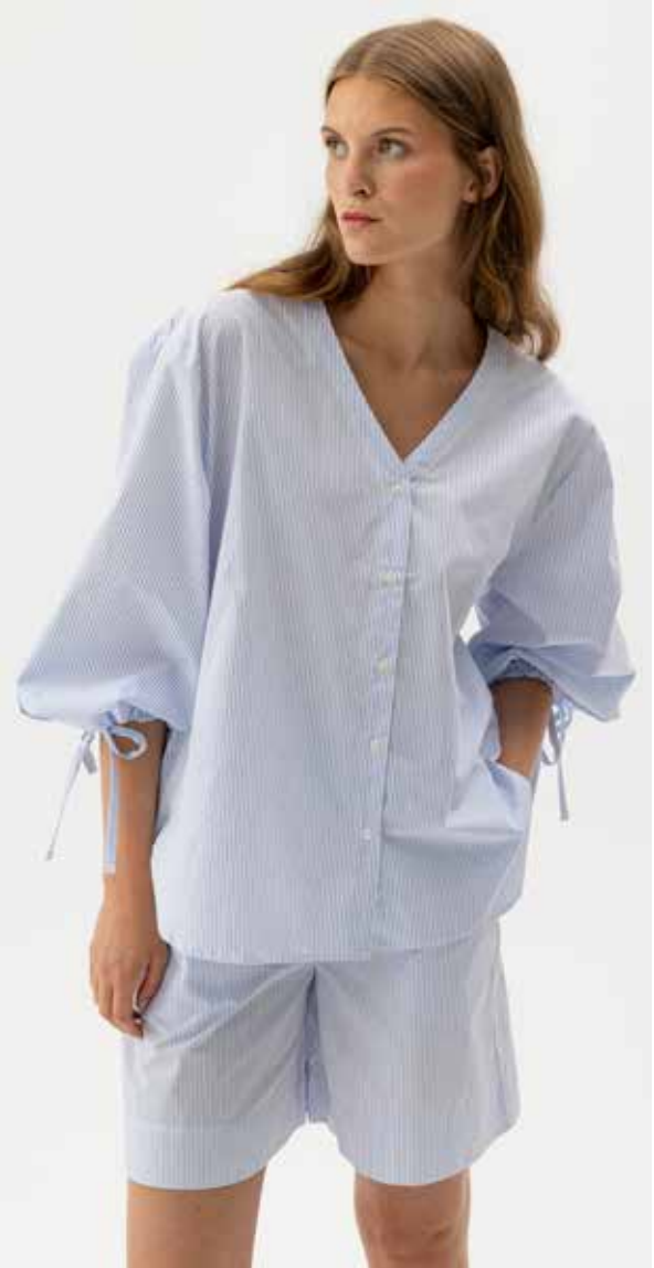
MARIE SHIRT S62302 Colours: White/Light Blue, Navy/White, Dark Brown/White. Sizes: XS-XL Material: 100% Cotton