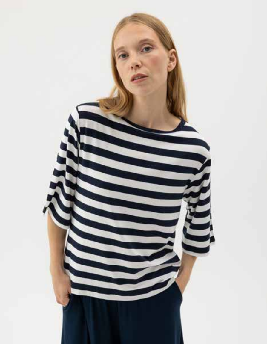
ELLEN TEE S62501 Colours: Off White, White/Navy, Off White/Bright Red, Navy, Black. Sizes: XS-XXL Material: 93% Viscose, 7% Elastane