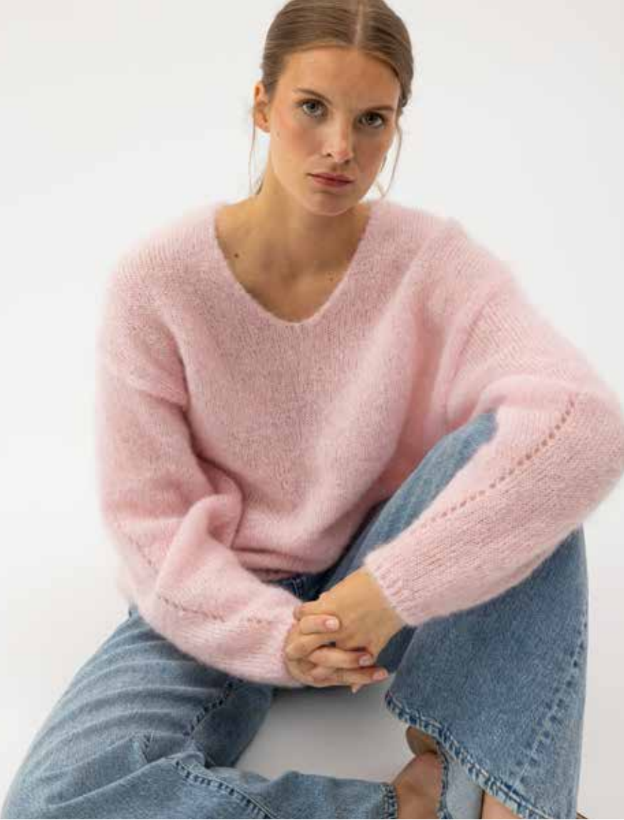
LILIAN V-NECK A42408 Colours: Navy, Pink, Sand. Sizes: XS-XL Material: 81% Kid Mohair (RMS), 17% Polyamide, 2% Elastane