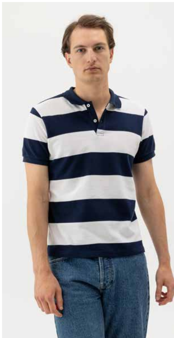
BEPPE POLO S41504 Colours: Navy/White. Sizes: S-XXXL Material: 100% Cotton