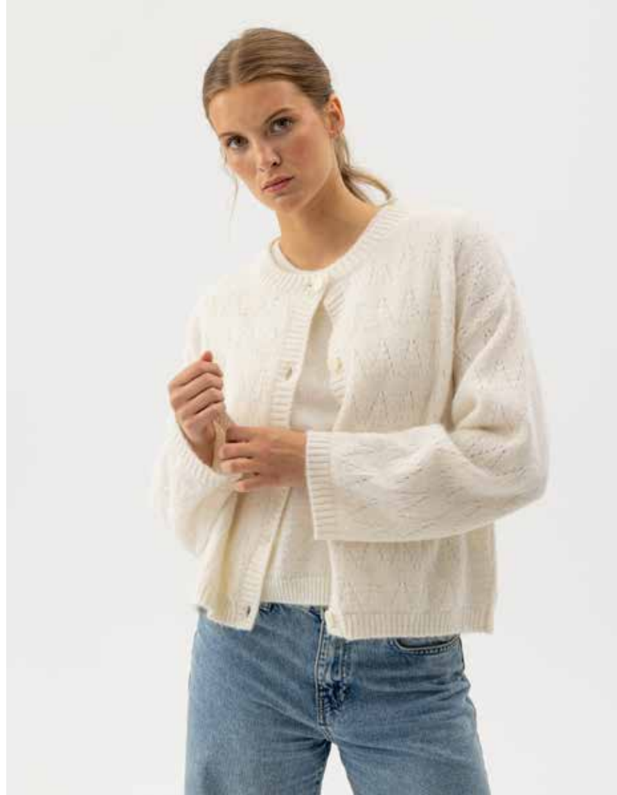
ELSY CARDIGAN S62422 Colours: Off White. Sizes: XS-XL Material: 70% Alpaca Superfine, 30% Polyamide