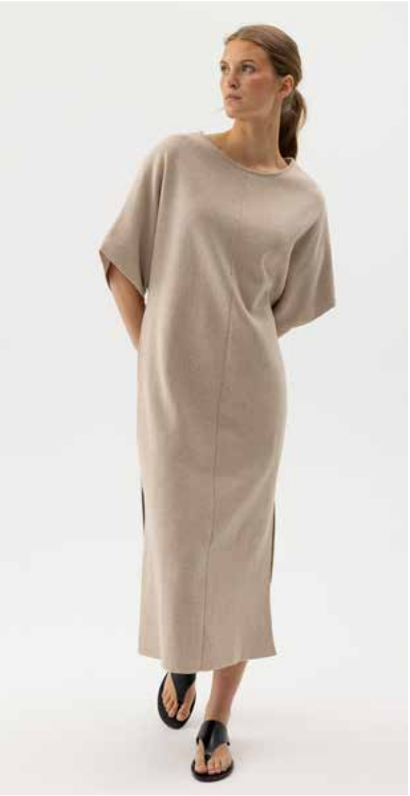
LISSIE DRESS S62606 Colours: Navy, Khaki. Sizes: XS-XL Material: 100% Cotton