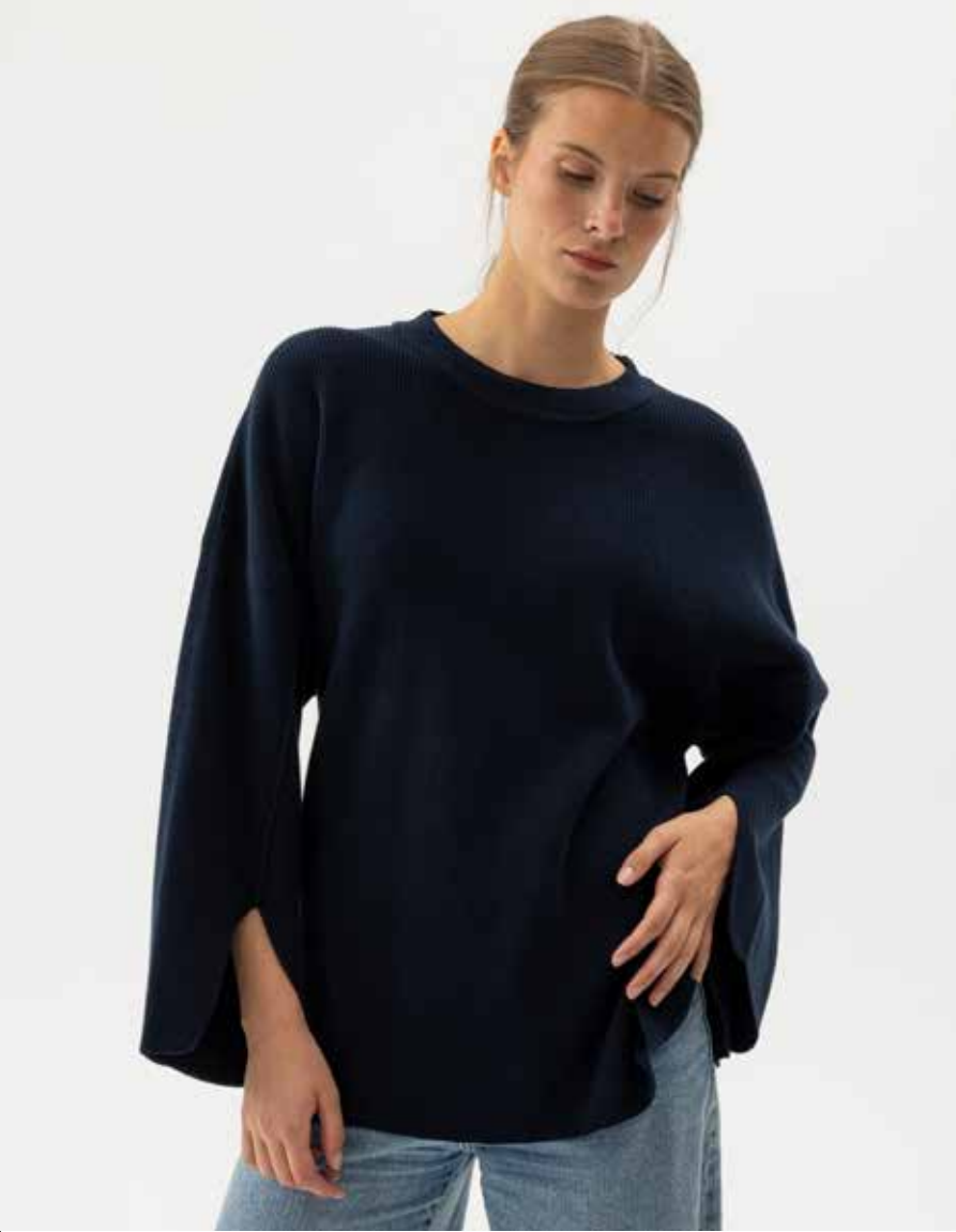
LINNEA CREW S62418 Colours: Off White, Navy. Sizes: XS-XL Material: 100% Cotton