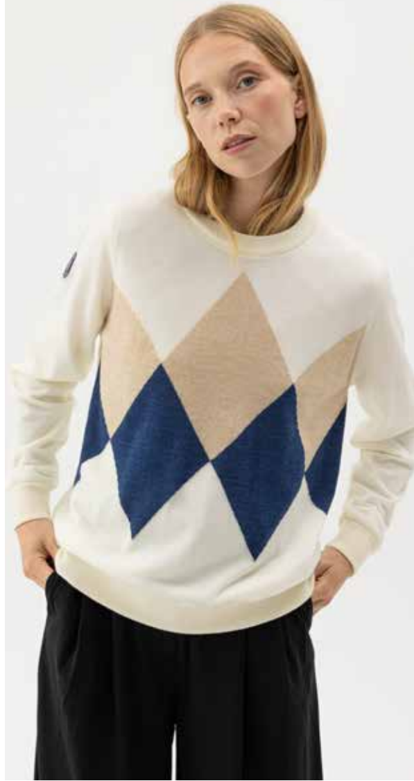
NELLY CREW WP H52401 Colours: Off White Multi Col., Red, Dark Navy, Light Grey Mel. Sizes: XS-XXL Material: 100% Extra Fine Merino Wool