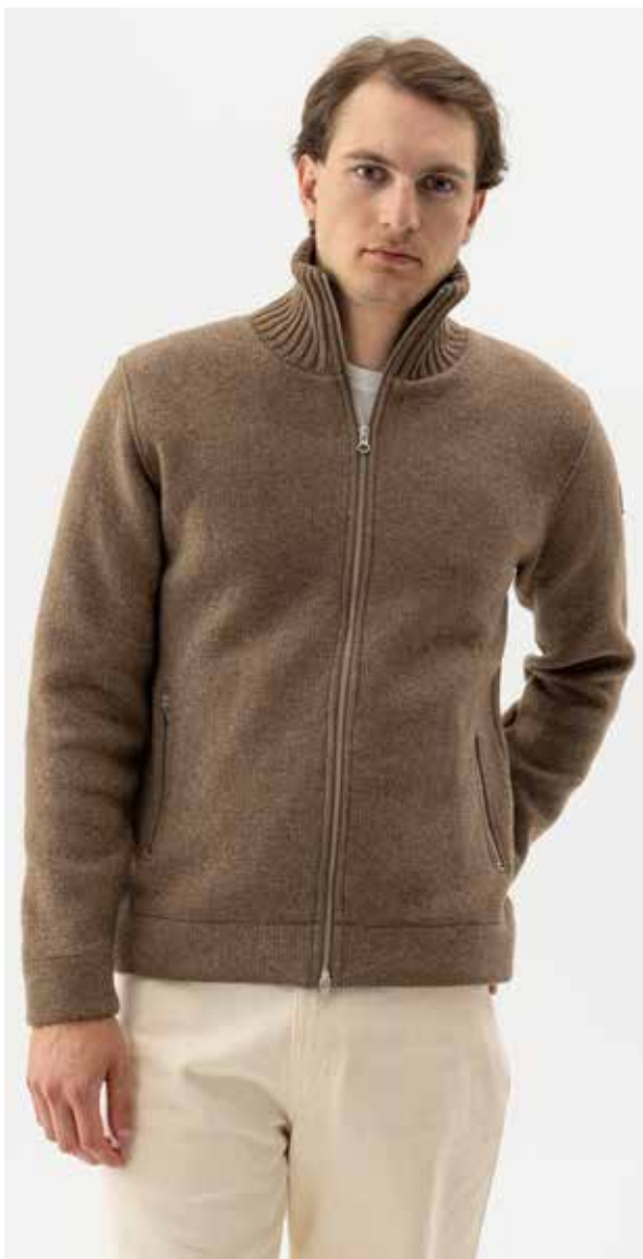
MÅNS ZIP WP 621424 Colours: Navy, Walnut, Light Grey Mel. Sizes: S-XXXL Material: 80% Wool, 20% Polyamide