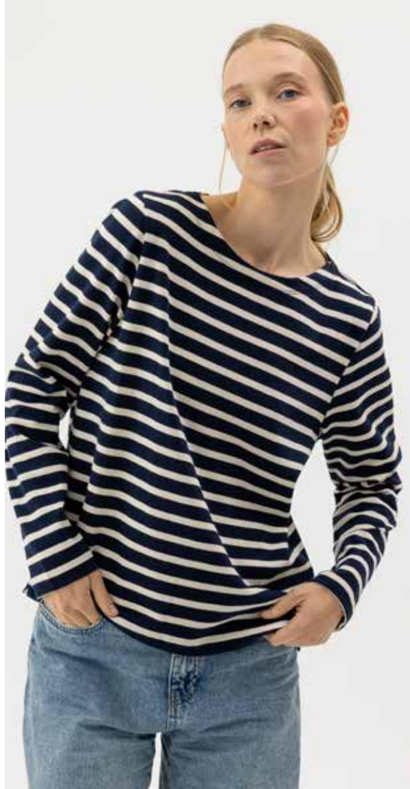
ENGLA BOATNECK S42502 Colours: Ecru/Navy, Navy/Ecru. Sizes: XS-XXL Material: 100% Cotton