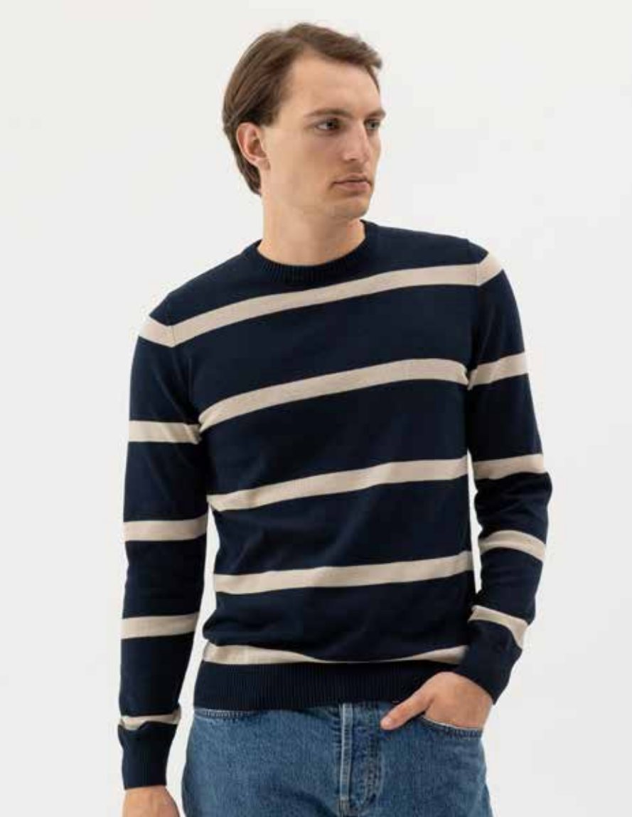
HOLGER CREW A11413 Colours: Navy, Navy/Feather, Feather, Black. Sizes: S-XXXL Material: 100% Cotton