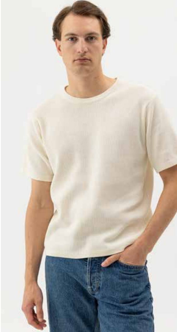
TOM TEE S61405 Colours: Off White, Navy. Sizes: S-XXL Material: 100% Cotton