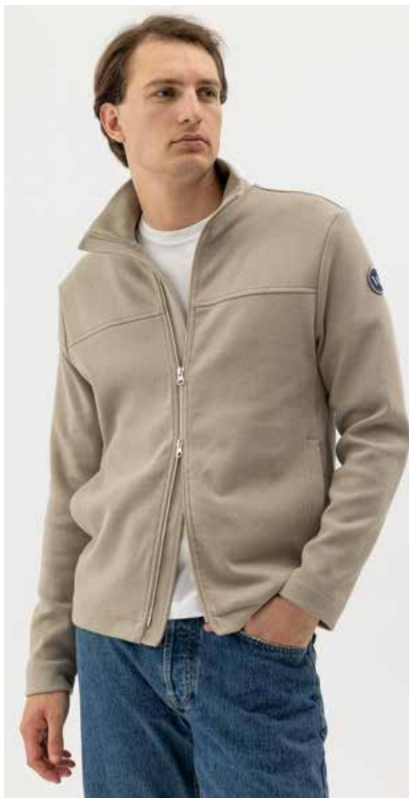
GURRA JACKET WP H61102 Colours: Navy, Feather. Sizes: S-XXXL Material: 100% Cotton