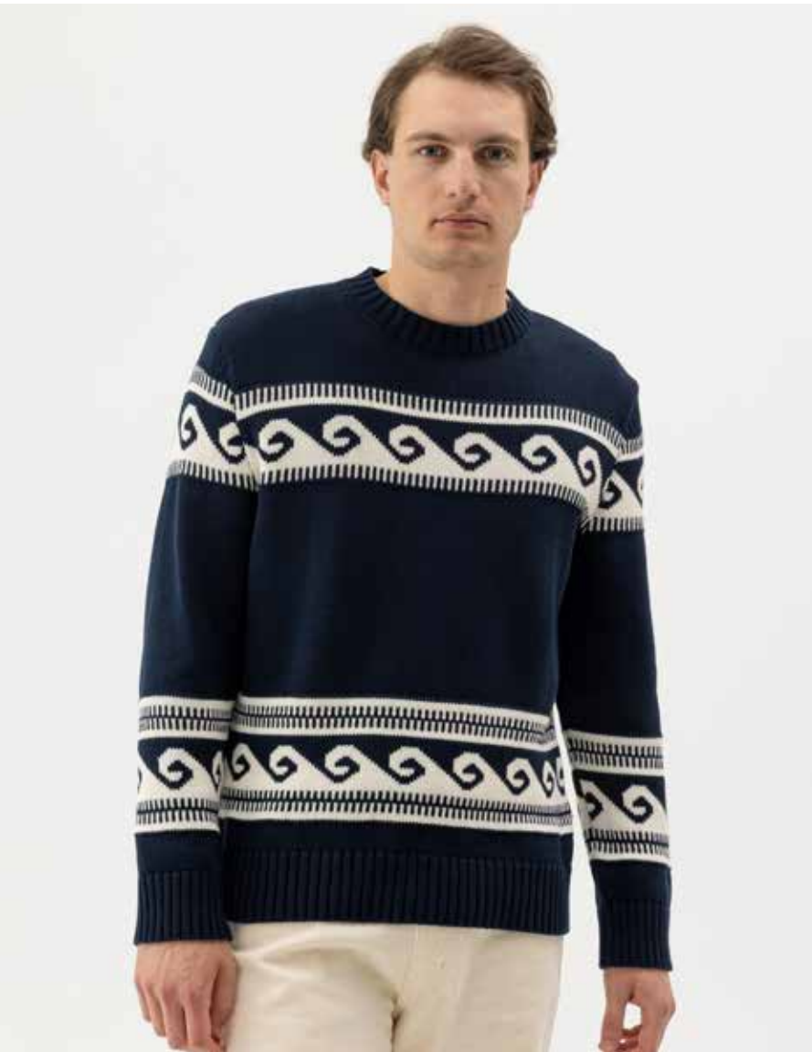
MALKOM CREW S61412 Colours: Navy/Off White. Sizes: S-XXL Material: 100% Cotton