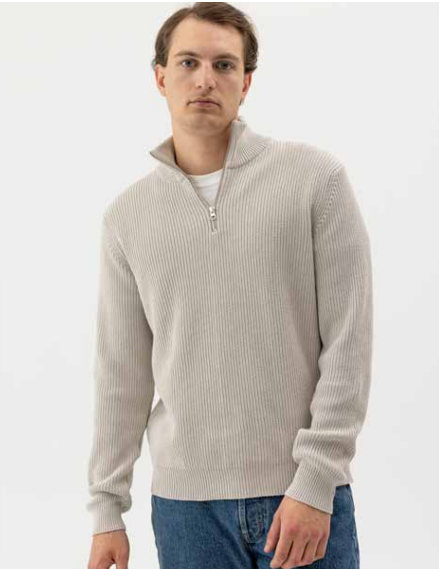
VINCENT T-NECK S61404 Colours: Navy, Marble Grey. Sizes: S-XXL Material: 100% Cotton