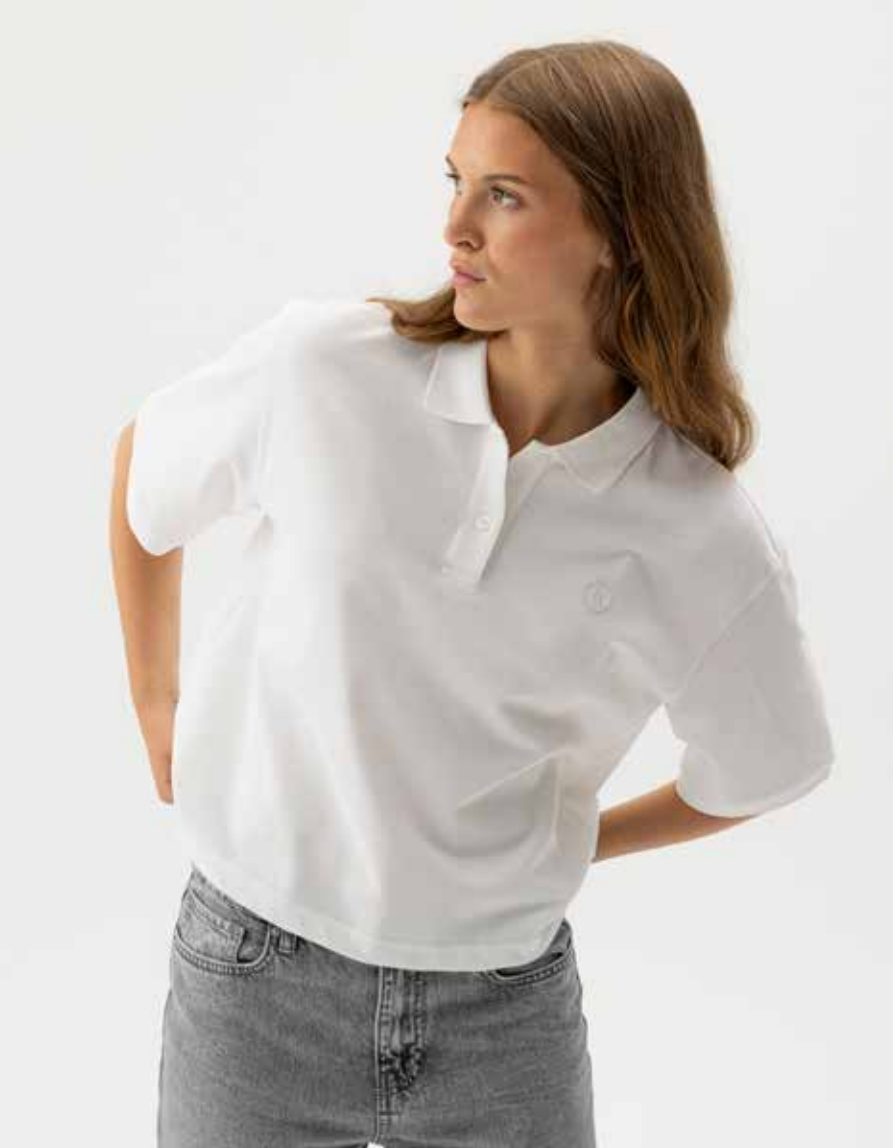
HANNA POLO S62502 Colours: White, Navy. Sizes: XS-XL Material: 100% Cotton