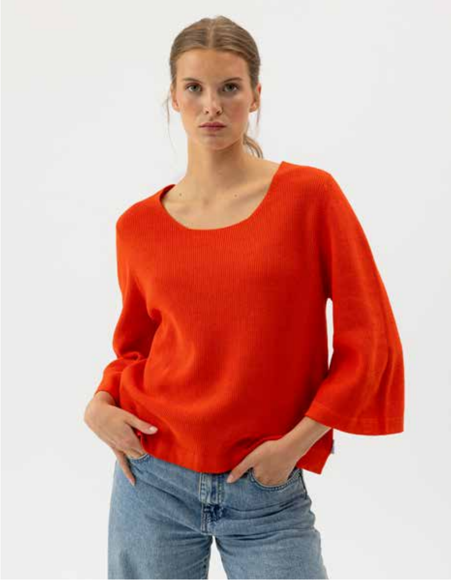
BELLE CREW S62401 Colours: Off White, Navy, Light Pink, Bright Red. Sizes: XS-XL Material: 100% Cotton