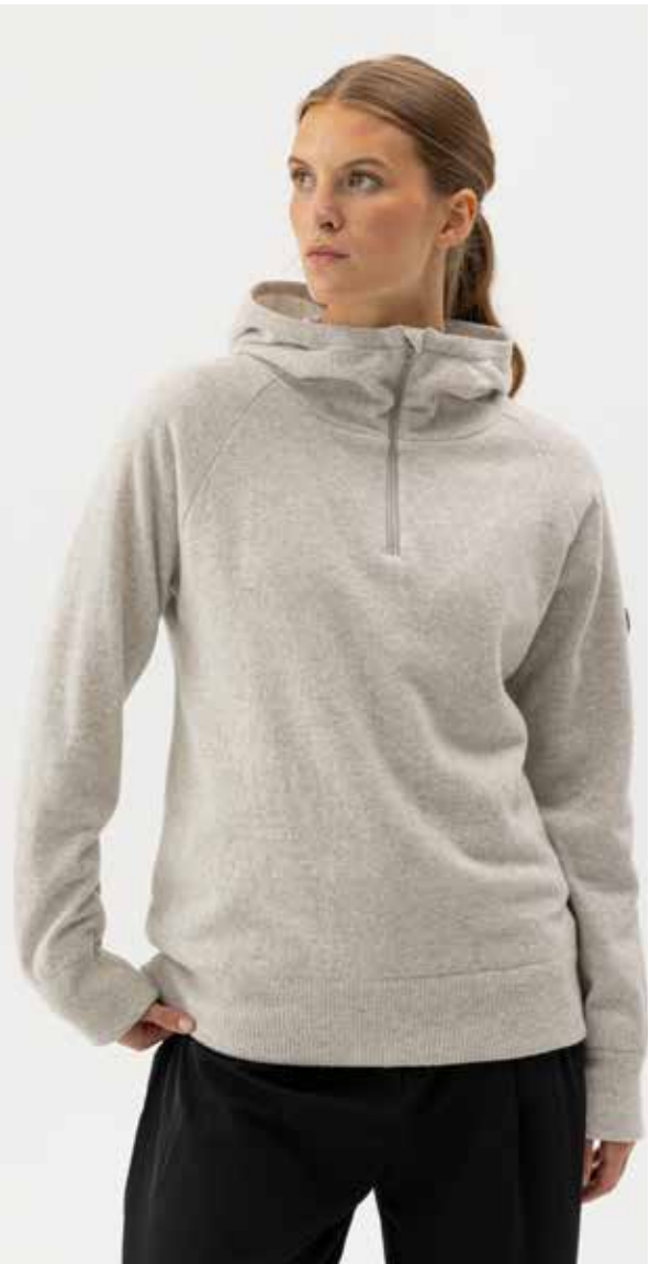
NILLA HOOD WP H62410 Colours: Light Grey Mel., Anthracite Mel. Sizes: XS-XL Material: 80% Wool, 20% Polyamide