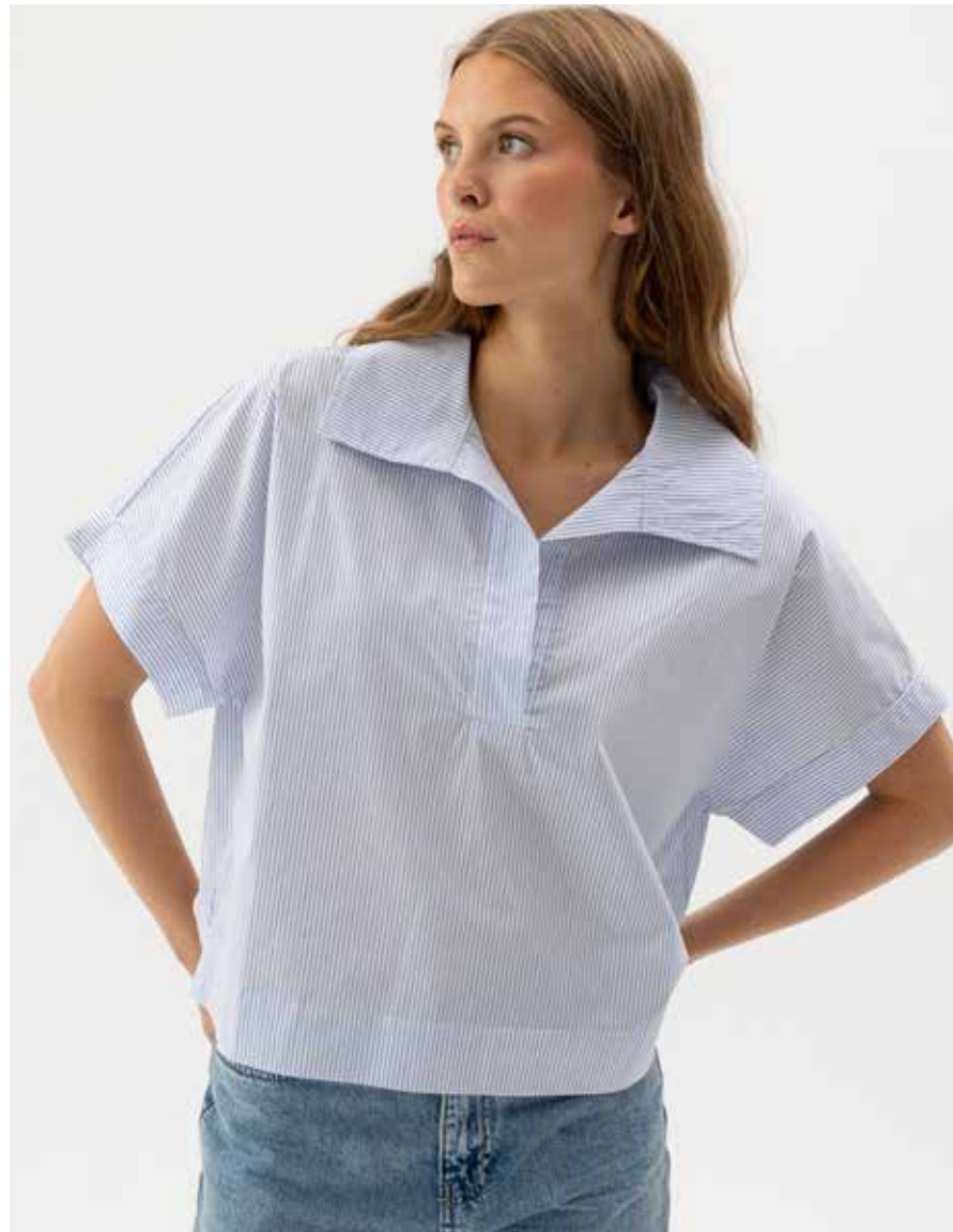
MARIE POP OVER TOP S62303 Colours: White/Light Blue, Navy, Navy/White. Sizes: XS-XL Material: 100% Cotton