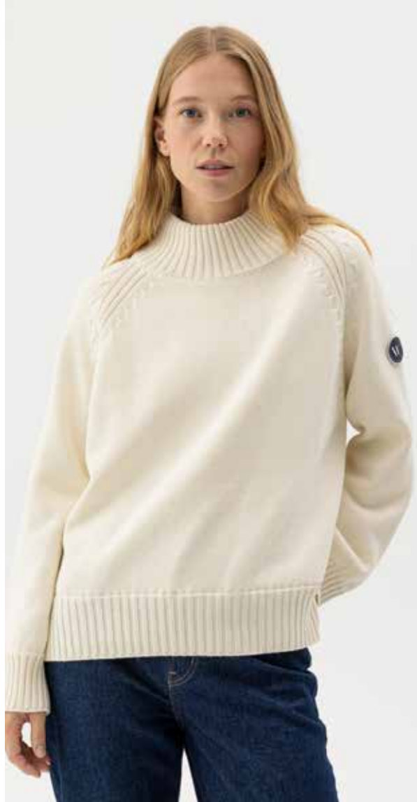
GERDA TURTLE WP H62402 Colours: Off White, Pale Blue, Navy, Black. Sizes: XS-XXL Material: 100% Cotton