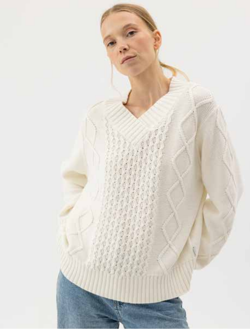
ILSE V-NECK S62420 Colours: Off White, Pale Blue. Sizes: XS-XL Material: 100% Cotton