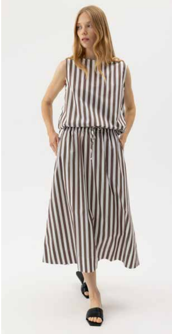
MARIE SKIRT S62611 Colours: Navy, Navy/White, Dark Brown/White. Sizes: XS-XL Material: 100% Cotton