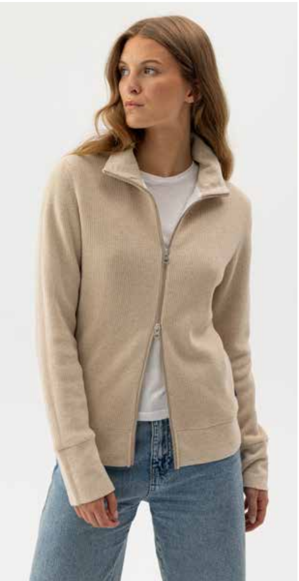
LISEN FULLZIP WP H62403 Colours: Oyster, Navy. Sizes: XS-XL Material: 100% Cotton