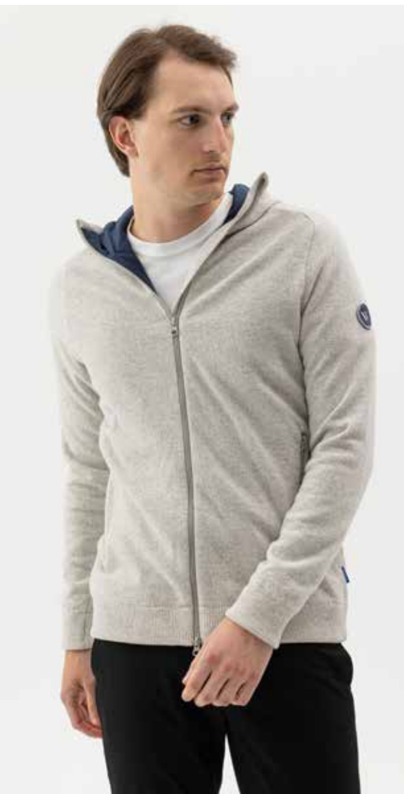
NOA HOOD WP H61410 Colours: Navy, Light Grey Mel. Sizes: S-XXL Material: 80% Wool, 20% Polyamide