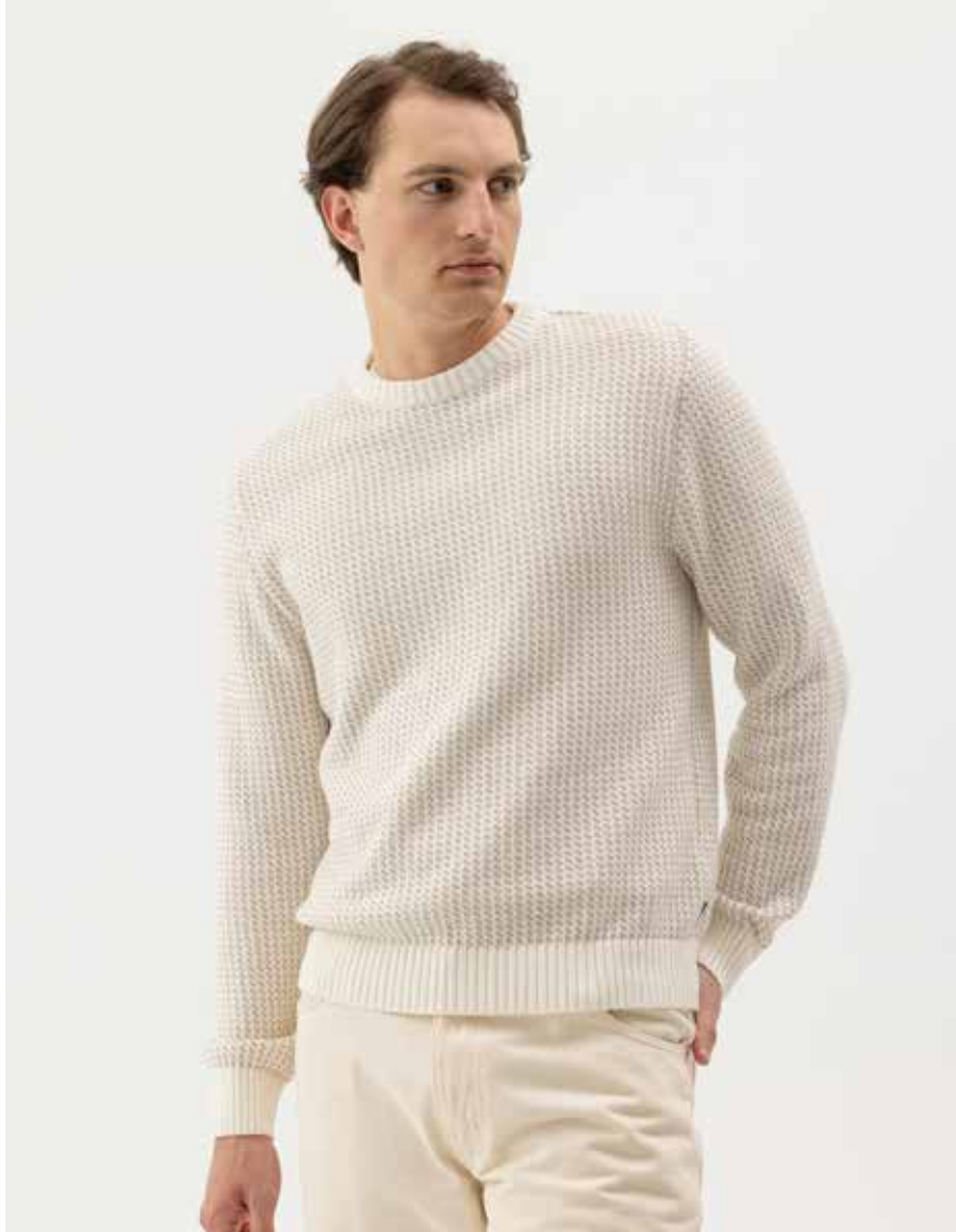
MATTEO CREW S41410 Colours: Off White/Navy, Off White/Khaki, Navy/Off White. Sizes: XS-XXXL Material: 100% Cotton