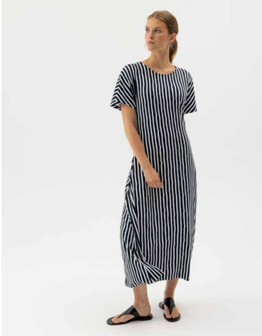
ELLEN CAPSLEEVE DRESS S62608 Colours: Navy, Navy/Off White, Navy Pattern, Black. Sizes: XS-XXL Material: 93% Viscose, 7% Elastane