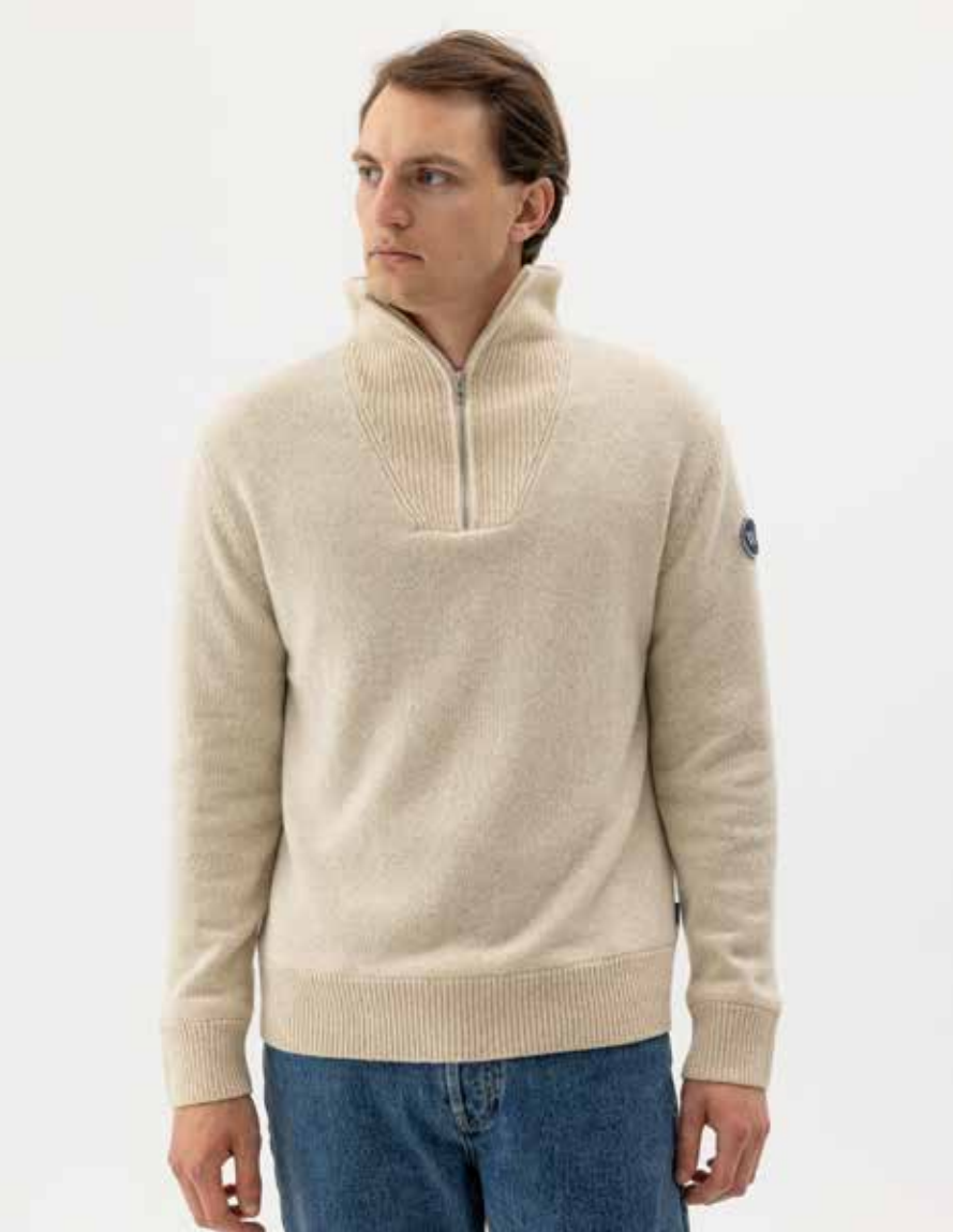
BOSSE T-NECK WP H61403 Colours: Creme, Navy. Sizes: S-XXXL Material: 80% Wool, 20% Polyamide