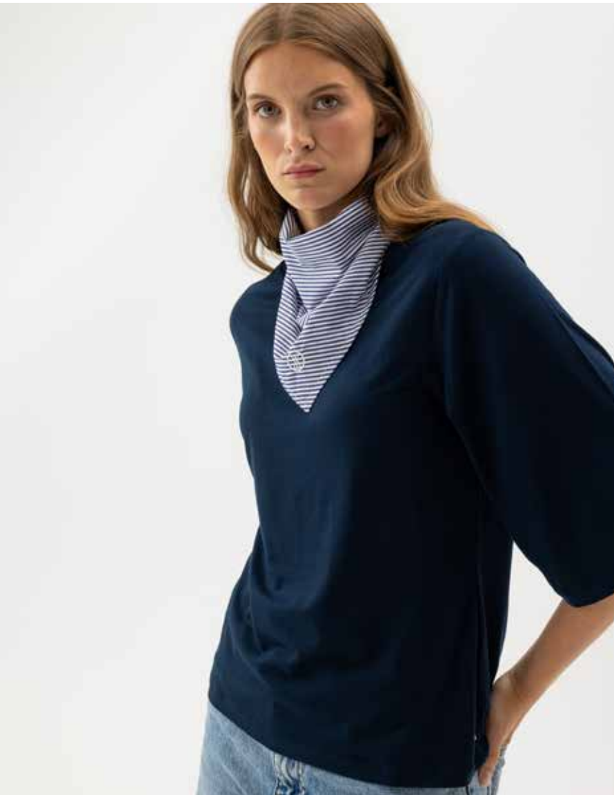
MARIE SCARF S64701 Colours: White/Light Blue, Navy/White, Dark Brown/White. Sizes: One Size Material: 100% Cotton