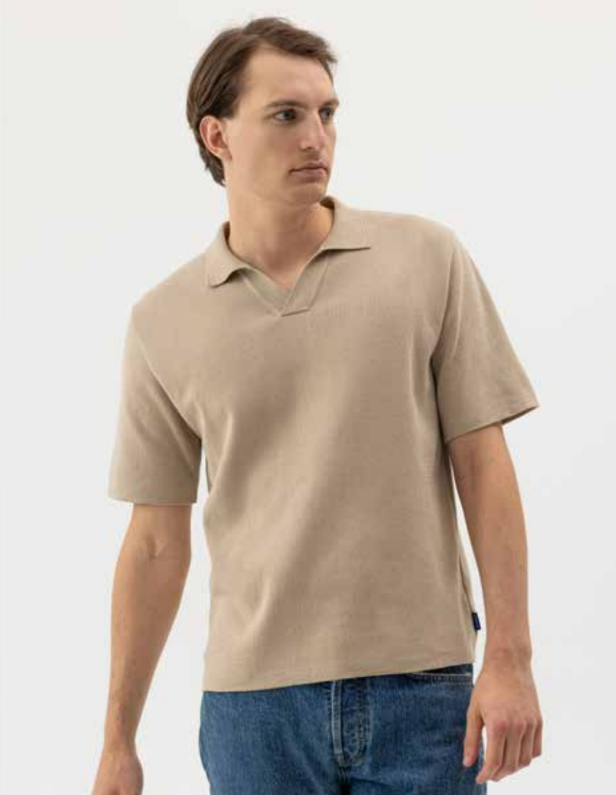
KRISTOFFER POLO S61411 Colours: Navy, Feather. Sizes: S-XXL Material: 100% Cotton