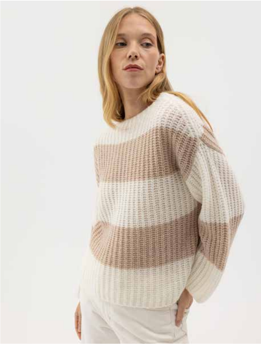
CAJSA SWEATER S32418 Colours: Off White/Black, Off White/Warm Sand, Regatta, Navy, Pale Pink. Sizes: XS-XL Material: 75% Extra Fine Merino Wool, 25% Polyamide