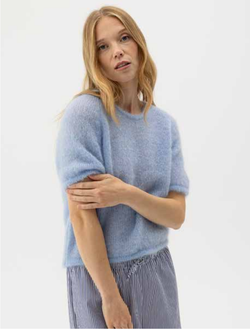
LILIAN TOP S62411 Colours: Light Blue, Pink, Sand. Sizes: XS-XL Material: 81% Kid Mohair (RMS), 17% Polyamide, 2% Elastane