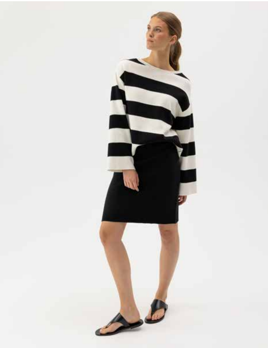
LISSIE SKIRT S62605 Colours: Navy/Off White, Khaki, Black. Sizes: XS-XL Material: 100% Cotton