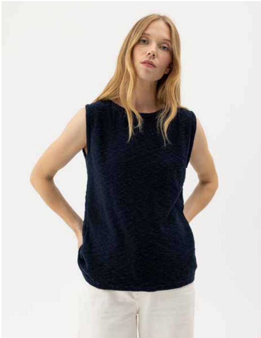
JUNI VEST S62410 Colours: White, Navy, Black. Sizes: XS-XL Material: 100% Cotton Slub