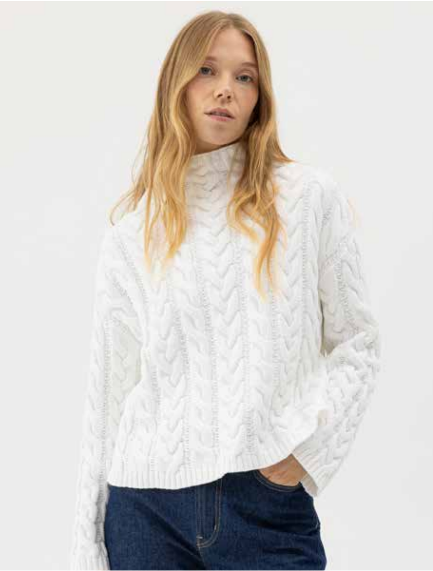
EMMIE TURTLE S62407 Colours: White, Navy, Straw. Sizes: XS-XXL Material: 100% Cotton