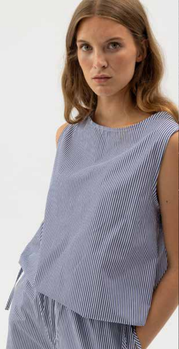
MARIE TOP S62301 Colours: White/Light Blue, Navy, Navy/White, Dark Brown/White. Sizes: XS-XL Material: 100% Cotton