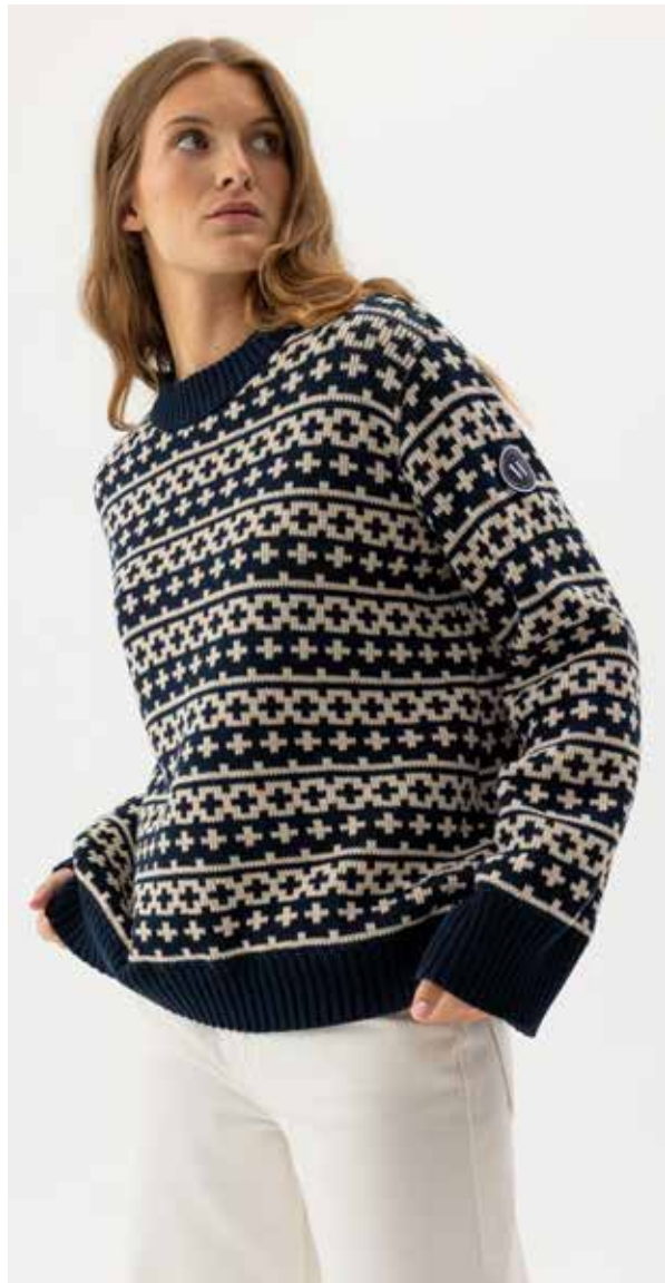
AUGUSTA CREW WP H62407 Colours: Off White/Khaki, Navy/Off White, Navy/Oyster. Sizes: XS-XXL Material: 100% Cotton