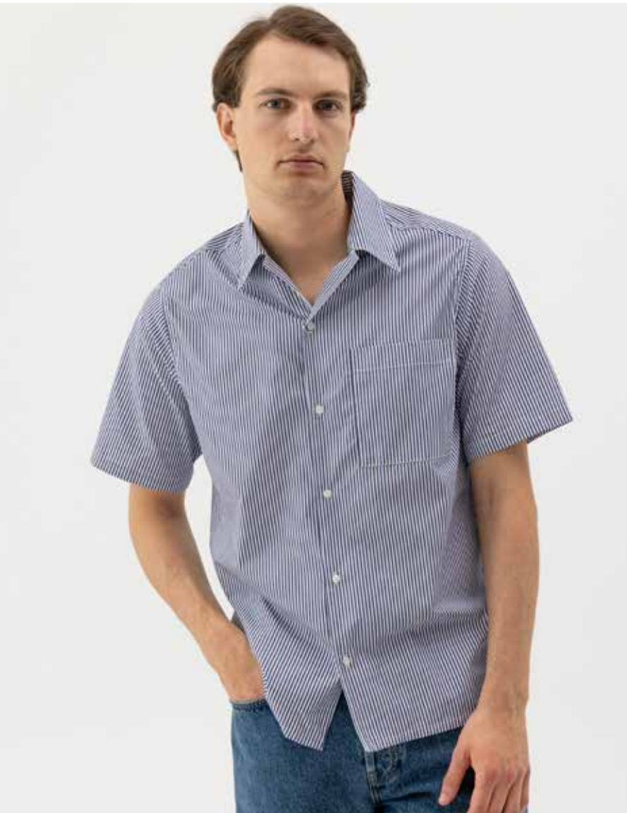
WILLIAM SHIRT S51302 Colours: Navy, Navy/White. Sizes: S-XXL Material: 100% Cotton