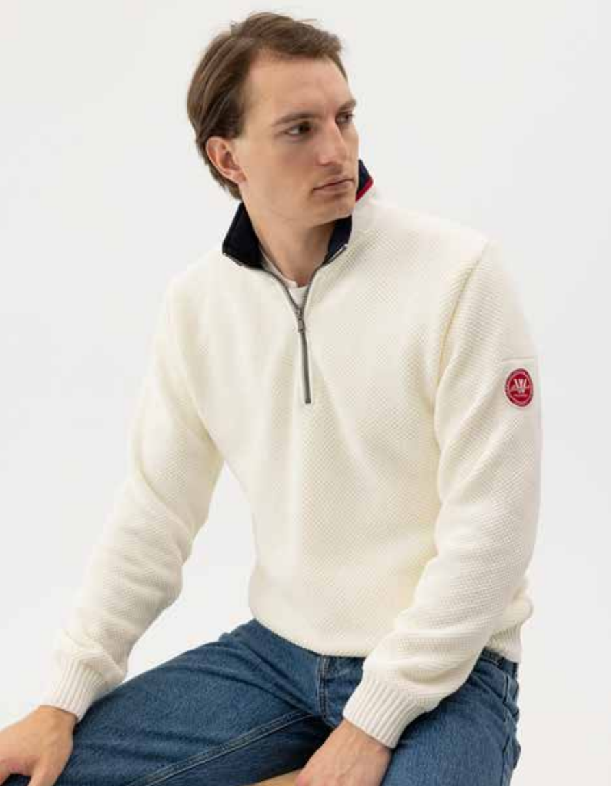
CLASSIC WP 111400 Colours: Off White, Off White Mel., Pale Blue, Navy, Red, Khaki, Black. Sizes: XS-XXXL Material: 100% Cotton