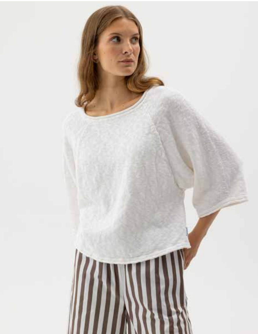
JUNI BOXY TOP S62402 Colours: White, Navy, Straw, Black. Sizes: XS-XL Material: 100% Cotton Slub