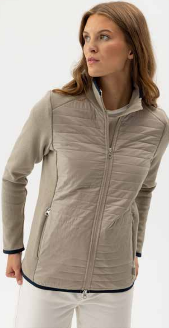
MIMMI FULLZIP WP H02411 Colours: Off White/Navy, Navy, Feather, Black Mel. Sizes: XS-XXL Material: 100% Cotton + Quilt