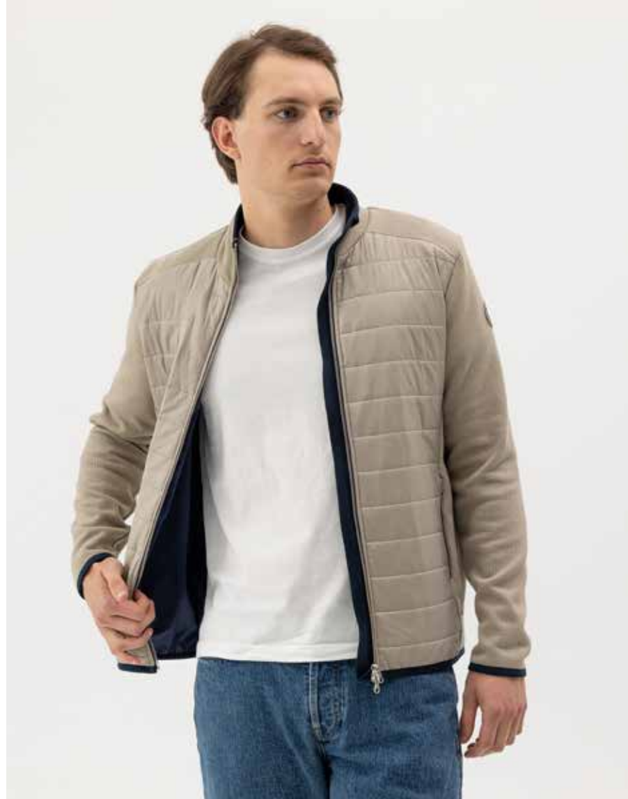
PEDER FULLZIP WP H01406 Colours: Navy/Khaki, Navy, Feather, Black Mel. Sizes: S-XXXL Material: 100% Cotton + Quilt