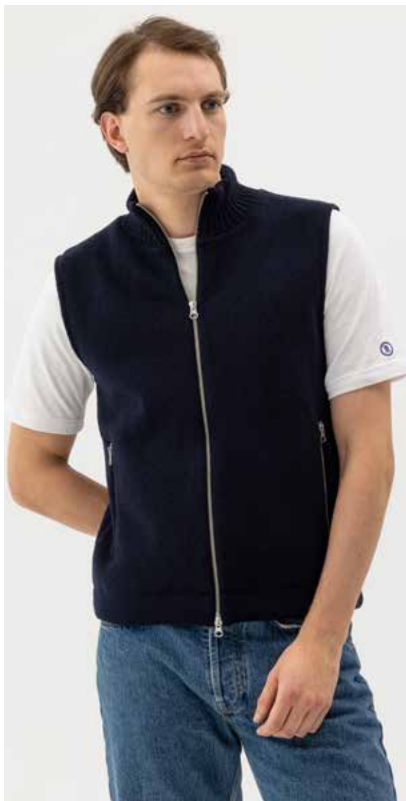
FRED VEST WP H61404 Colours: Navy, Light Grey Mel. Sizes: S-XXXL Material: 80% Wool, 20% Polyamide