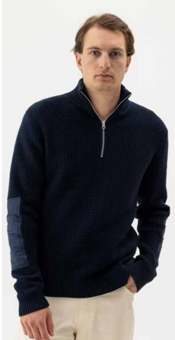
WILGOT T-NECK WP H61408 Colours: Off White/Navy, Navy. Sizes: S-XXXL Material: 100% Cotton