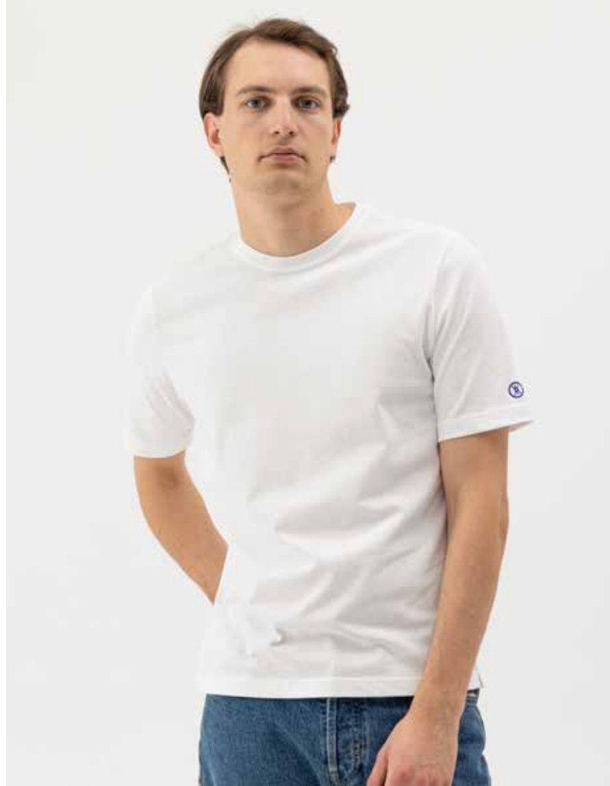
KLASSE TEE S41503 Colours: White, Navy, Fade Yellow, Feather. Sizes: S-XXXL Material: 100% Cotton