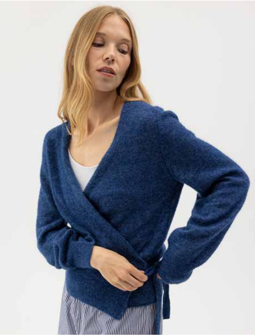
ELIZABETH OVERLAP S62404 Colours: Chambray, Light Grey Mel. Sizes: XS-XL Material: 70% Alpaca Superfine, 30% Polyamide