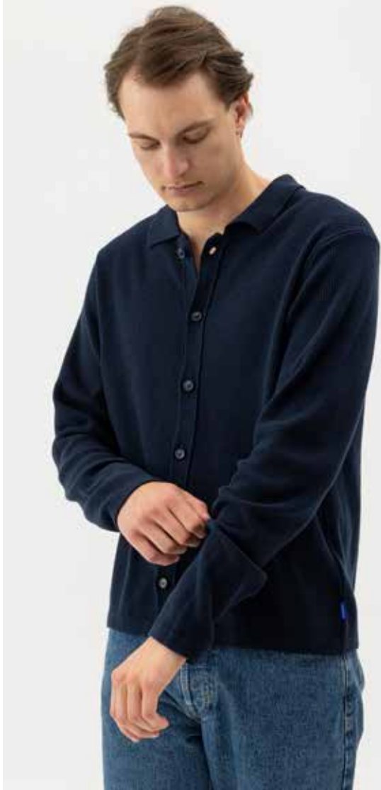
TOM SHIRT S61406 Colours: Navy. Sizes: S-XXL Material: 100% Cotton