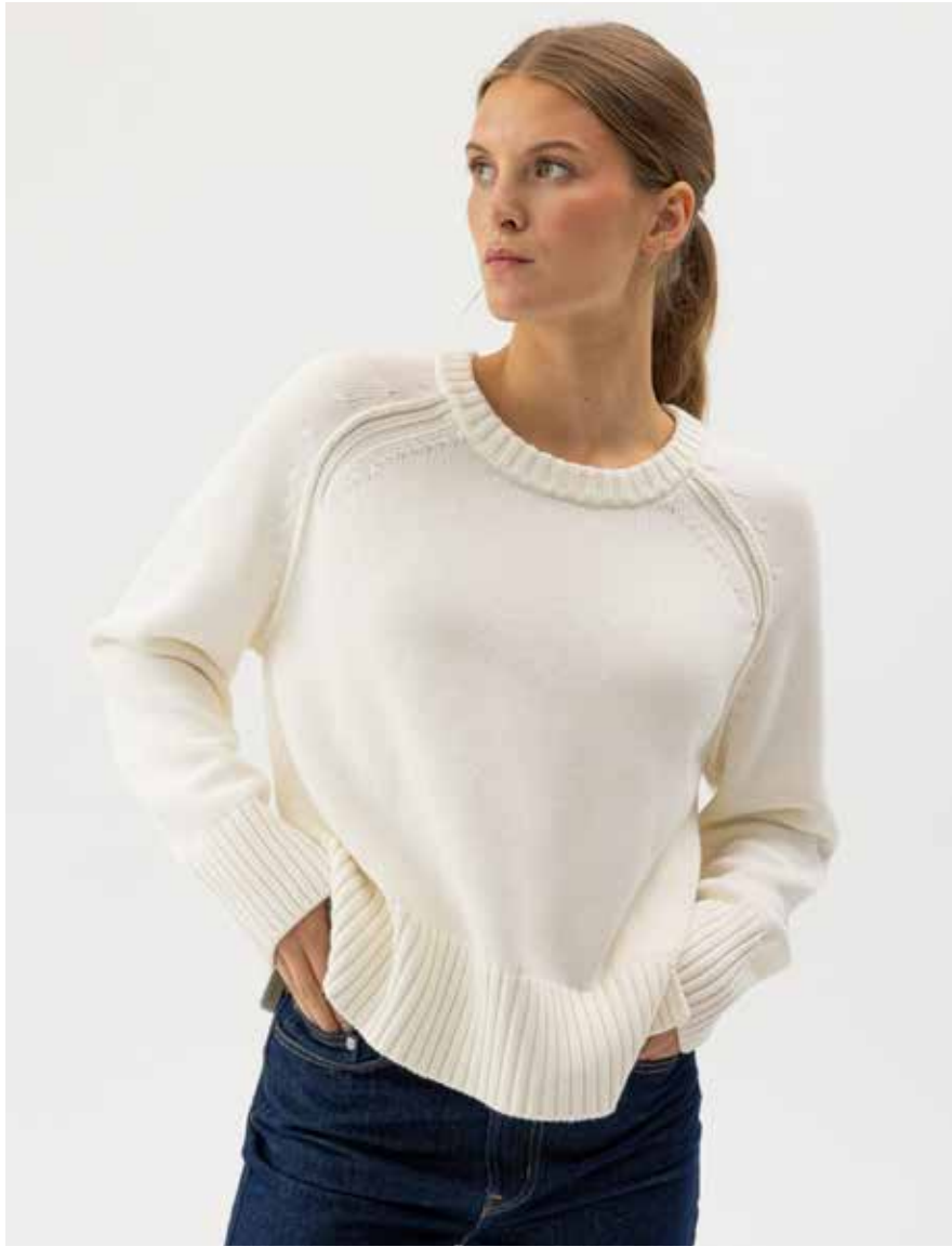
MEG CREW S62409 Colours: Off White, Pale Blue, Navy, Light Pink. Sizes: XS-XXL Material: 100% Cotton