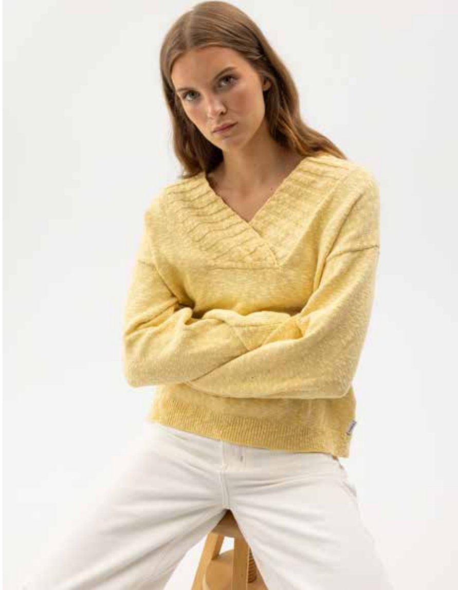
JUNI V-NECK S62403 Colours: White, Straw, Black. Sizes: XS-XXL Material: 100% Cotton Slub