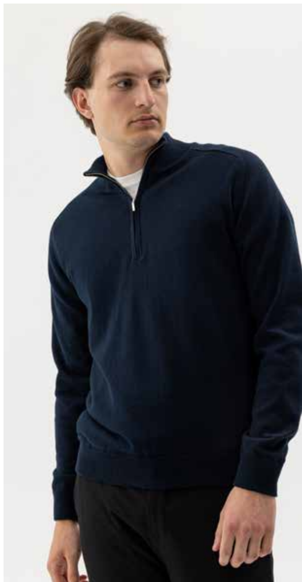
LUDVIG T-NECK WP H51401 Colours: Off White Mel., Navy. Sizes: S-XXXL Material: 100% Cotton