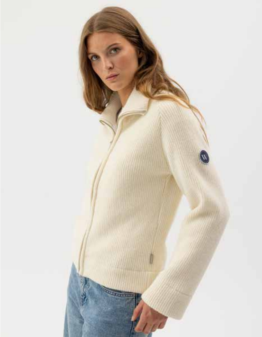
ESSIE FULLZIP WP H62409 Colours: Whisper White, Black. Sizes: XS-XL Material: 80% Wool, 20% Polyamide