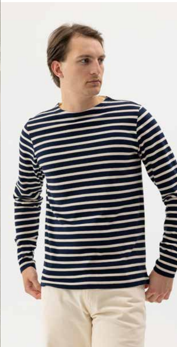
OLIVER BOATNECK S41505 Colours: Ecru/Navy, Navy/Ecru. Sizes: S-XXXL Material: 100% Cotton