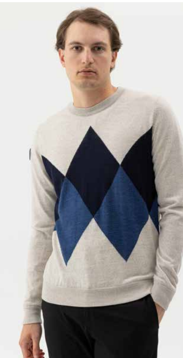
JESPER CREW WP H41412 Colours: Dark Navy, Light Grey Multi Col., Light Grey Mel., Black. Sizes: S-XXXL Material: 100% Extra Fine Merino Wool