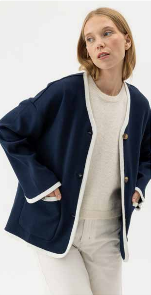
LEE JACKET S62101 Colours: Off White, Navy. Sizes: XS-XL Material: 100% Cotton