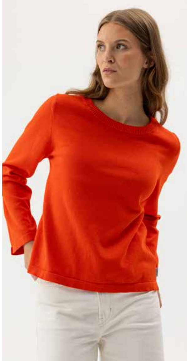
HULDA CREW A32416 Colours: White, Navy, Bright Red, Black. Sizes: XS-XXL Material: 100% Cotton