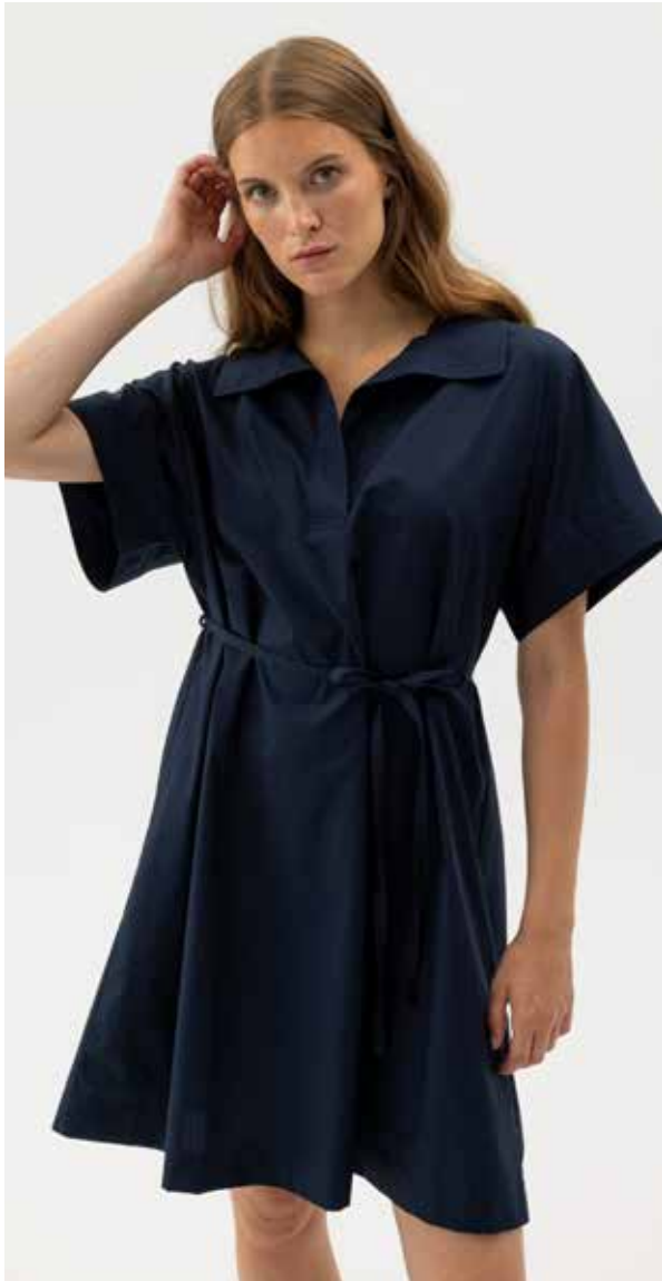
MARIE TUNIC DRESS S62612 Colours: White/Light Blue, Navy, Navy/White, Dark Brown/White. Sizes: XS-XL Material: 100% Cotton