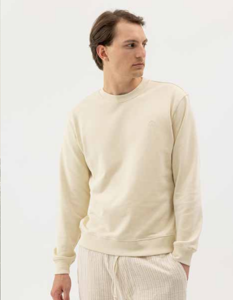
TURE SWEATER S61501 Colours: Birch, Navy. Sizes: S-XXL Material: 100% Cotton