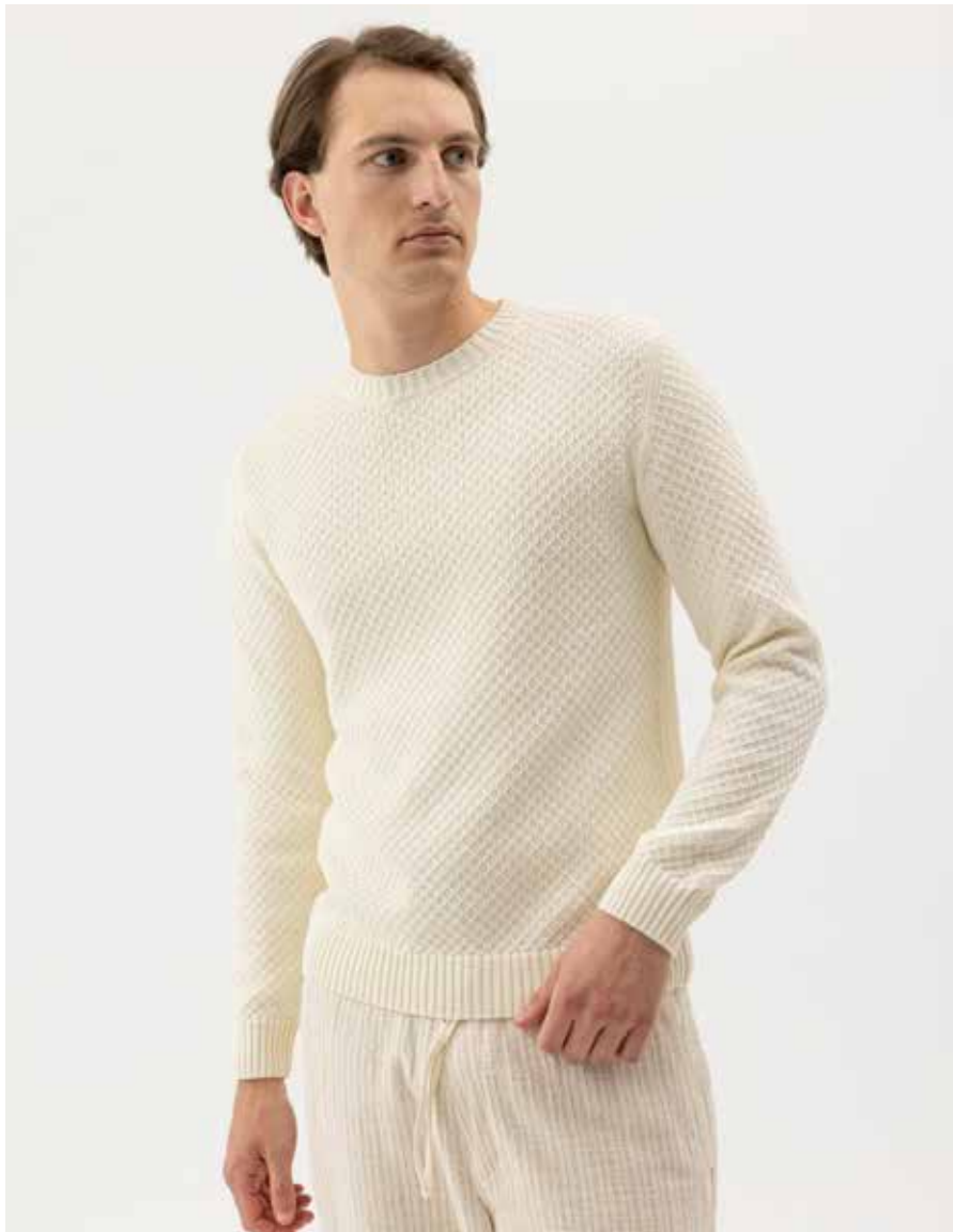
THEO CREW S61413 Colours: Off White. Sizes: S-XXL Material: 100% Cotton