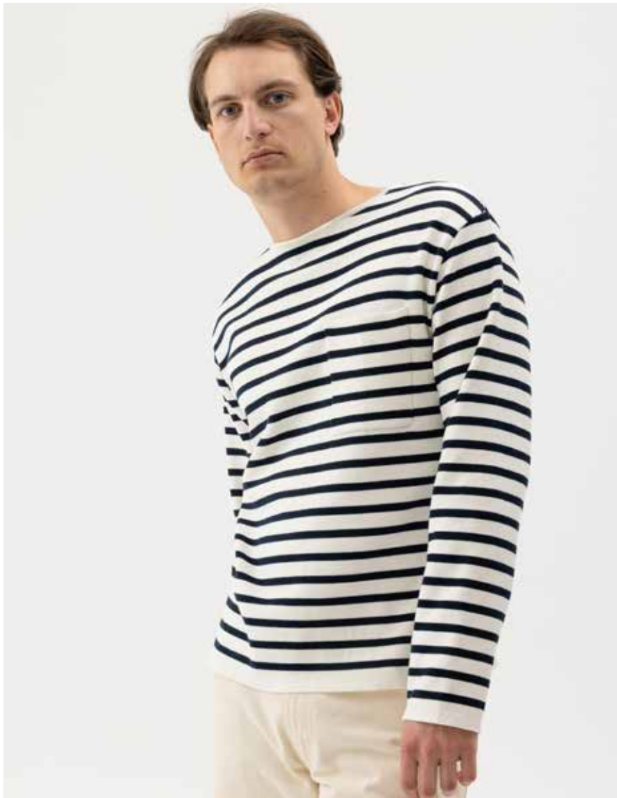
ROD SWEATER S61402 Colours: Off White/Navy, Pale Blue, Navy. Sizes: S-XXL Material: 100% Cotton