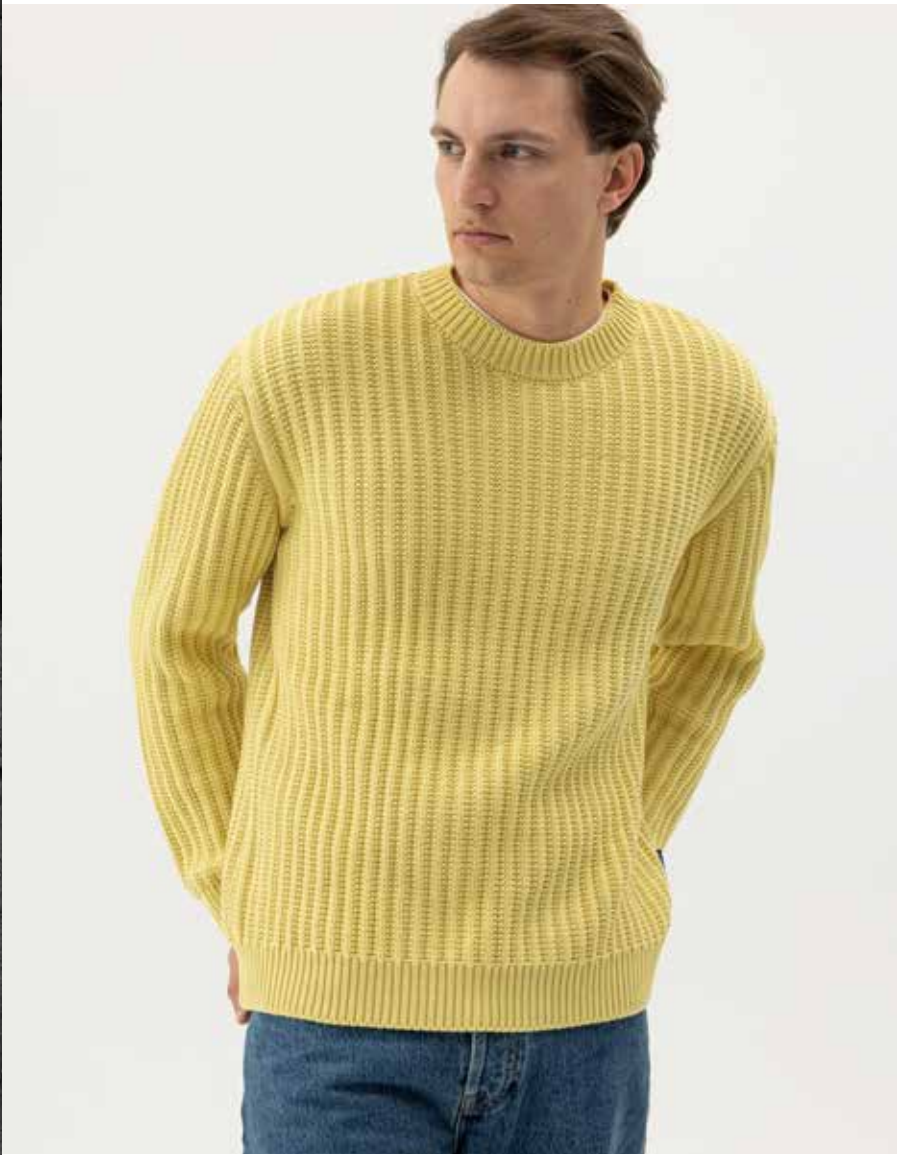
RAFAEL CREW S61401 Colours: Off White, Pale Blue, Navy, Fade Yellow. Sizes: S-XXL Material: 100% Cotton