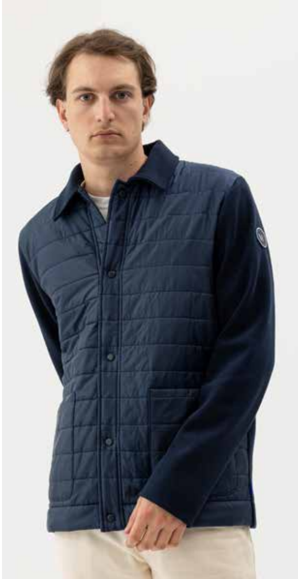
DANNY JACKET WP H61101 Colours: Navy, Black. Sizes: S-XXXL Material: 100% Cotton + Quilt