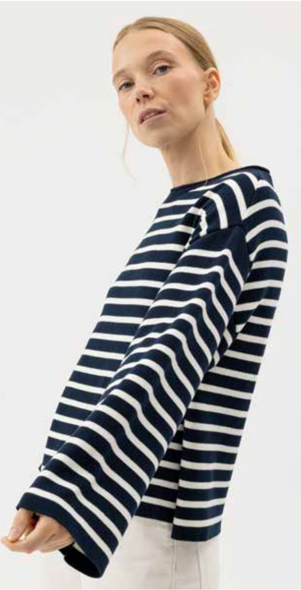
LISSIE SWEATER S62413 Colours: Off White/Black, Off White/Khaki, Navy/Off White. Sizes: XS-XXL Material: 100% Cotton