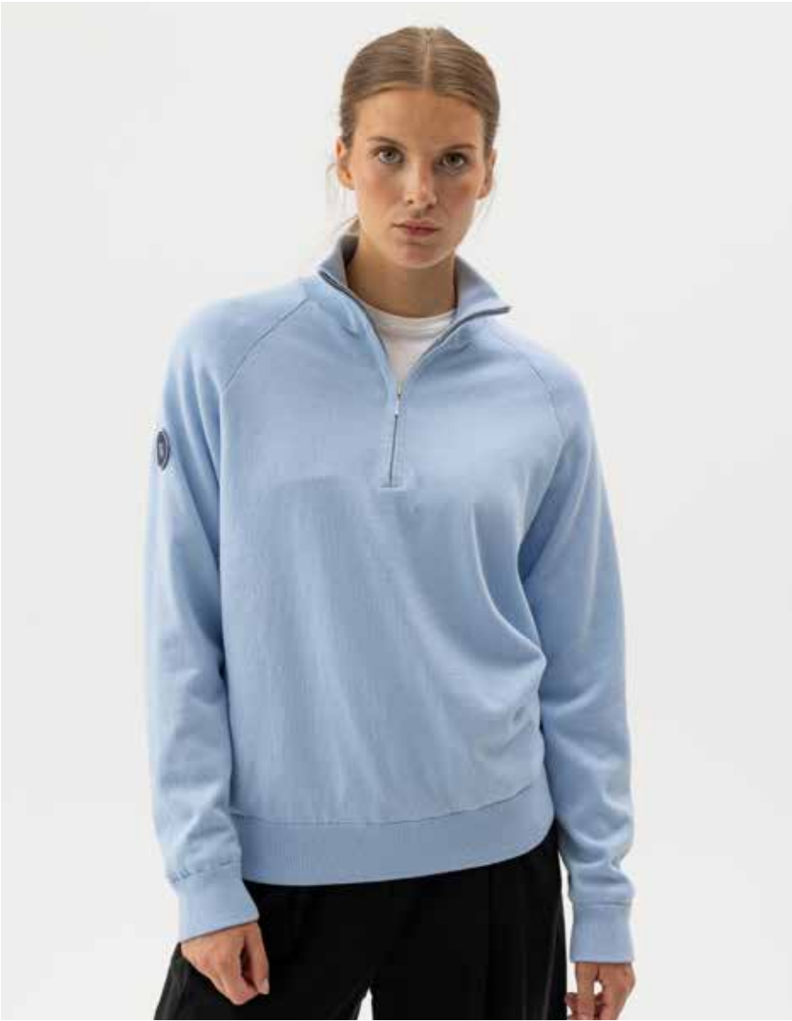
LAURA T-NECK WP H52407 Colours: Pale Blue, Navy. Sizes: XS-XXL Material: 100% Cotton