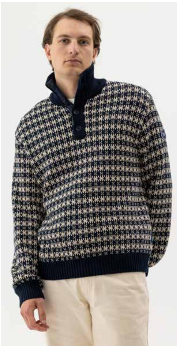
SVERRE T-NECK WP H61405 Colours: Off White/Navy, Navy/Oyster. Sizes: S-XXXL Material: 100% Cotton