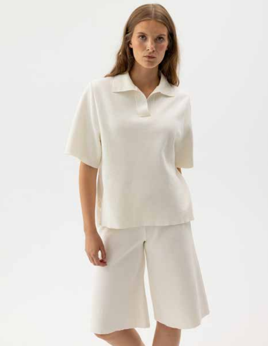
LISSIE BERMUDA S62205 Colours: Off White, Navy, Black. Sizes: XS-XL Material: 100% Cotton