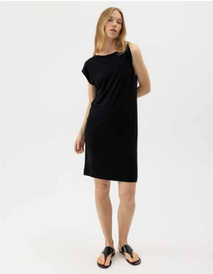
ELLEN MINI DRESS S62609 Colours: White/Navy, Bright Red, Navy, Black. Sizes: XS-XXL Material: 93% Viscose, 7% Elastane