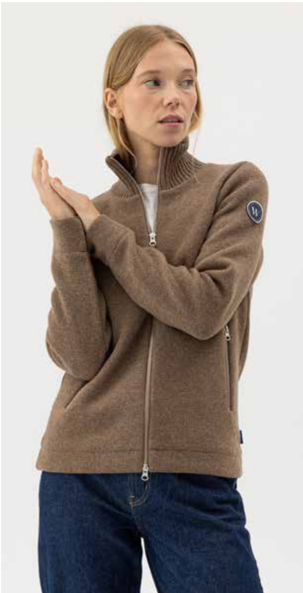
CLAIRE FULLZIP WP H02410 Colours: Dark Blue, Flamingo, Walnut. Sizes: XS-XXL Material: 80% Wool, 20% Polyamide