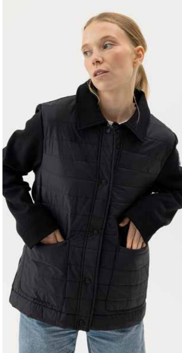
SANDY JACKET WP H62101 Colours: Feather, Black. Sizes: XS-XXL Material: 100% Cotton + Quilt