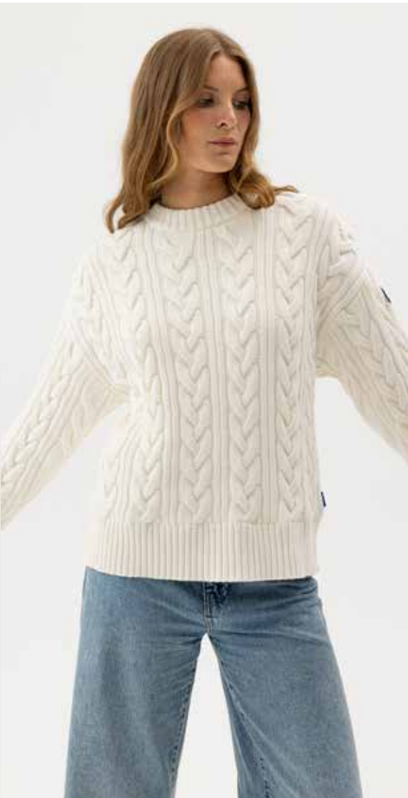
JUNO CREW WP H62405 Colours: Off White, Navy. Sizes: XS-XXL Material: 100% Cotton