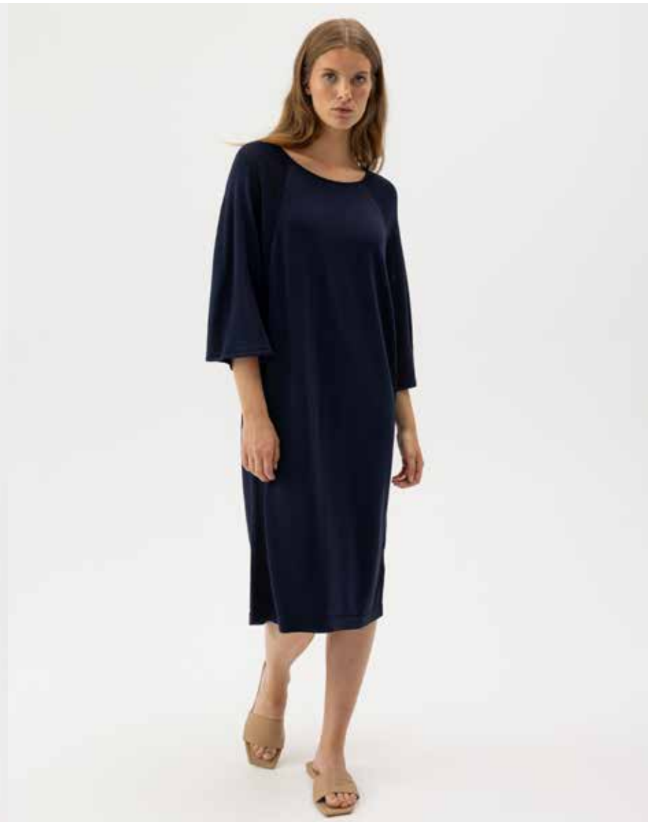
MARILYN DRESS S62613 Colours: Regatta, Navy. Sizes: XS-XL Material: 80% Viscose, 20% Polyamide