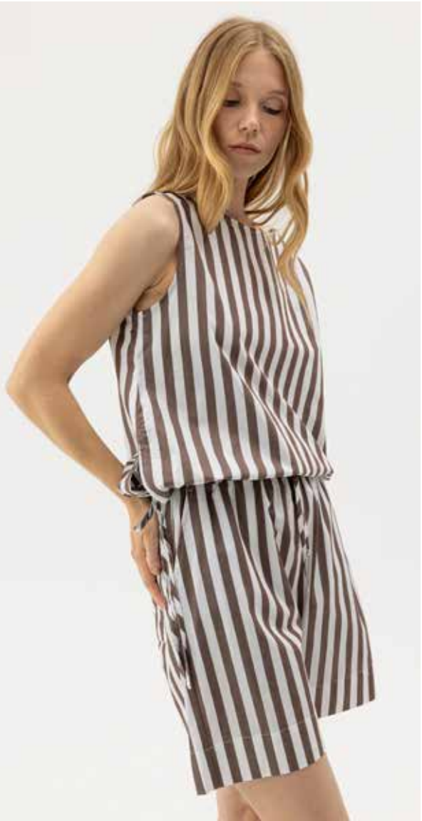
MARIE SHORTS S62204 Colours: White/Light Blue, Navy, Navy/White, Dark Brown/White. Sizes: XS-XL Material: 100% Cotton