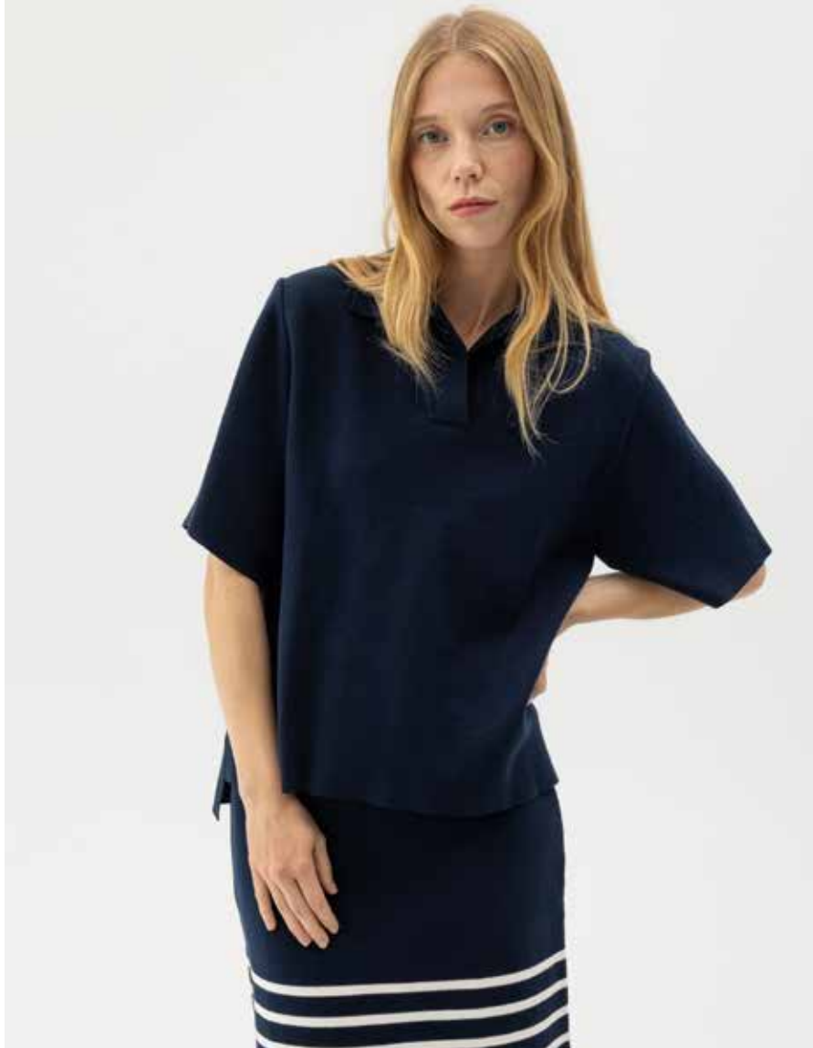
LISSIE TOP S62412 Colours: Off White, Navy, Khaki. Sizes: XS-XL Material: 100% Cotton