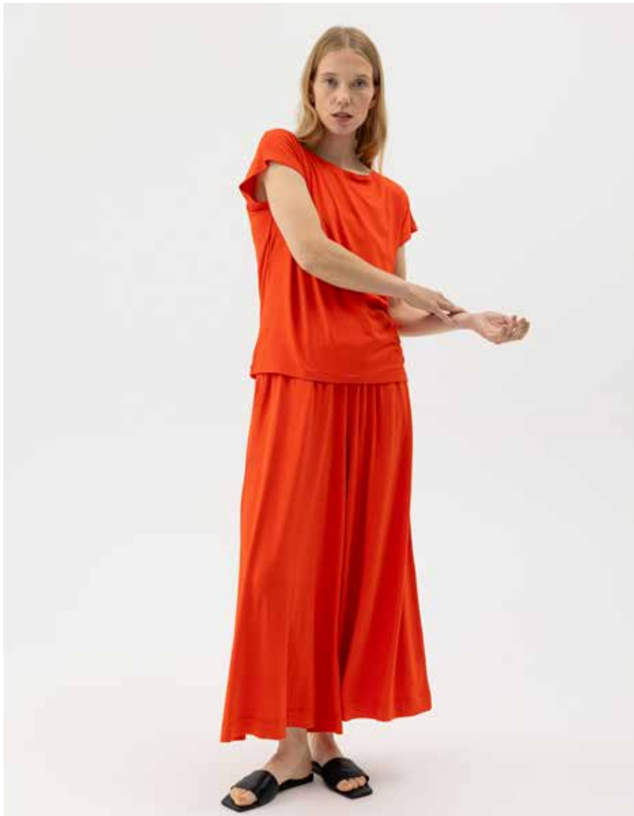
ELLEN SKORT S62202 Colours: Navy, Navy/Off White, Bright Red, Navy Pattern, Black. Sizes: XS-XXL Material: 93% Viscose, 7% Elastane