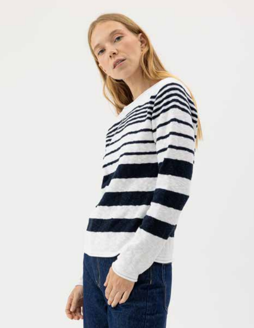
JUNI BOATNECK S52418 Colours: White, White/Navy, Navy Multi Col. Sizes: XS-XXL Material: 100% Cotton Slub