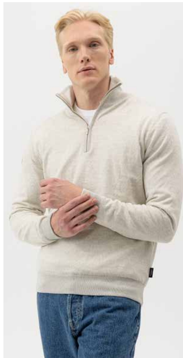
JESPER T-NECK WP H41411 Colours: Dark Navy, Light Grey Mel., Black. Sizes: S-XXXL Material: 100% Extra Fine Merino Wool