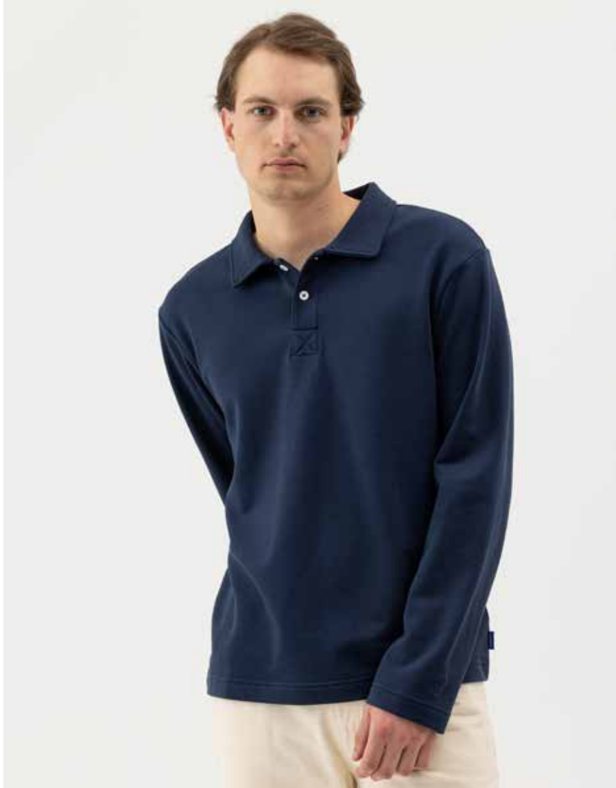
TURE T-NECK S61502 Colours: Birch, Navy. Sizes: S-XXL Material: 100% Cotton