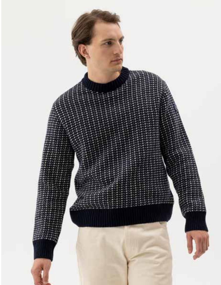
HILMER CREW WP H61409 Colours: Navy/Sand, Light Grey Mel/Anthracite Mel. Sizes: S-XXXL Material: 80% Wool, 20% Polyamide