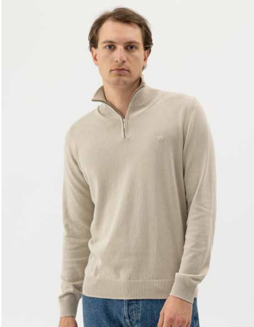
HOLGER T-NECK A11414 Colours: Navy, Feather, Black. Sizes: S-XXXL Material: 100% Cotton