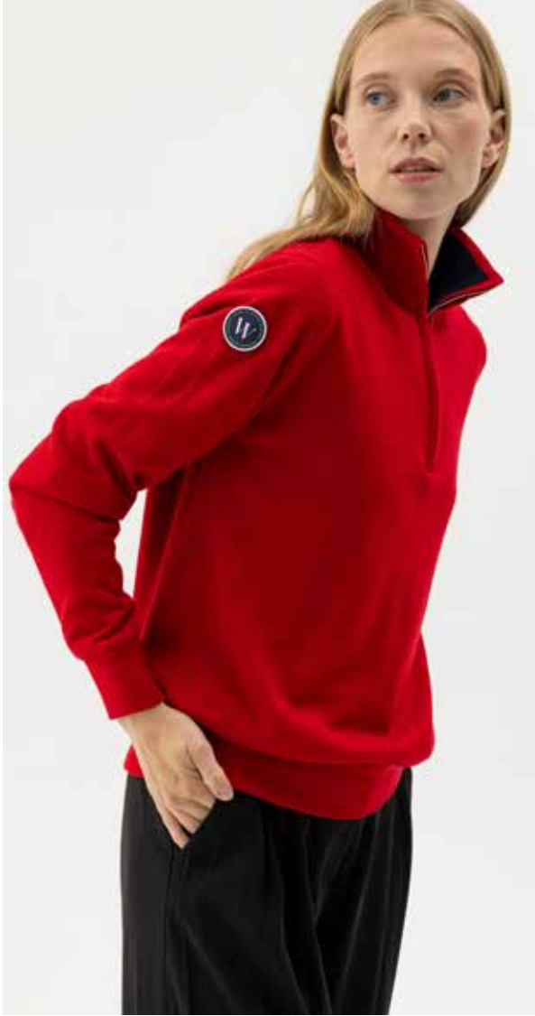
NELLY T-NECK WP H52402 Colours: Red, Dark Navy, Light Grey Mel. Sizes: XS-XXL Material: 100% Extra Fine Merino Wool