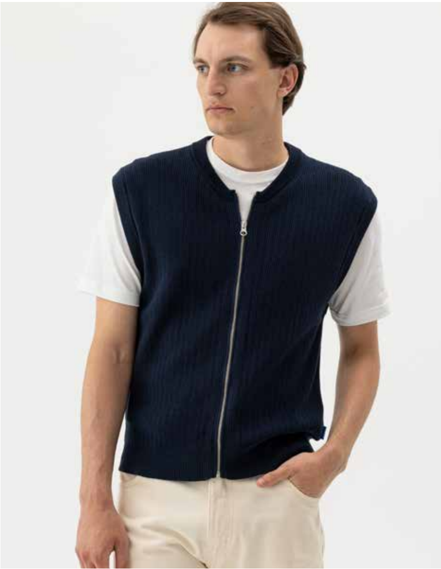
ALVAR VEST S61410 Colours: Navy, Feather. Sizes: S - XXL Material: 100% Cotton