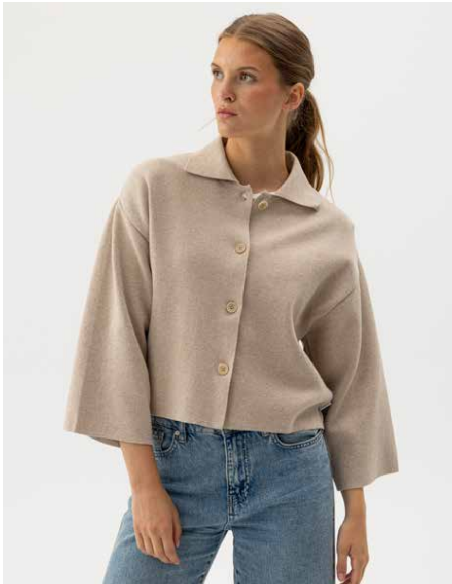
JANE JACKET S52101 Colours: Off White, Navy, Khaki, Black. Sizes: XS-XXL Material: 100% Cotton