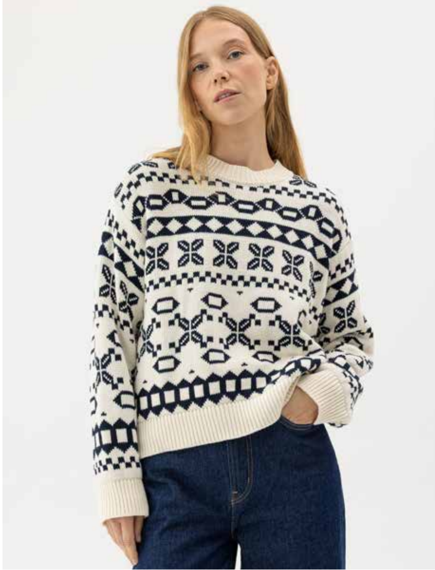
NOVALI CREW S62415 Colours: Off White/Navy. Sizes: XS-XL Material: 100% Cotton