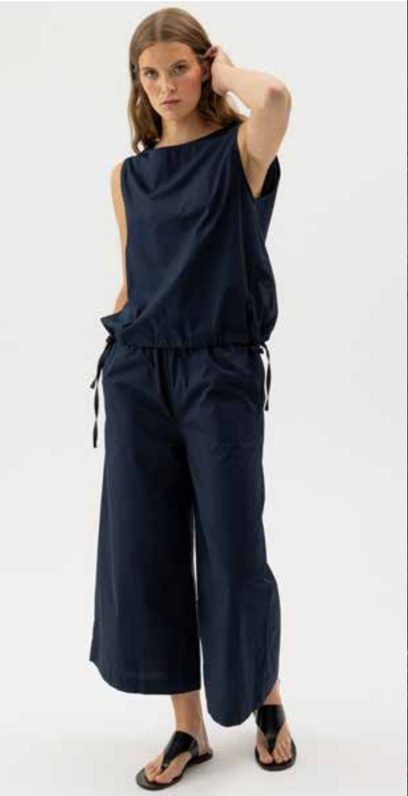
MARIE WIDE PANTS S62203 Colours: Navy, Navy/White, Dark Brown/White. Sizes: XS-XL Material: 100% Cotton