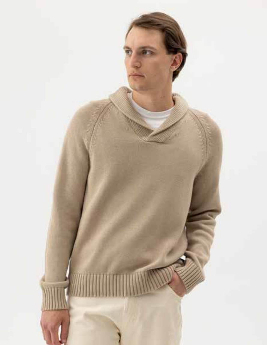
ROGER SHAWL COLLAR S61403 Colours: Navy, Feather. Sizes: S-XXL Material: 100% Cotton