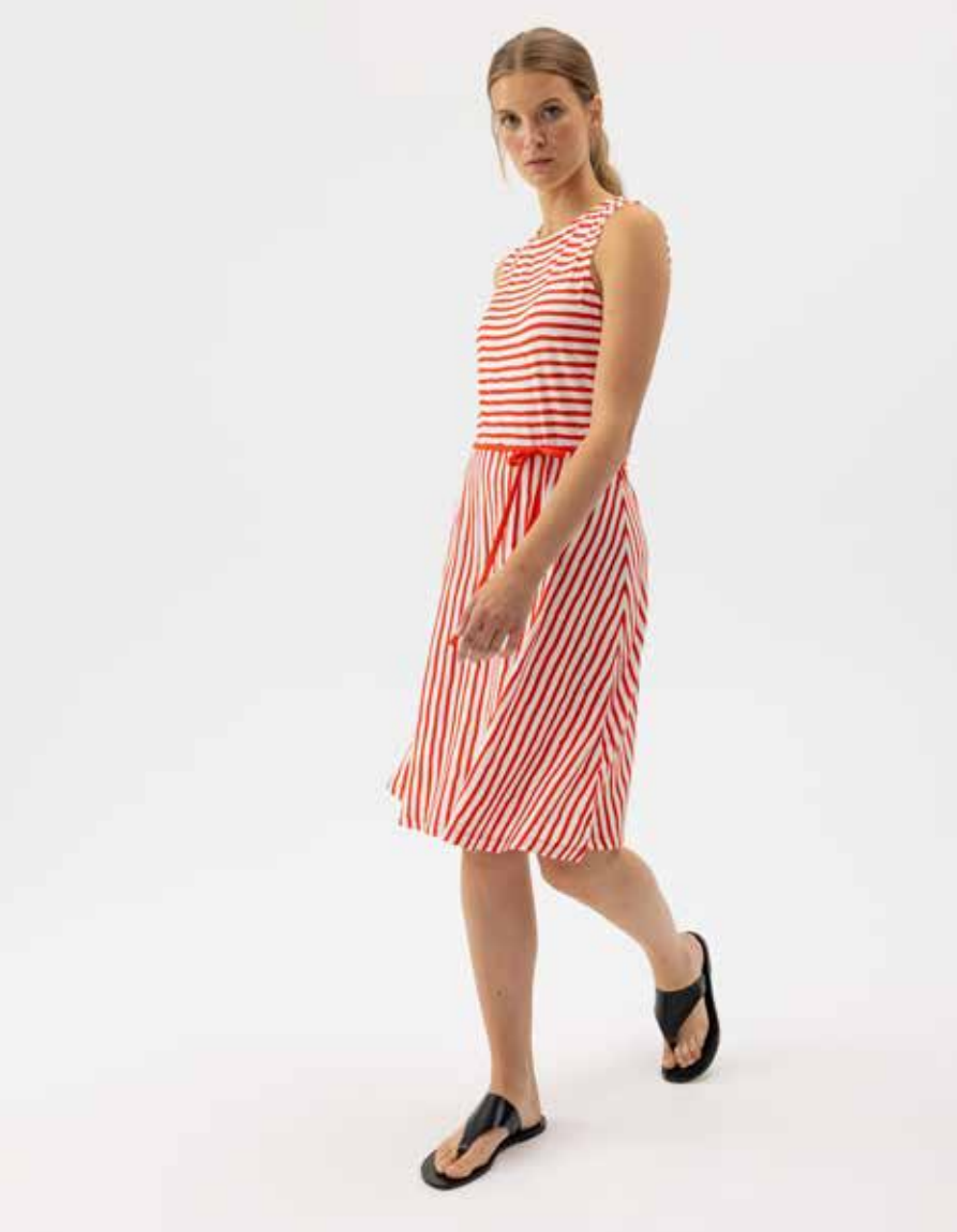
ELLEN DRESS S62614 Colours: Off White/Bright Red, Navy, Navy/Off White, Navy Pattern, Black. Sizes: XS-XXL Material: 93% Viscose, 7% Elastane