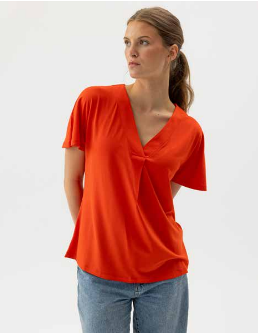
ELLEN V-NECK TOP S62504 Colours: Off White, Navy, Bright Red, Navy Pattern, Black. Sizes: XS-XXL Material: 93% Viscose, 7% Elastane