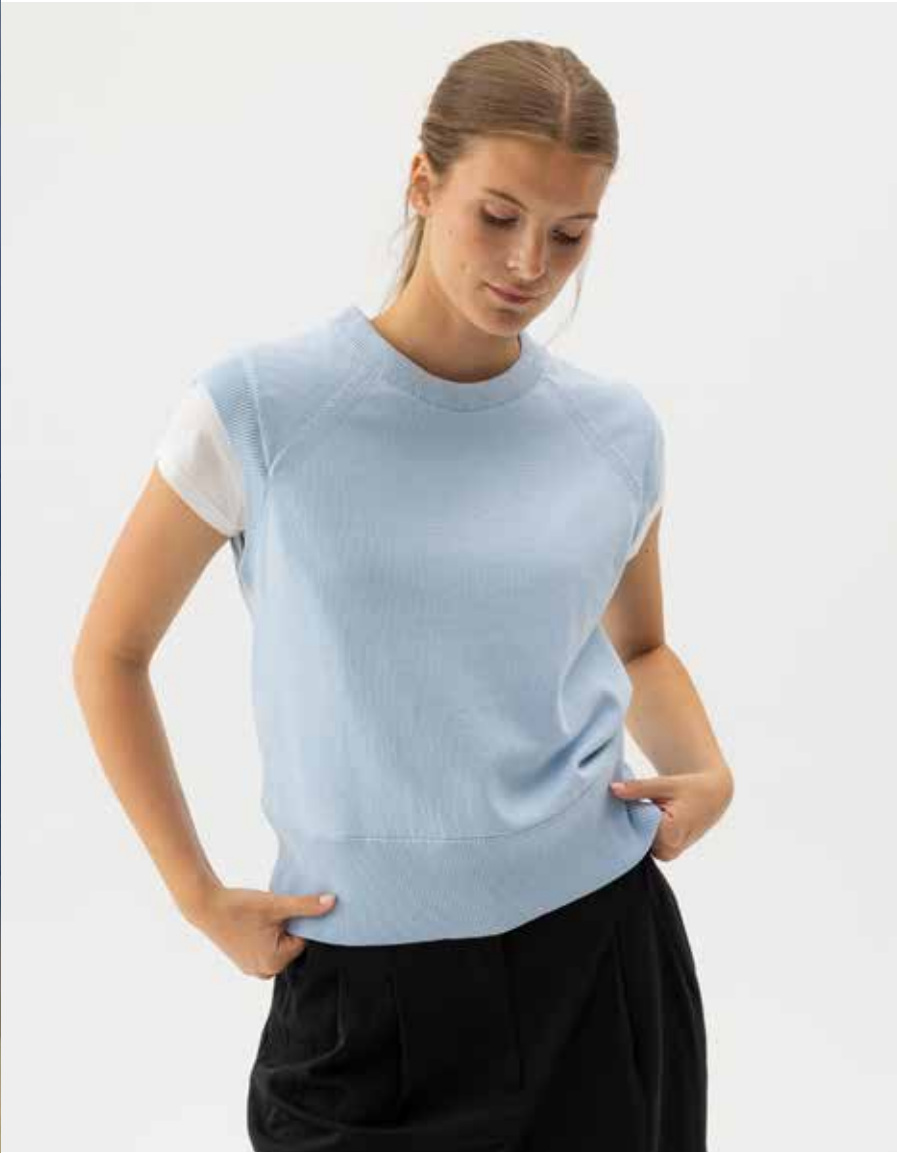
LAURA VEST WP H62406 Colours: Pale Blue, Navy. Sizes: XS-XXL Material: 100% Cotton