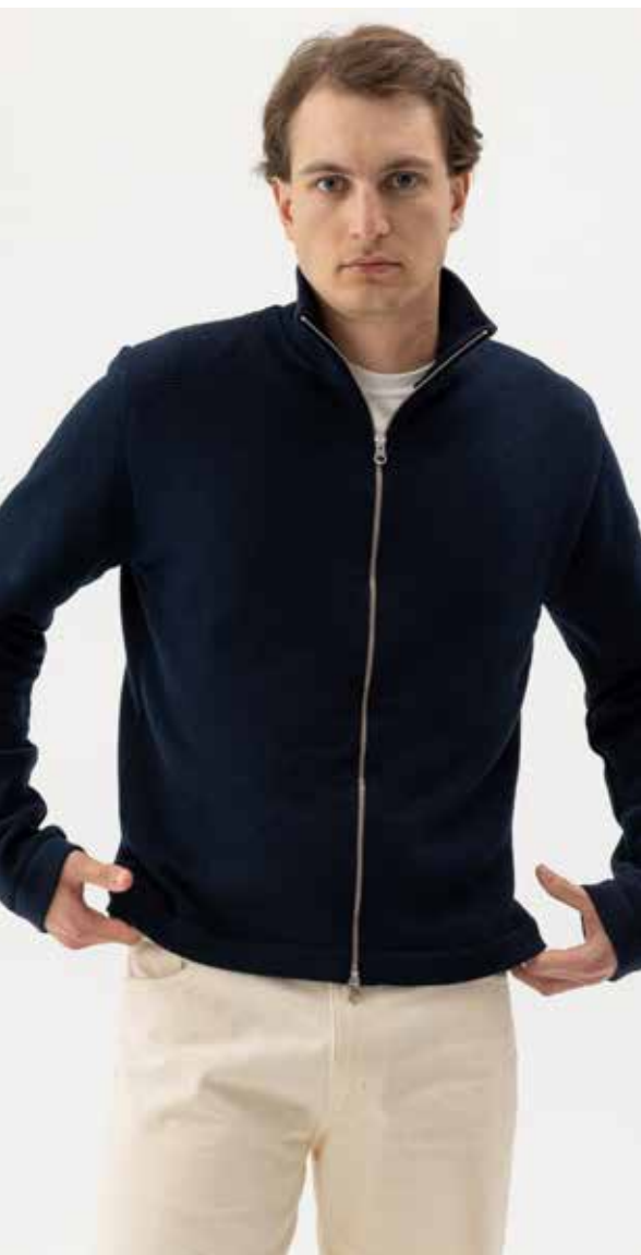
ALBREKT FULLZIP WP H61406 Colours: Navy, Light Grey Mel. Sizes: S-XXXL Material: 100% Cotton