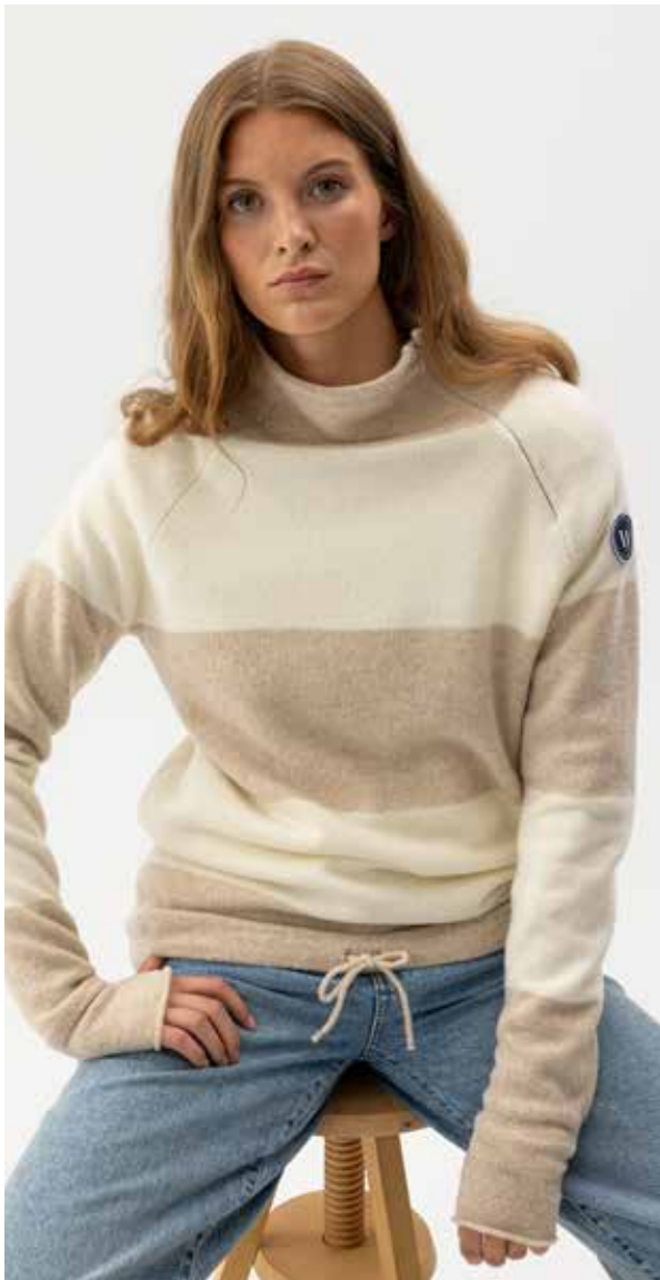
MARTINA WP 852423 Colours: Oxford, Navy, Flamingo, Sand/Off White, Light Grey Mel., Black/Sand, Black. Sizes: XS-XXL Material: 80% Wool, 20% Polyamide