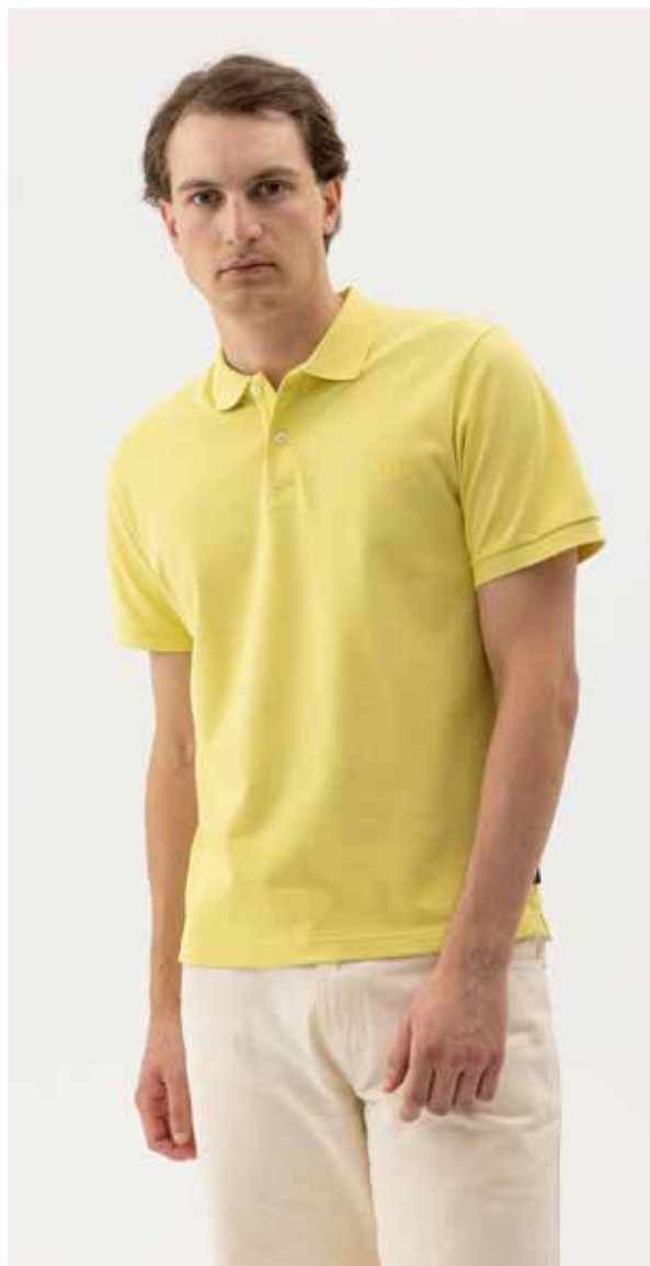
VIGGO POLO S61503 Colours: White, Navy, Fade Yellow. Sizes: S-XXXL Material: 100% Cotton