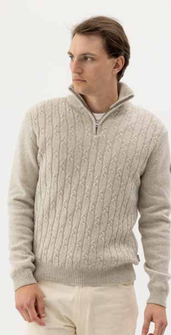
ALVIN T-NECK WP H61402 Colours: Chai, Black. Sizes: S-XXL Material: 90% Merino Wool Fine, 10% Cashmere