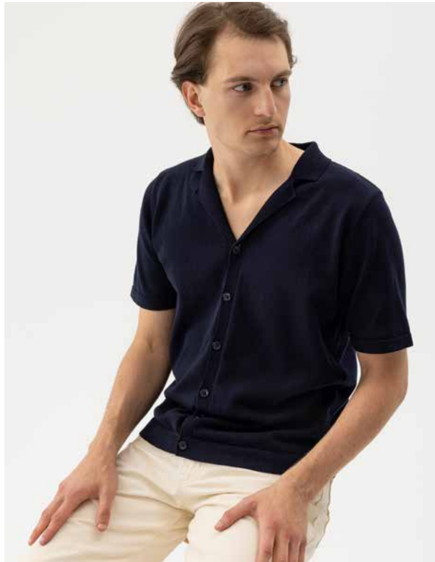
VINCENT SHIRT S61408 Colours: Navy, Marble Grey. Sizes: S-XXL Material: 100% Cotton