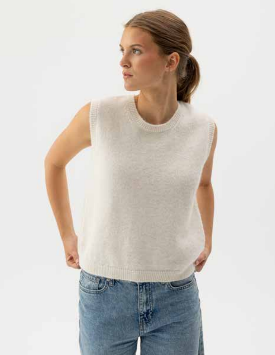
ELSY VEST S62421 Colours: Off White. Sizes: XS-XL Material: 70% Alpaca Superfine, 30% Polyamide