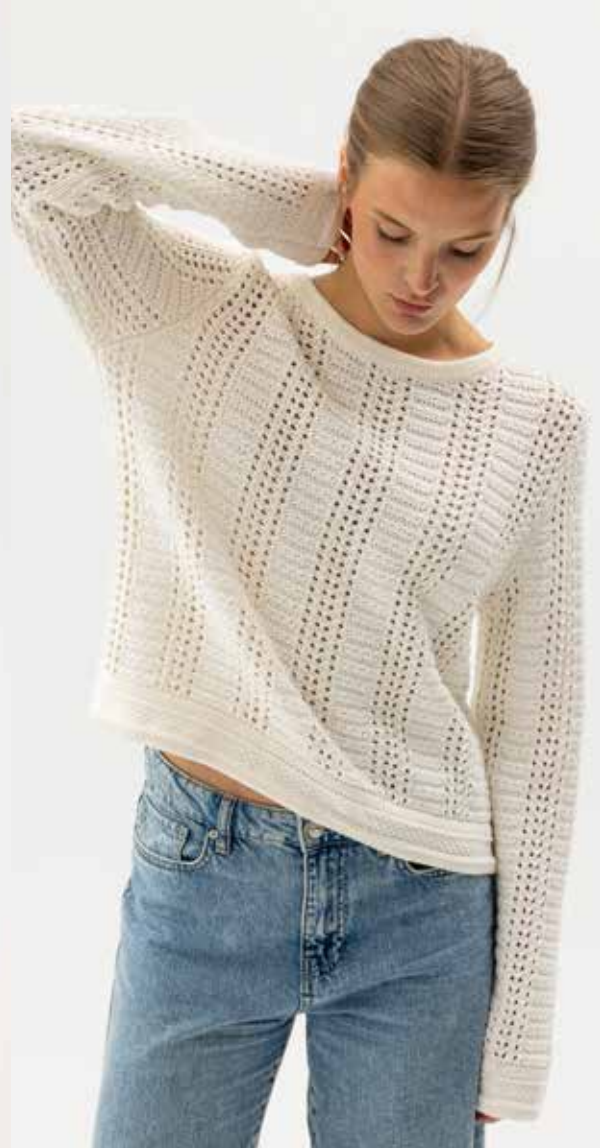
HEIDI CREW S62419 Colours: Off White, Navy, Bright Red. Sizes: XS-XL Material: 100% Cotton