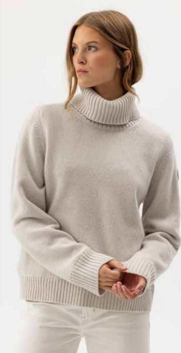
ELLIE TURTLE WP H62401 Colours: Pearl, Black. Sizes: XS-XL Material: 90% Merino Wool Fine, 10% Cashmere