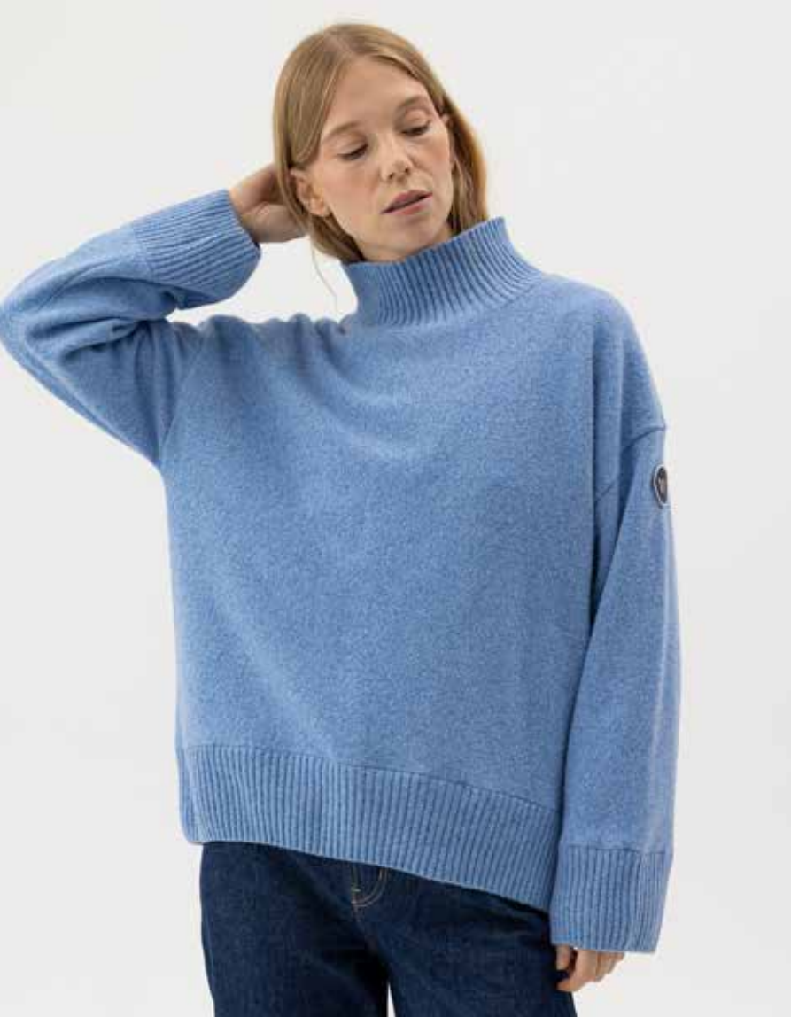
MARGOT TURTLE WP H62404 Colours: Creme, Oxford, Navy, Flamingo. Sizes: XS-XXL Material: 80% Wool, 20% Polyamide