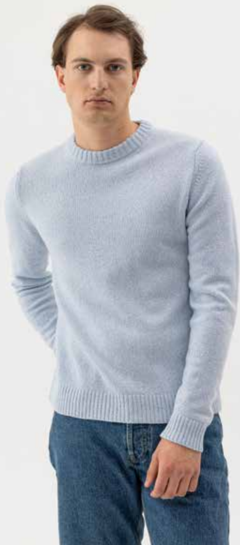
CHARLES CREW A01417 Colours: Creme/Walnut, Illusion Blue. Sizes: S-XXL Material: 80% Wool, 20% Polyamide