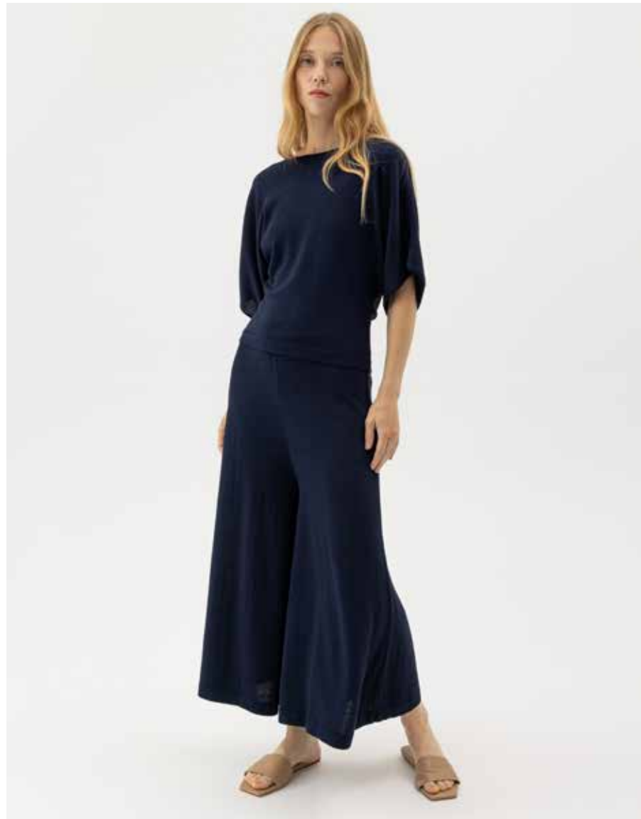
MARILYN TOP S62408 Colours: Navy. Sizes: XS-XL Material: 80% Viscose, 20% Polyamide