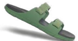
0087 field green/dark grey

CLOSURE: Slip-on with double toe bar for an easy-to-wear fit