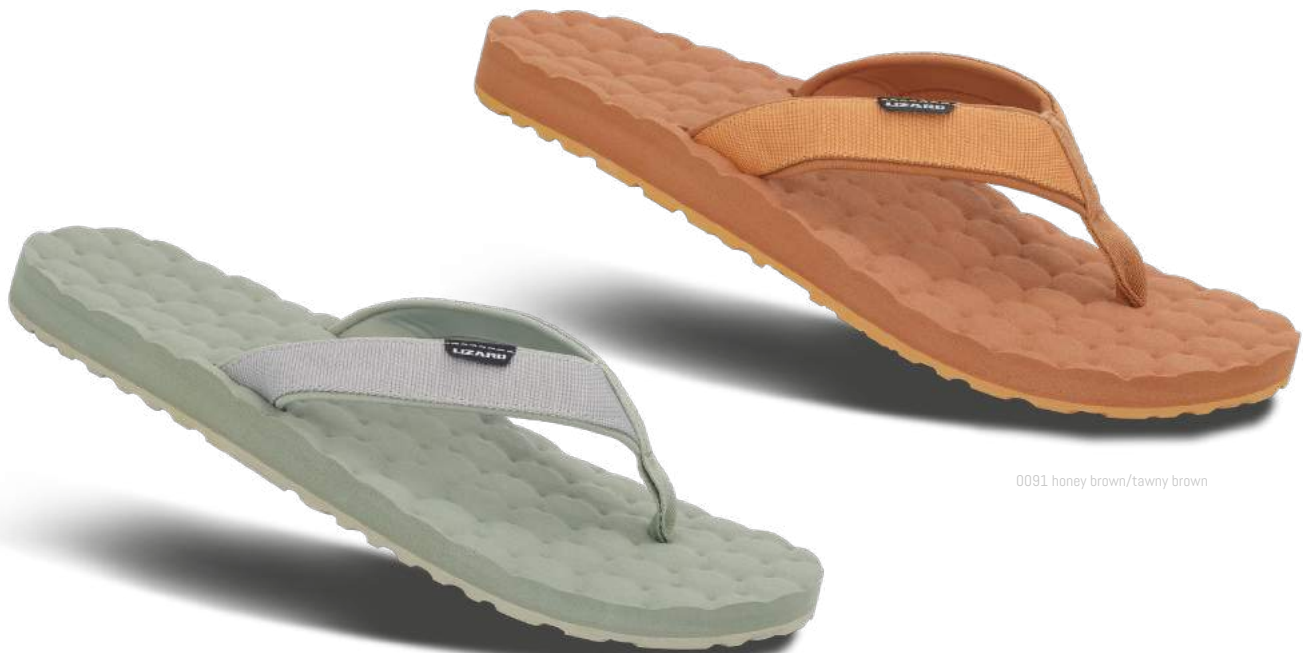
0086 silver green/light grey