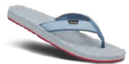
0083 stellar blue/glace blue