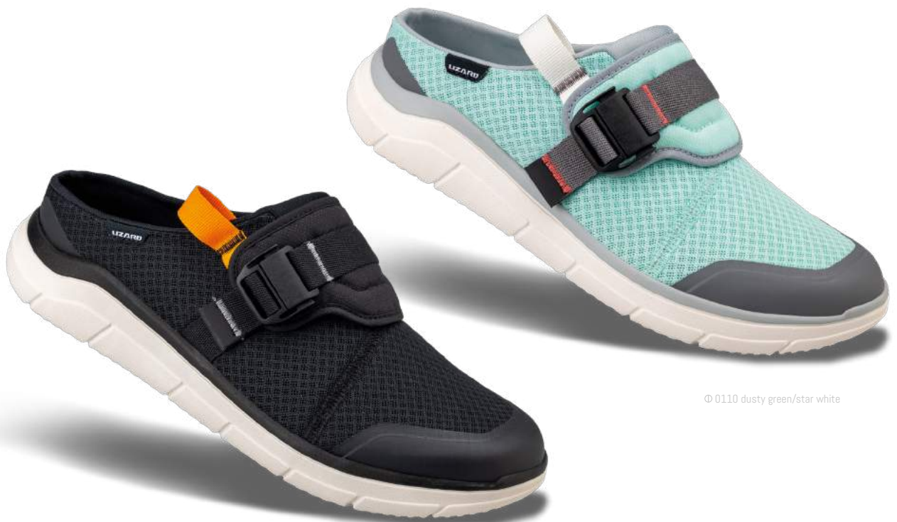
● 0082 black/lizard orange