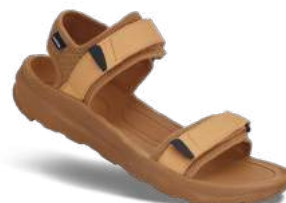
0091 honey brown/tawny brown