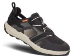
● ○ | 0054 black/white

CLOSURE: Static lace with cord-lock webbing closure system for a precise, secure fit