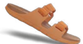
0091 honey brown/tawny brown