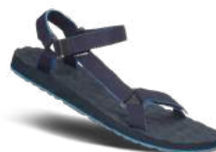
0078 midnight blue/atlantic blue