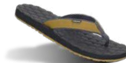
0065 plain dark grey

CLOSURE: Slip-on with toe bar for an easy-to-wear fit