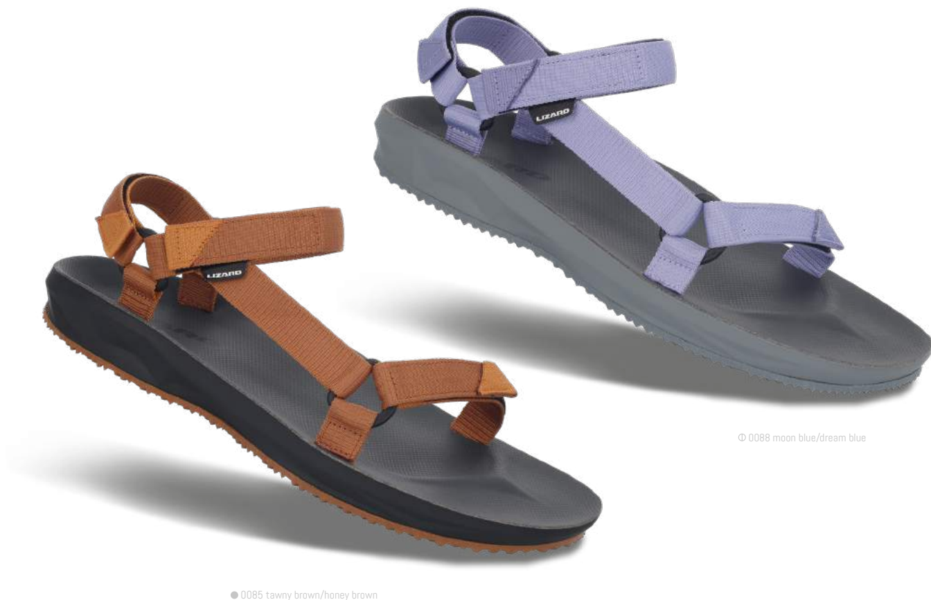
0088 moon blue/dream blue