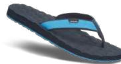
0078 midnight blue/atlantic blue