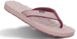
0061 plain amaranth red