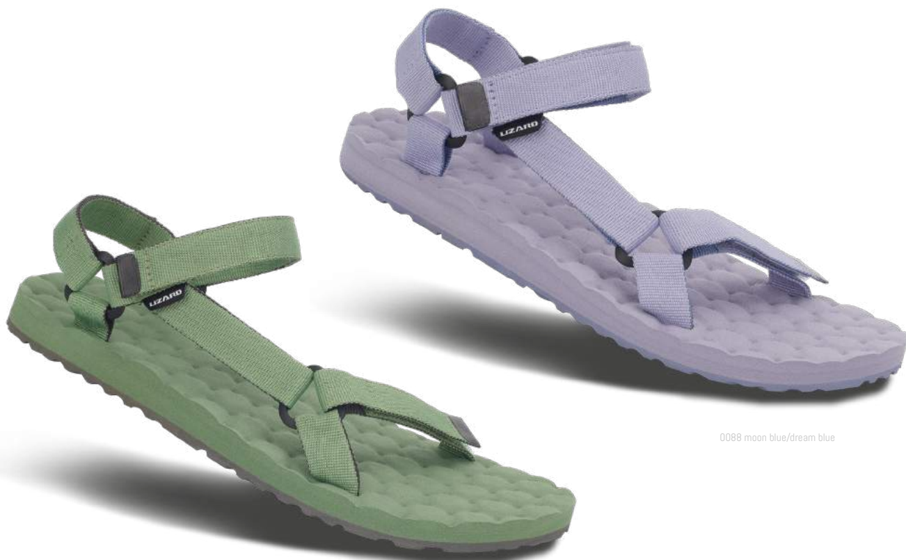
0088 moon blue/dream blue