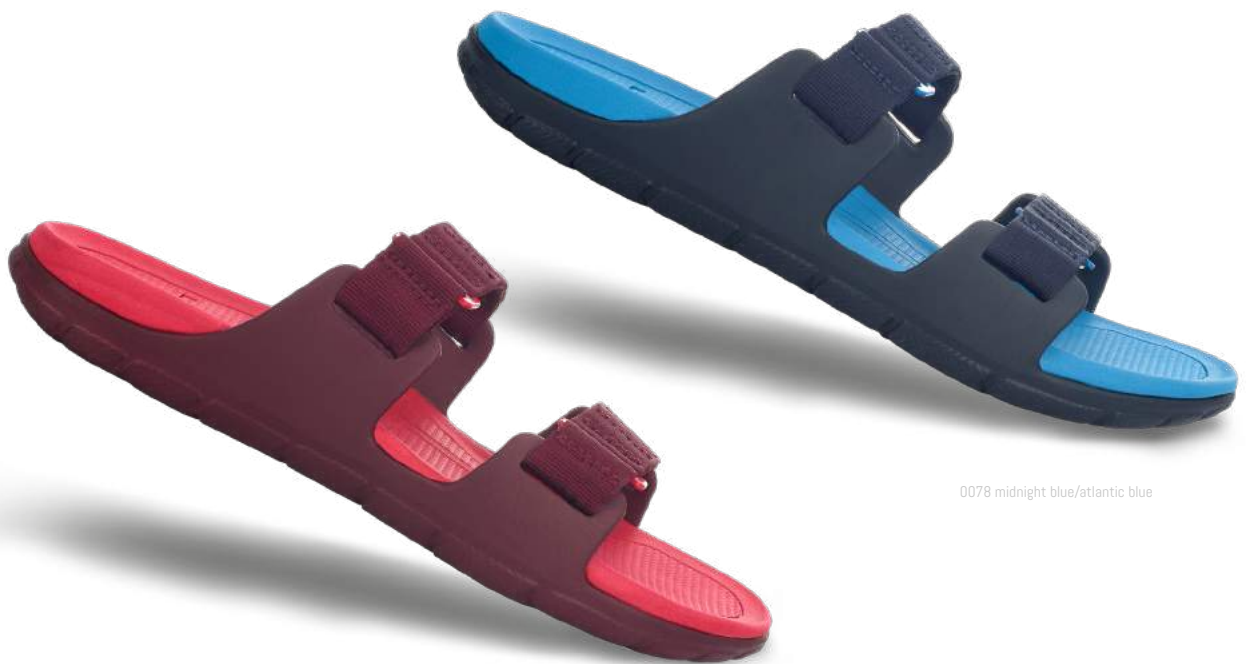
0077 zinfandel red/virtual pink