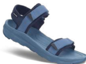
0089 stellar blue/midnight blue

CLOSURE: Double Velcro closure with locking buckle for an adjustable, secure fit