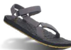
0065 plain dark grey

CLOSURE: Triple Velcro closure for an adjustable, secure fit