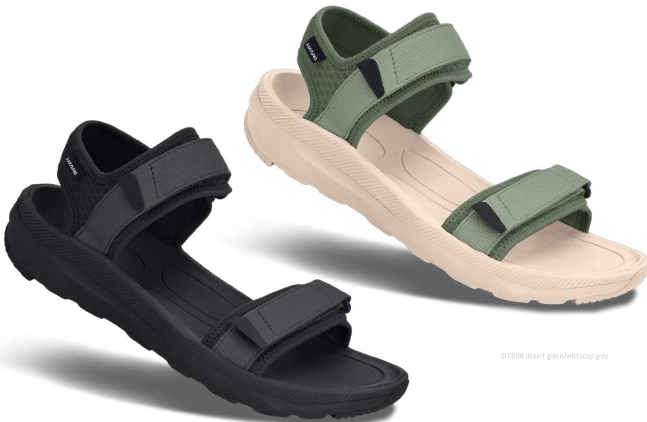
0098 desert green/whitecap grey