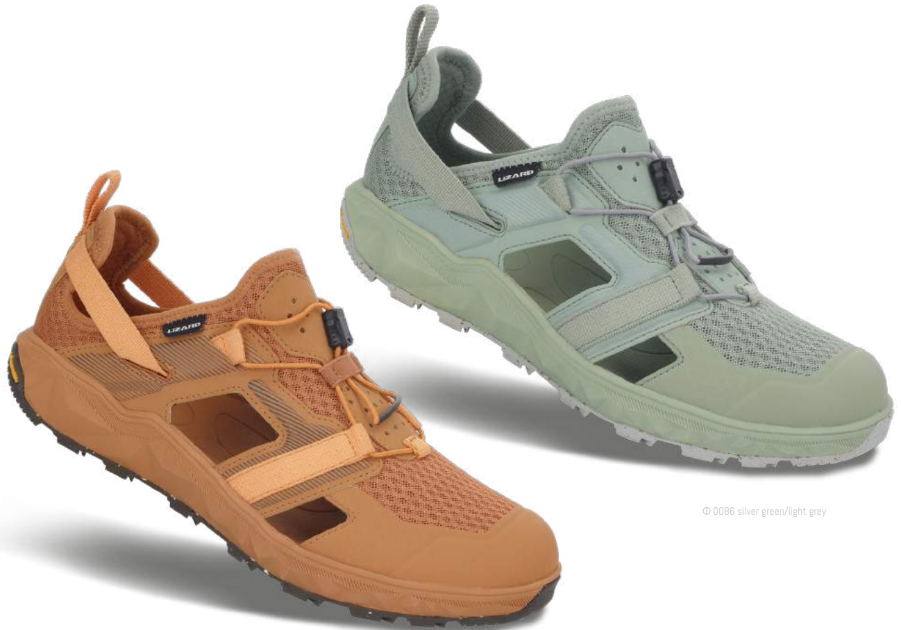
● 0085 tawny brown/honey brown