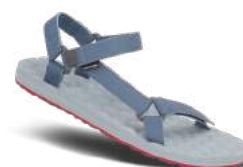
0083 stellar blue/glace blue