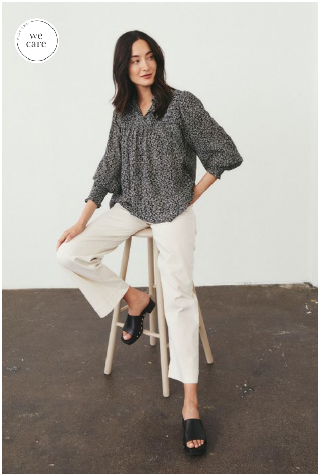
30307563 SEFINAPW BLOUSE 30307736 BARBAPW JEANS