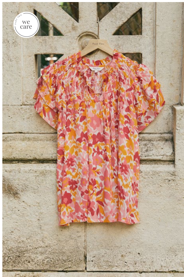
30307558 SINNAPW BLOUSE