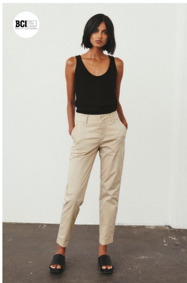
30307545 SABINEPW PULLOVER 30305570 SOFFYSPW PANTS