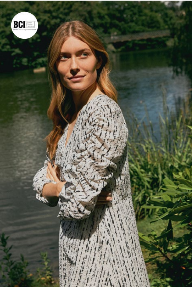
30307561 SELENAPW DRESS