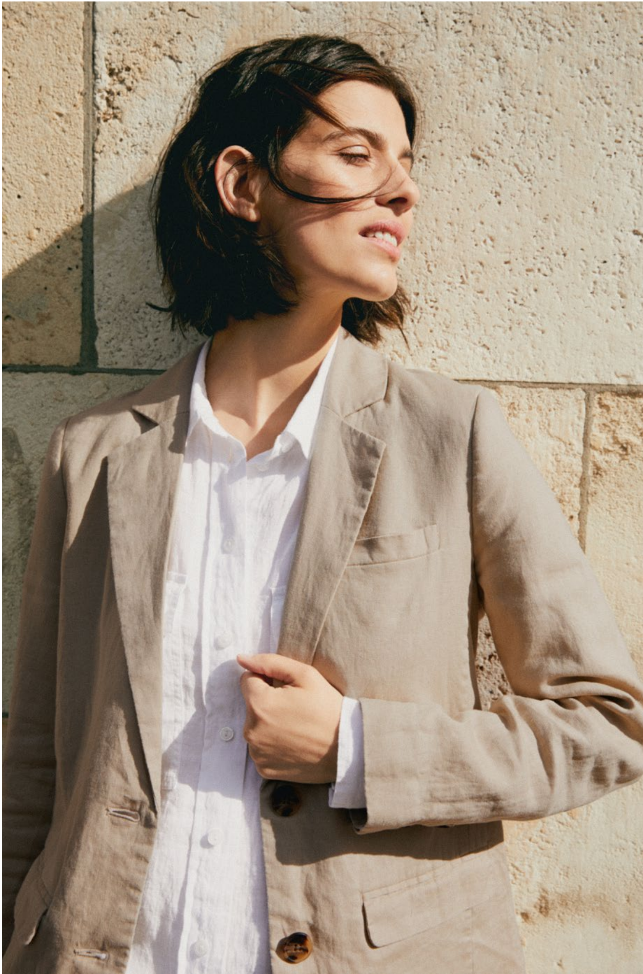
30307552 NYANPW JACKET 30306622 NAVAPW SHIRT 30307724 NINNESPW PANTS