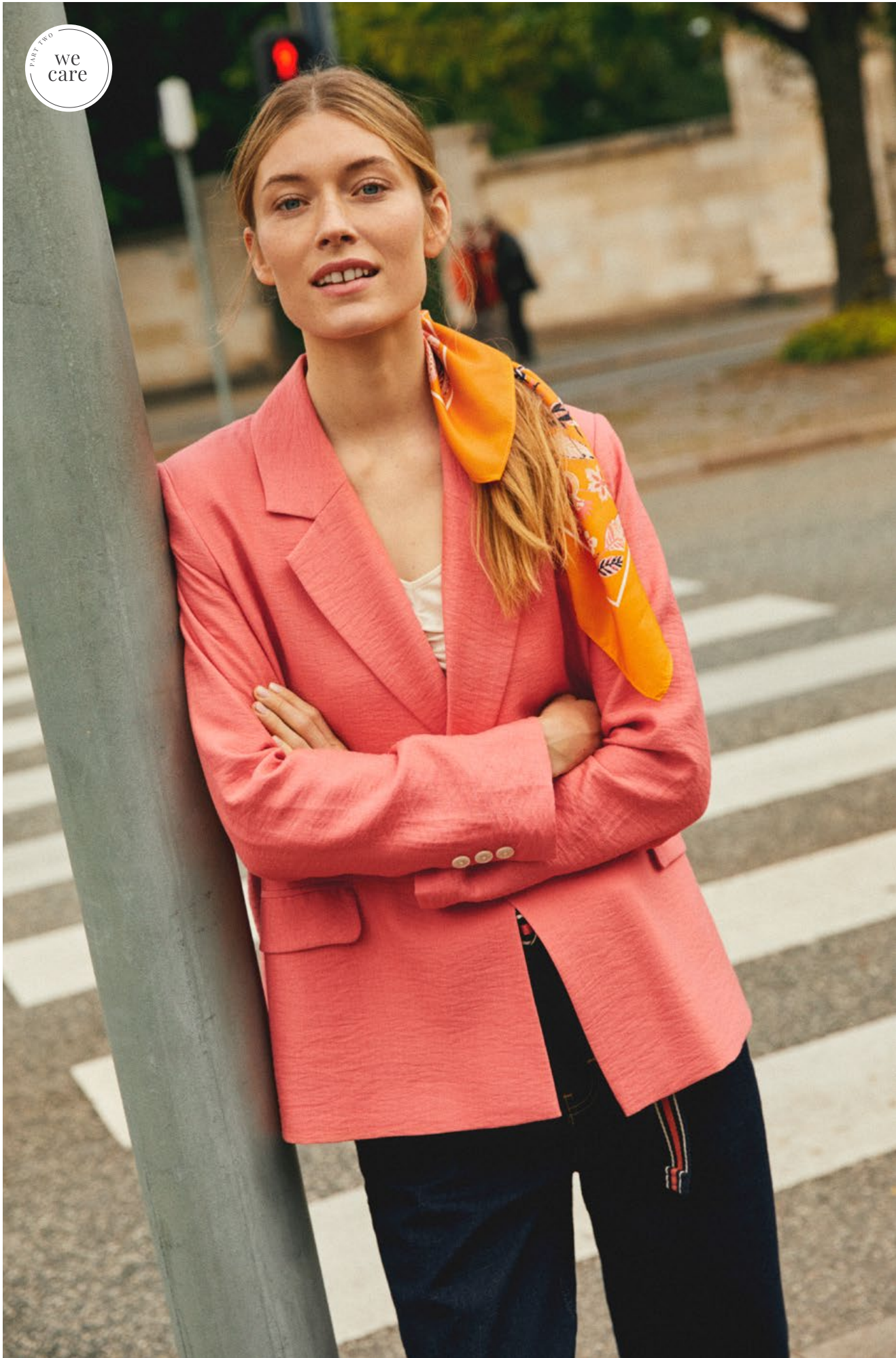
30307617 SELIMAPW SCARF 30307580 TALENAPW BLAZER 30307574 SELINAPW T-SHIRT