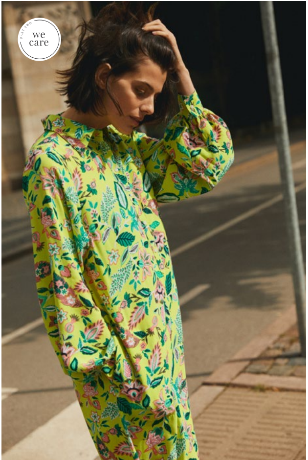
30307524 SHIRAPW DRESS