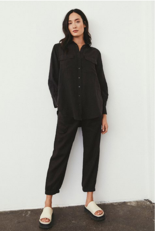
30306622 NAVAPW SHIRT 30307555 SHENAPW PANTS