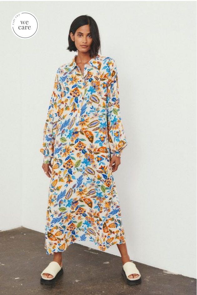
30307524 SHIRAPW DRESS