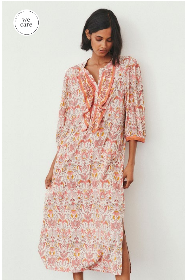
30307609 SALIPW DRESS