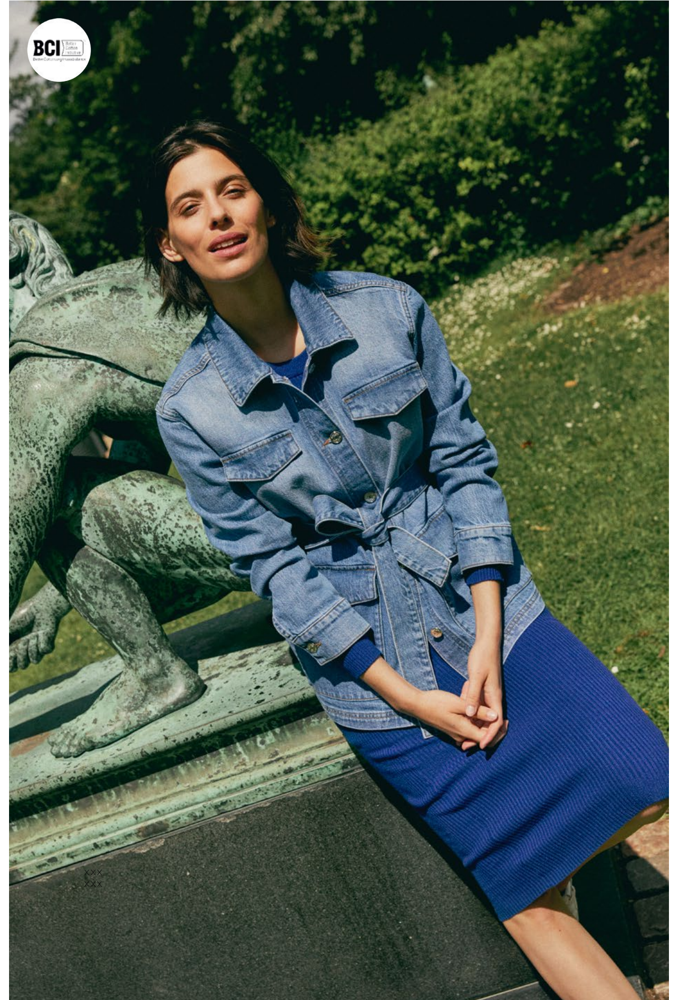
30307426 VENDELAPW DRESS 30307494 SANNEPW JACKET