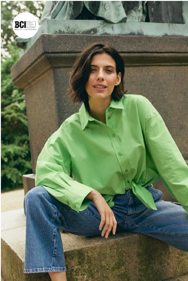
30307518 SAVANNAPW SHIRT 30307384 RAYNEPW JEANS