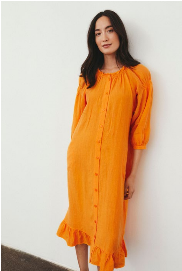
30307508 SISSEPW DRESS