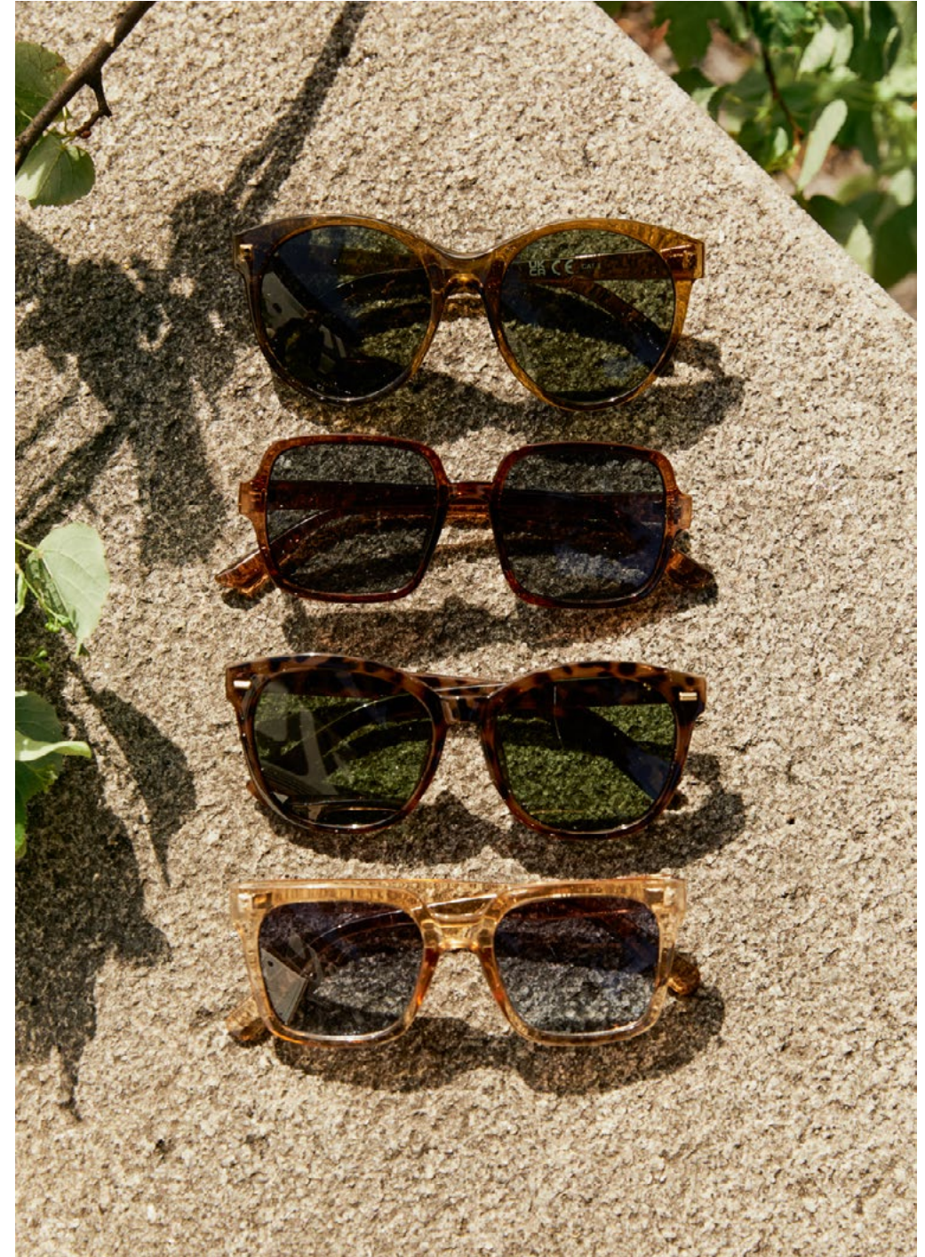
30304403 SHIRLEYPW SUNGLASSES 30307466 SAIDAPW SUNGLASSES 30306716 NARIANPW SUNGLASSES 30307464 SADIKAPW SUNGLASSES