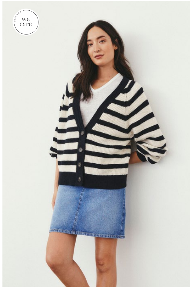
30307540 SERAPW CARDIGAN 30306770 CURLIESPW T-SHIRT 30307495 OLENAPW SKIRT