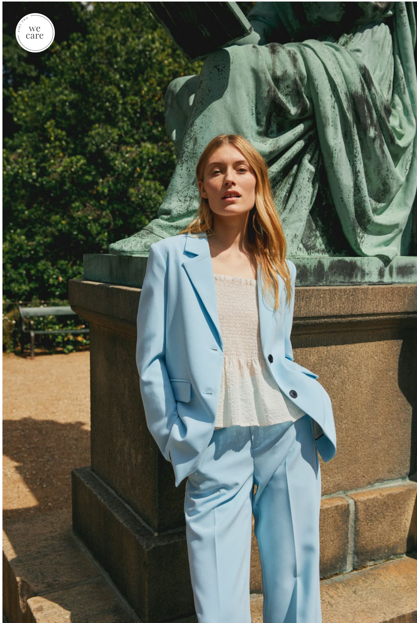
30307497 RONNIEPW BLAZER 30307588 STEVIEPW TOP 30306618 NADJAPW PANTS