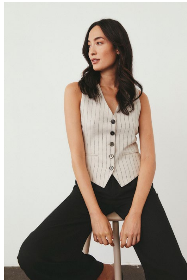
30307728 RIKKEPW WAISTCOAT 30307581 SIBILLAPW PANTS