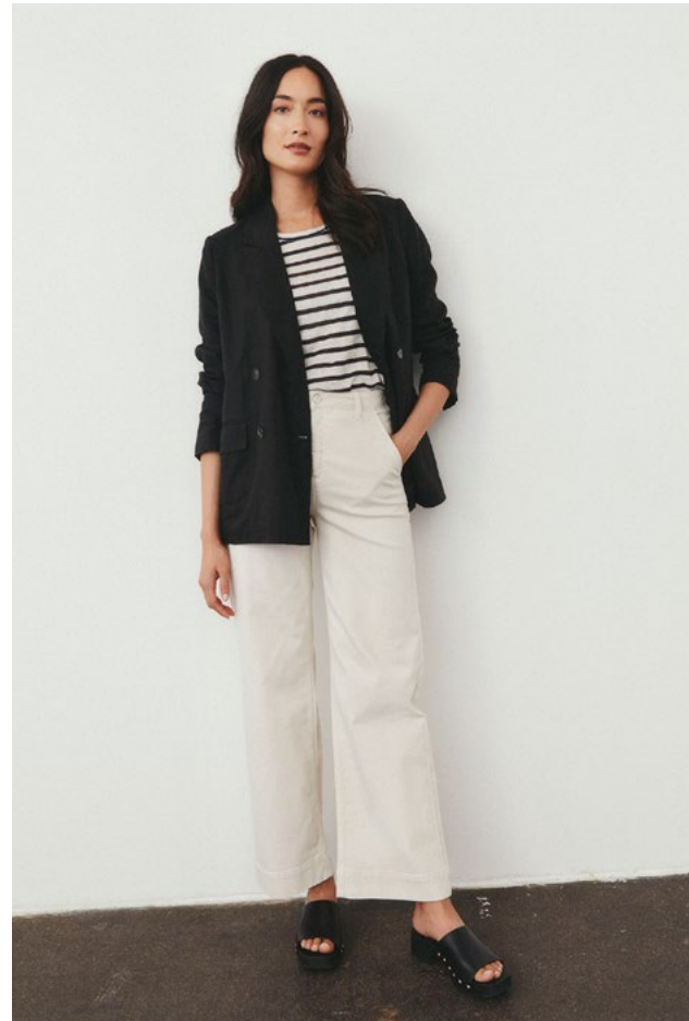
30307749 SONJASPW BLAZER 30307532 NEMIASPW T-SHIRT 30307736 BARBAPW JEANS