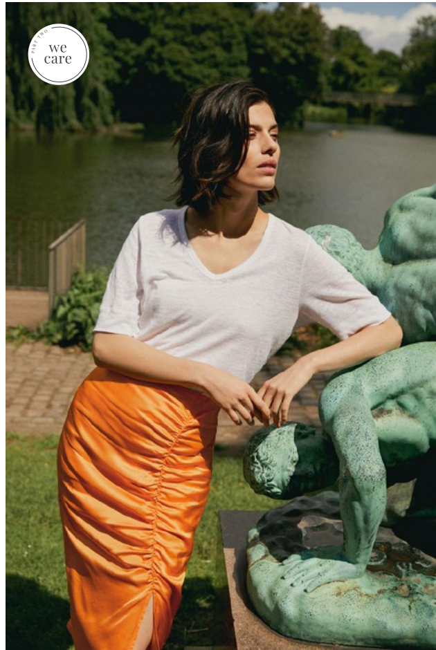
30306770 CURLIESPW T-SHIRT 30307592 SABRINEPW SKIRT