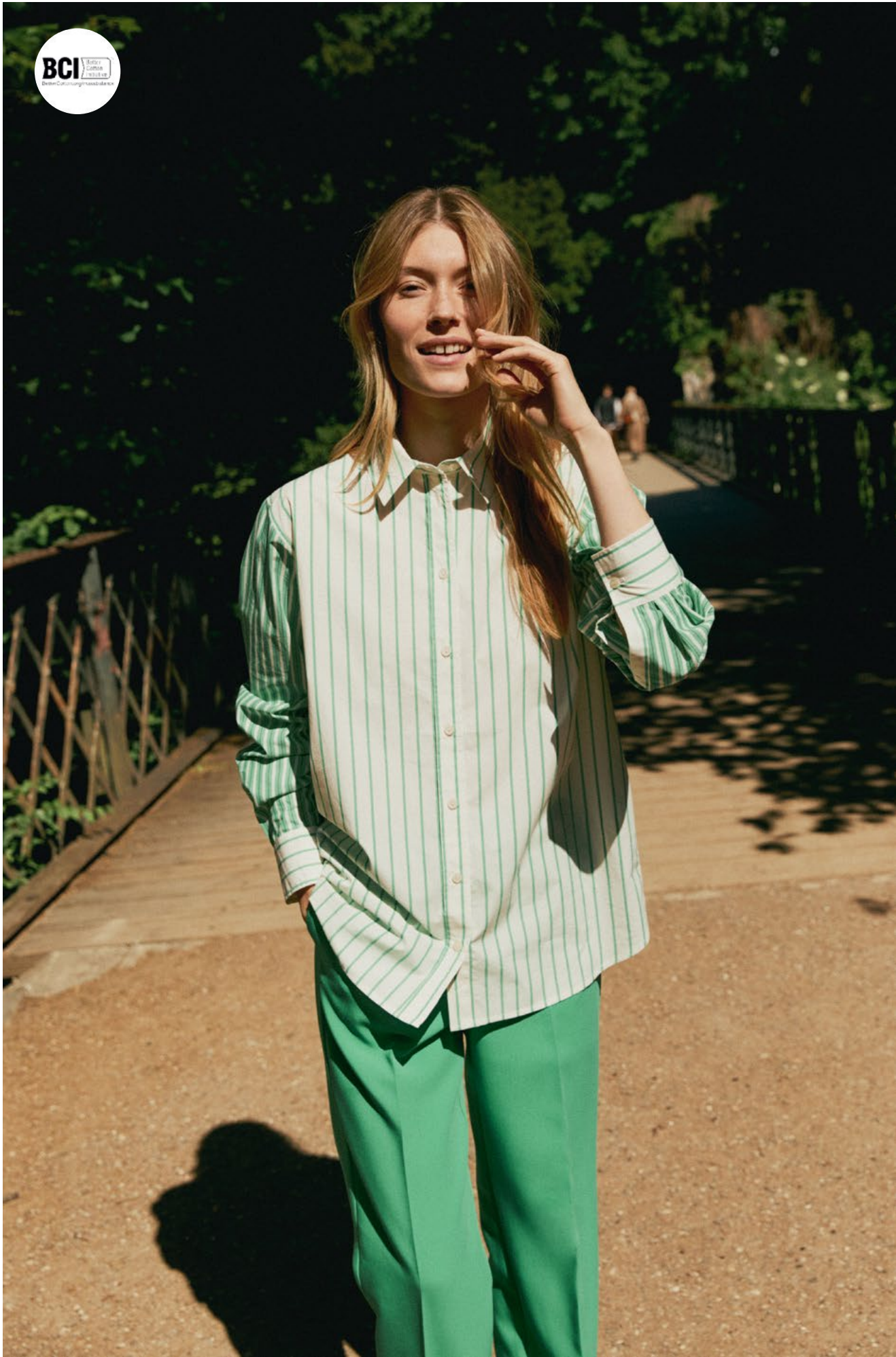
30307519 SABRINPW SHIRT 30306618 NADJAPW PANTS