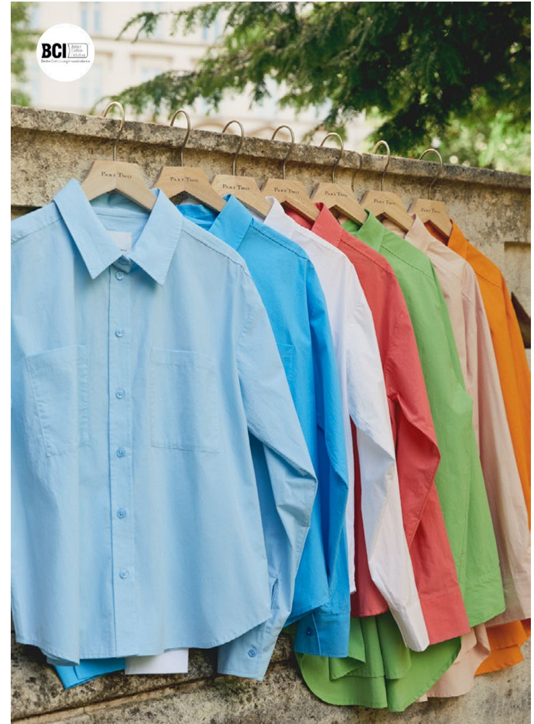
30307517 SADIAPW SHIRT 30307518 SAVANNAPW SHIRT