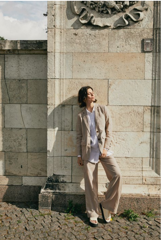
30307552 NYANPW JACKET 30306622 NAVAPW SHIRT 30307724 NINNESPW PANTS