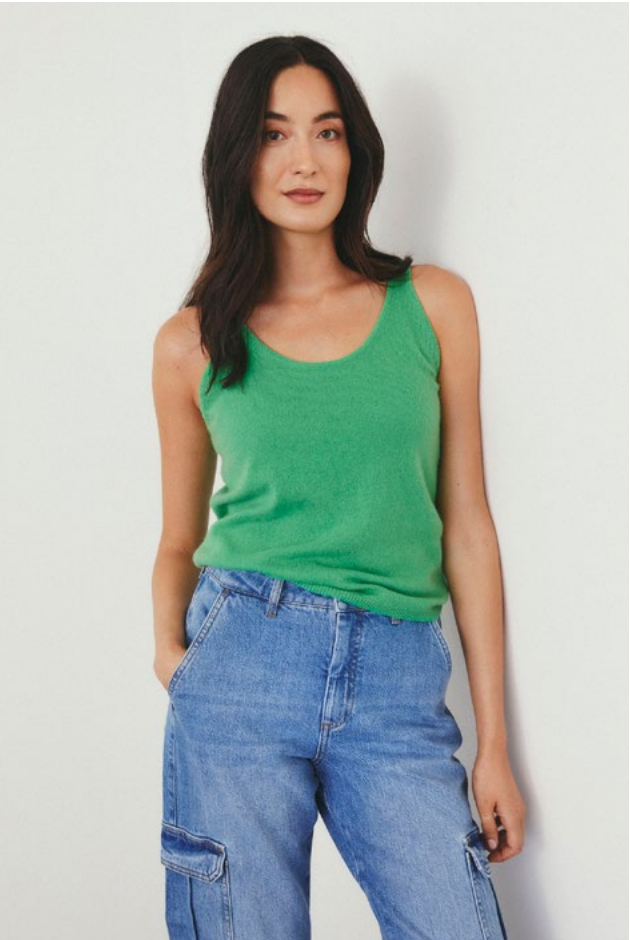
30307545 SABINEPW PULLOVER 30307384 RAYNEPW JEANS