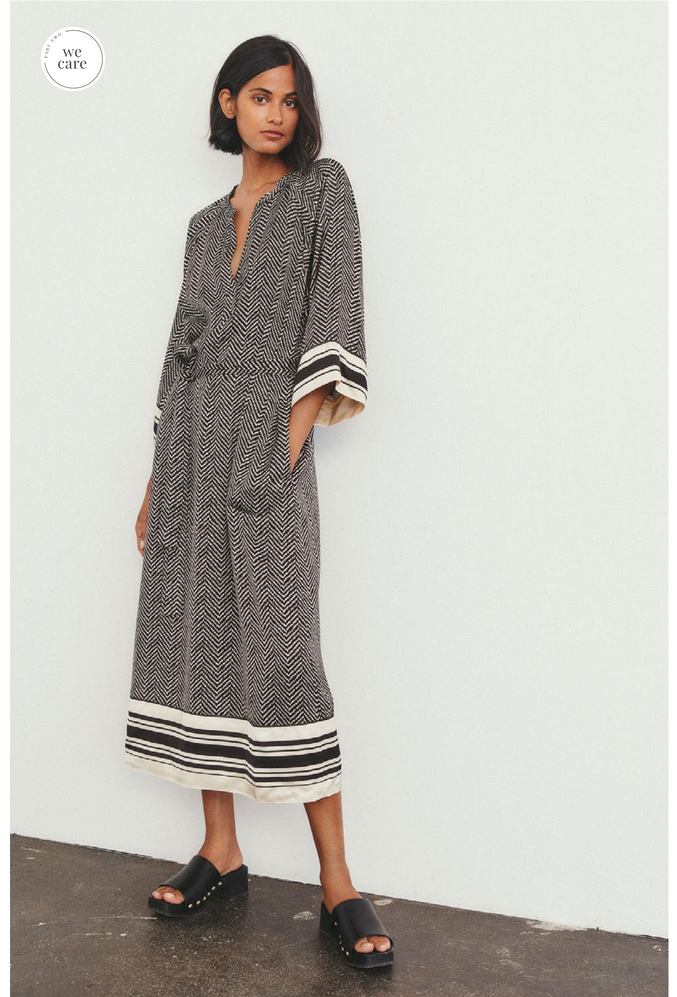
30307566 SARISAPW DRESS