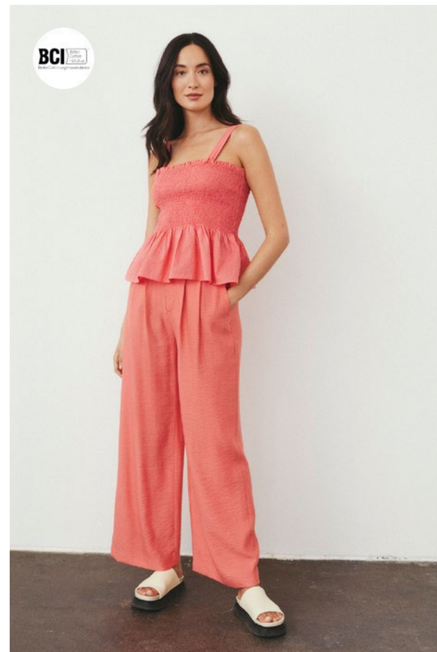
30307588 STEVIEPW TOP 30307581 SIBILLAPW PANTS