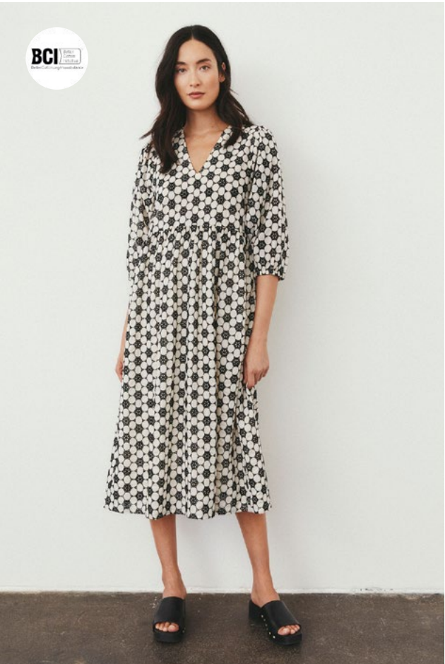
30307572 SARITAPW DRESS