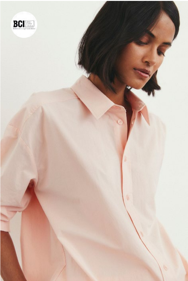
30307518 SAVANNAPW SHIRT