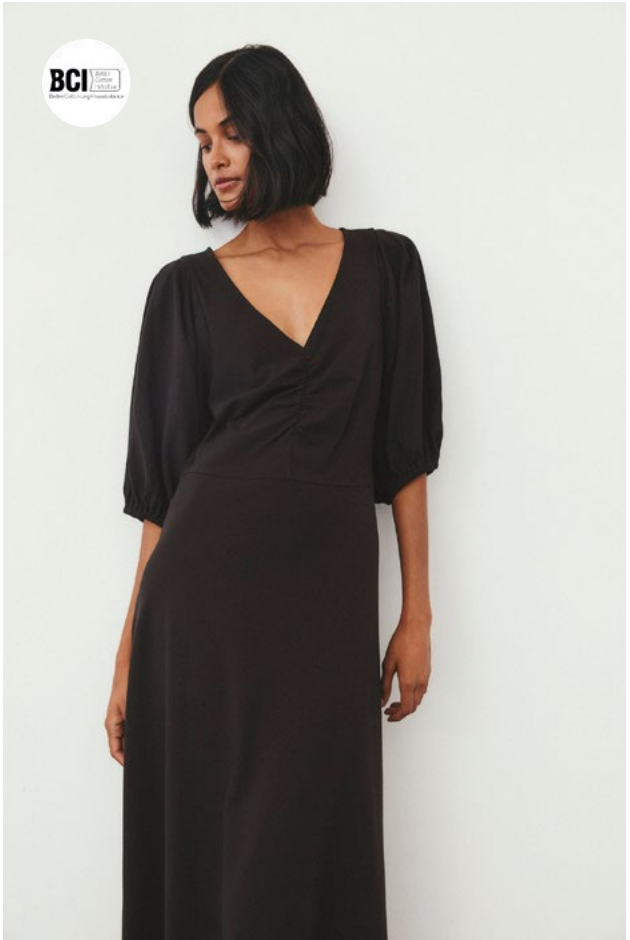
30307575 SEBINAPW DRESS