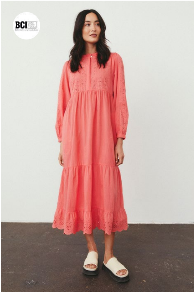
30307602 SEIAPW DRESS