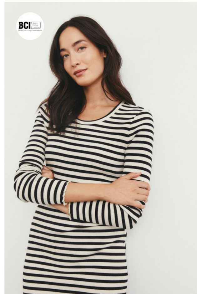
30307535 SONYAPW DRESS