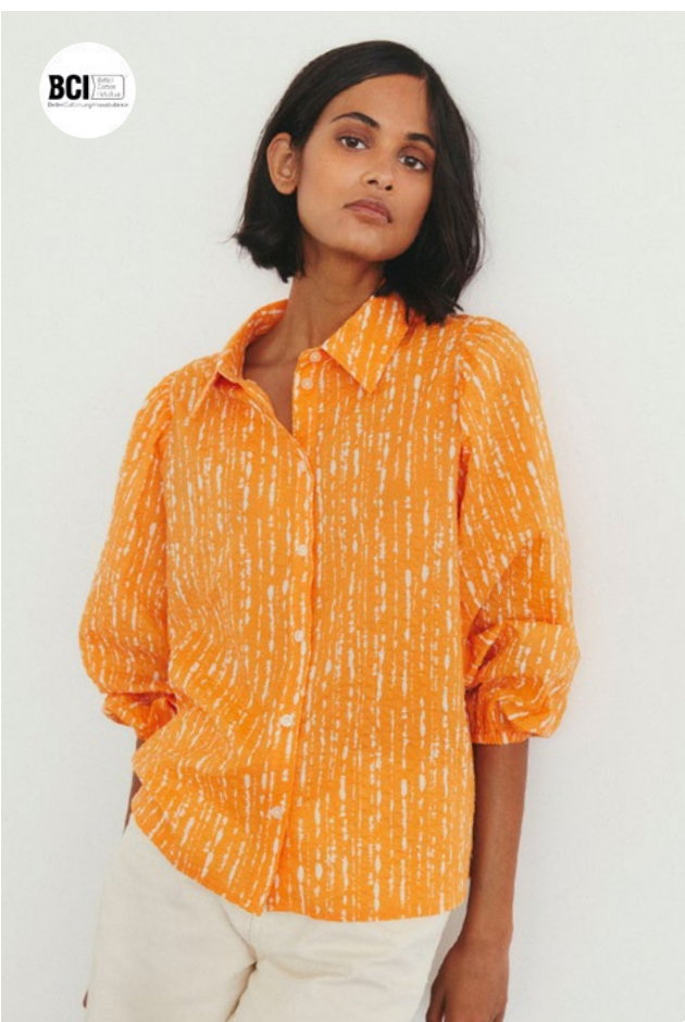
30307560 STINNAPW SHIRT 30307549 JUDYPW JEANS