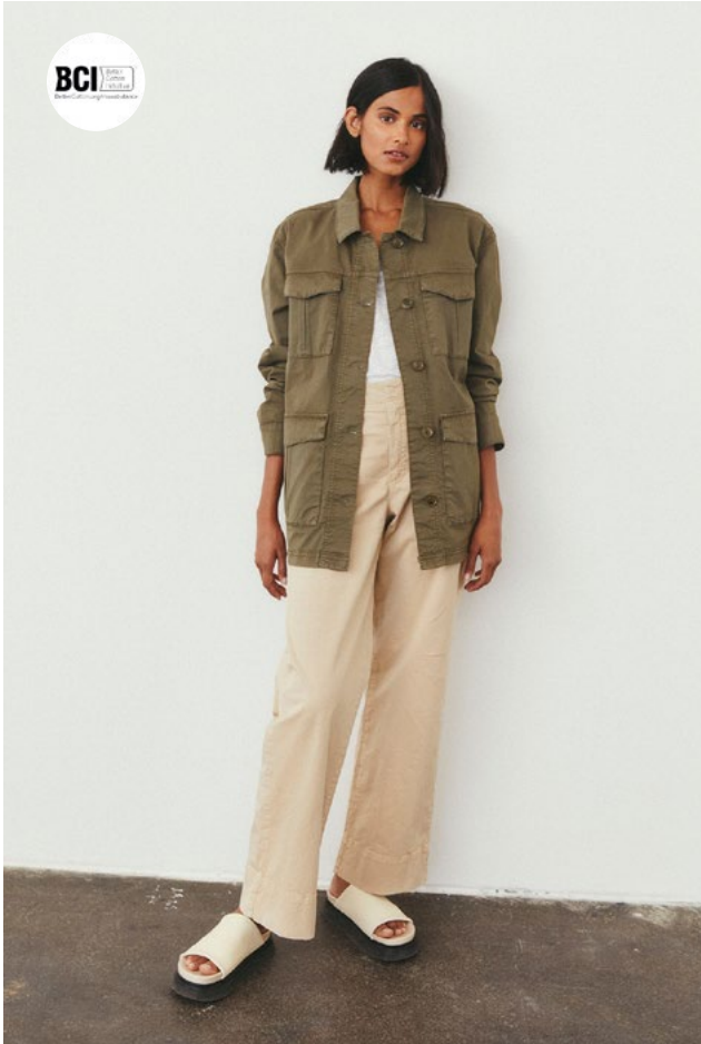
30307501 SIAPW JACKET 30307530 SIRINEPW T-SHIRT 30307499 SALINAPW PANTS