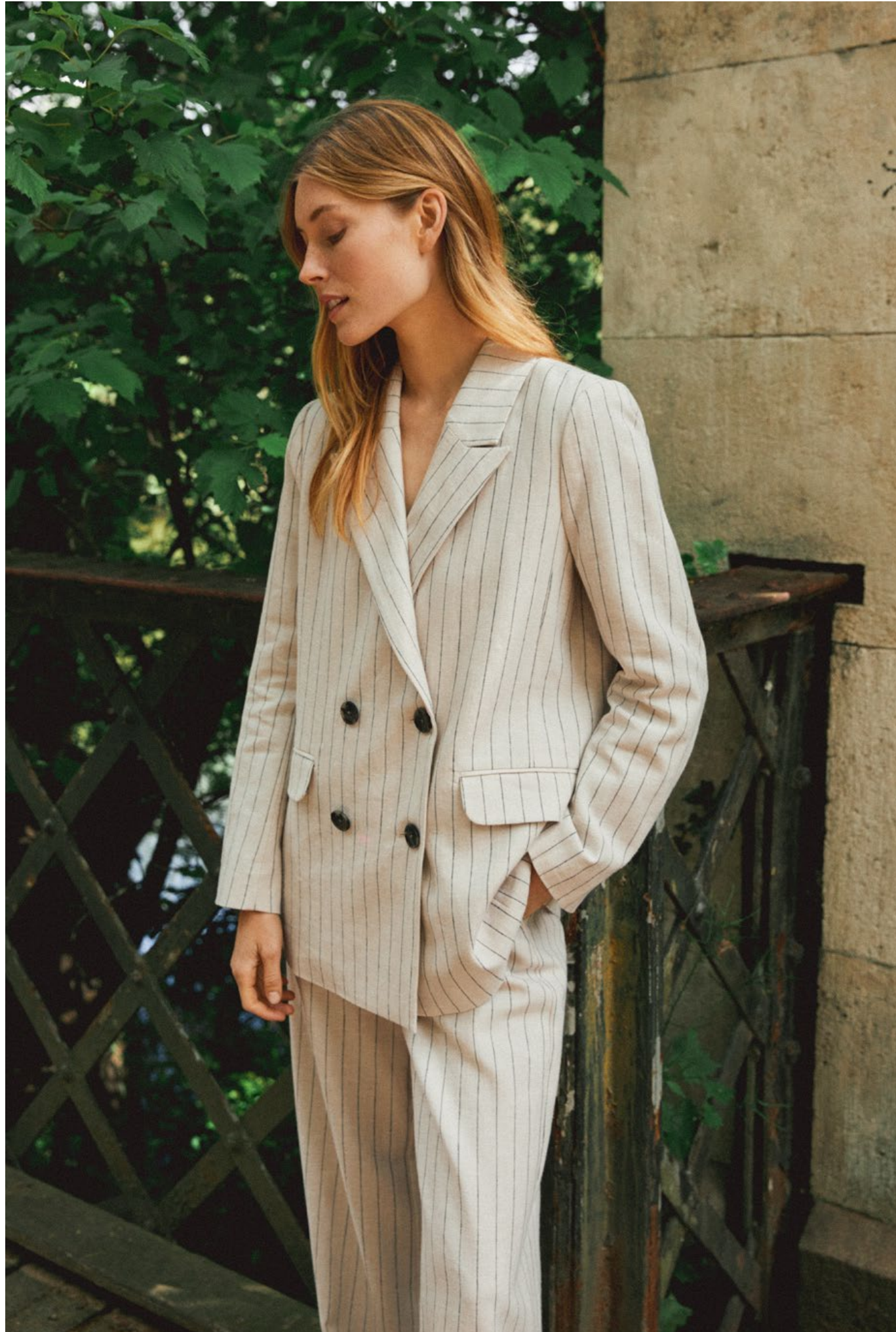
30307582 SINEPW BLAZER 30307583 NINNESPW PANTS