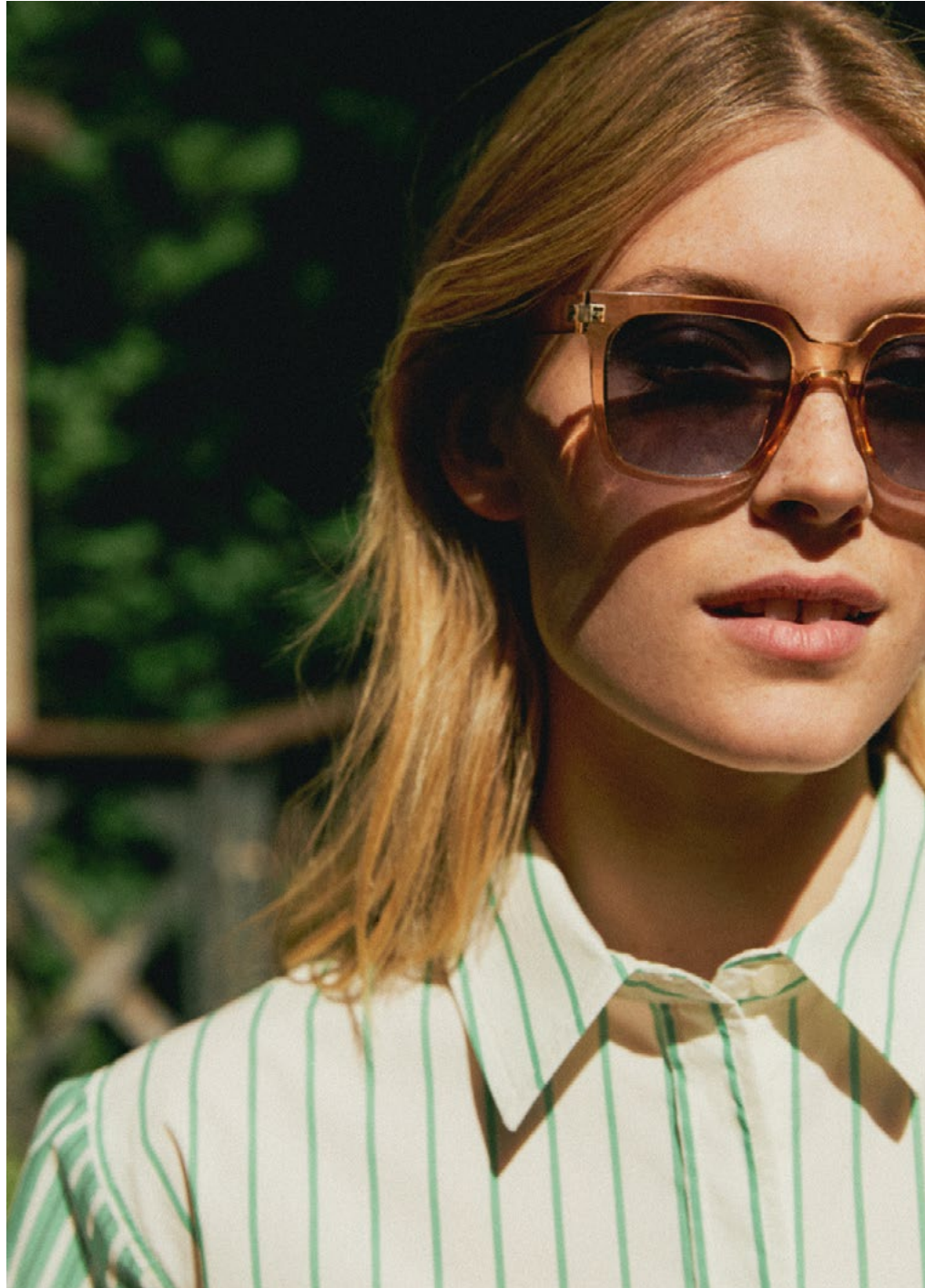
30307519 SABRINPW SHIRT 30307464 SADIKAPW SUNGLASSES