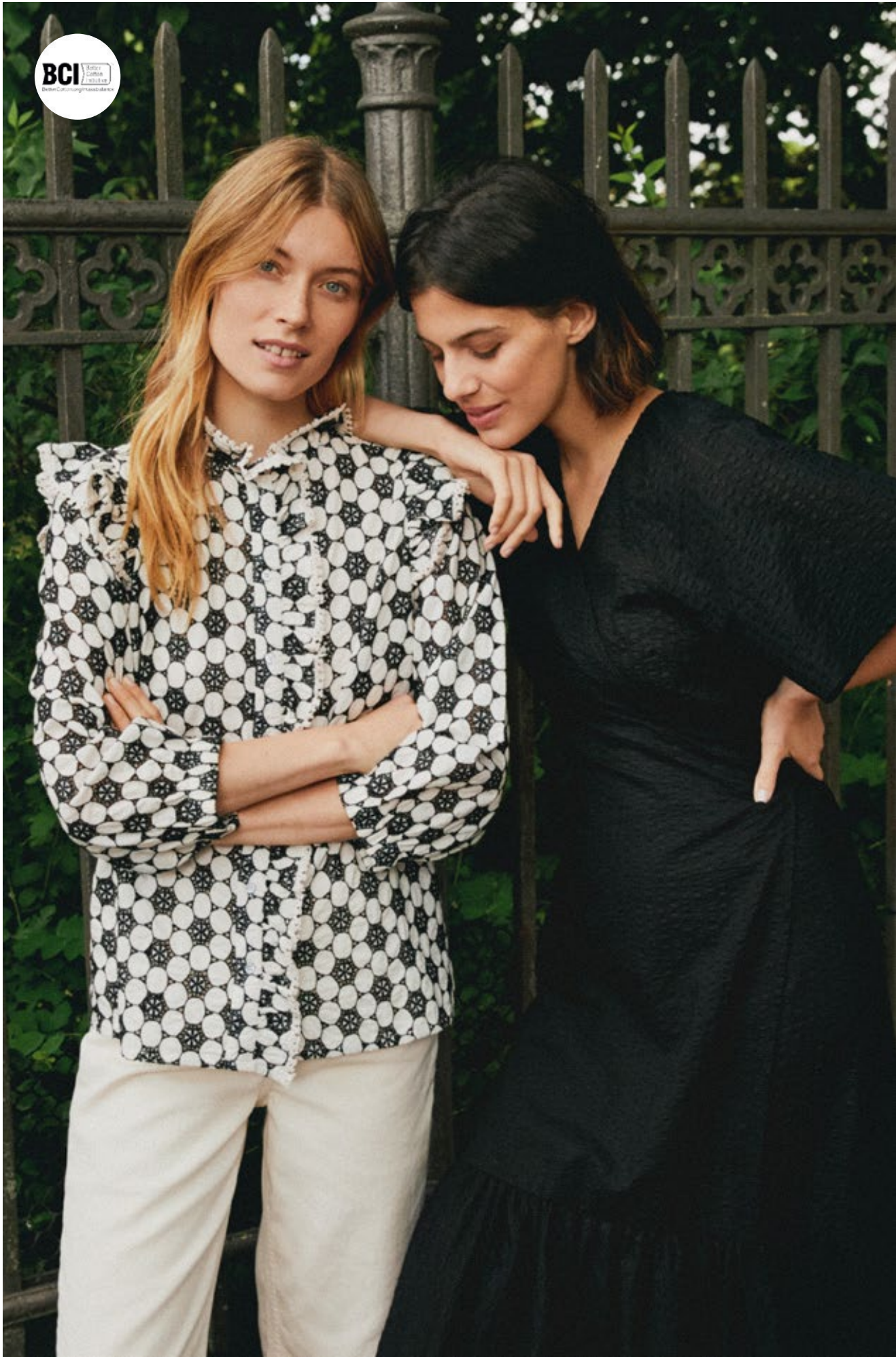
30307570 SANIYAPW SHIRT 30307549 JUDYPW JEANS 30307589 SABBIEPW DRESS