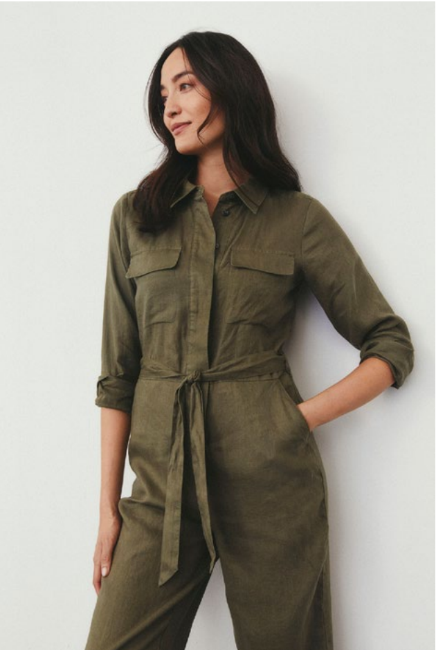
30307556 SIABELLAPW JUMPSUIT