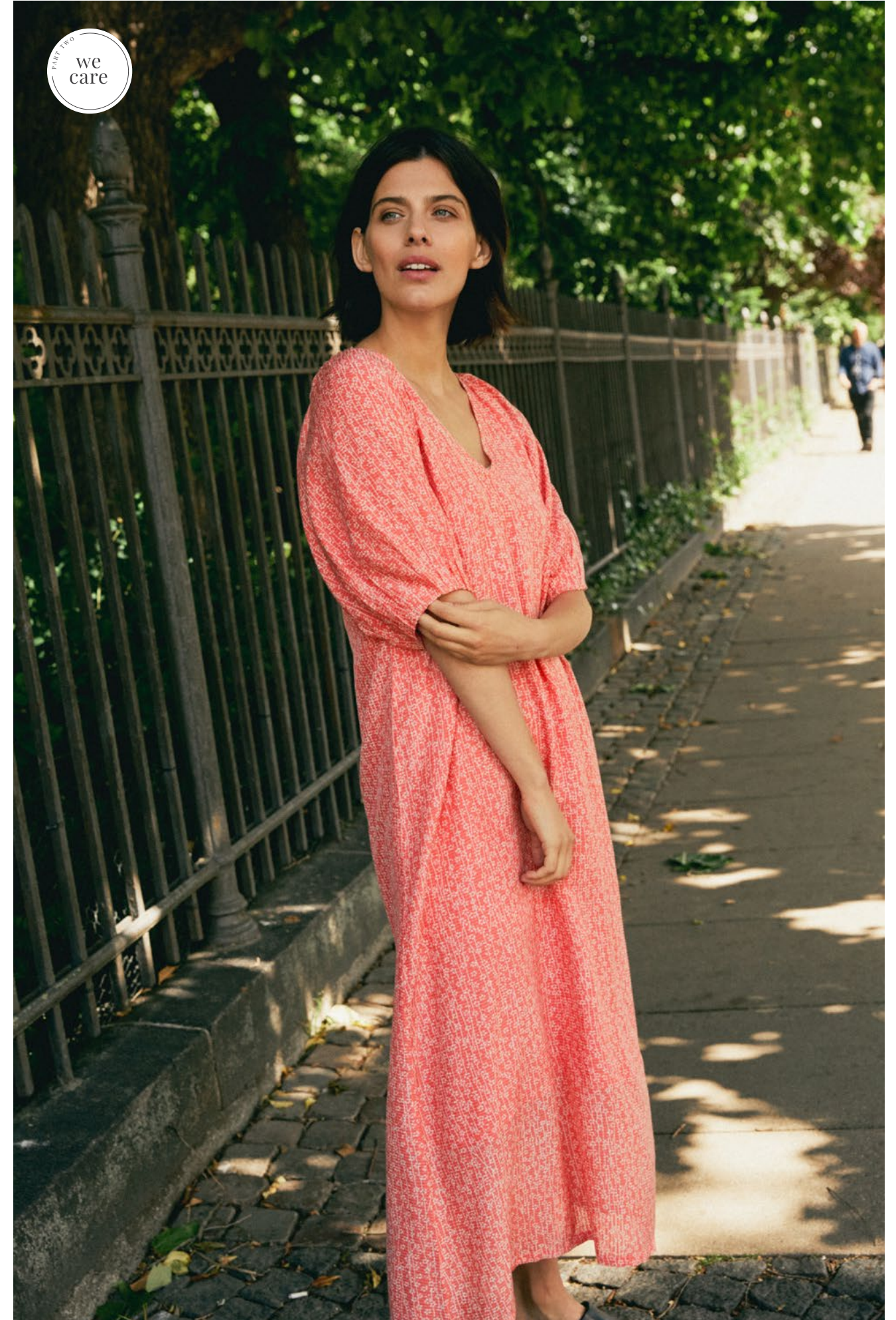
30307564 SADEPW DRESS