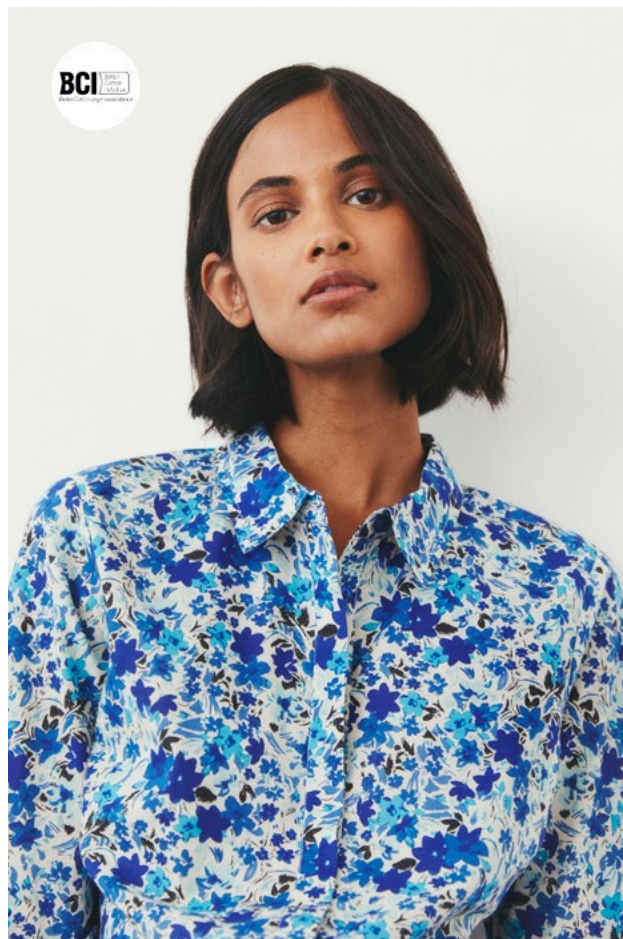
30307569 SABELLAPW SHIRT