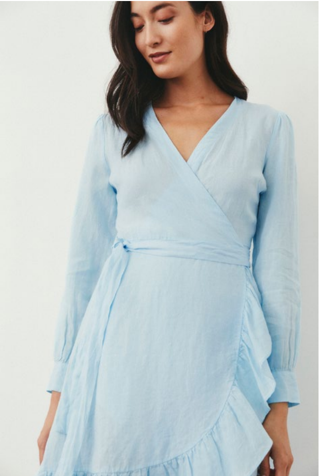
30307507 SOLPW DRESS