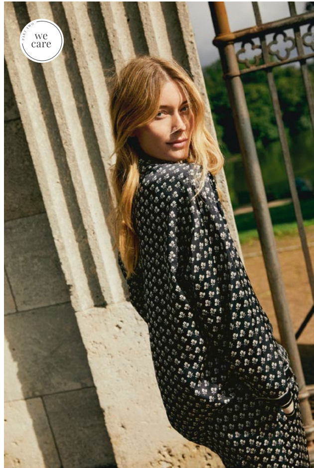
30307565 SARINAPW SHIRT 30307567 TIARASPW PANTS