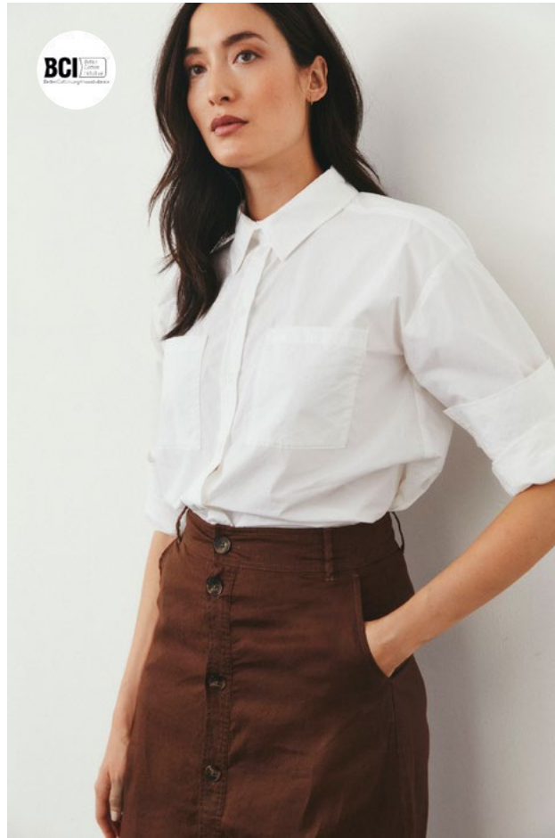
30307517 SADIAPW SHIRT 30307553 SHEBAPW SKIRT