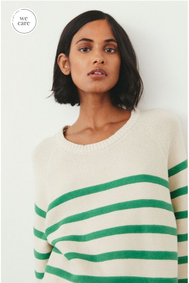
30307539 SAYAPW PULLOVER