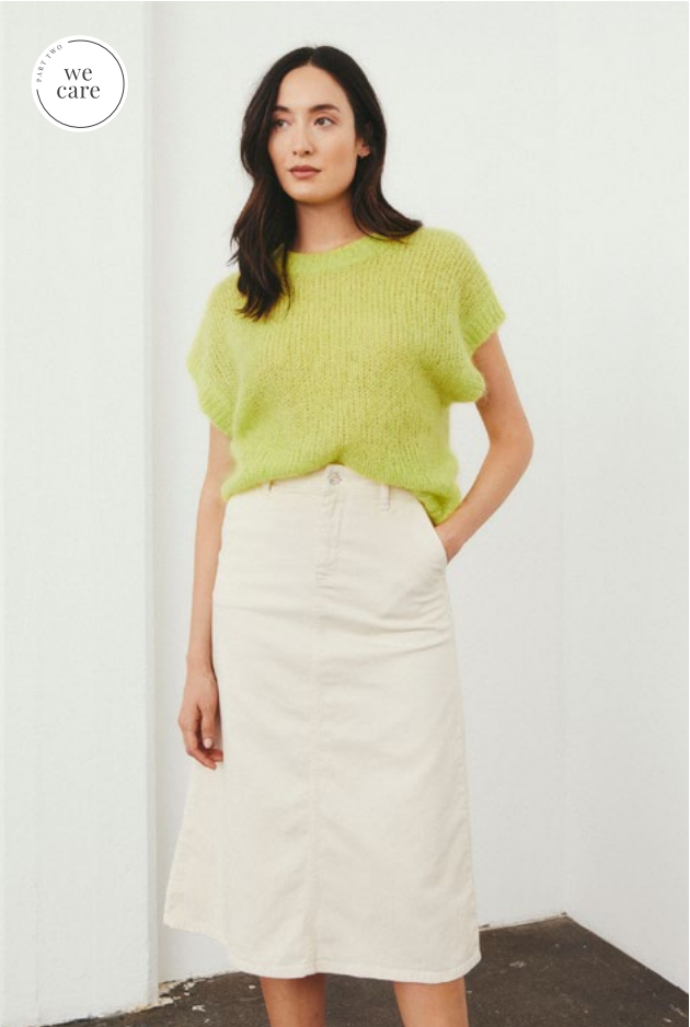
30307544 SIARAPW PULLOVER 30307550 SIYAPW SKIRT