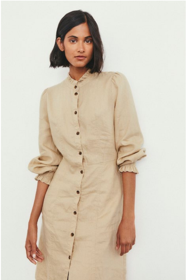
30307551 RUTHIEPW DRESS