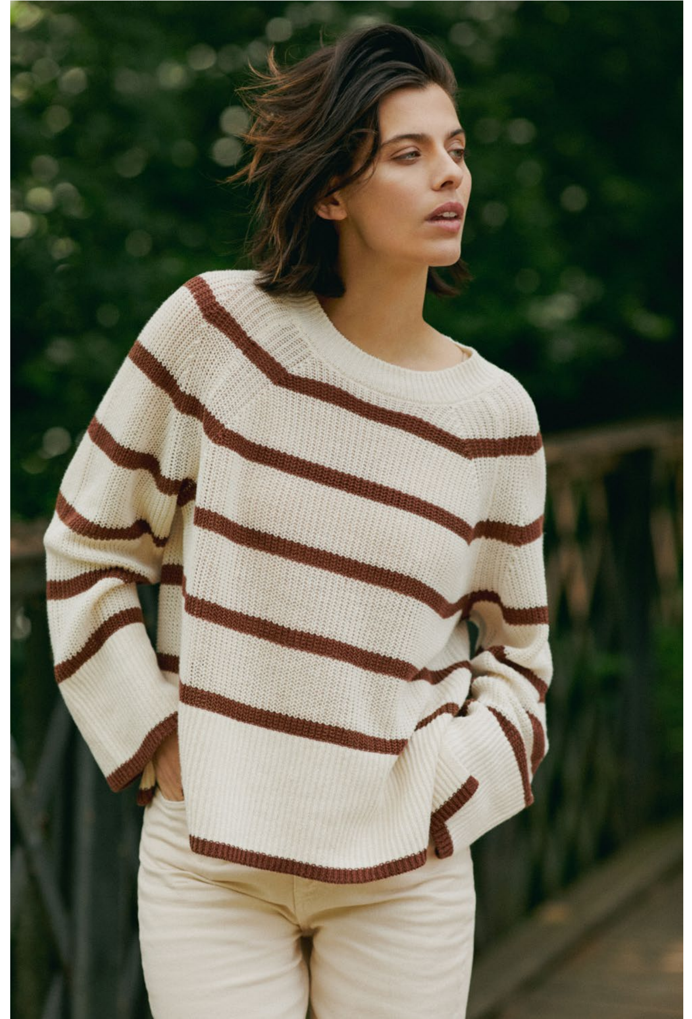
30307576 SACHAPW PULLOVER 30307549 JUDYPW JEANS