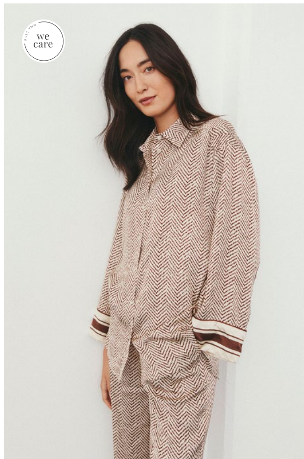
30307565 SARINAPW SHIRT 30307567 TIARASPW PANTS