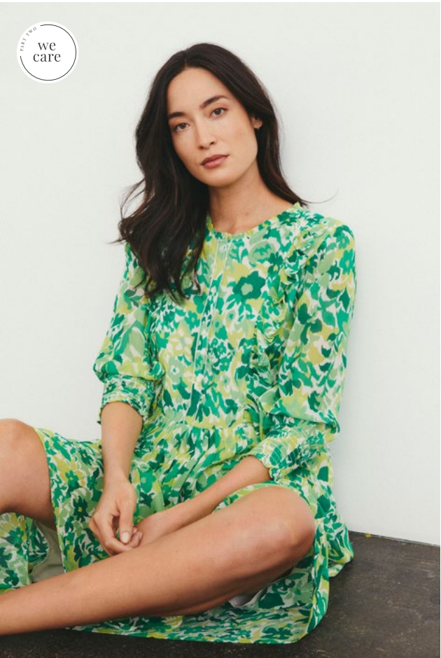
30307557 SILAPW DRESS