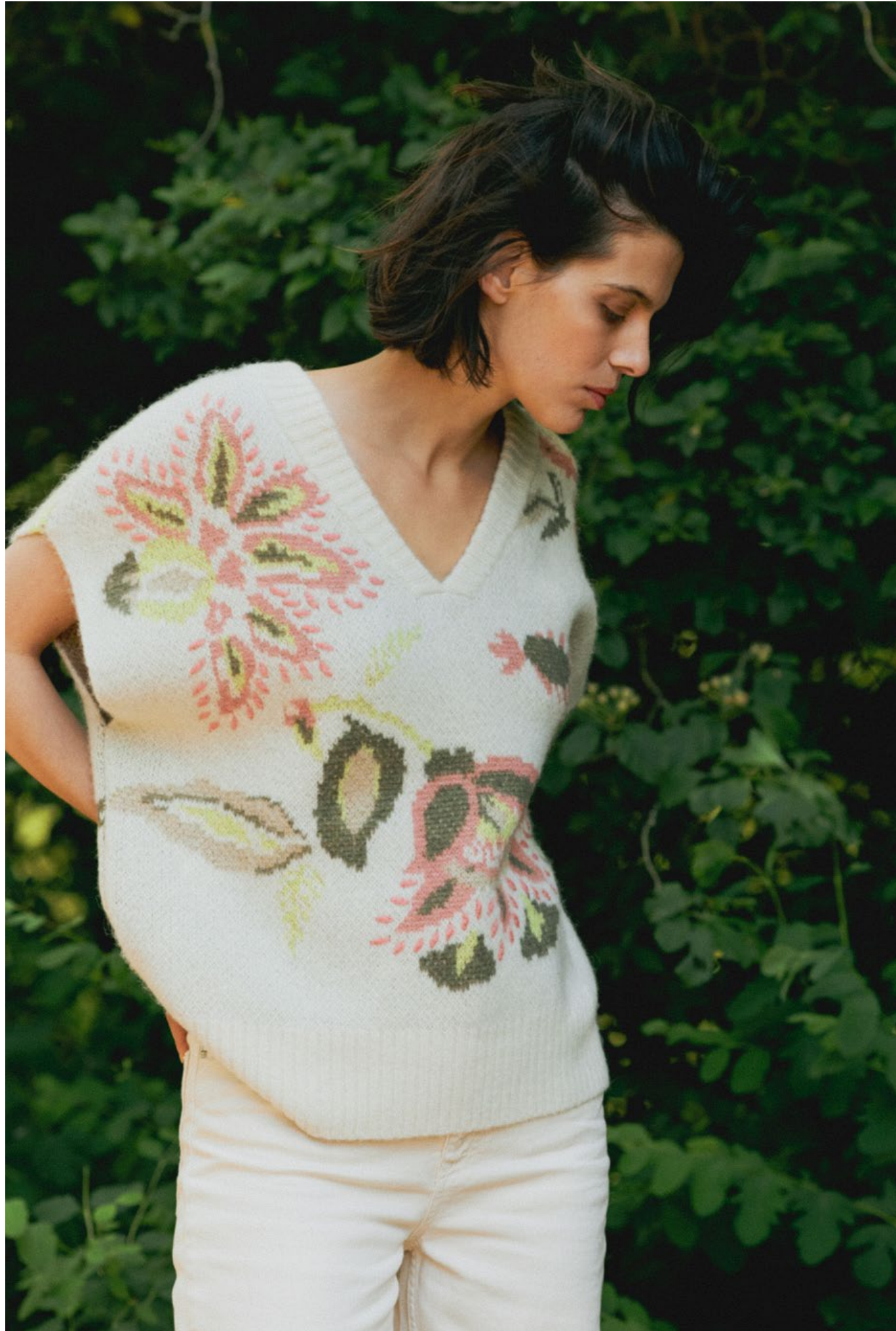
30307542 SHEAPW PULLOVER 30307549 JUDYPW JEANS