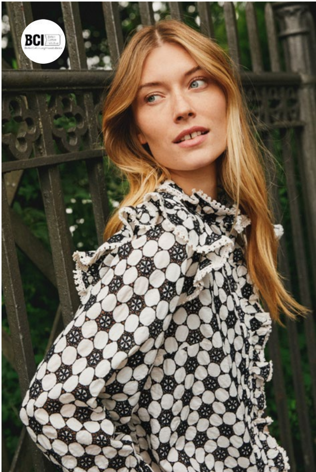
30307570 SANIYAPW SHIRT