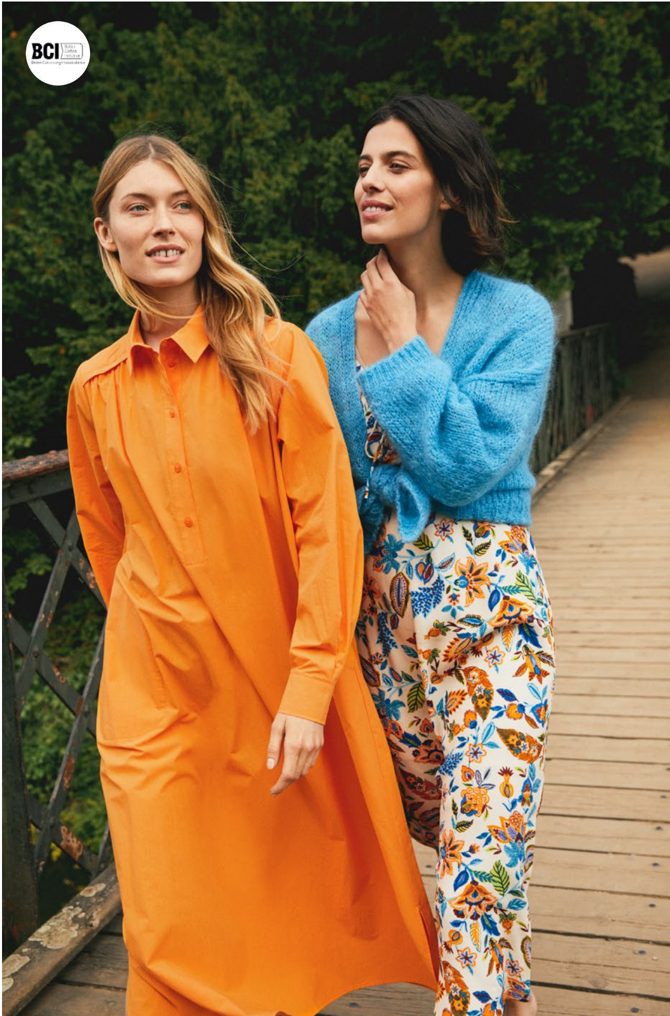
30307612 SMILLAPW DRESS 30307144 RASTINAPW CARDIGAN 30307523 SAMIRAPW DRESS