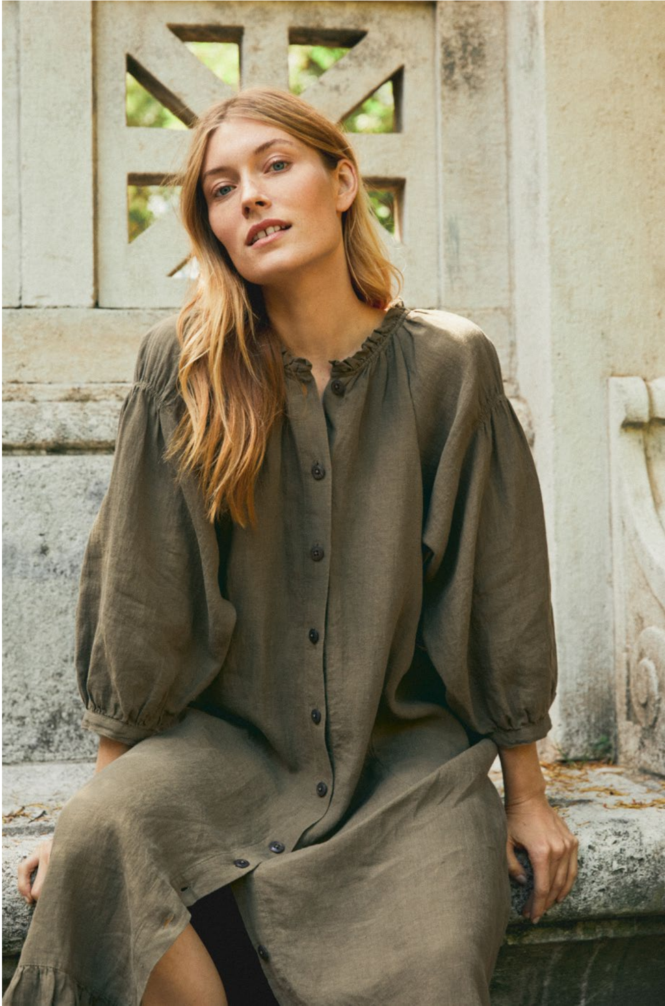
30307508 SISSEPW DRESS