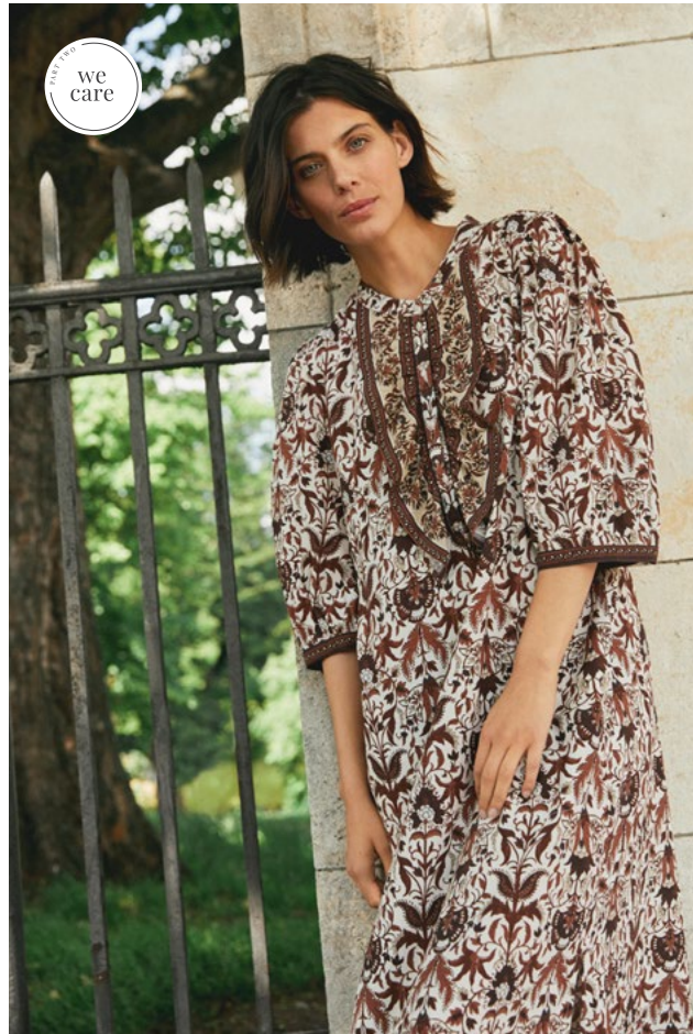
30307609 SALIPW DRESS