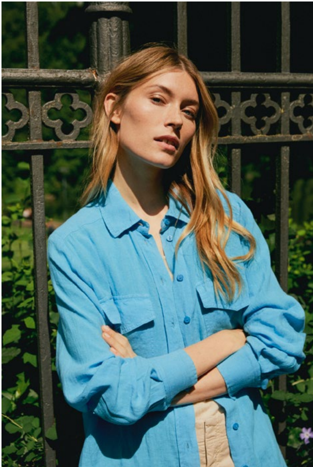
30306622 NAVAPW SHIRT