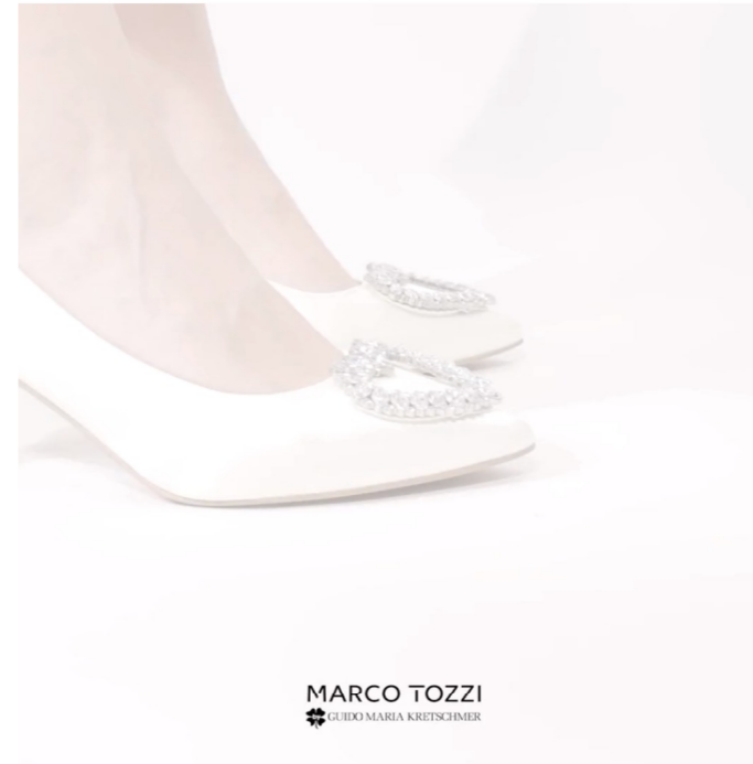
VIDEO OF THE PUMPS 2-2-82401 / 42 443 IVORY SATIN