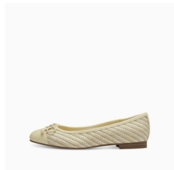
2-22103-42-639 LEMON COMB