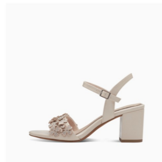
2-88300-42-522 POWDER PATENT