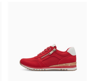
2-23781-41-506 CHERRY COMB