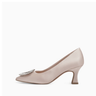
2-82401-42-581 POWDER SATIN