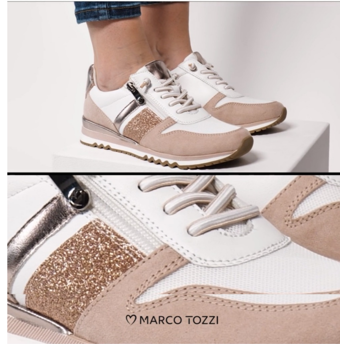
VIDEO OF THE SNEAKER 2-2-23707/41 194 WHITE/POWDER