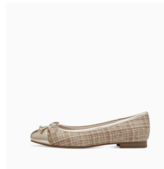
2-22118-42-453 CREAM MULTI