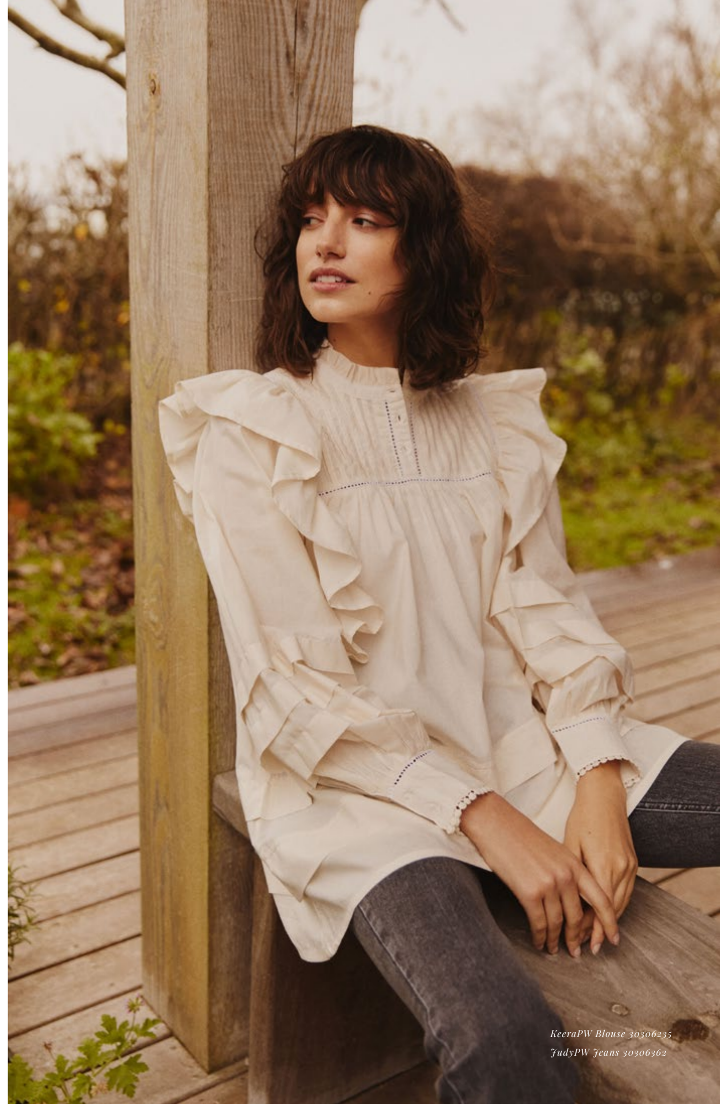
KeeraPW Blouse 30306235 JudyPW Jeans 30306362