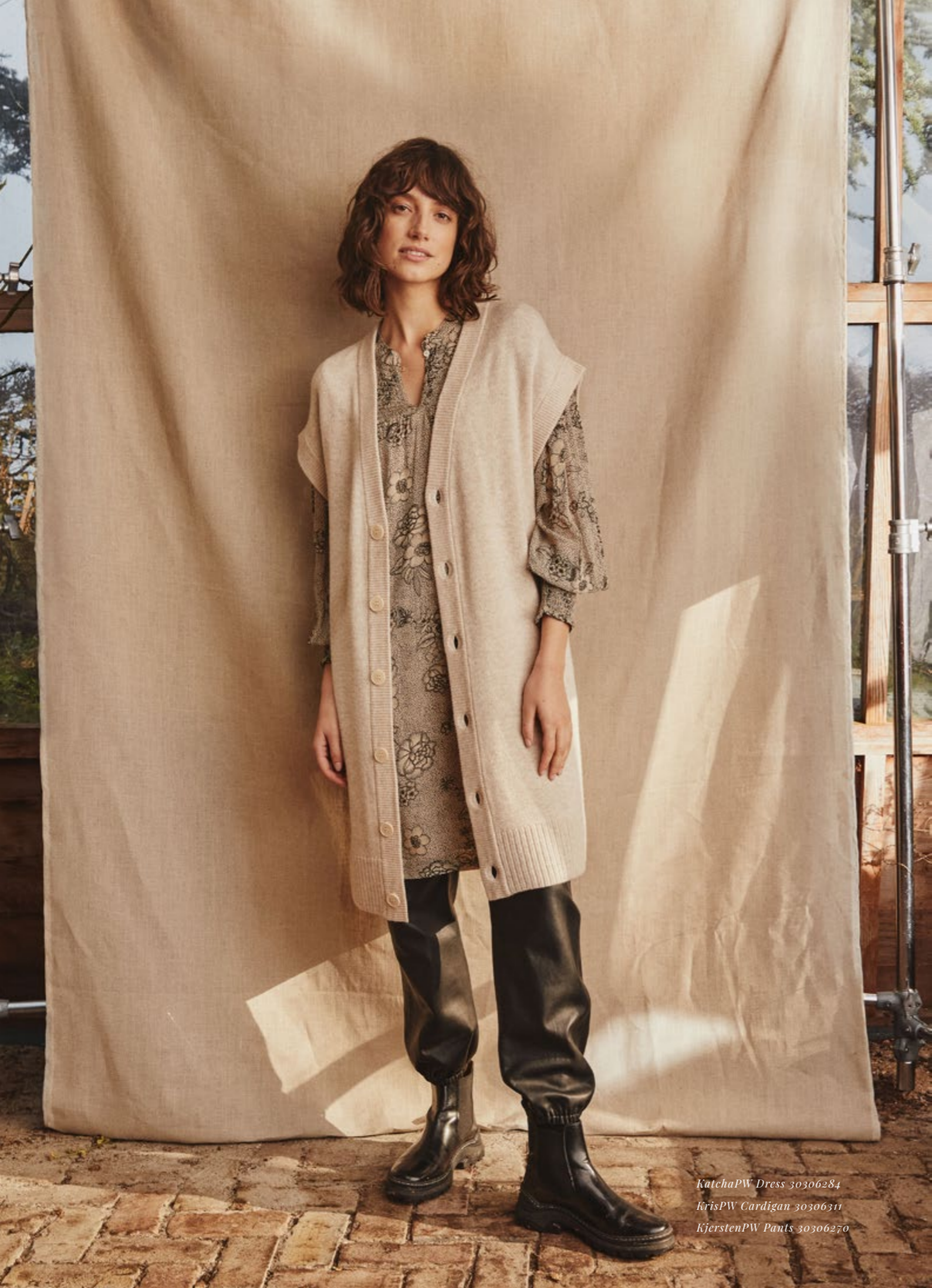
KatchaPW Dress 30306284 KrisPW Cardigan 30306311 KjerstenPW Pants 30306270