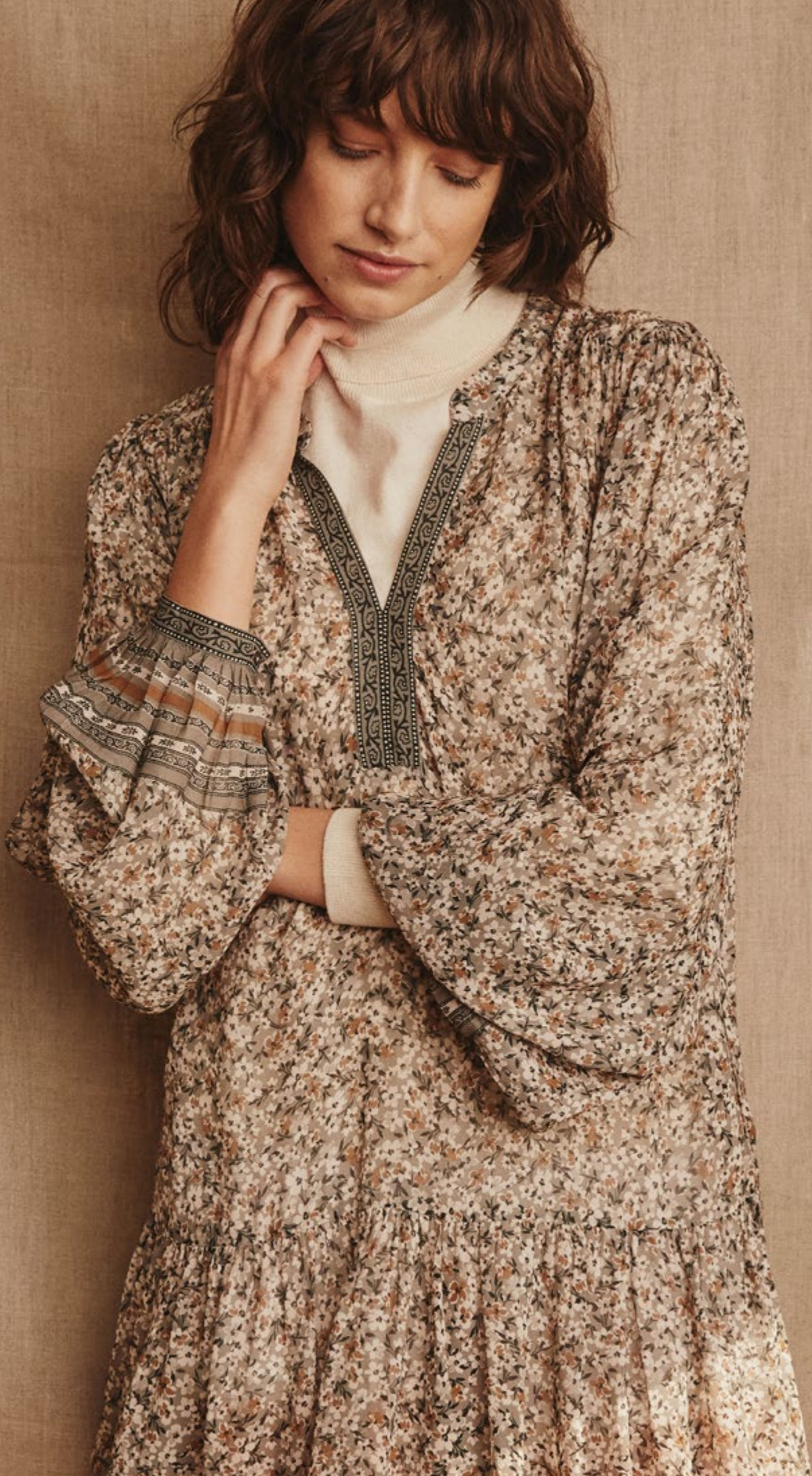
TordisPW Pullover 30304820