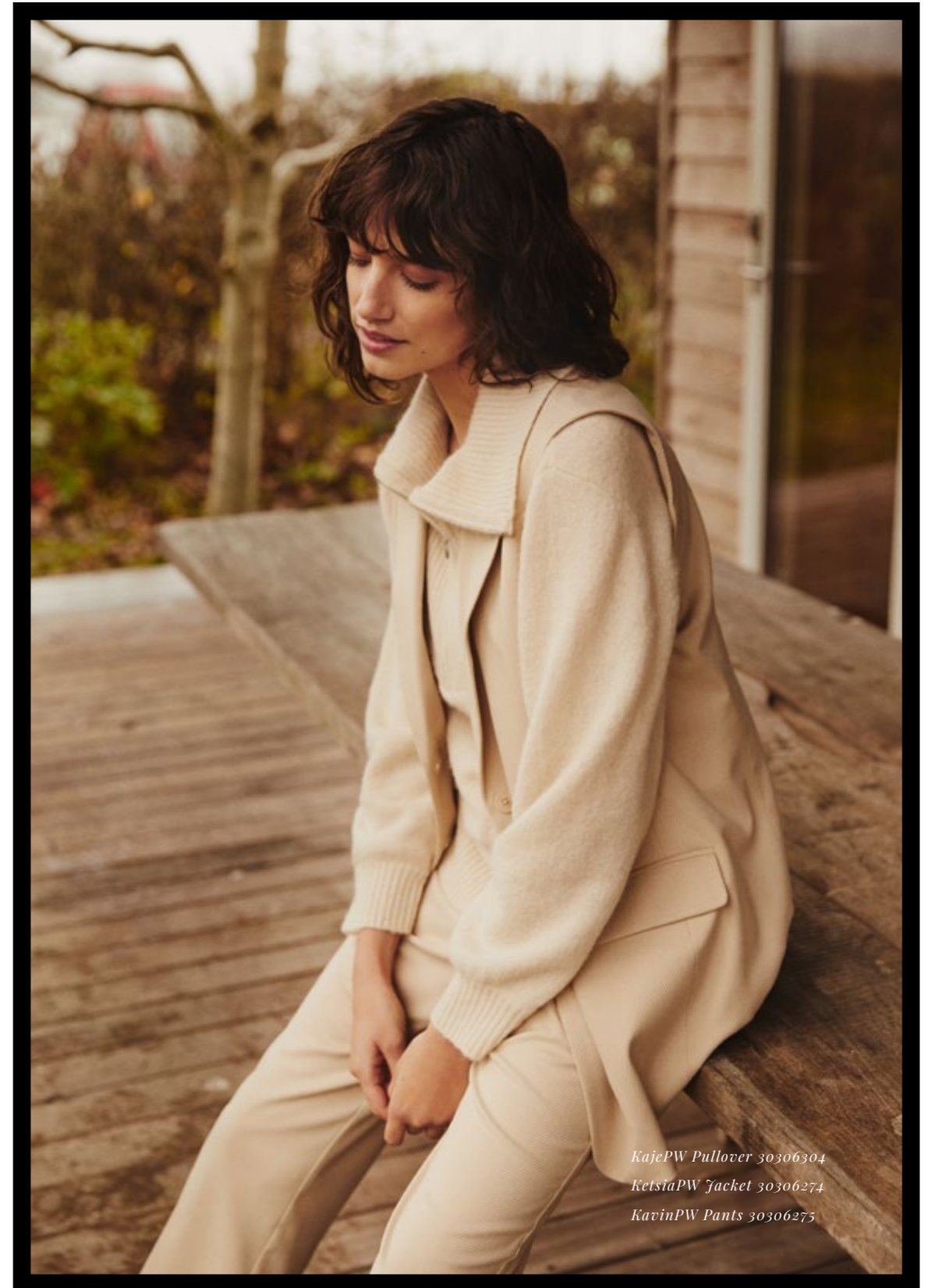
KajePW Pullover 30306304 KetstaPW Jacket 30306274 KavinPW Pants 30306275