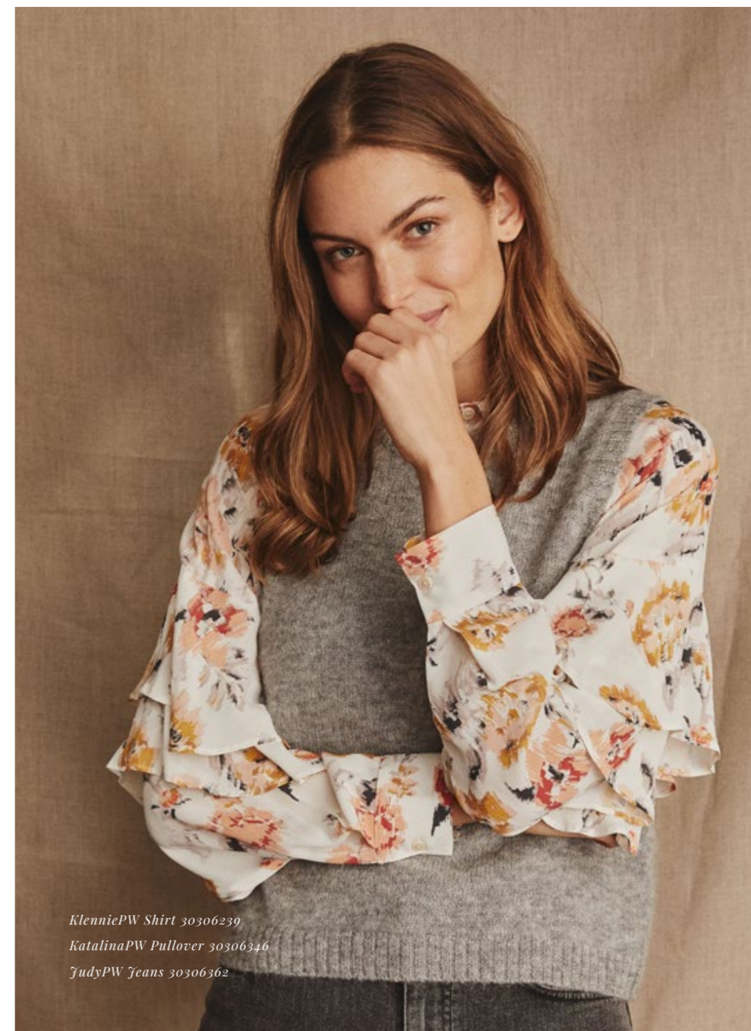
KlenniePW Shirt 30306239 KatalinaPW Pullover 30306346 JudyPW Jeans 30306362