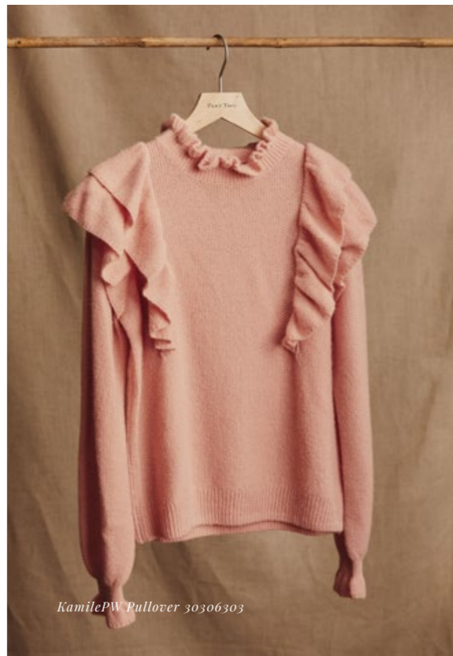
KamilePW Pullover 30306303