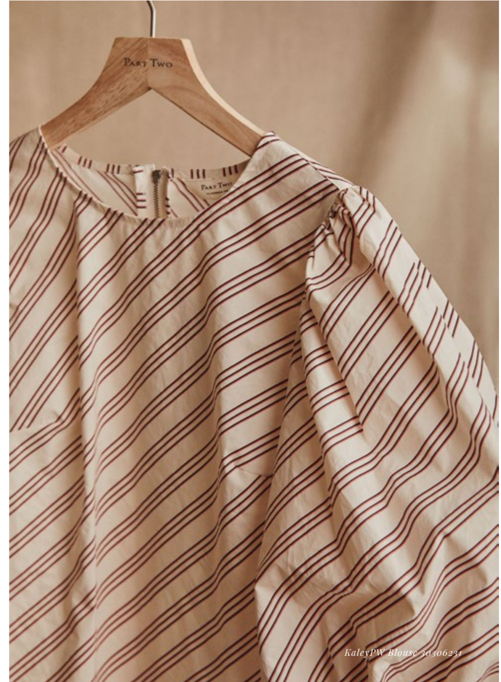
KaleyPW Blouse 30306231