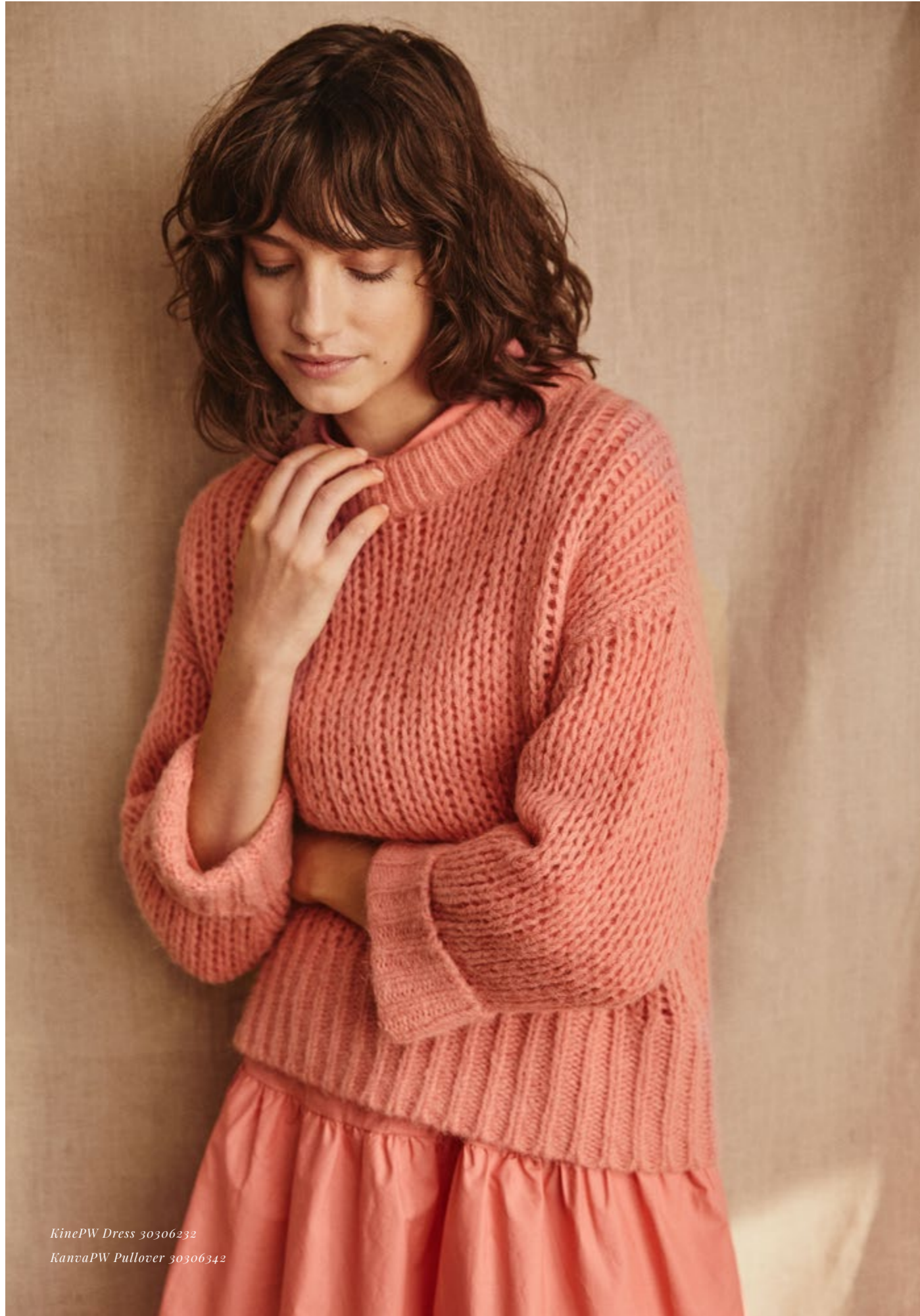
KinePW Dress 30306232 KanvaPW Pullover 30306342