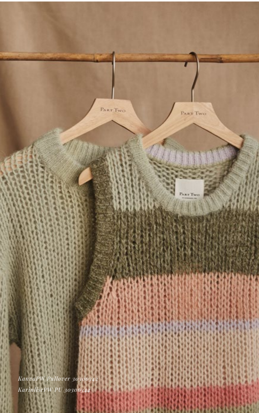
KanaaPW Pullover 30306342 KarinlisePW PU 30306344