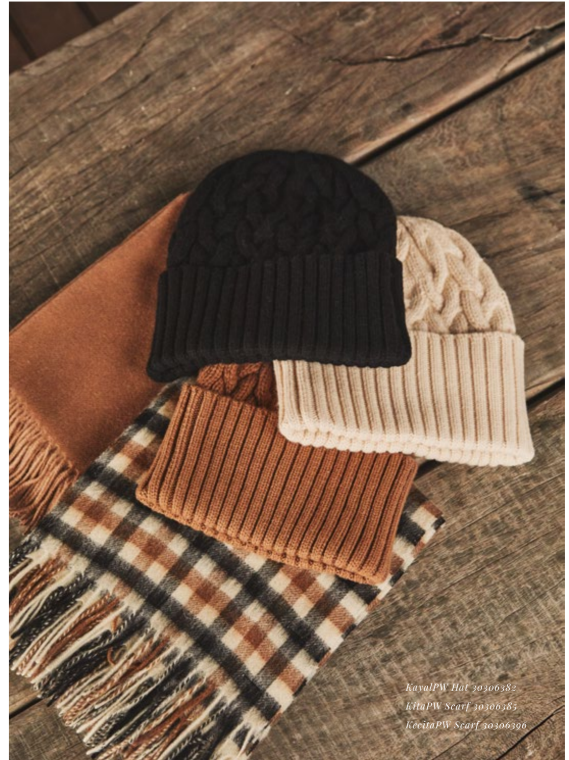
KayaPW Hat 30306382 KitaPW Scarf 30306385 KecitaPW Scarf 30306396