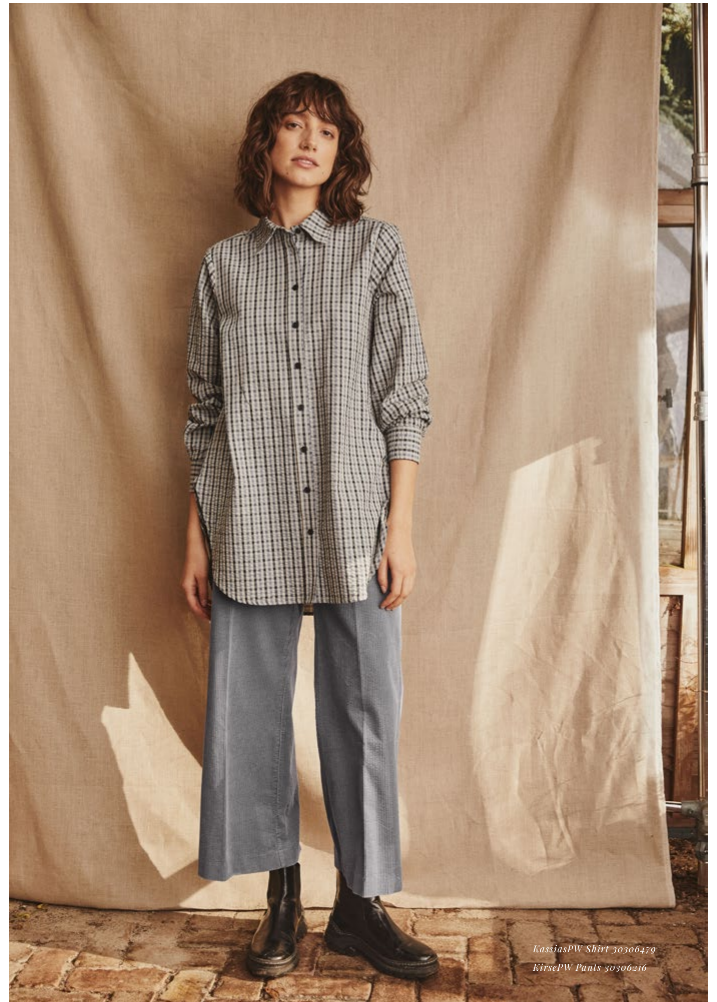
KassiasPW Shirt 30306479 KirsePW Pants 30306216