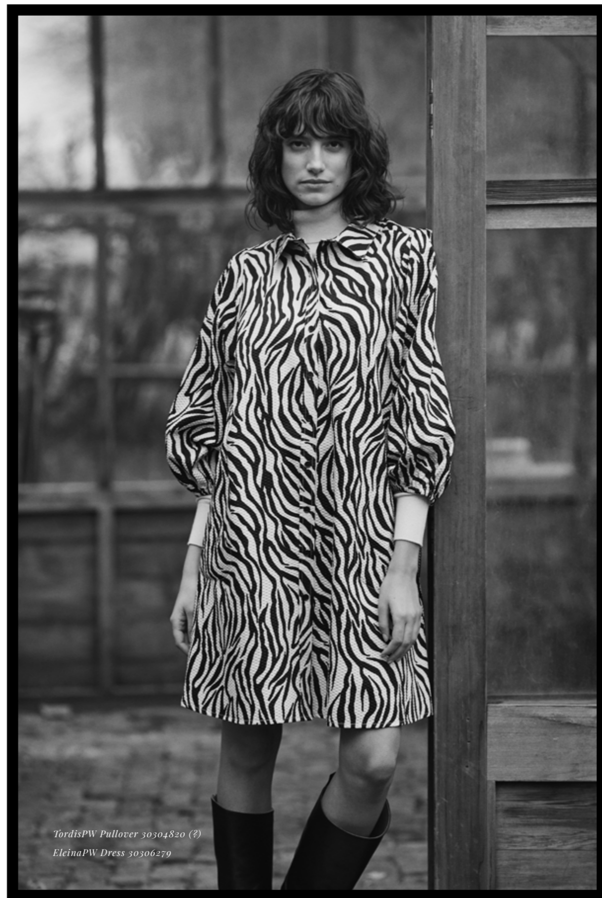
TordisPW Pullover 30304820 (?) EleinaPW Dress 30306279