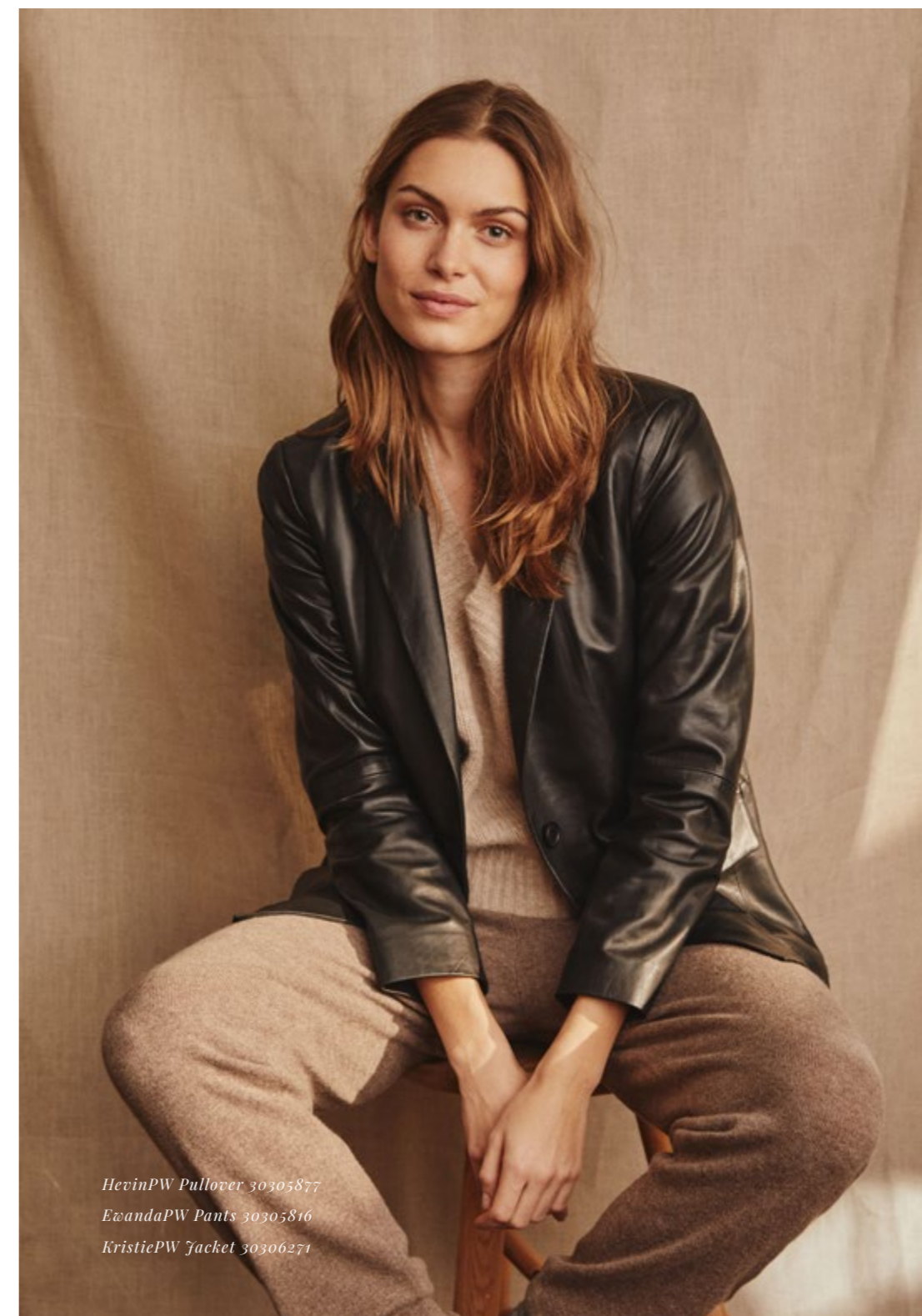
HevinPW Pullover 30305877 EwandaPW Pants 30305816 KristiePW Jacket 30306271