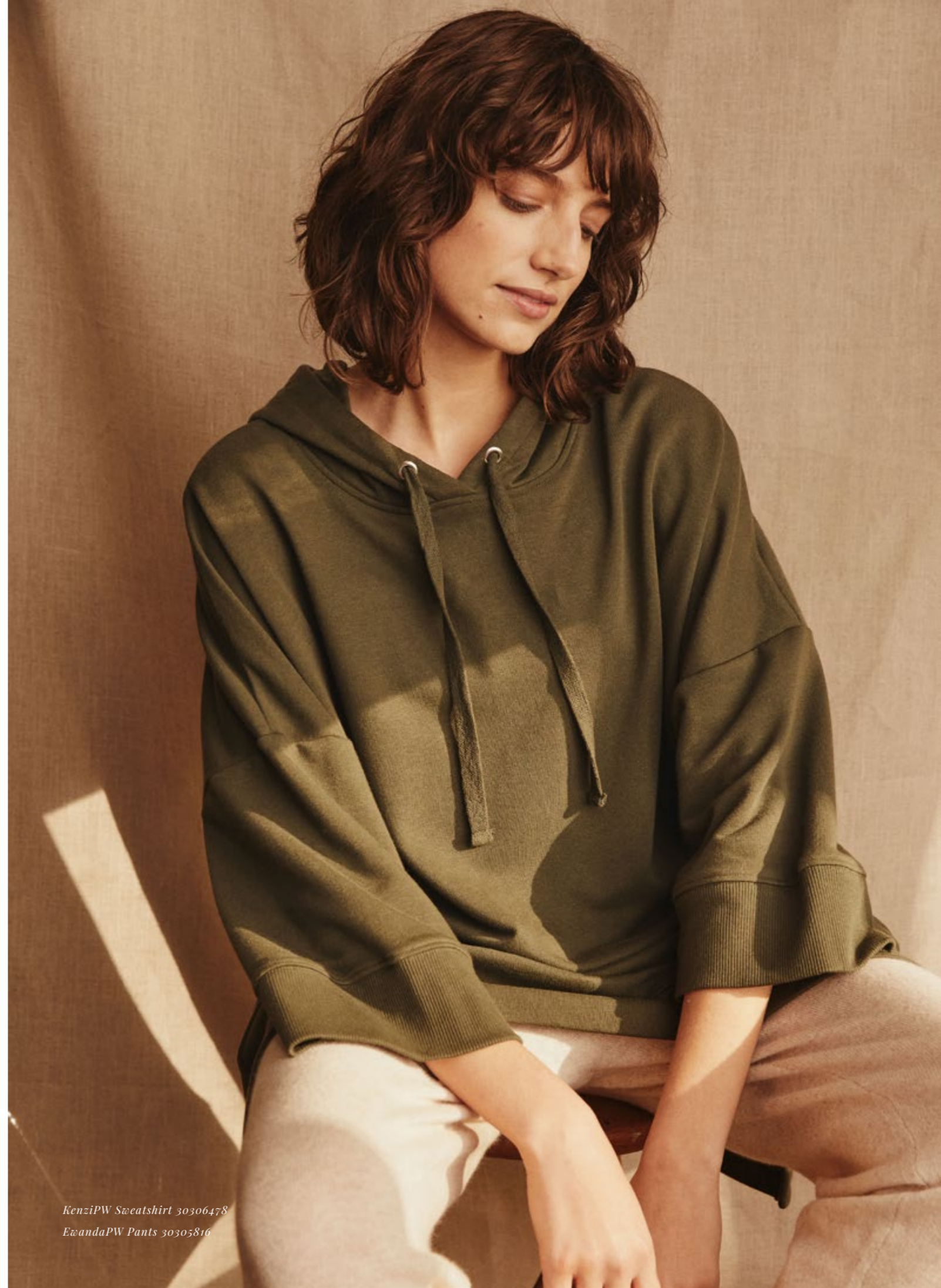
KenziPW Sweatshirt 30306478 EwandaPW Pants 30305816