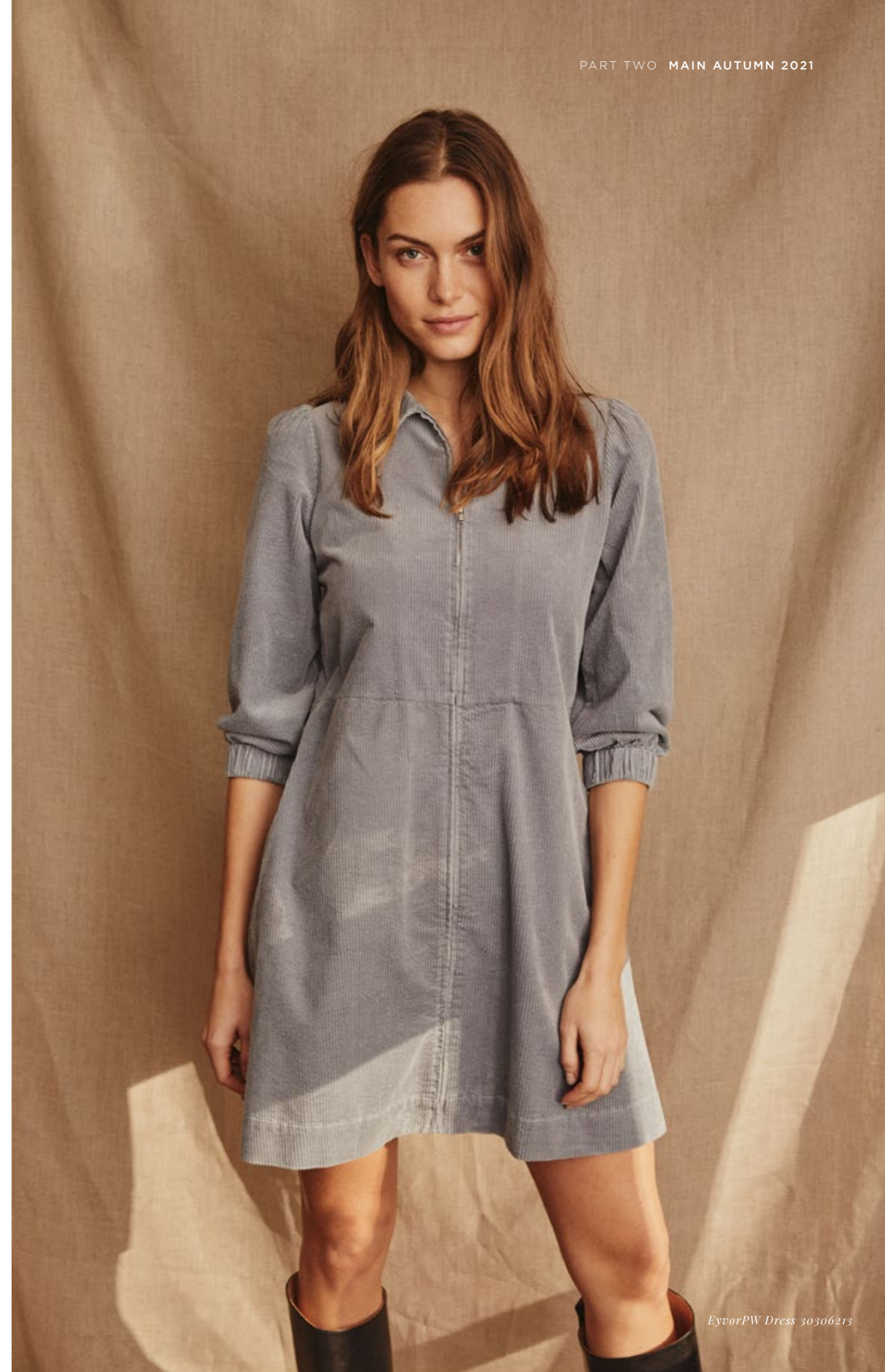
EyvorPW Dress 30306213