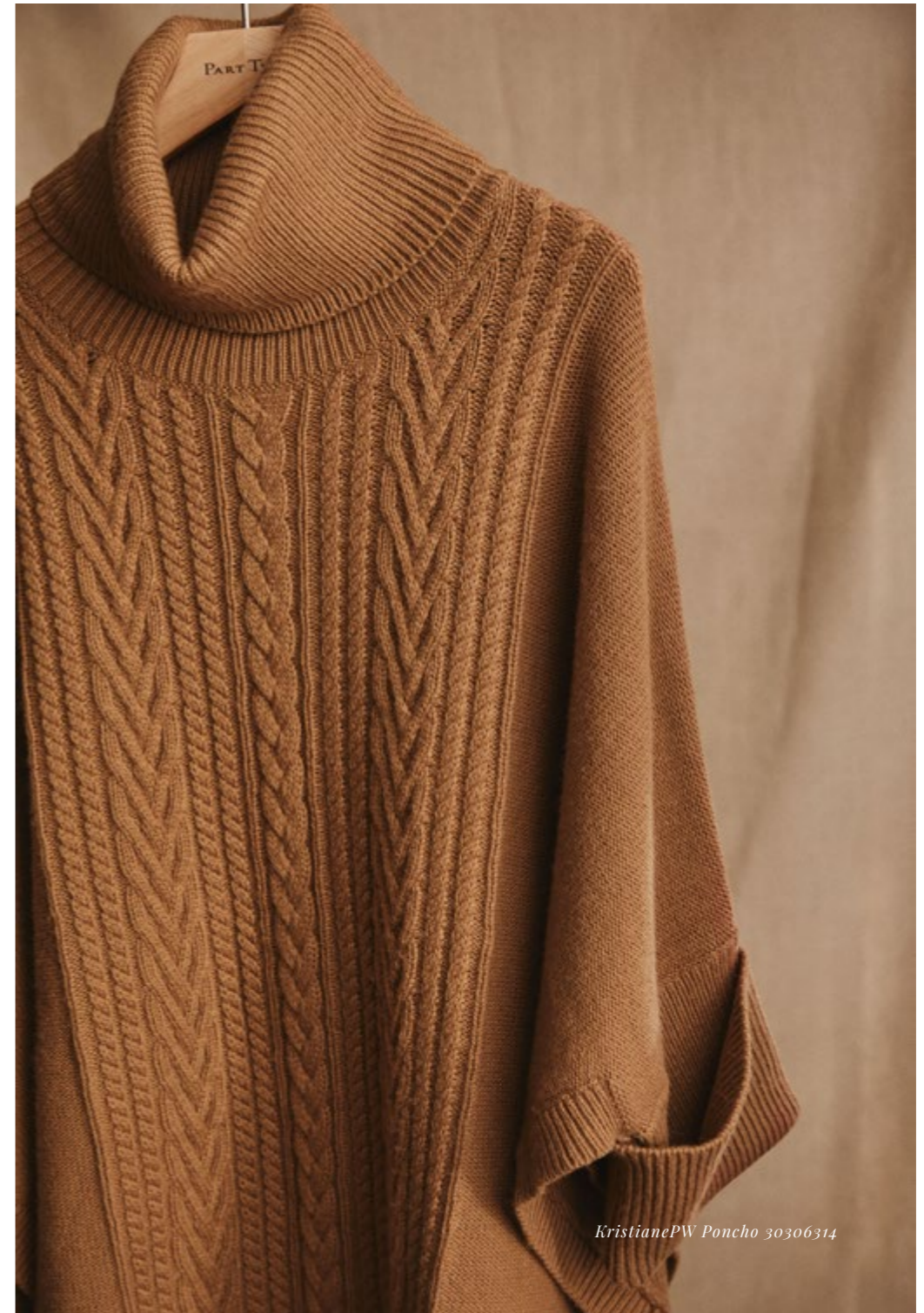
KristianePW Poncho 30306314