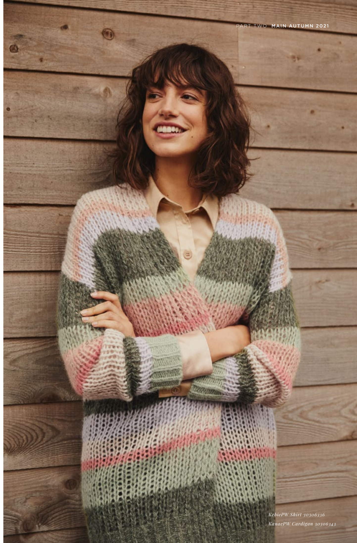
KebiePW Shirt 30306336 KanaePW Cardigan 30306343