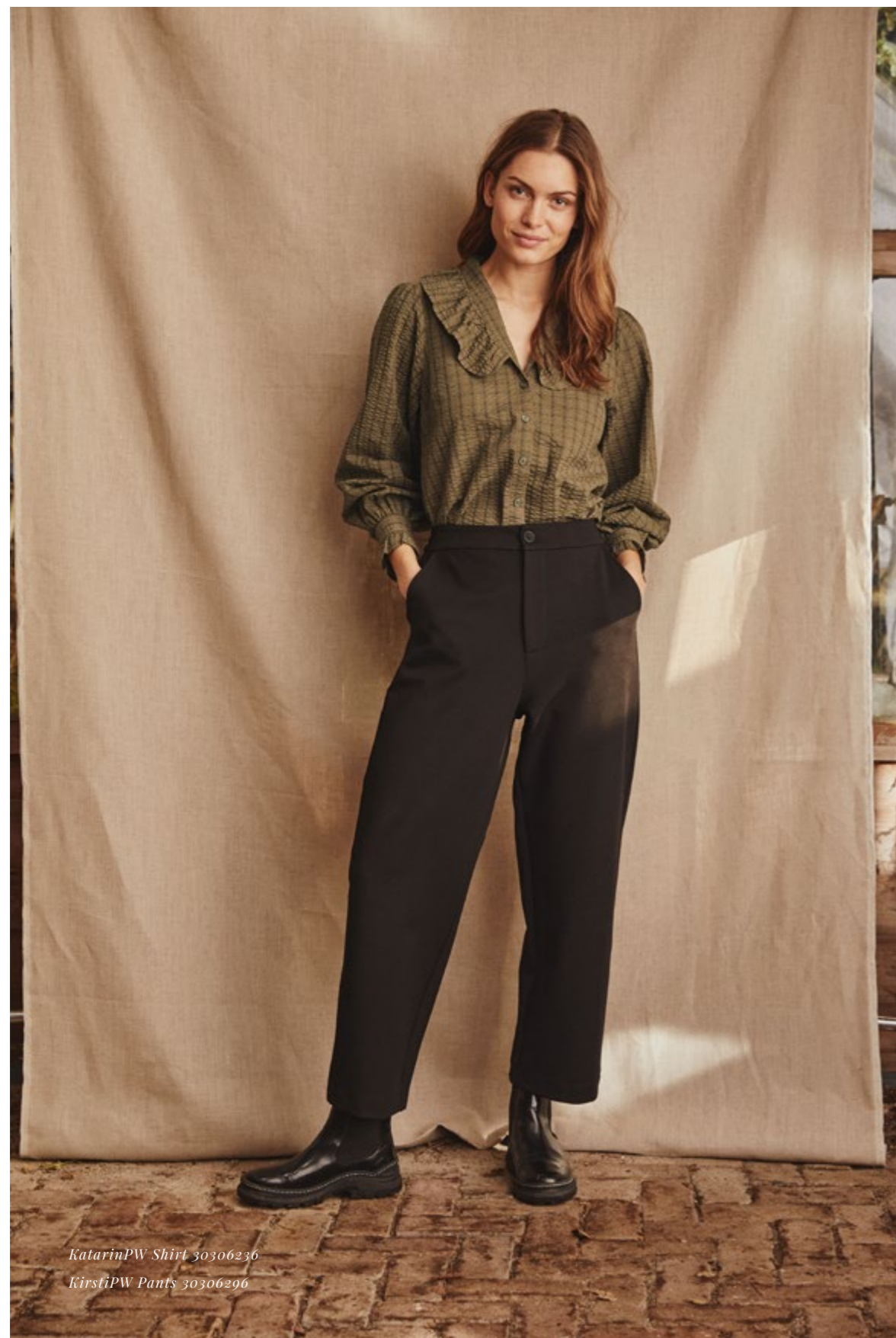
KatarinPW Shirt 30306236 KirstiPW Pants 30306296