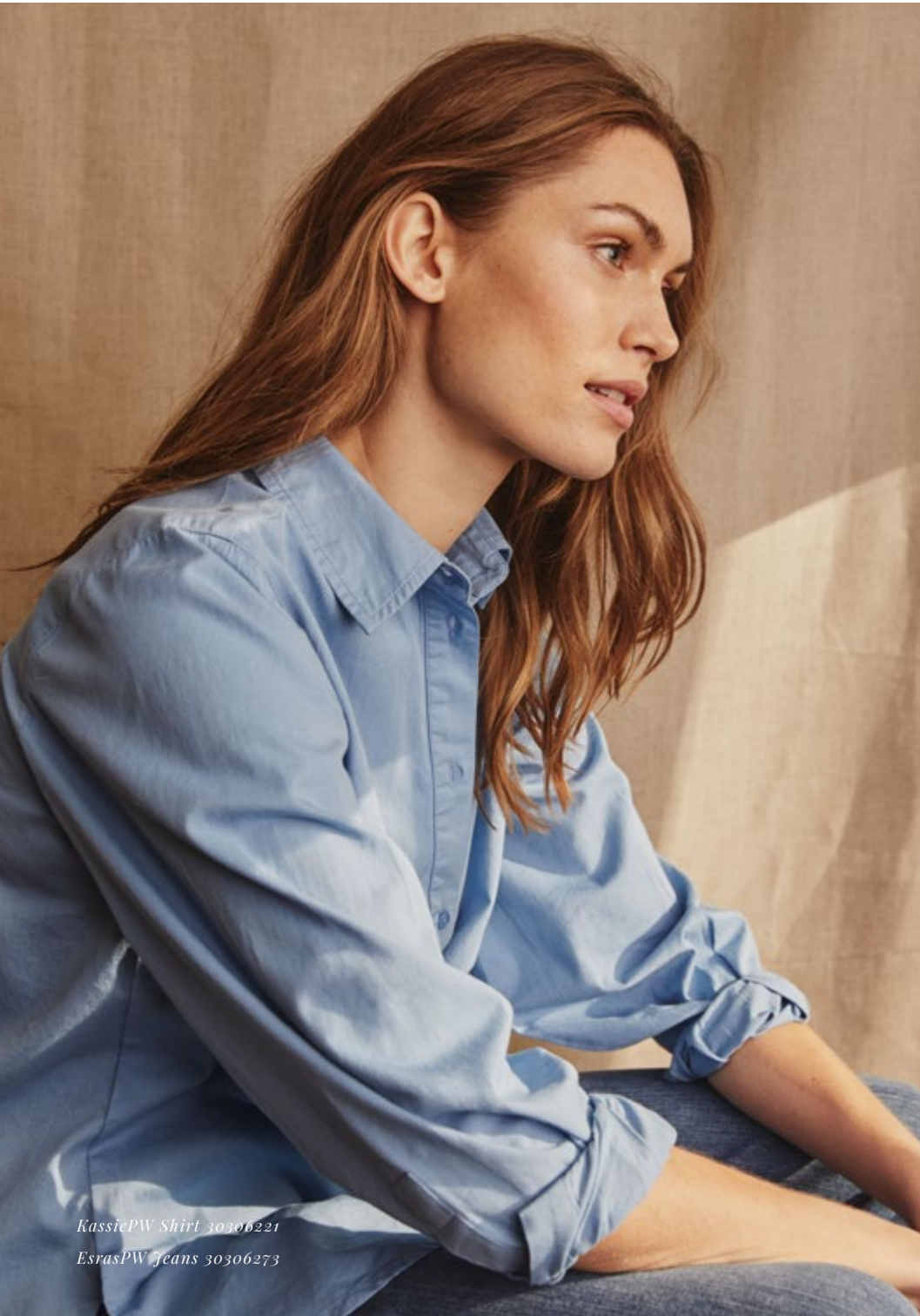
KassiePW Shirt 30306221 EsrasPW Jeans 30306273