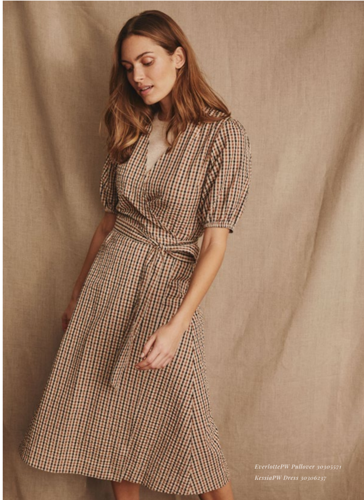
EverlottePW Pullover 30305571 KessiaPW Dress 30306237