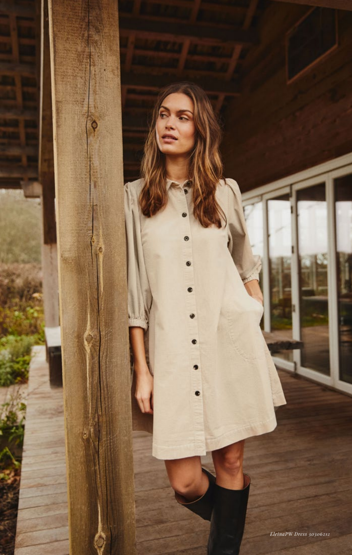
EleinaPW Dress 30306212