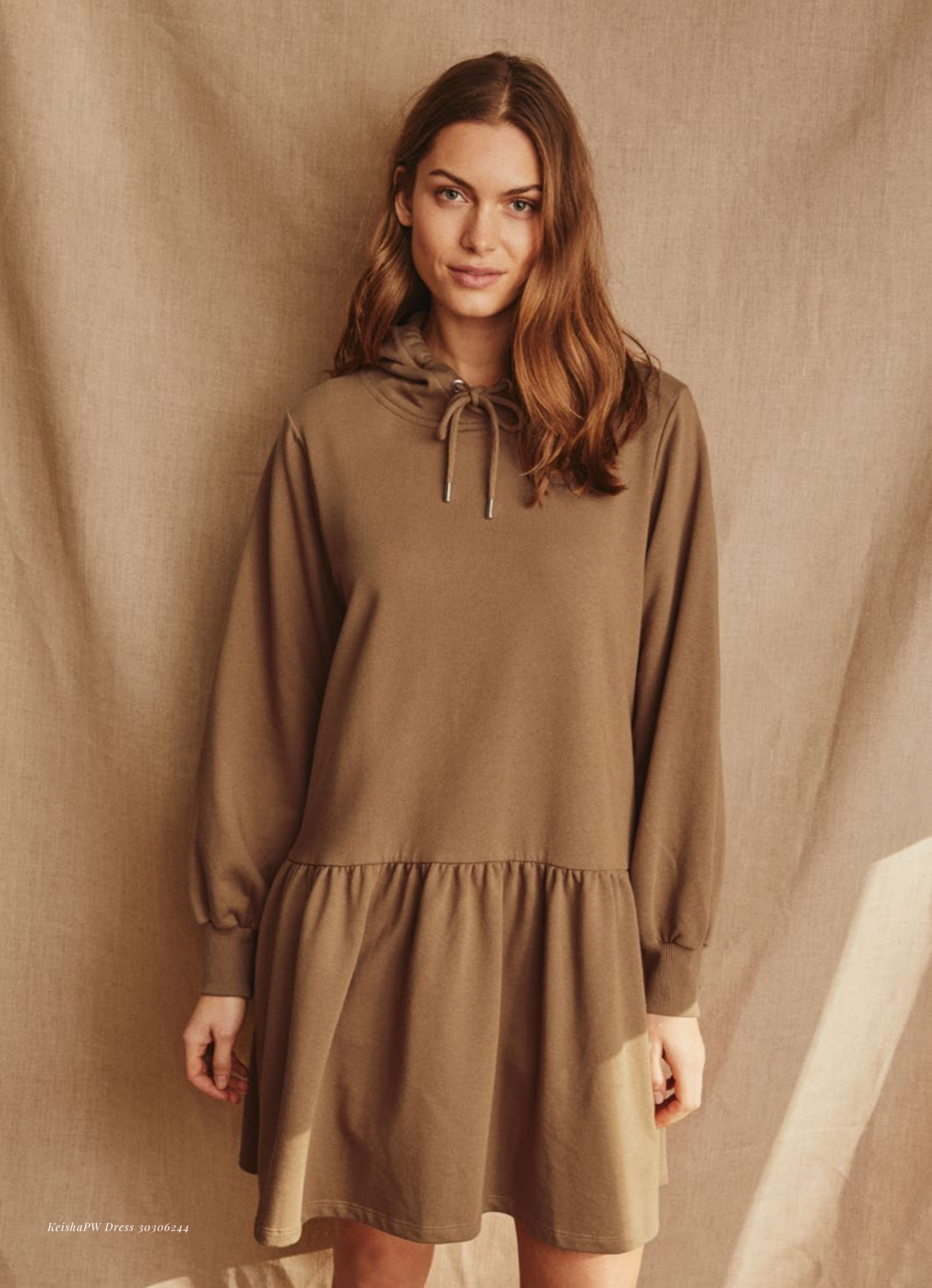
KeishaPW Dress 30306244