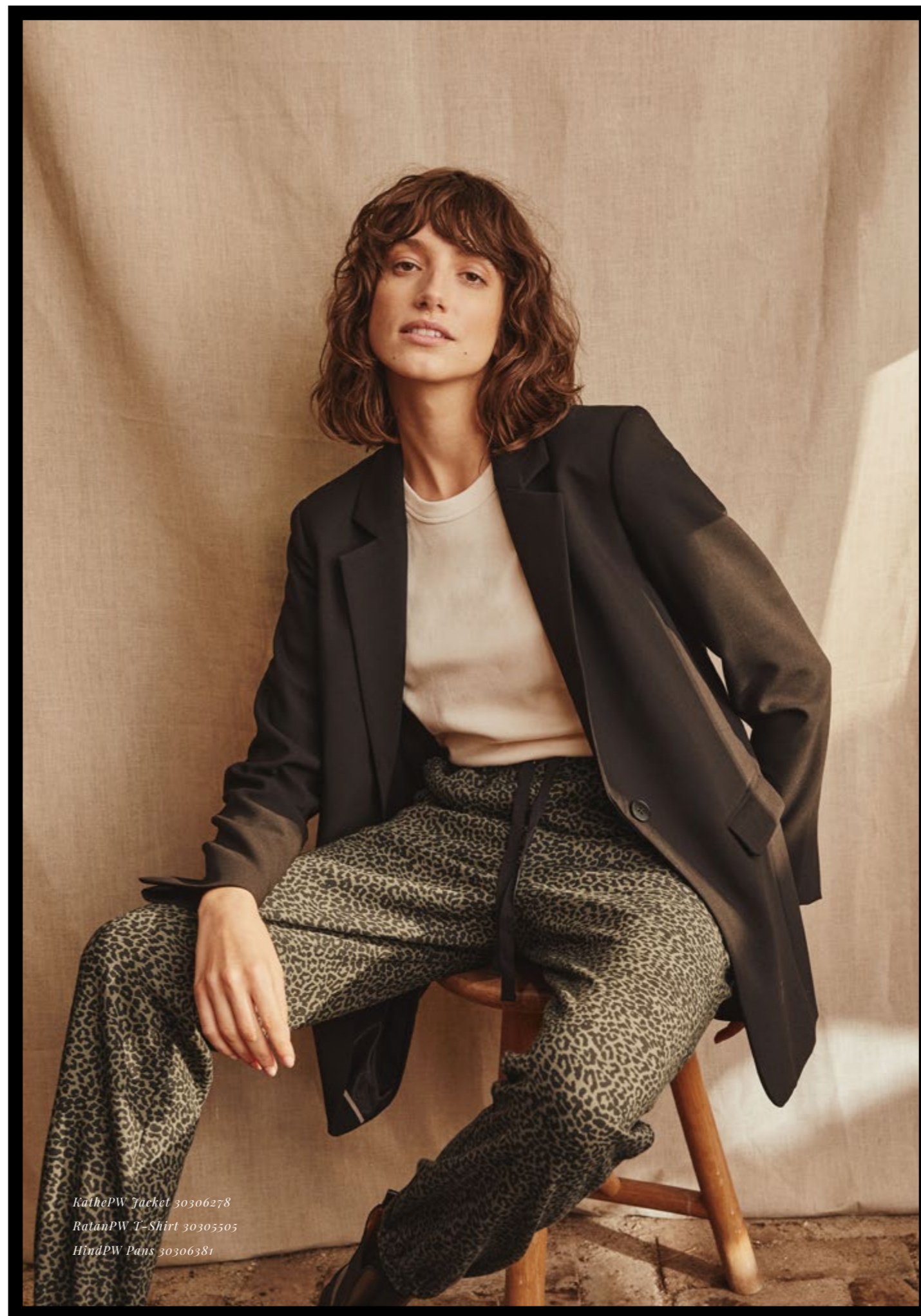
KathePW Jacket 30306278 RatanPW T-Shirt 30305505 HindPW Pans 30306381