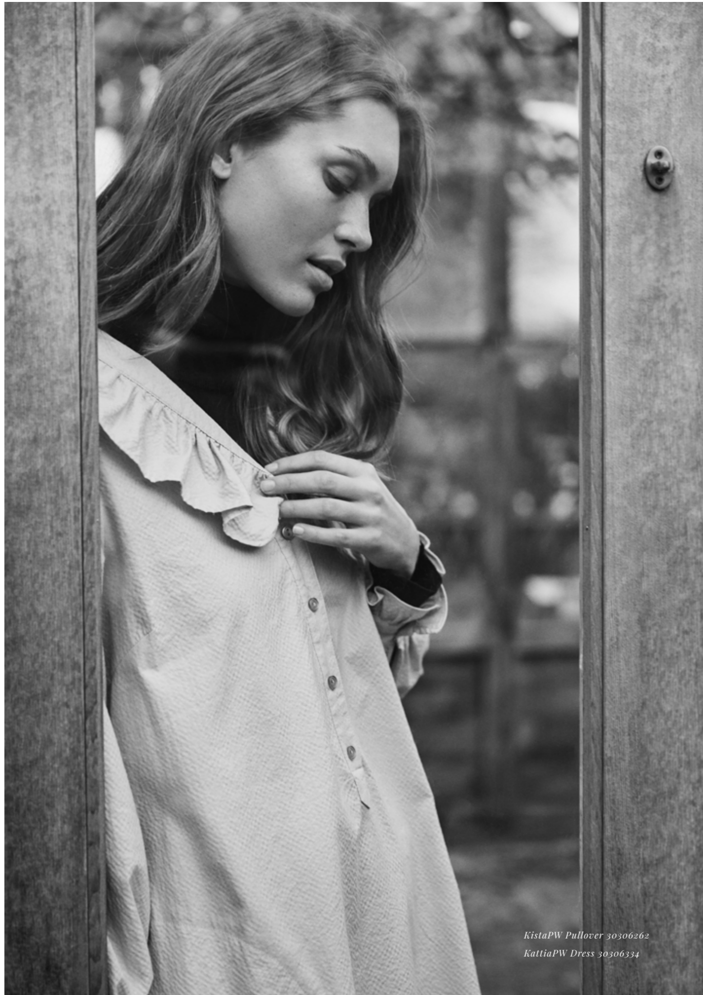
KistaPW Pullover 30306262 KaltiaPW Dress 30306334