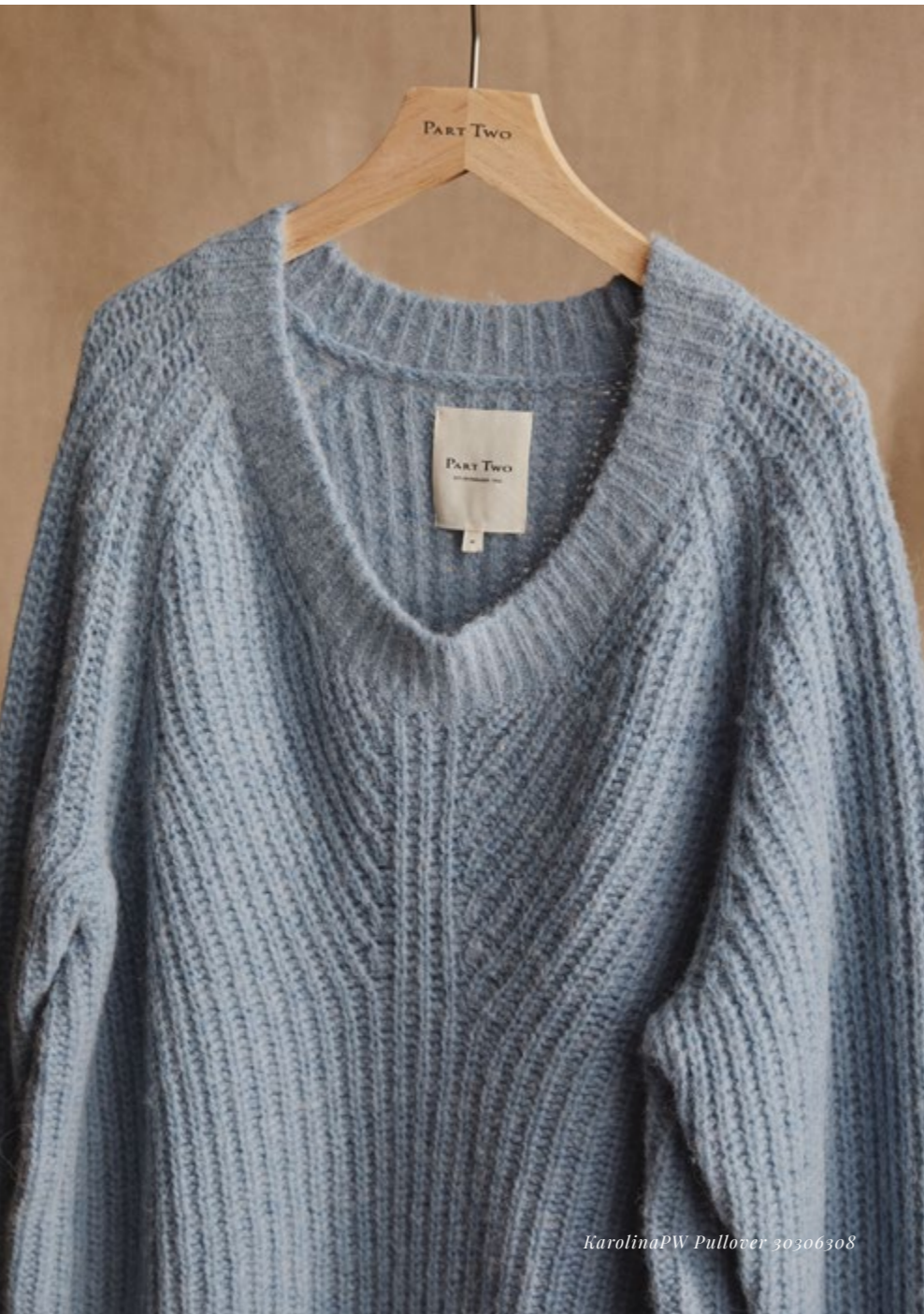
KarolinaPW Pullover 30306308