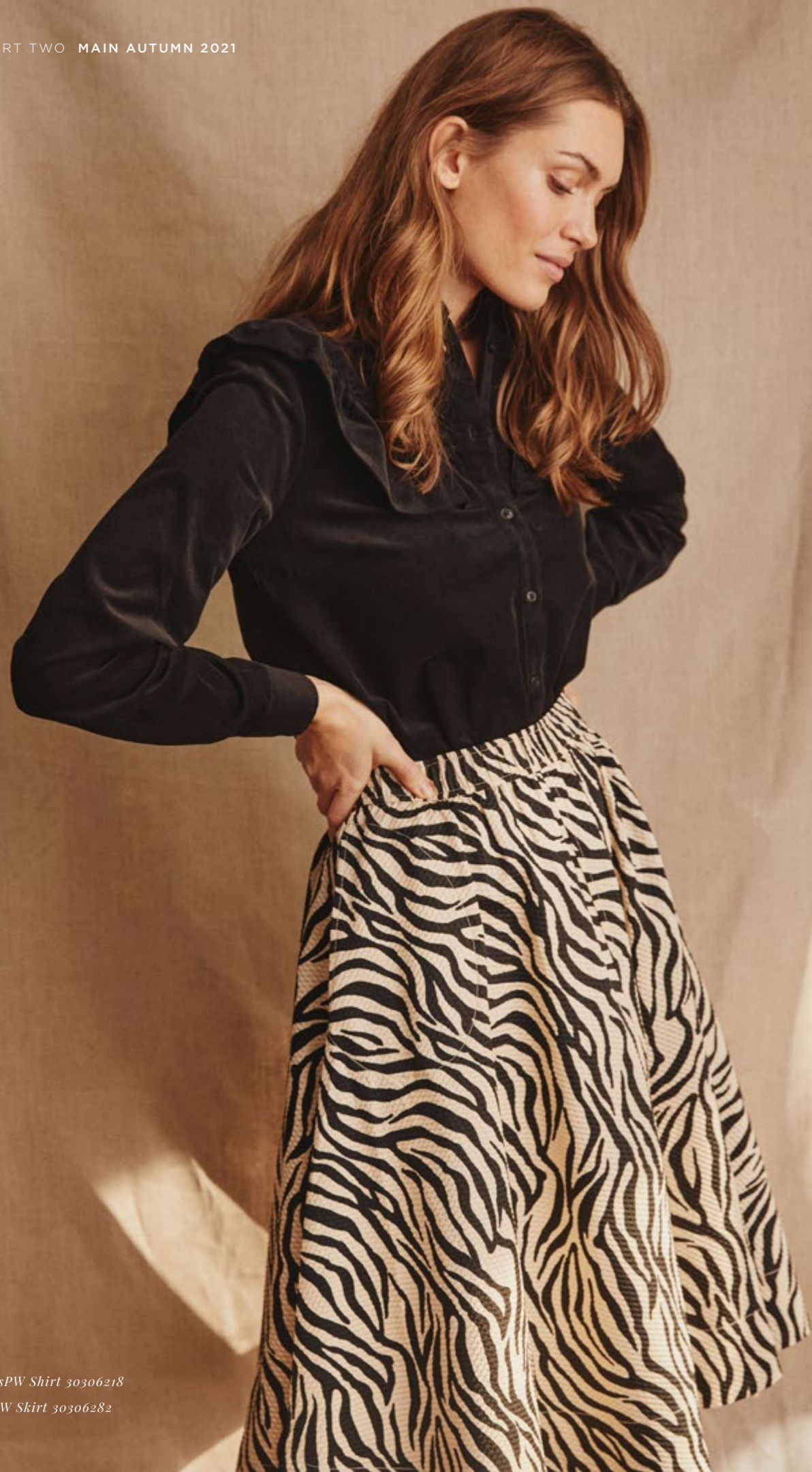
HerdisPW Shirt 30306218 IngaPW Skirt 30306282