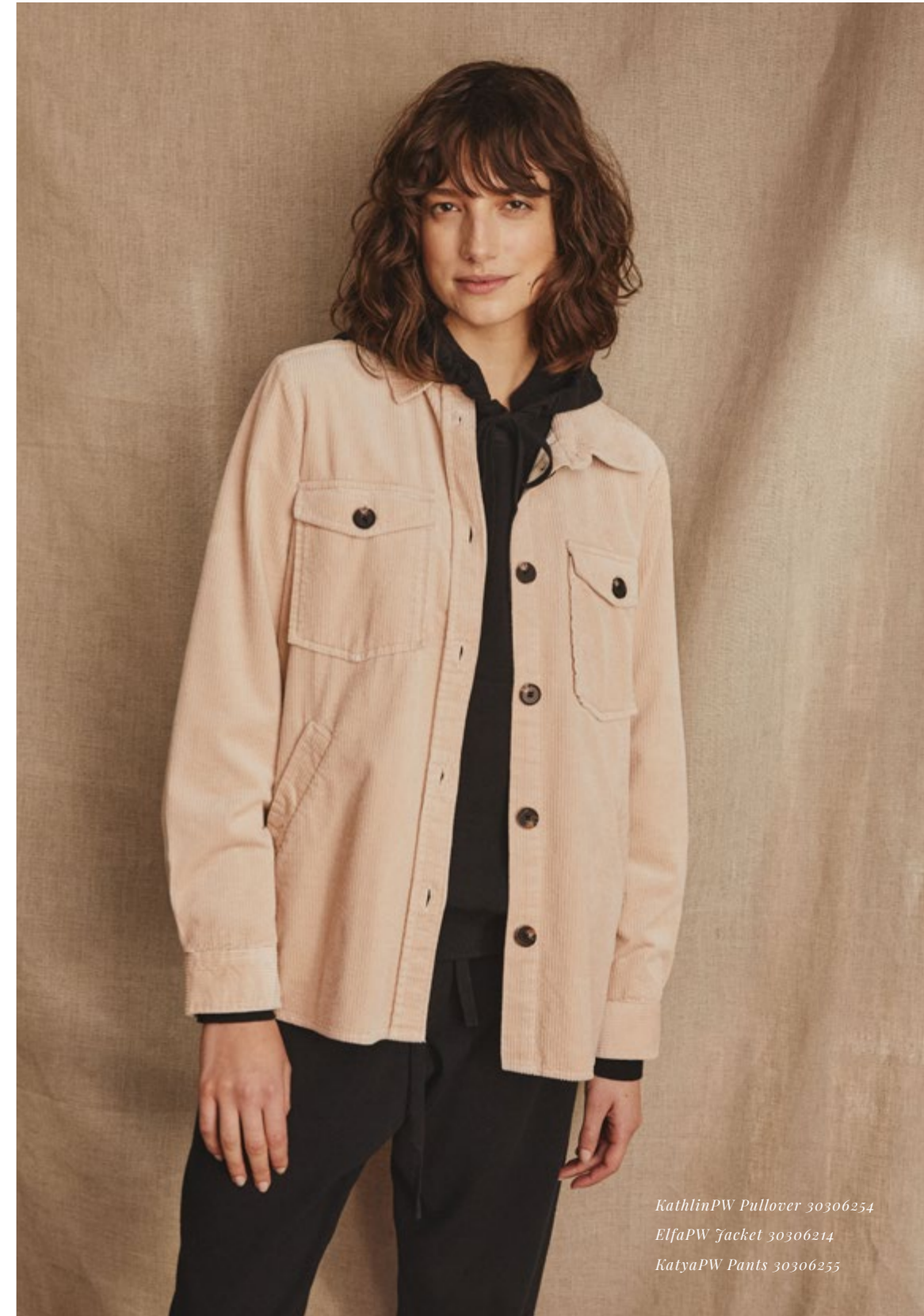
KathlinPW Pullover 30306254 ElfaPW Jacket 30306214 KatyaPW Pants 30306255