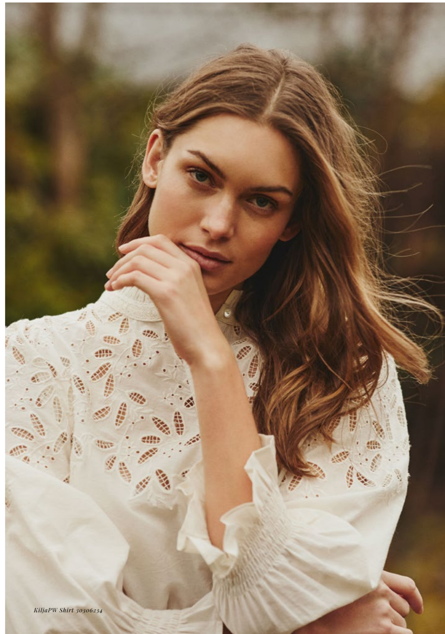
KiljaPW Shirt 30306234