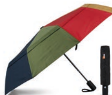
RAINBOW ONE SIZE RECYCLED NYLON