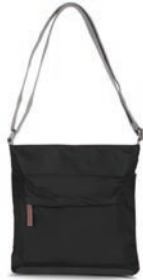
BLACK ONE SIZE RECYCLED NYLON