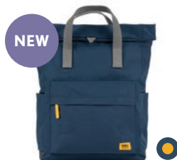
YELLOW LABEL DEEP BLUE MEDIUM RECYCLED CANVAS