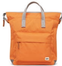
ATOMIC ORANGE MEDIUM RECYCLED CANVAS