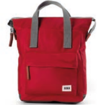
CRANBERRY SMALL RECYCLED NYLON