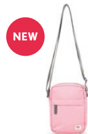
ROSE ONE SIZE RECYCLED CANVAS