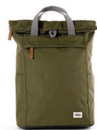
MOSS SMALL, MEDIUM & LARGE RECYCLED CANVAS