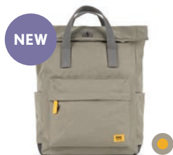
YELLOW LABEL CORIANDER MEDIUM RECYCLED CANVAS