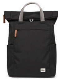
ASH SMALL, MEDIUM & LARGE RECYCLED CANVAS