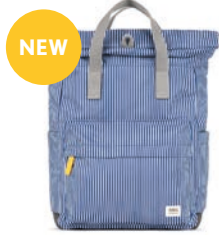
CANFIELD C HICKORY STRIPE MEDIUM RECYCLED CANVAS