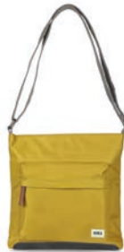
CORN ONE SIZE RECYCLED NYLON