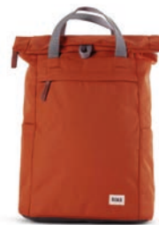
ROOIBOS SMALL & LARGE RECYCLED CANVAS