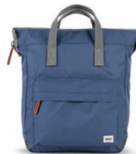
BURNT BLUE MEDIUM RECYCLED CANVAS