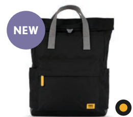
YELLOW LABEL ASH MEDIUM RECYCLED CANVAS