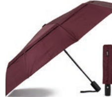
PLUM ONE SIZE RECYCLED NYLON