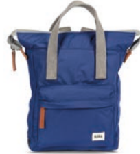
BURNT BLUE SMALL RECYCLED NYLON