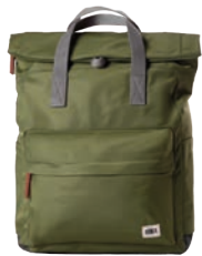
AVOCADO SMALL & MEDIUM RECYCLED NYLON