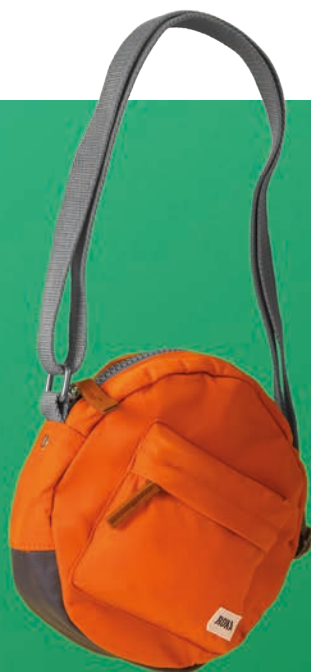
PADDINGTON BURNT ORANGE