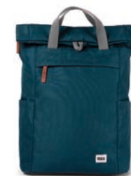
TEAL SMALL & MEDIUM RECYCLED CANVAS