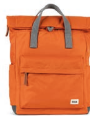
BURNT ORANGE SMALL & MEDIUM RECYCLED NYLON