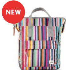
MULTI STRIPE SMALL RECYCLED CANVAS