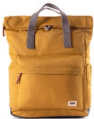
CORN MEDIUM RECYCLED NYLON