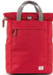
MARS RED SMALL, MEDIUM & LARGE RECYCLED CANVAS