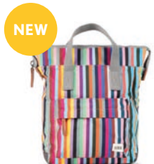
BANTRY B MULTI STRIPE SMALL RECYCLED CANVAS