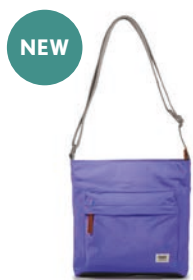
SIMPLE PURPLE ONE SIZE RECYCLED NYLON