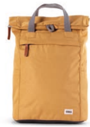
FLAX SMALL & MEDIUM RECYCLED CANVAS