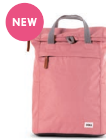
ROSE SMALL & MEDIUM RECYCLED CANVAS