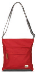
CRANBERRY ONE SIZE RECYCLED NYLON