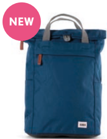
MARINE SMALL, MEDIUM & LARGE RECYCLED CANVAS