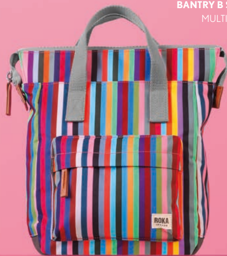
BANTRY B SMALL MULTI STRIPE

We release prints across a number of our styles. They always sell out fast so be quick.