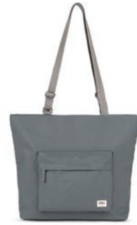
SMOKE MEDIUM RECYCLED CANVAS