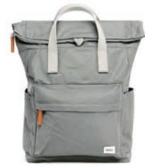
STORMY MEDIUM RECYCLED NYLON