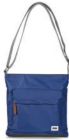
BURNT BLUE ONE SIZE RECYCLED NYLON