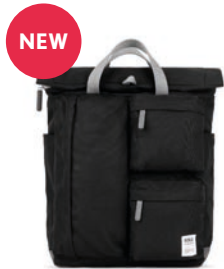
ASH MEDIUM RECYCLED CANVAS