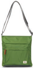
AVOCADO ONE SIZE RECYCLED NYLON