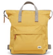
FLAX MEDIUM RECYCLED CANVAS