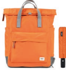
BURNT ORANGE MEDIUM RECYCLED NYLON