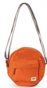
BURNT ORANGE ONE SIZE RECYCLED NYLON