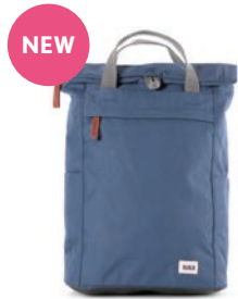
AIRFORCE SMALL, MEDIUM & LARGE RECYCLED CANVAS