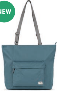
AIRFORCE MEDIUM RECYCLED CANVAS