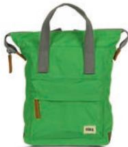
GREEN APPLE SMALL RECYCLED NYLON