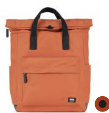
BLACK LABEL ROOIBOS MEDIUM RECYCLED NYLON