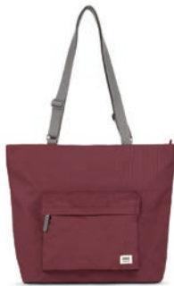
ZINFANDEL MEDIUM RECYCLED CANVAS