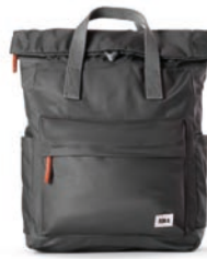
GRAPHITE MEDIUM RECYCLED NYLON