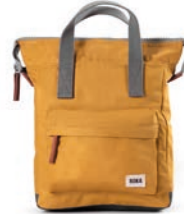
CORN SMALL RECYCLED NYLON