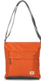
BURNT ORANGE ONE SIZE RECYCLED NYLON