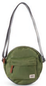
AVOCADO ONE SIZE RECYCLED NYLON