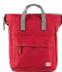
MARS RED MEDIUM RECYCLED CANVAS