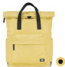
BLACK LABEL BAMBOO MEDIUM RECYCLED NYLON