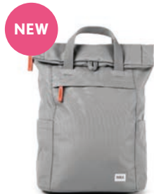
STORMY SMALL, MEDIUM & LARGE RECYCLED CANVAS