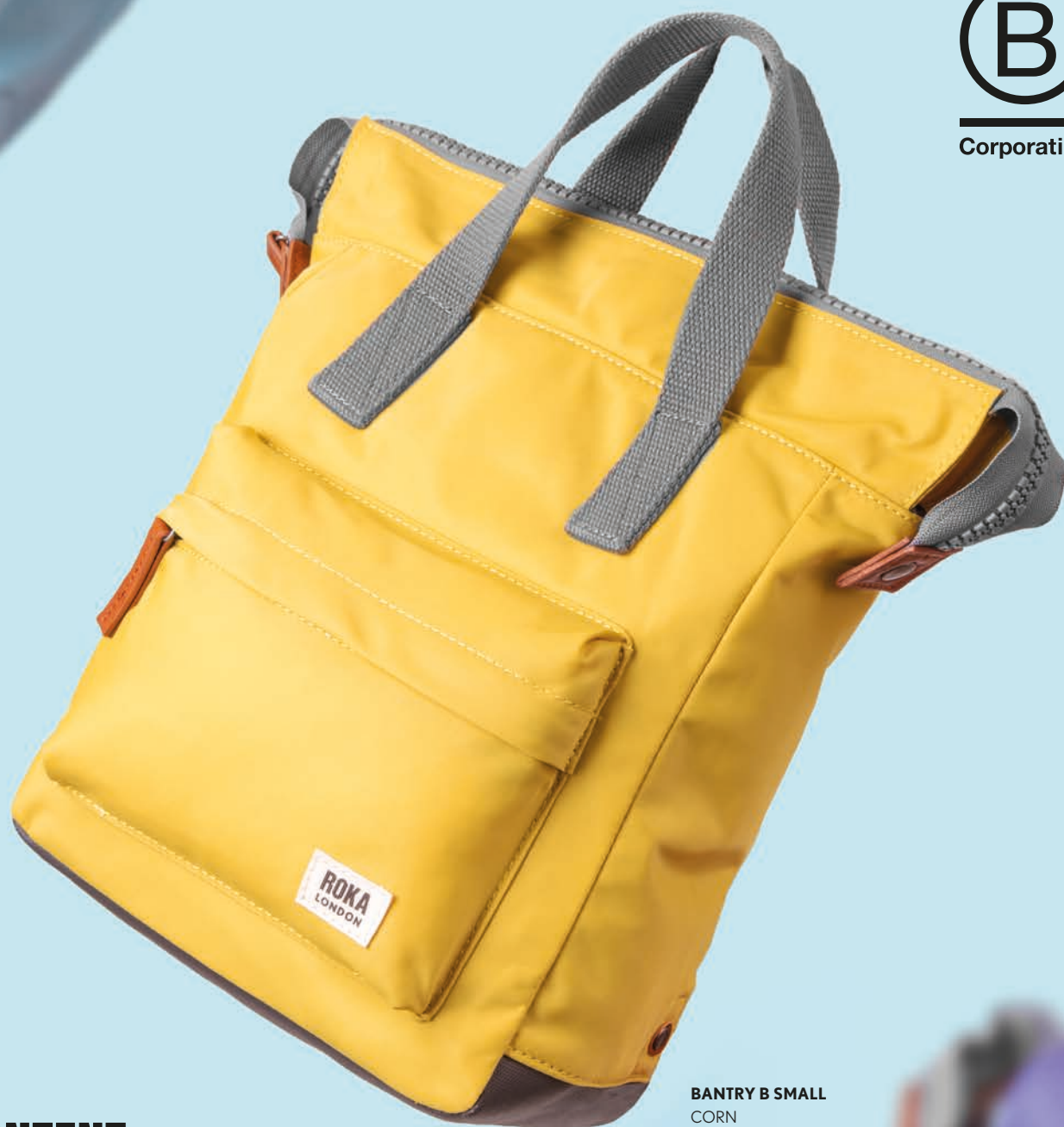
BANTRY B SMALL CORN