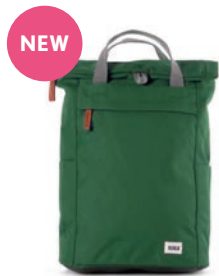
MOUNTAIN GREEN MEDIUM RECYCLED CANVAS