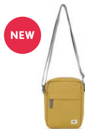
FLAX ONE SIZE RECYCLED CANVAS