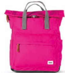
CANDY SMALL & MEDIUM RECYCLED NYLON