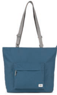
PACIFIC MEDIUM RECYCLED CANVAS