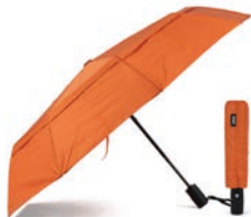
BURNT ORANGE ONE SIZE RECYCLED NYLON