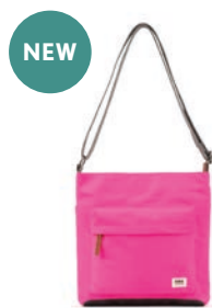
NEON PINK ONE SIZE RECYCLED NYLON