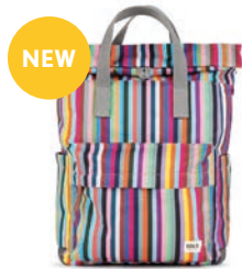
CANFIELD B MULTI STRIPE MEDIUM RECYCLED CANVAS