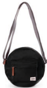
BLACK ONE SIZE RECYCLED NYLON