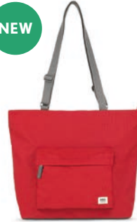
MARS RED MEDIUM RECYCLED CANVAS