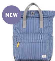
HICKORY STRIPE MEDIUM RECYCLED CANVAS