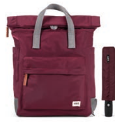
PLUM MEDIUM RECYCLED NYLON