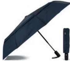
MIDNIGHT ONE SIZE RECYCLED NYLON