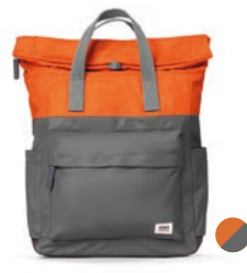
TWO-TONE BURNT ORANGE/GRAPHITE MEDIUM RECYCLED NYLON