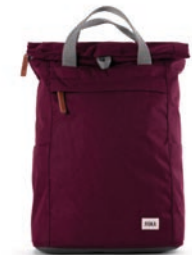
SIENNA SMALL, MEDIUM & LARGE RECYCLED CANVAS