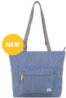
TRAFALGAR HICKORY STRIPE MEDIUM RECYCLED CANVAS