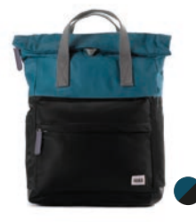
TWO-TONE MARINE/BLACK MEDIUM RECYCLED NYLON