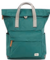
TEAL MEDIUM RECYCLED NYLON