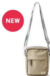
CORIANDER ONE SIZE RECYCLED CANVAS