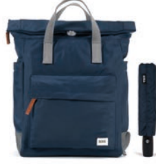
MIDNIGHT MEDIUM RECYCLED NYLON