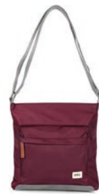
PLUM ONE SIZE RECYCLED NYLON