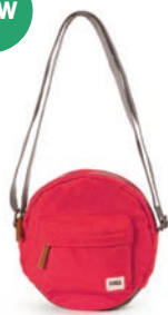
SPARKLING COSMO ONE SIZE RECYCLED NYLON