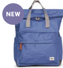
BURNT BLUE MEDIUM RECYCLED NYLON