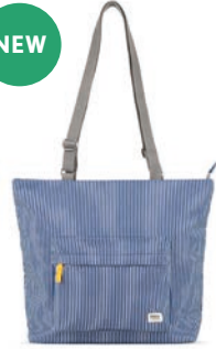
HICKORY STRIPE MEDIUM RECYCLED CANVAS