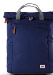
MINERAL SMALL, MEDIUM & LARGE RECYCLED CANVAS