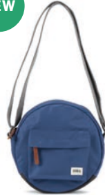
BURNT BLUE ONE SIZE RECYCLED NYLON