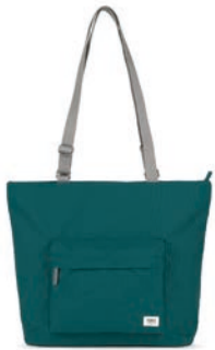
TEAL MEDIUM RECYCLED CANVAS