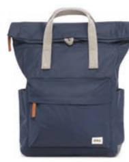
MIDNIGHT SMALL & MEDIUM RECYCLED NYLON