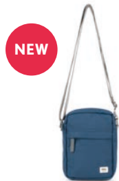
DEEP BLUE ONE SIZE RECYCLED CANVAS