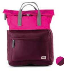
TWO-TONE CANDY/PLUM MEDIUM RECYCLED NYLON