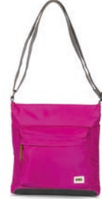
CANDY ONE SIZE RECYCLED NYLON