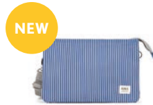
CARNABY XL HICKORY STRIPE XL RECYCLED CANVAS