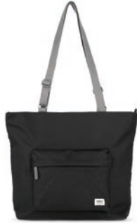
ASH MEDIUM RECYCLED CANVAS