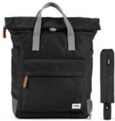
BLACK MEDIUM RECYCLED NYLON