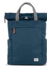
PACIFIC SMALL, MEDIUM & LARGE RECYCLED CANVAS