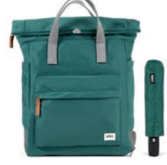
TEAL MEDIUM RECYCLED NYLON