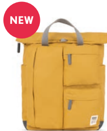
FLAX MEDIUM RECYCLED CANVAS