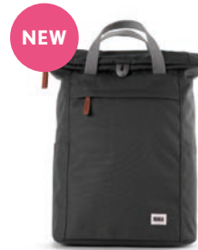
CARBON SMALL, MEDIUM & LARGE RECYCLED CANVAS