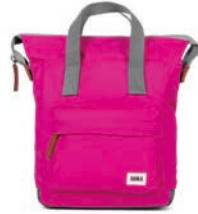
CANDY SMALL RECYCLED NYLON