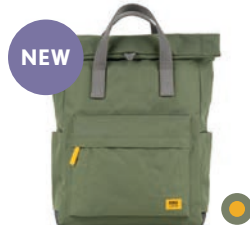
YELLOW LABEL GRANITE MEDIUM RECYCLED CANVAS