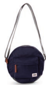
MIDNIGHT ONE SIZE RECYCLED NYLON