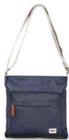
MIDNIGHT ONE SIZE RECYCLED NYLON