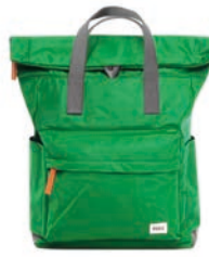
GREEN APPLE MEDIUM RECYCLED NYLON