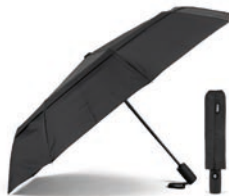
BLACK ONE SIZE RECYCLED NYLON