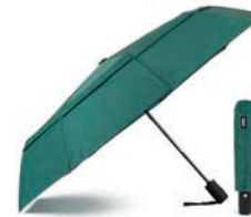
TEAL ONE SIZE RECYCLED NYLON