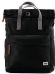
BLACK SMALL & MEDIUM RECYCLED NYLON