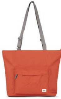
ROOBOS MEDIUM RECYCLED CANVAS