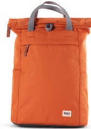
ATOMIC ORANGE SMALL, MEDIUM & LARGE RECYCLED CANVAS