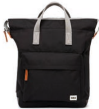
ASH MEDIUM RECYCLED CANVAS