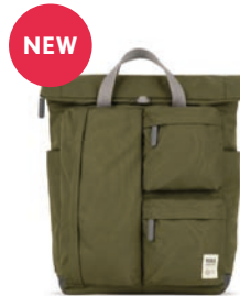
MOSS MEDIUM RECYCLED CANVAS