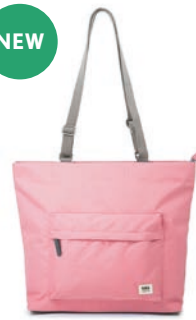
ROSE MEDIUM RECYCLED CANVAS