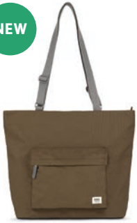
MOSS MEDIUM RECYCLED CANVAS