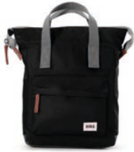
BLACK SMALL RECYCLED NYLON