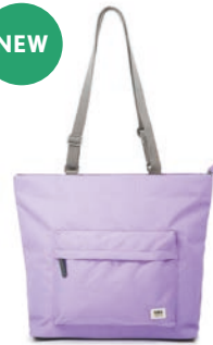
LAVENDER MEDIUM RECYCLED CANVAS