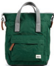
FOREST MEDIUM RECYCLED CANVAS