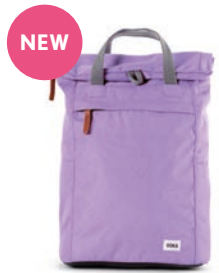
LAVENDER SMALL & MEDIUM RECYCLED CANVAS