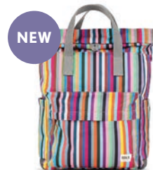
MULTI STRIPE MEDIUM RECYCLED CANVAS