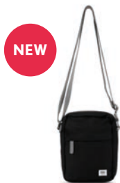
ASH ONE SIZE RECYCLED CANVAS