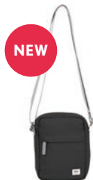
CARBON ONE SIZE RECYCLED CANVAS