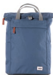
AIRFORCE SMALL, MEDIUM & LARGE RECYCLED CANVAS