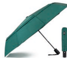
TEAL ONE SIZE RECYCLED NYLON