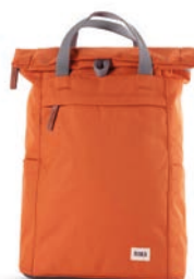
ATOMIC ORANGE SMALL, MEDIUM & LARGE RECYCLED CANVAS