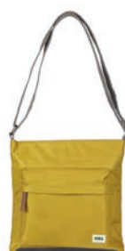
CORN ONE SIZE RECYCLED NYLON