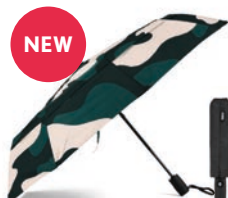
URBAN ROSE CAMO ONE SIZE RECYCLED NYLON