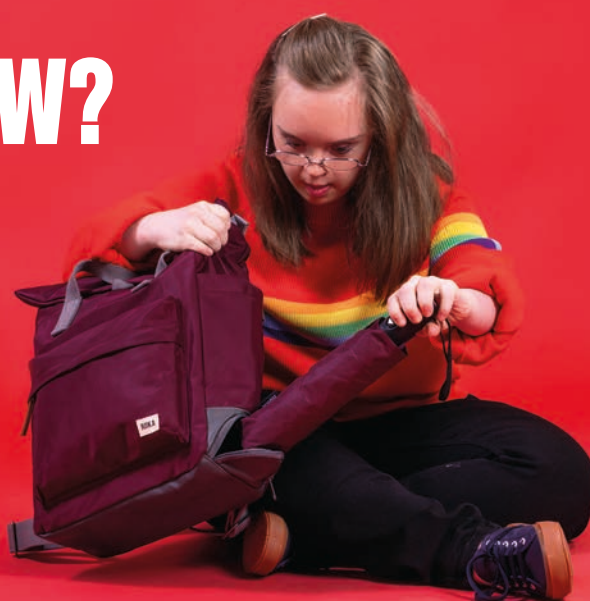
BAYSWATER B MEDIUM PLUM

If you know our story, ROKA London was born from the weather. We always wished to create a bag with an innovative way to carry an umbrella so everything in your bag would not get wet as well. When it came to naming the bag, it had to have a reference to water, hence London's Bayswater! Check out the bag on page 13.