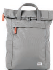
STORMY SMALL, MEDIUM & LARGE RECYCLED CANVAS