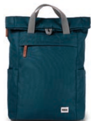
TEAL SMALL & MEDIUM RECYCLED CANVAS