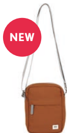
BRAN ONE SIZE RECYCLED CANVAS