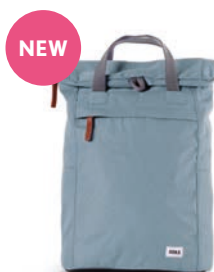
LONDON FOG MEDIUM RECYCLED CANVAS