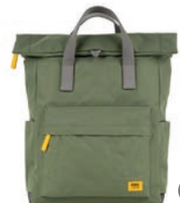
YELLOW LABEL GRANITE MEDIUM RECYCLED CANVAS