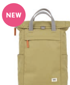
KHAKI MEDIUM & LARGE RECYCLED CANVAS