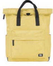
BLACK LABEL BAMBOO MEDIUM RECYCLED NYLON