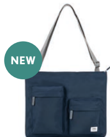
MIDNIGHT ONE SIZE RECYCLED NYLON