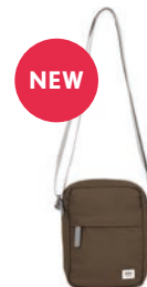
MOSS ONE SIZE RECYCLED CANVAS