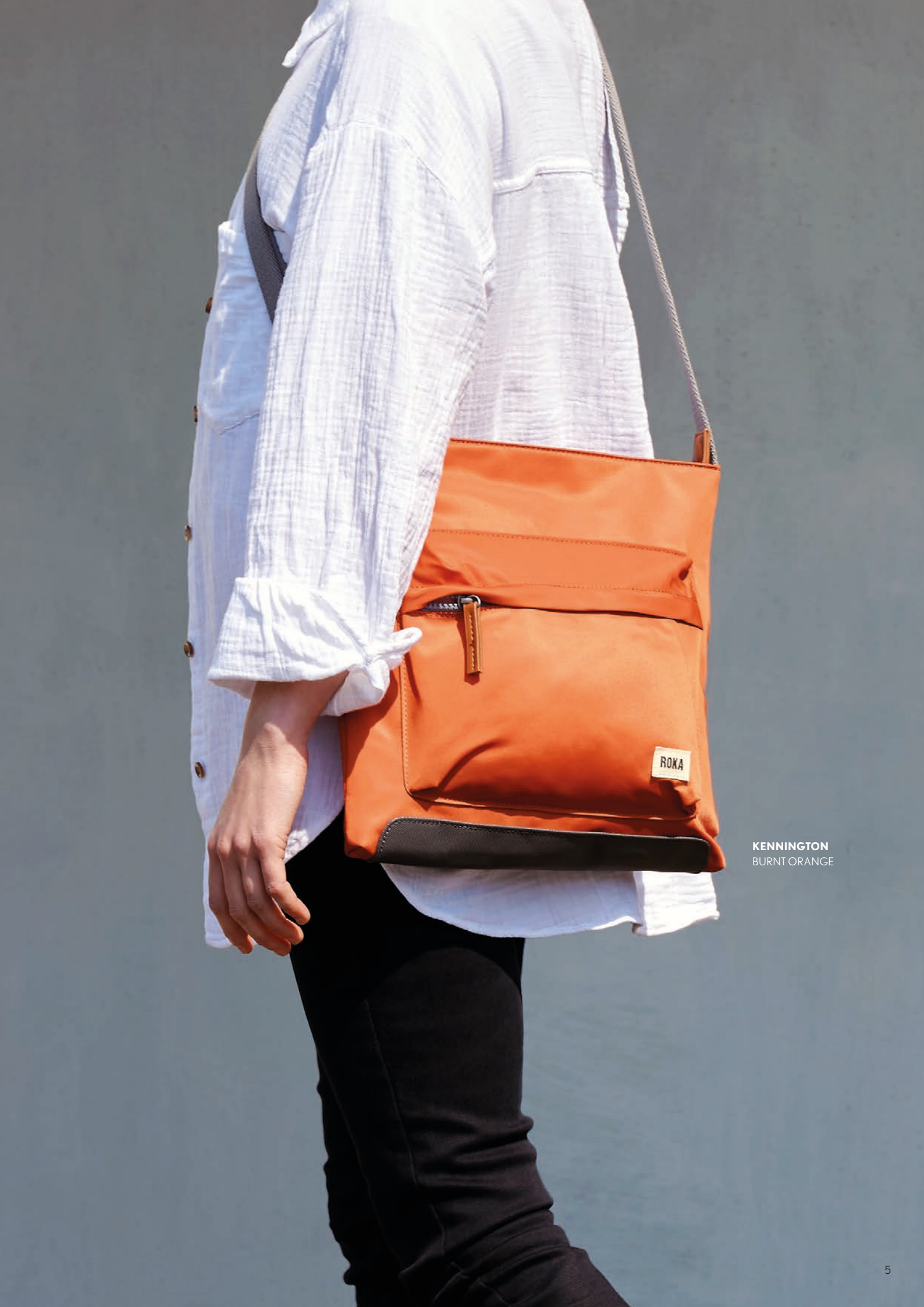
KENNINGTON BURNT ORANGE