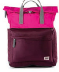
TWO-TONE CANDY/PLUM MEDIUM RECYCLED NYLON