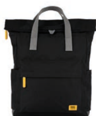
YELLOW LABEL ASH MEDIUM RECYCLED CANVAS