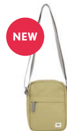
KHAKI ONE SIZE RECYCLED CANVAS