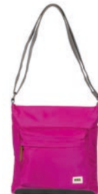
CANDY ONE SIZE RECYCLED NYLON