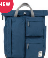
DEEP BLUE MEDIUM RECYCLED CANVAS