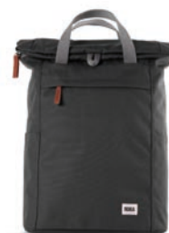
CARBON SMALL, MEDIUM & LARGE RECYCLED CANVAS