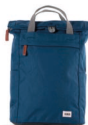
MARINE SMALL, MEDIUM & LARGE RECYCLED CANVAS