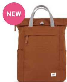
BRAN MEDIUM RECYCLED CANVAS