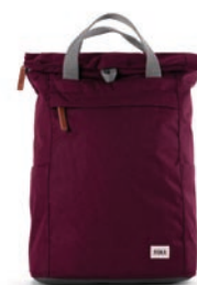
SIENNA SMALL, MEDIUM & LARGE RECYCLED CANVAS