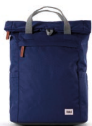
MINERAL SMALL, MEDIUM & LARGE RECYCLED CANVAS