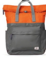
TWO-TONE BURNT ORANGE/GRAPHITE MEDIUM RECYCLED NYLON