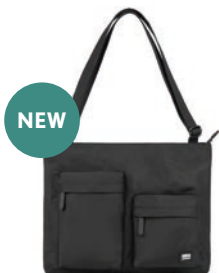
BLACK ONE SIZE RECYCLED NYLON