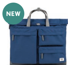
DEEP BLUE ONE SIZE RECYCLED CANVAS