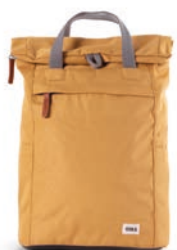
FLAX SMALL & MEDIUM RECYCLED CANVAS