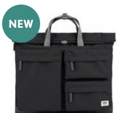
ASH ONE SIZE RECYCLED CANVAS