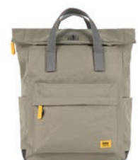
YELLOW LABEL CORIANDER MEDIUM RECYCLED CANVAS