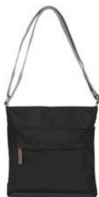
BLACK ONE SIZE RECYCLED NYLON