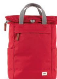
MARS RED SMALL, MEDIUM & LARGE RECYCLED CANVAS