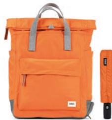
BURNT ORANGE MEDIUM RECYCLED NYLON