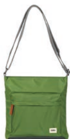
AVOCADO ONE SIZE RECYCLED NYLON