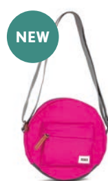
CANDY ONE SIZE RECYCLED NYLON