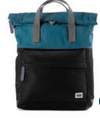
TWO-TONE MARINE/BLACK MEDIUM RECYCLED NYLON