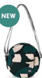
URBAN ROSE CAMO ONE SIZE RECYCLED NYLON