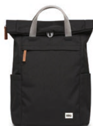
ASH SMALL, MEDIUM & LARGE RECYCLED CANVAS