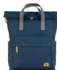
YELLOW LABEL DEEP BLUE MEDIUM RECYCLED CANVAS