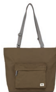
MOSS MEDIUM RECYCLED CANVAS