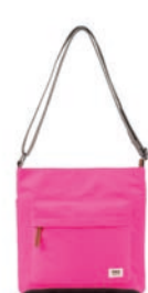
NEON PINK ONE SIZE RECYCLED NYLON