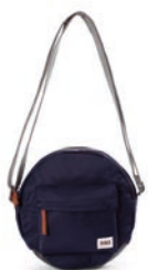
MIDNIGHT ONE SIZE RECYCLED NYLON