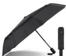
BLACK ONE SIZE RECYCLED NYLON