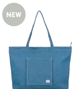
LIGHT WASH DENIM LARGE COTTON