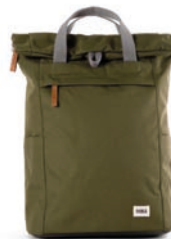
MOSS SMALL, MEDIUM & LARGE RECYCLED CANVAS