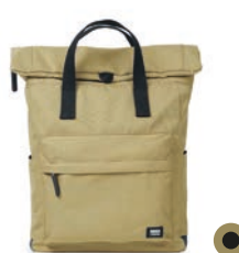
BLACK LABEL KHAKI MEDIUM RECYCLED CANVAS