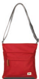
CRANBERRY ONE SIZE RECYCLED NYLON