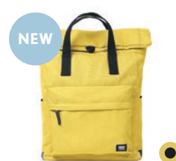
BLACK LABEL LEMONADE MEDIUM RECYCLED CANVAS