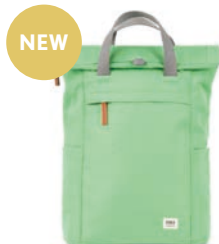
PEPPERMINT MEDIUM RECYCLED CANVAS