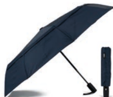
MIDNIGHT ONE SIZE RECYCLED NYLON