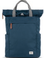
PACIFIC SMALL RECYCLED CANVAS