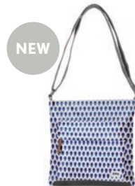
DENIM RAIN ONE SIZE RECYCLED NYLON