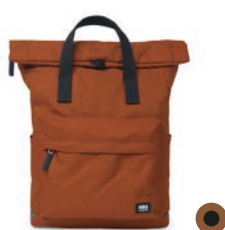
BLACK LABEL BRAN MEDIUM RECYCLED CANVAS