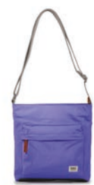
SIMPLE PURPLE ONE SIZE RECYCLED NYLON