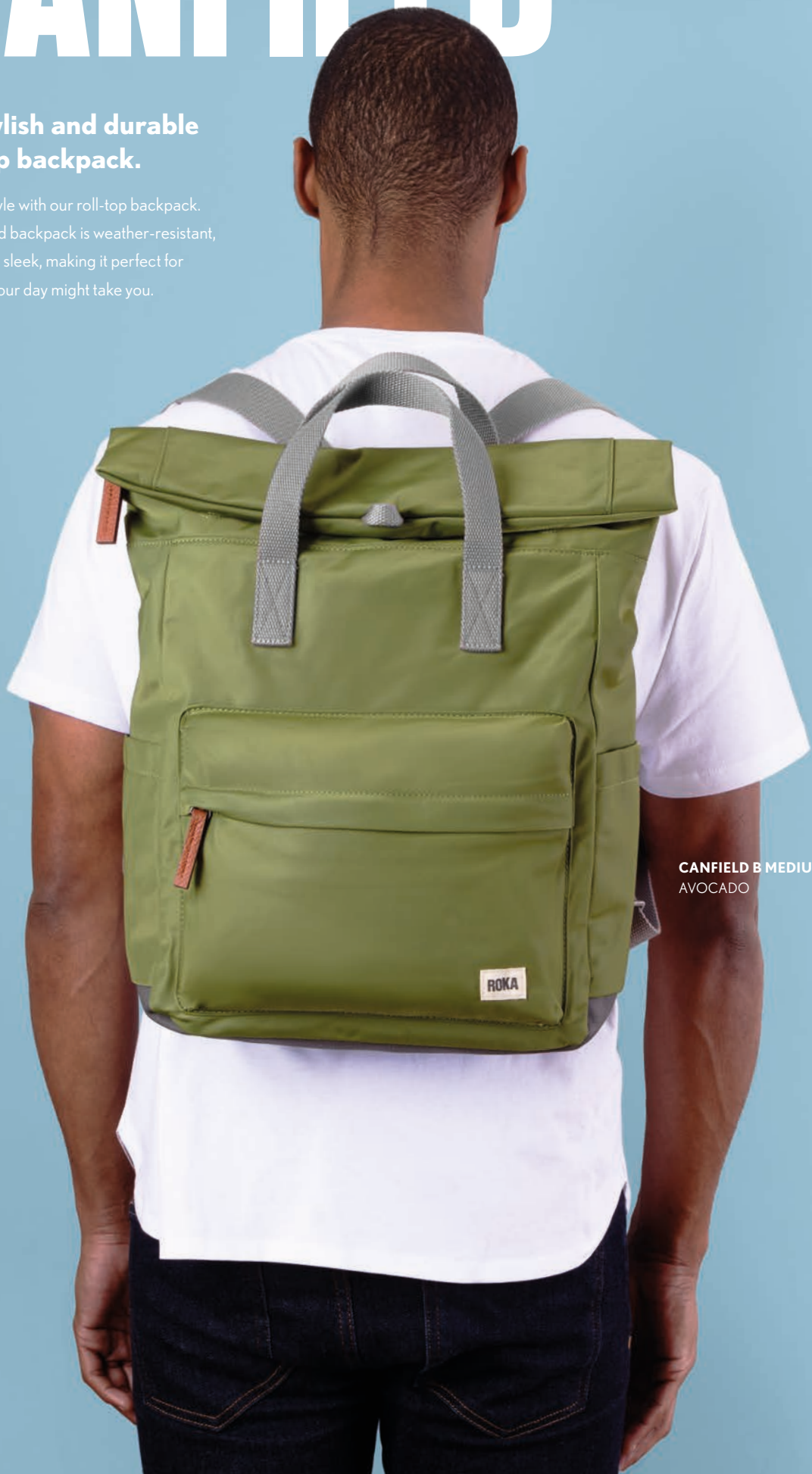
CANFIELD B MEDIUM AVOCADO

Roll up in style with our roll-top backpack. The Canfield backpack is weather-resistant, durable and sleek, making it perfect for anywhere your day might take you.