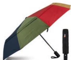
RAINBOW ONE SIZE RECYCLED NYLON