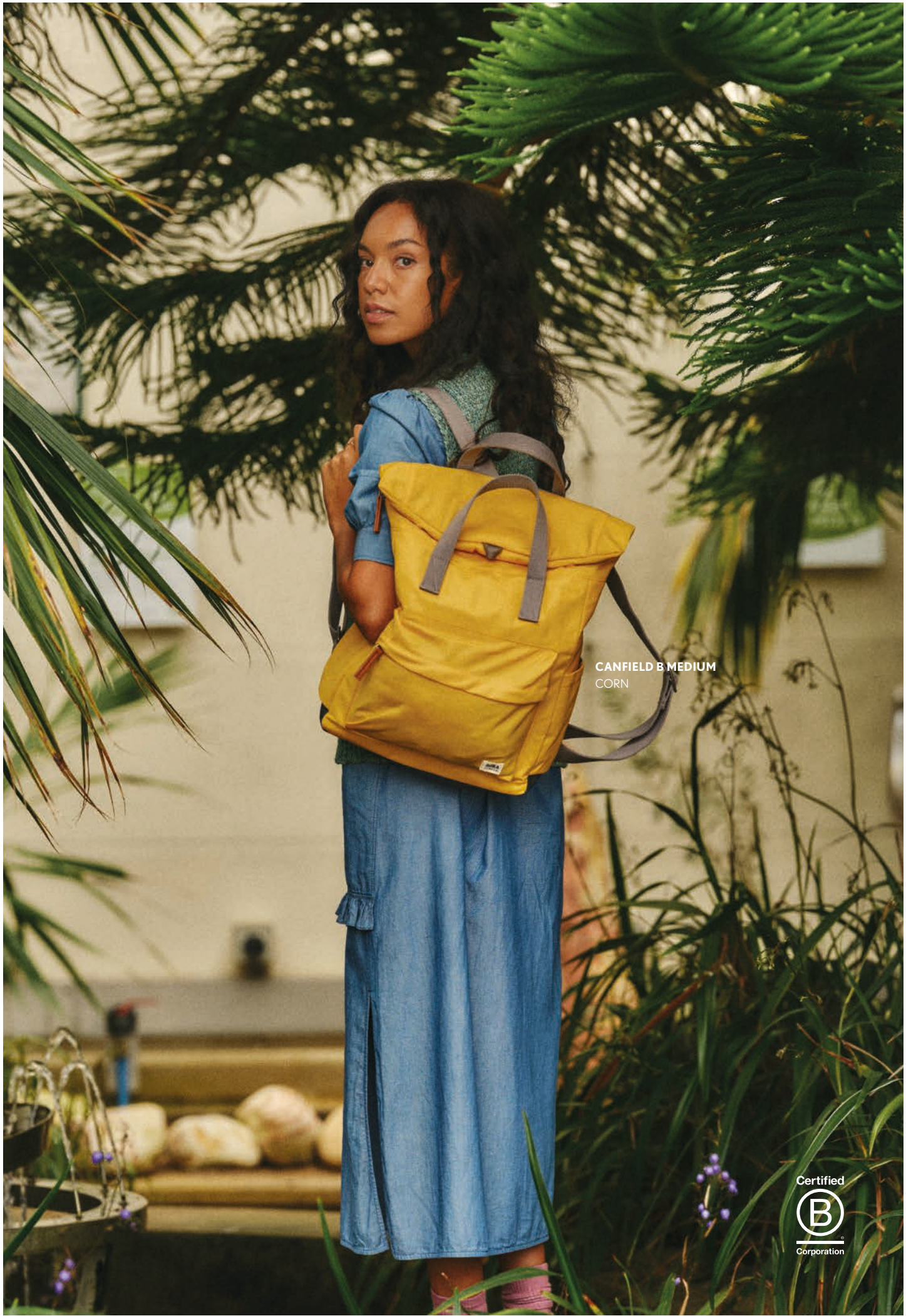
CANFIELD B MEDIUM CORN