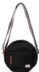
BLACK ONE SIZE RECYCLED NYLON