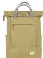
KHAKI MEDIUM & LARGE RECYCLED CANVAS