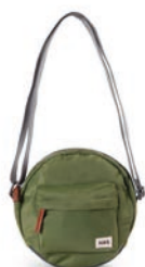
AVOCADO ONE SIZE RECYCLED NYLON