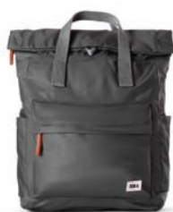
GRAPHITE MEDIUM RECYCLED NYLON