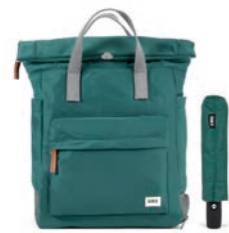
TEAL MEDIUM RECYCLED NYLON