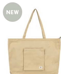
KHAKI LARGE COTTON