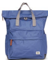
BURNT BLUE MEDIUM RECYCLED NYLON