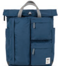
DEEP BLUE MEDIUM RECYCLED CANVAS