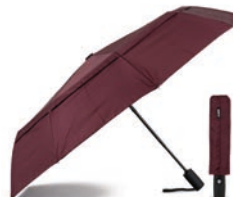
PLUM ONE SIZE RECYCLED NYLON