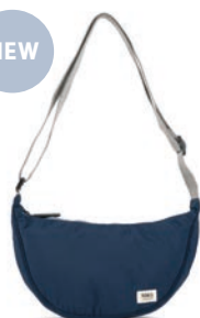
MIDNIGHT ONE SIZE TASLON