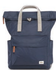
MIDNIGHT SMALL & MEDIUM RECYCLED NYLON