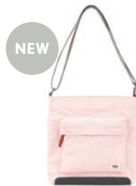
ENGLISH ROSE ONE SIZE RECYCLED NYLON