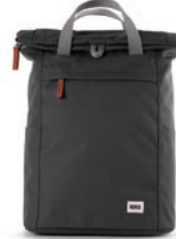
CARBON SMALL, MEDIUM & LARGE RECYCLED CANVAS