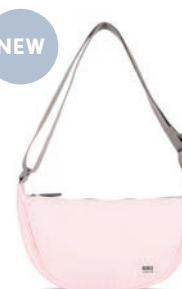
SEASHELL ONE SIZE TASLON