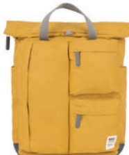
FLAX MEDIUM RECYCLED CANVAS