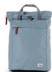
LONDON FOG MEDIUM RECYCLED CANVAS