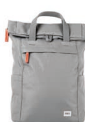
STORMY SMALL, MEDIUM & LARGE RECYCLED CANVAS