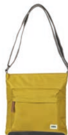
CORN ONE SIZE RECYCLED NYLON