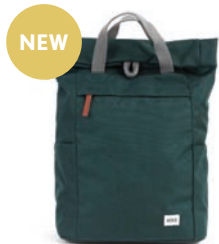
FOREST MEDIUM RECYCLED CANVAS