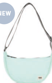
MINT ONE SIZE TASLON