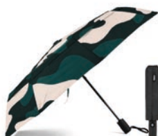
URBAN ROSE CAMO ONE SIZE RECYCLED NYLON