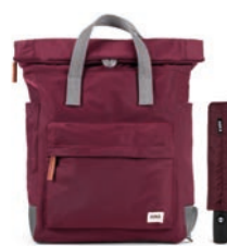
PLUM MEDIUM RECYCLED NYLON