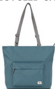
AIRFORCE MEDIUM RECYCLED CANVAS