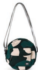
URBAN ROSE CAMO ONE SIZE RECYCLED NYLON