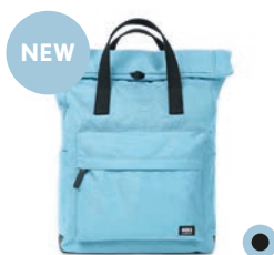
BLACK LABEL ICE MEDIUM RECYCLED CANVAS