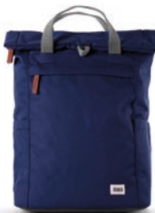
MINERAL SMALL, MEDIUM & LARGE RECYCLED CANVAS