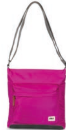
CANDY ONE SIZE RECYCLED NYLON