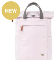
TRANSCENDENT PINK MEDIUM RECYCLED CANVAS