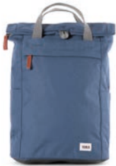
AIRFORCE MEDIUM & LARGE RECYCLED CANVAS