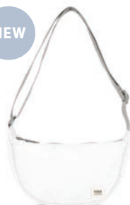
COCONUT ONE SIZE TASLON