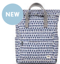
DENIM RAIN SMALL & MEDIUM RECYCLED CANVAS