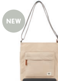
SAND ONE SIZE RECYCLED NYLON