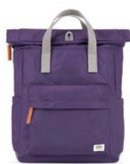
MAJESTIC PURPLE MEDIUM RECYCLED NYLON