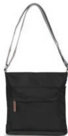
BLACK ONE SIZE RECYCLED NYLON