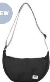
BLACK ONE SIZE TASLON