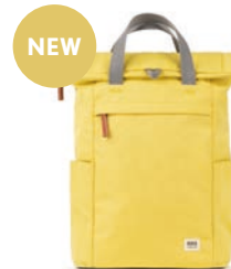
LEMONADE MEDIUM RECYCLED CANVAS