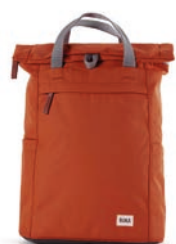
ROOBOS SMALL RECYCLED CANVAS