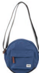
BURNT BLUE ONE SIZE RECYCLED NYLON