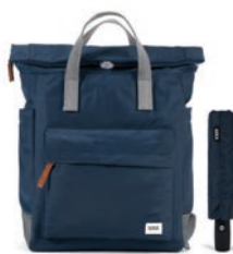
MIDNIGHT MEDIUM RECYCLED NYLON