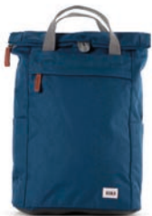
MARINE SMALL, MEDIUM & LARGE RECYCLED CANVAS