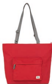
MARS RED MEDIUM RECYCLED CANVAS