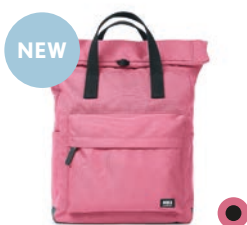
BLACK LABEL TULIP MEDIUM RECYCLED CANVAS