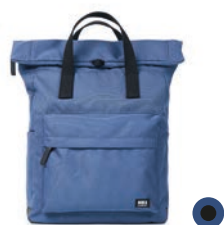
BLACK LABEL PACIFIC MEDIUM RECYCLED CANVAS