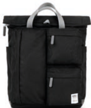
ASH MEDIUM RECYCLED CANVAS