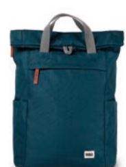
TEAL SMALL & MEDIUM RECYCLED CANVAS