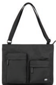
BLACK ONE SIZE RECYCLED NYLON