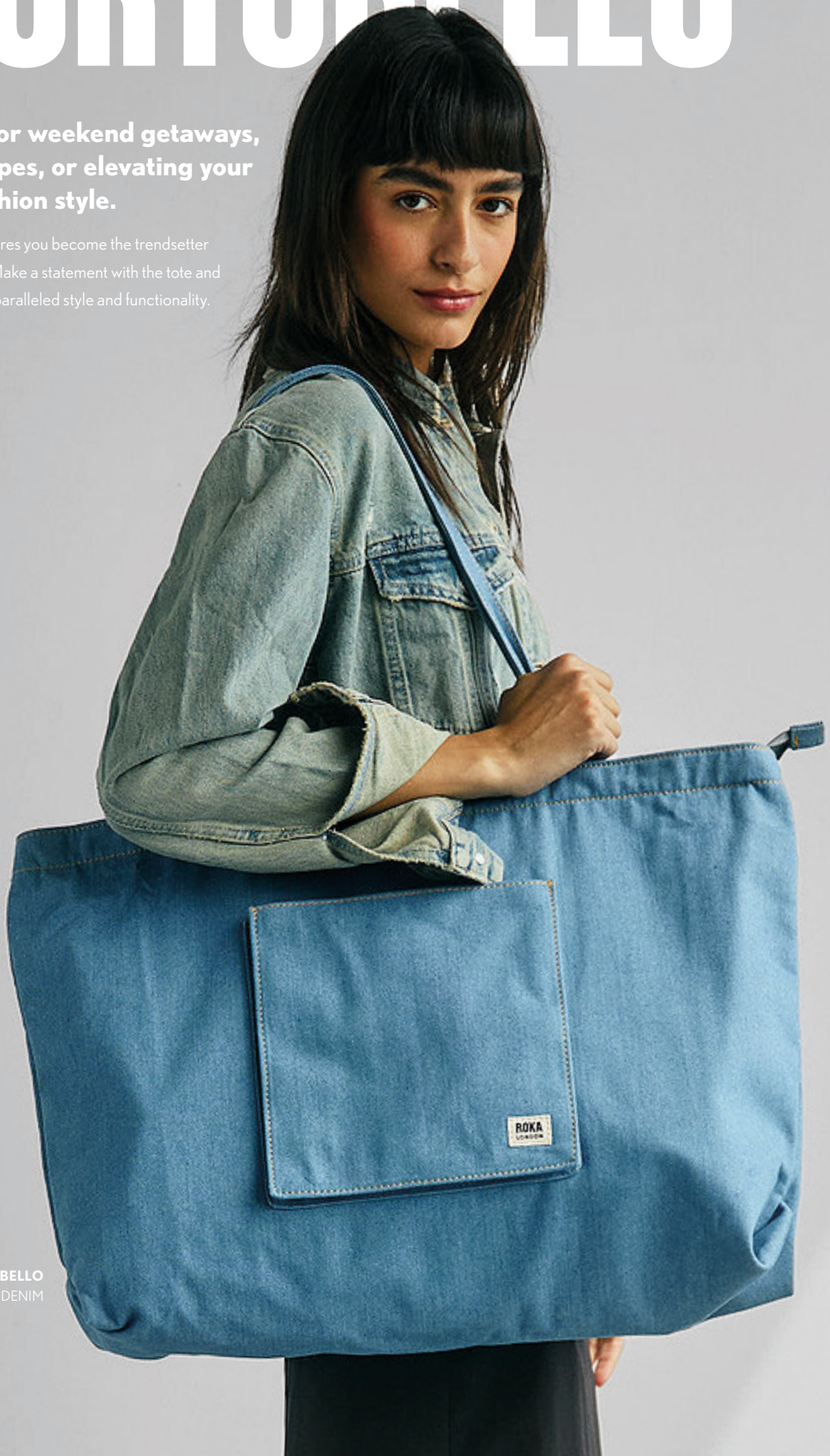
PORTOBELLO LIGHT WASH DENIM

Portobello ensures you become the trendsetter of the season. Make a statement with the tote and embrace its unparalleled style and functionality.