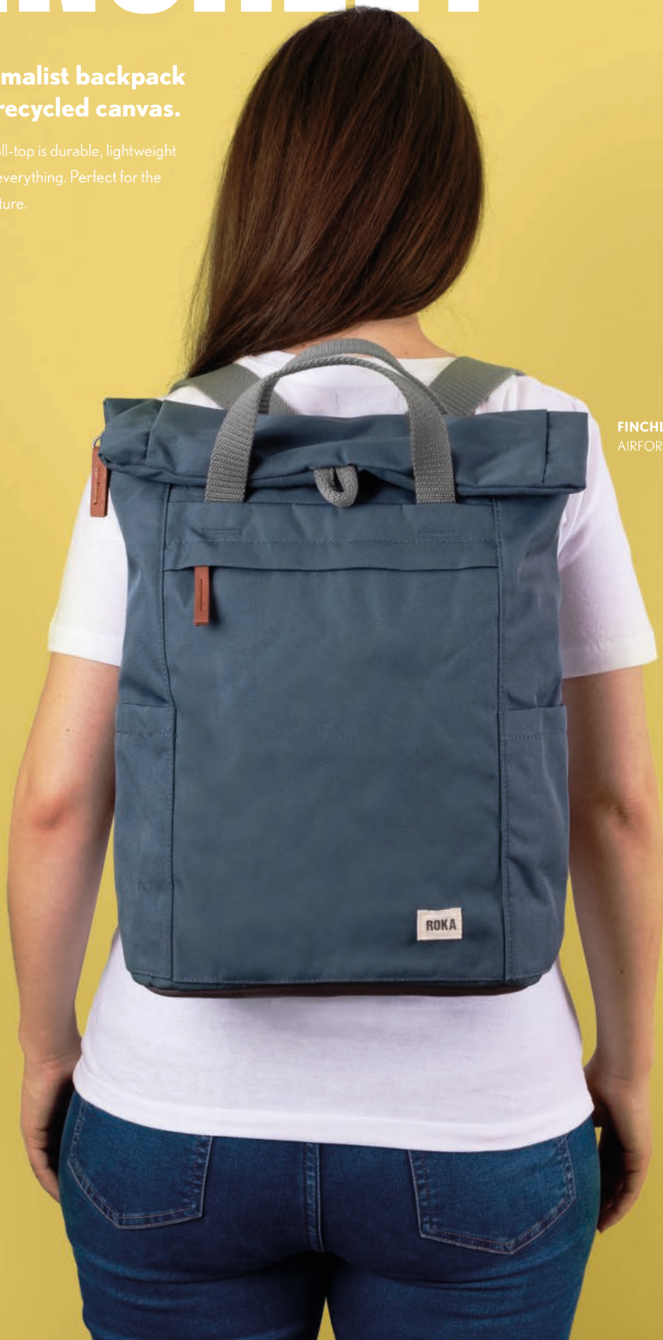
FINCHLEY A MEDIUM AIRFORCE

The Finchley roll-top is durable, lightweight and can carry everything. Perfect for the outdoor adventure.