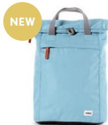
ICE SMALL & MEDIUM RECYCLED CANVAS