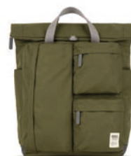
MOSS MEDIUM RECYCLED CANVAS