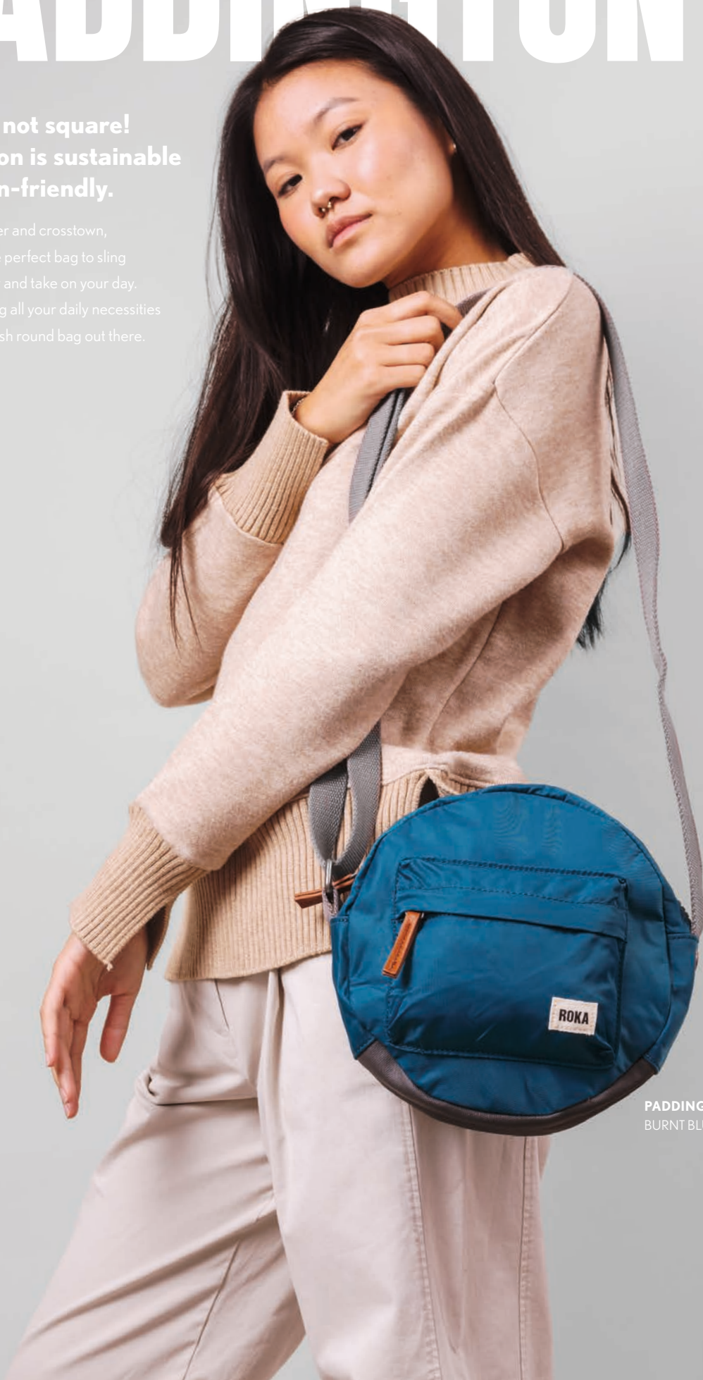
PADDINGTON BURNT BLUE

Over the shoulder and crosstown, Paddington is the perfect bag to sling across your body and take on your day. Perfect for storing all your daily necessities and the only, stylish round bag out there.