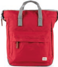
MARS RED MEDIUM RECYCLED CANVAS