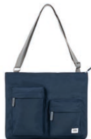
MIDNIGHT ONE SIZE RECYCLED NYLON