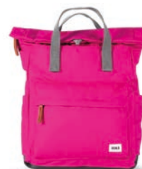
CANDY SMALL & MEDIUM RECYCLED NYLON