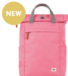
TULIP SMALL & MEDIUM RECYCLED CANVAS