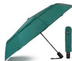
TEAL ONE SIZE RECYCLED NYLON