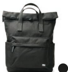
ALL BLACK BLACK MEDIUM RECYCLED CANVAS