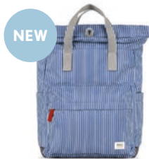
HICKORY STRIPE MEDIUM RECYCLED CANVAS