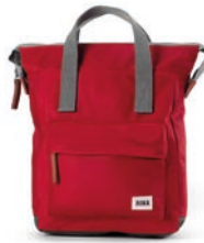
CRANBERRY SMALL RECYCLED NYLON