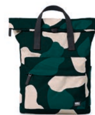
URBAN ROSE CAMO SMALL & MEDIUM RECYCLED CANVAS