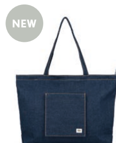
DARK WASH DENIM LARGE COTTON