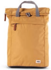
FLAX SMALL & MEDIUM RECYCLED CANVAS