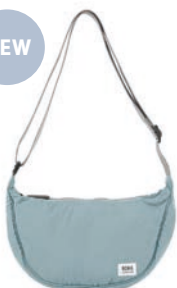
SKYWAY ONE SIZE TASLON