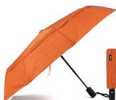
BURNT ORANGE ONE SIZE RECYCLED NYLON