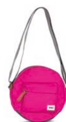
CANDY ONE SIZE RECYCLED NYLON