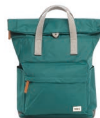
TEAL MEDIUM RECYCLED NYLON