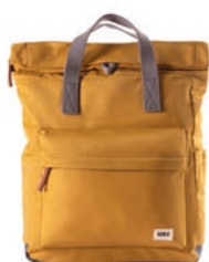
CORN MEDIUM RECYCLED NYLON