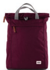
SIENNA SMALL, MEDIUM & LARGE RECYCLED CANVAS