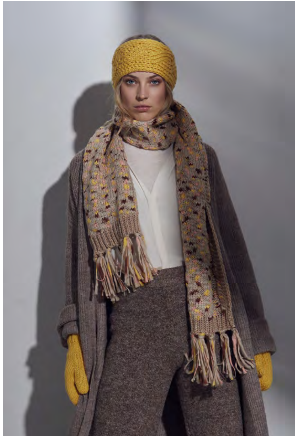
HEADBAND, SCARF & MITTEN 18616 COL.43, 18705 COL.9537 & 17952 COL.43