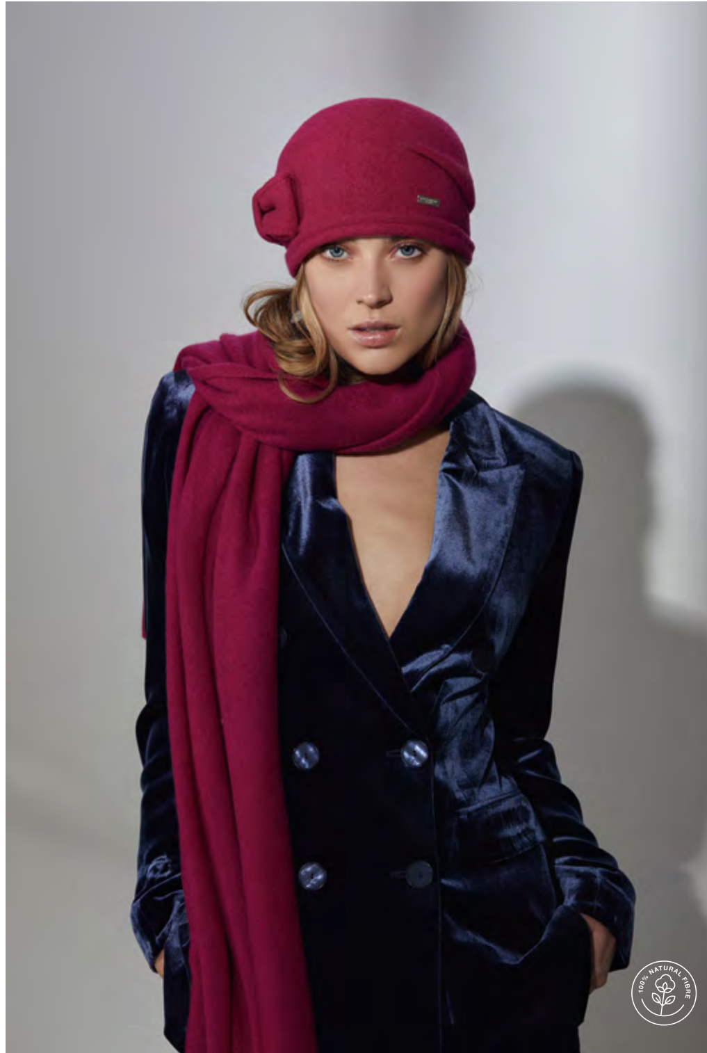
HEADSOCK & SCARF 18741 COL.26 & 16708 COL.26