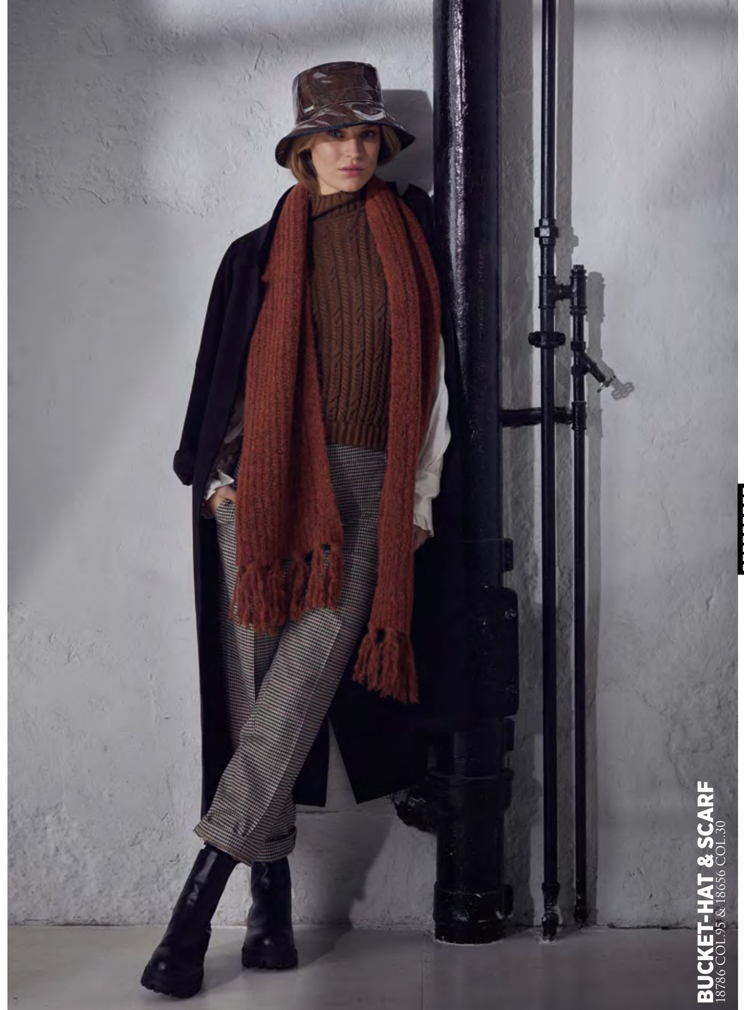
BUCKET-HAT & SCARF 18786 COL.95 & 18656 COL.30