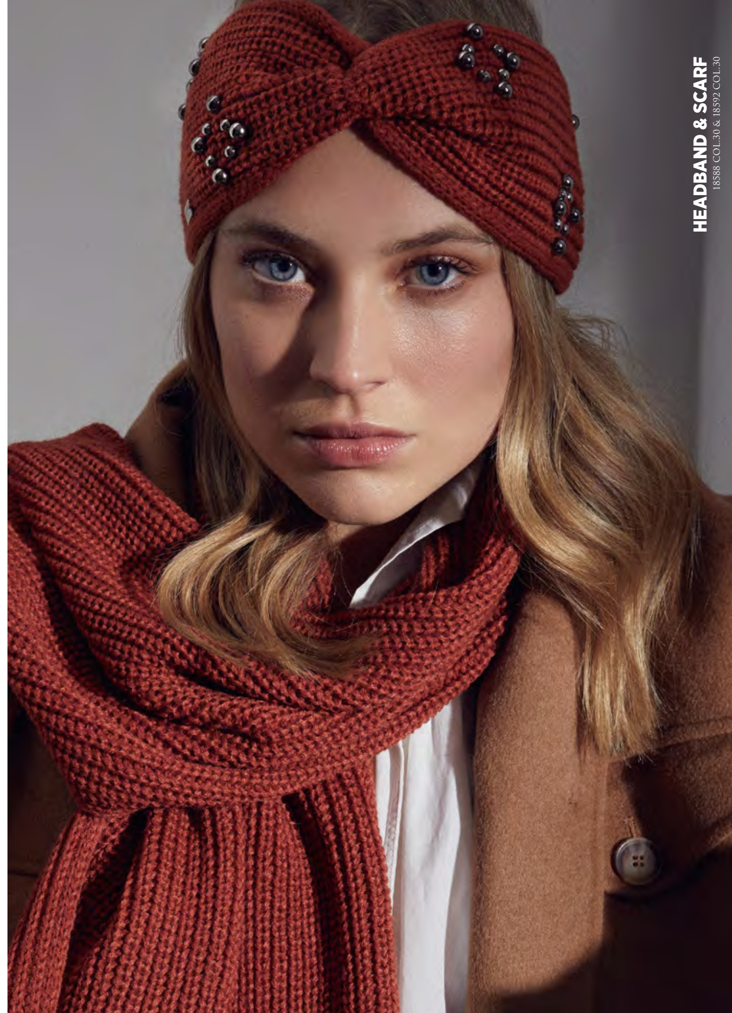
HEADBAND & SCARF 18588 COL.30 & 18592 COL.30