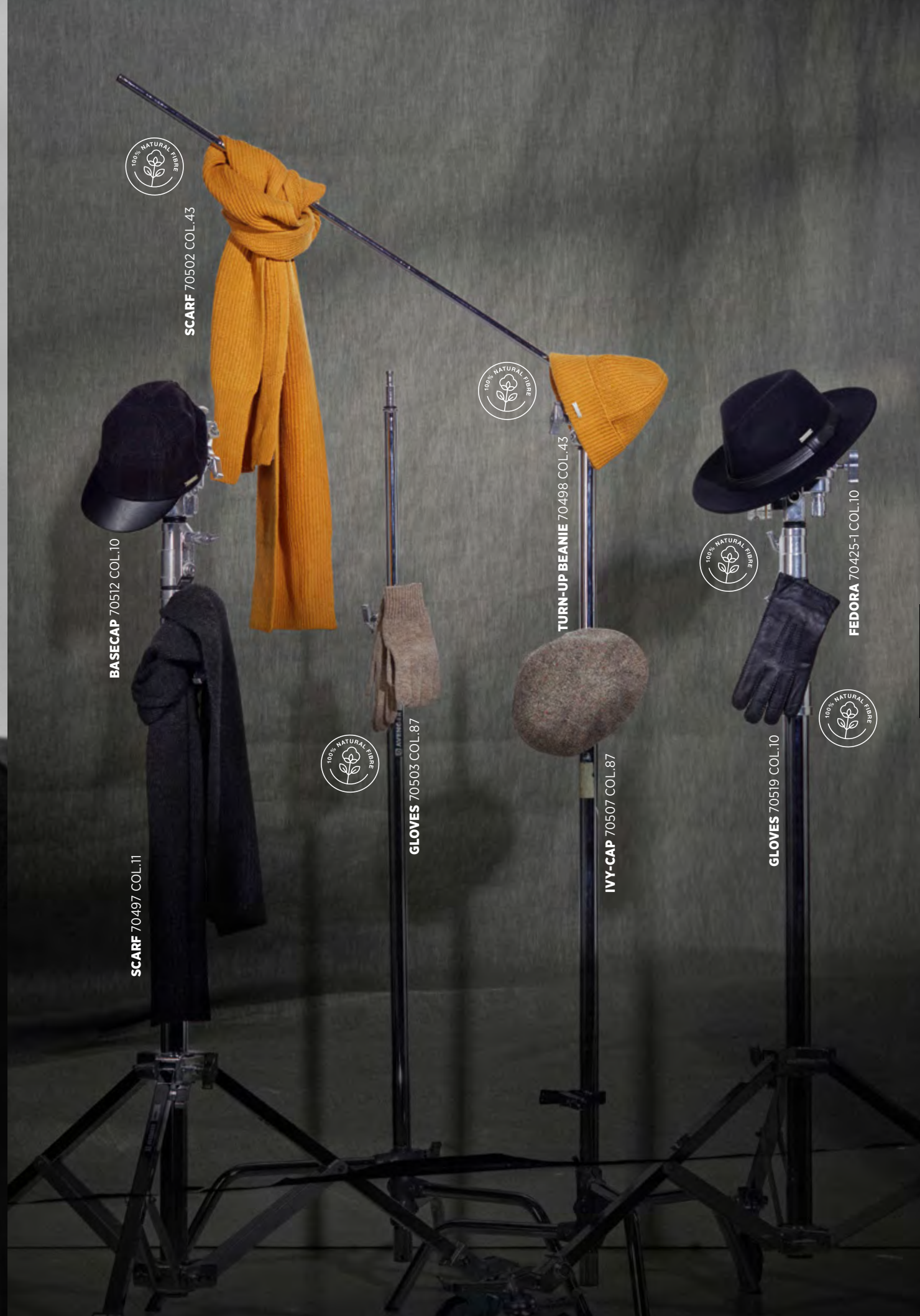
SCARF 70497 COL.11