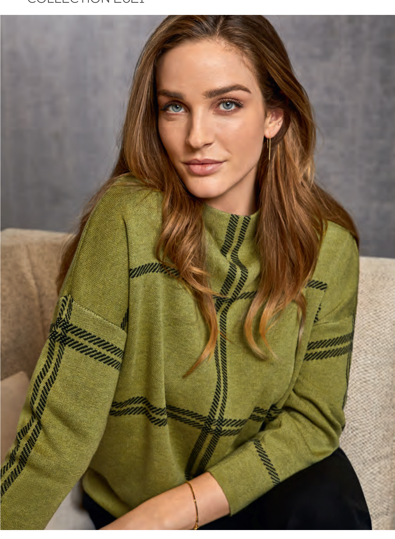
SIGNATURE The Art of Style