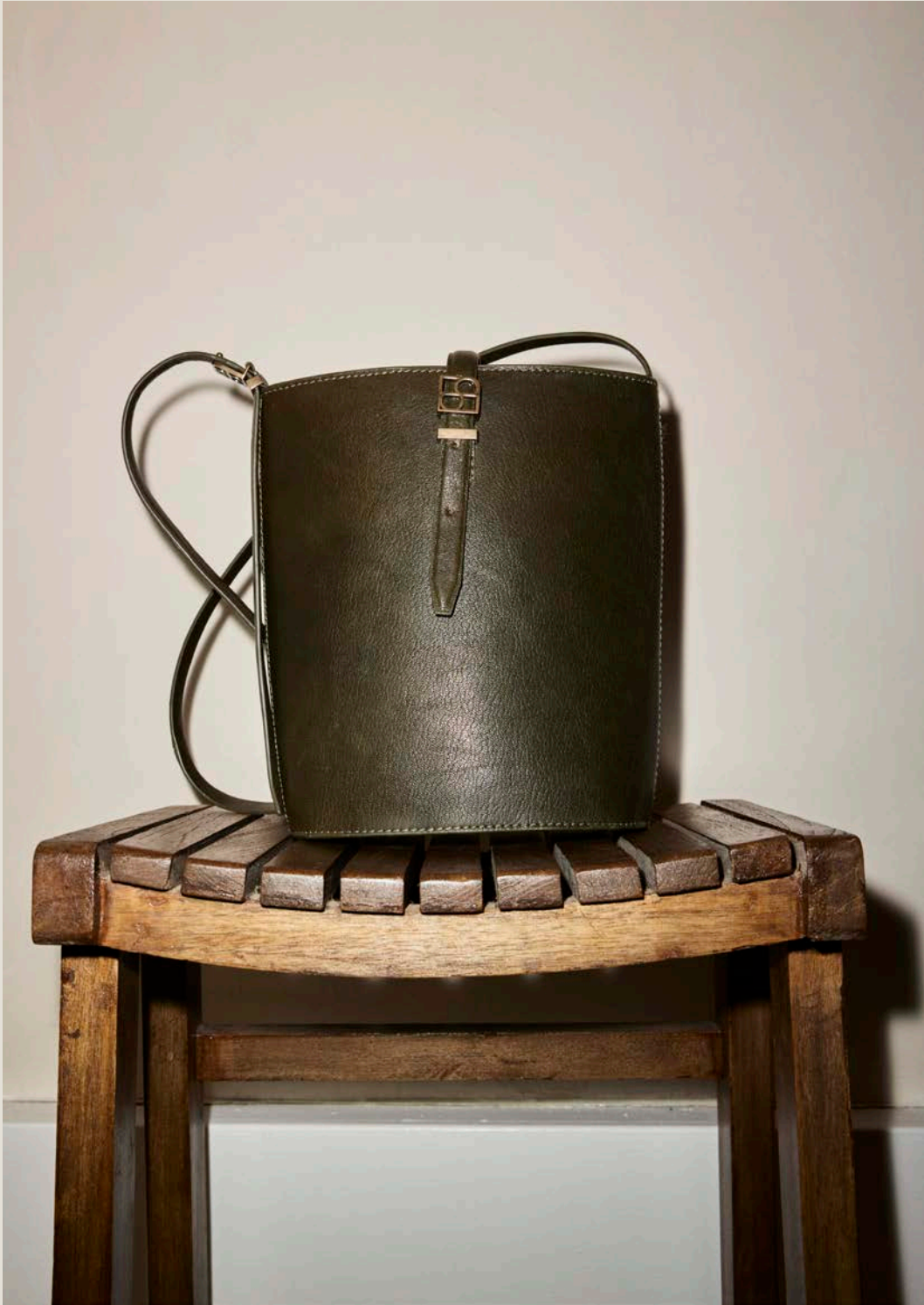
SLNavarro Bucket Bag