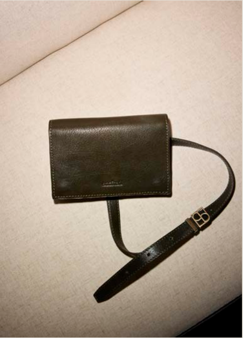
SLNavarro Belt Bag